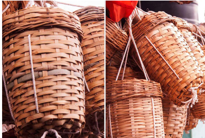
Big and Small Bamboo baskets with lids and rope handles.