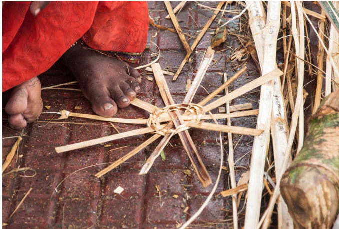
The base of basket.