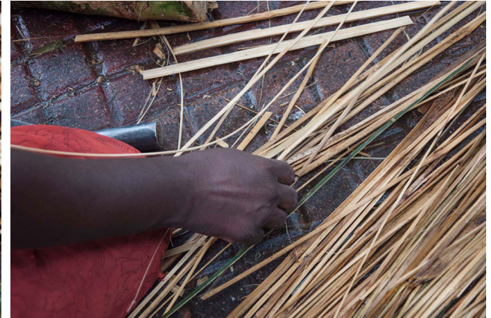
The slit strips of bamboo.