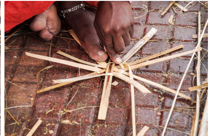
Fine strip of bamboo stick passing alternately one above and below.