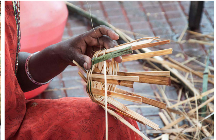
Passing Fine strips alternately.