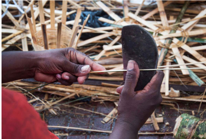
Thin strip of bamboo slit.