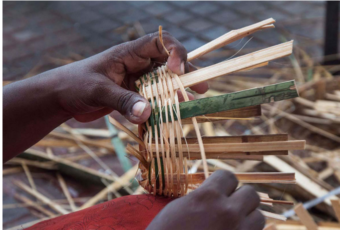
Passing the fine strip below.