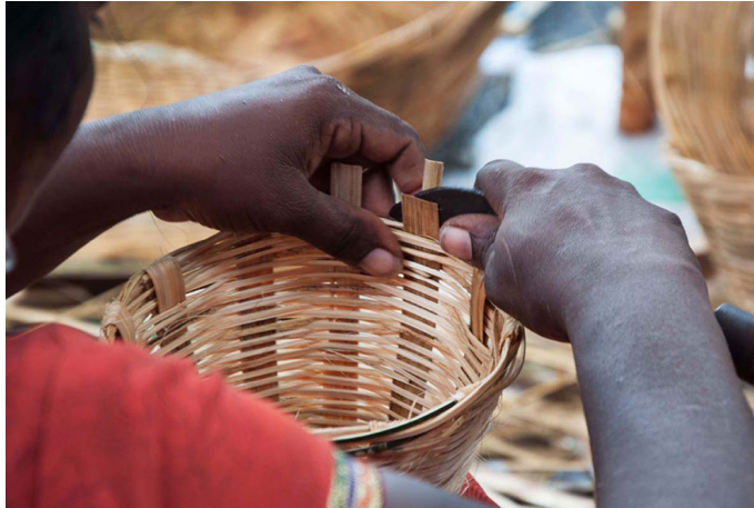
Cutting the edges of bamboo wide strips with help of knife.