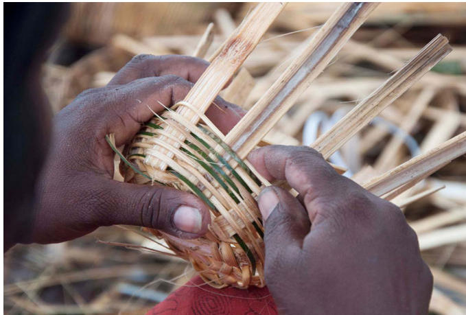
Holding the bamboo base tight and passing thin strip.