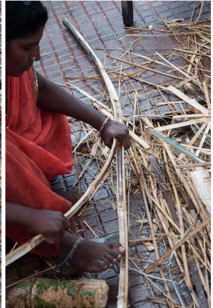
Bamboo is split into two halves.