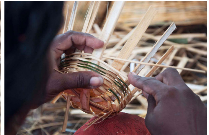
Passing the fine strip above.