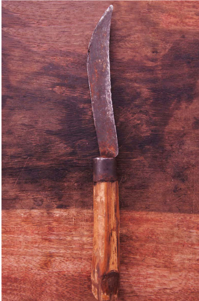
Knife used to slit bamboo sticks.