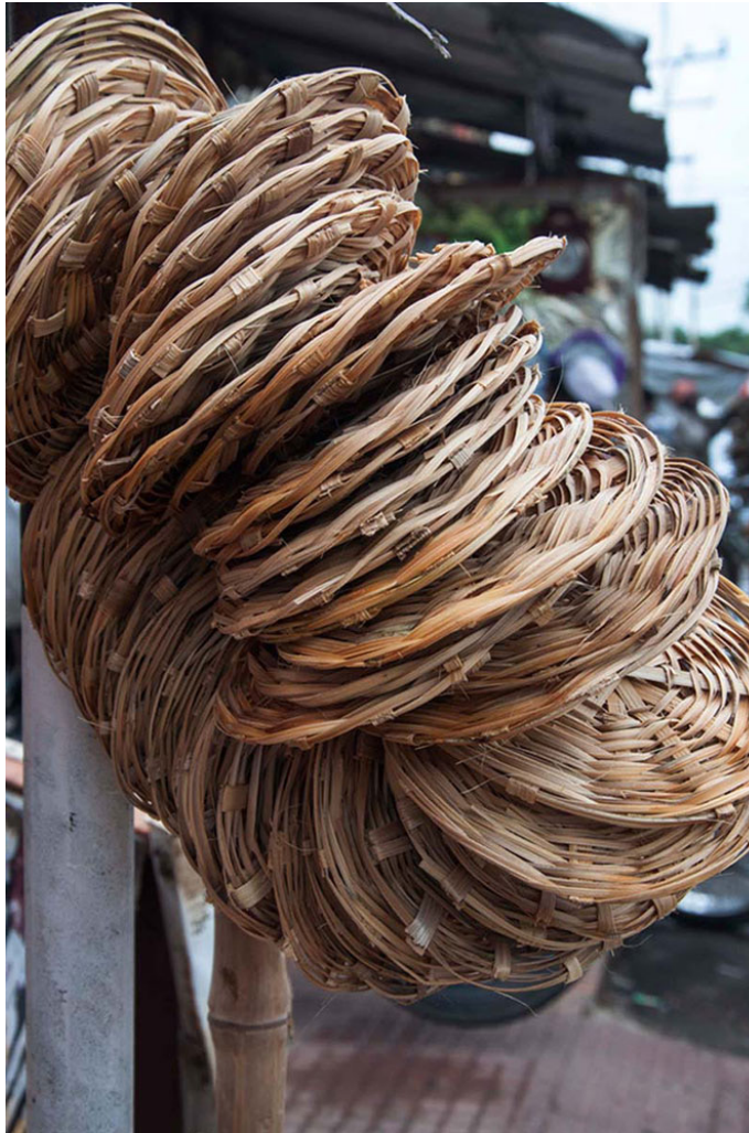
Bamboo plates to cook traditional food (idi appum).