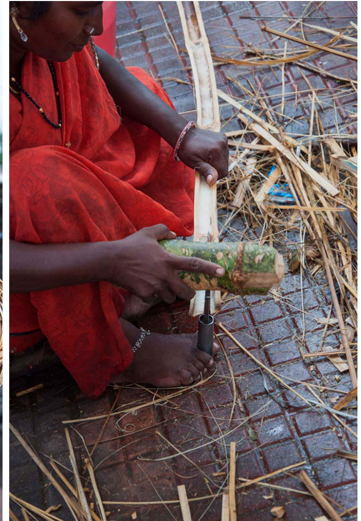
Slicing the bamboo sticks to make thin strips out of it.