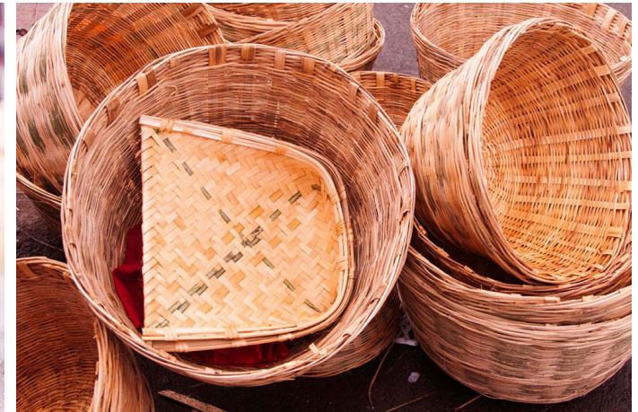
The bamboo-winnowing fan along with baskets.