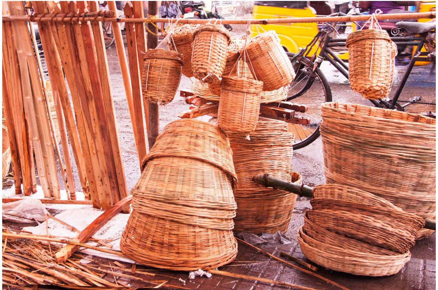
A collection of bamboo baskets.

The artisan produces variety of baskets based on the requirements of the clients. Artisan also weaves bamboo boxes, winnowing fans and many more products of bamboo. Small basket costs around sixty rupees and big basket costs around two fifty rupees.