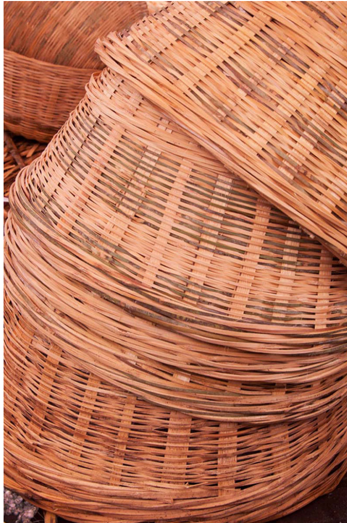
Piled bamboo baskets.