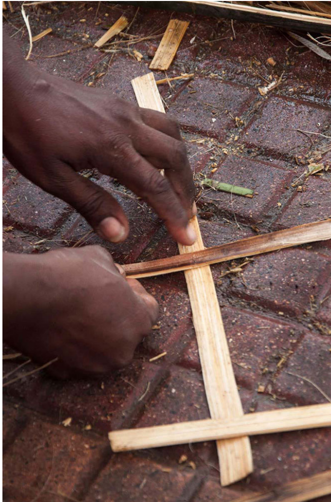
Small bamboo sticks.