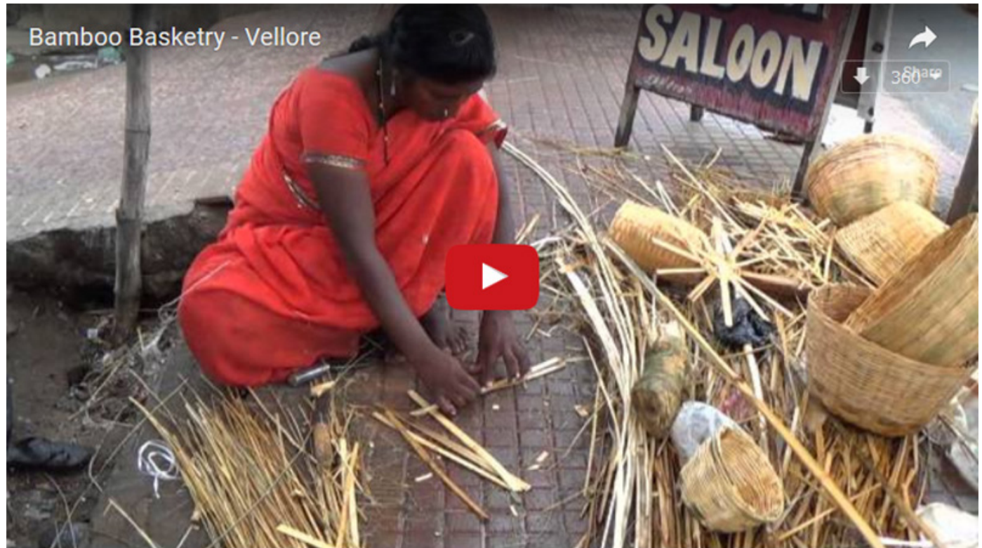
Bamboo Basketry - Vellore