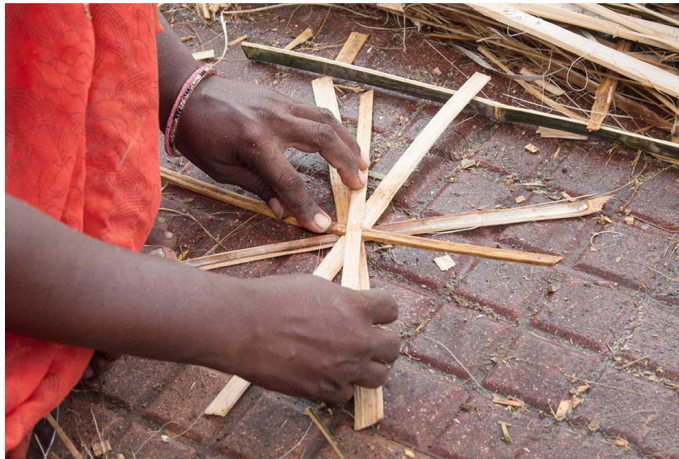
Arranging the bamboo sticks.