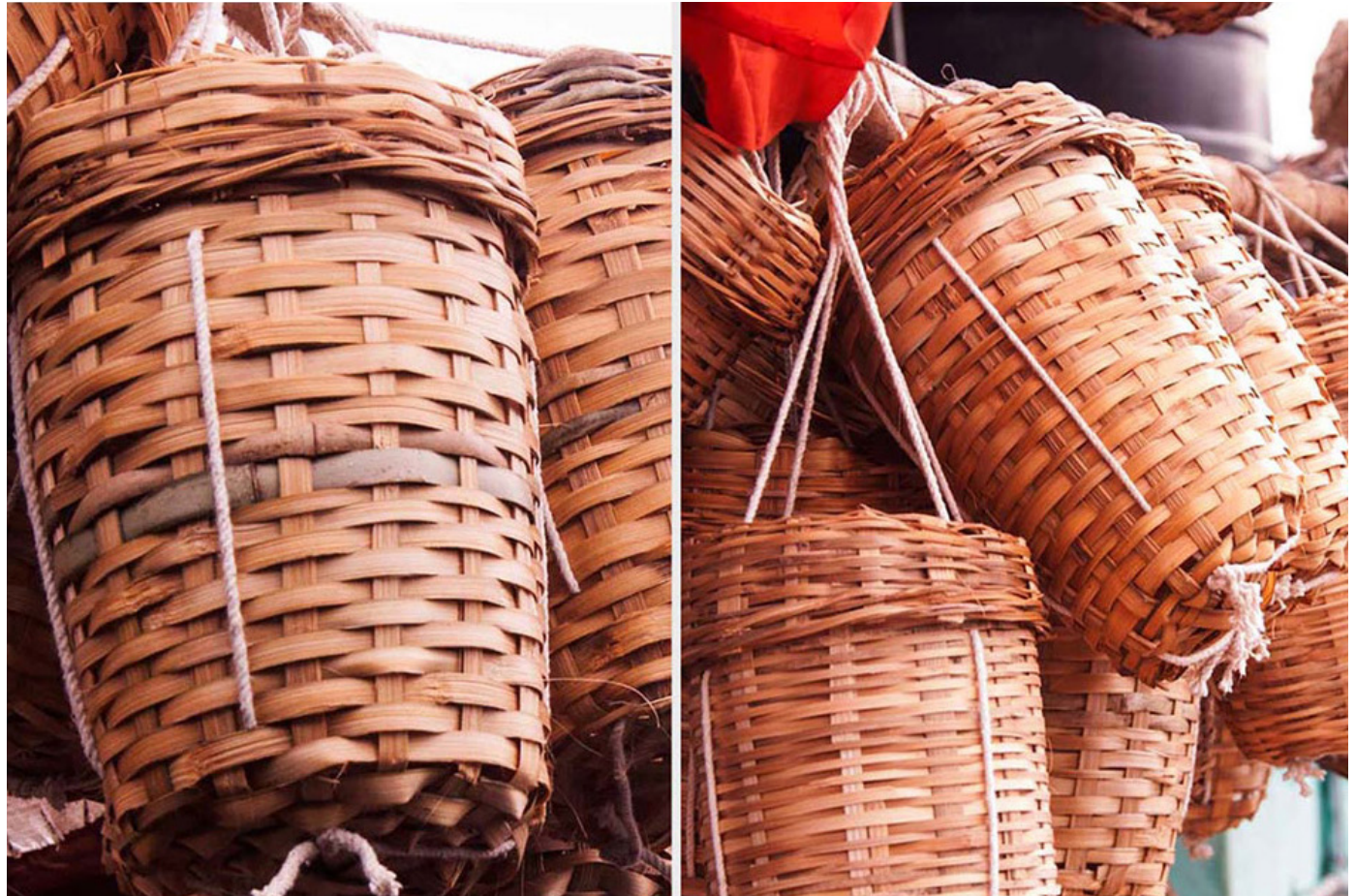
Bamboo baskets hung for display.