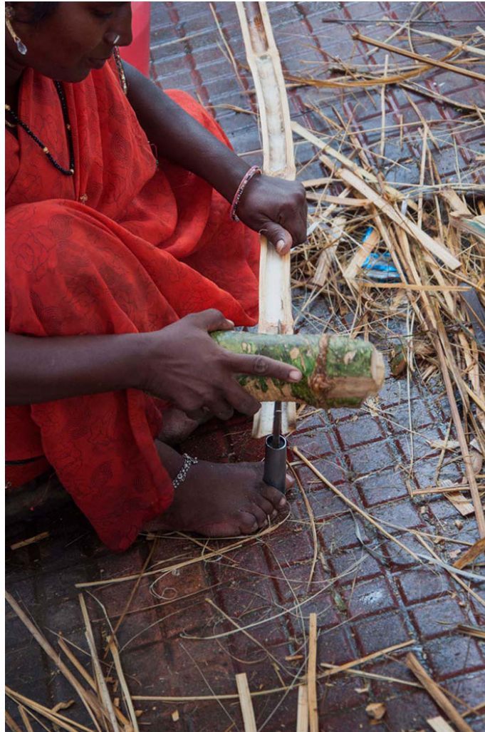
Bamboo is being slit into half.