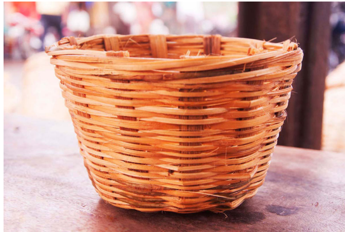
Small plain bamboo basket.