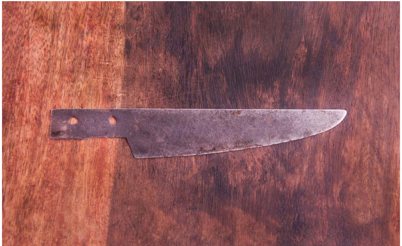
Knife is used to cut the bamboo twigs.