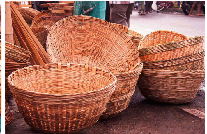
Open bamboo baskets.