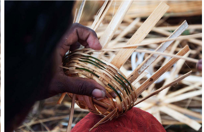
Completing the weaving of thin strips.