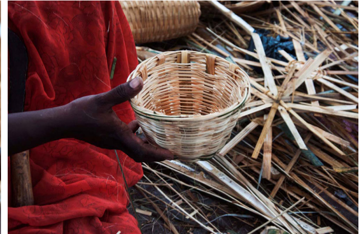
Beautifully weaved bamboo basket.