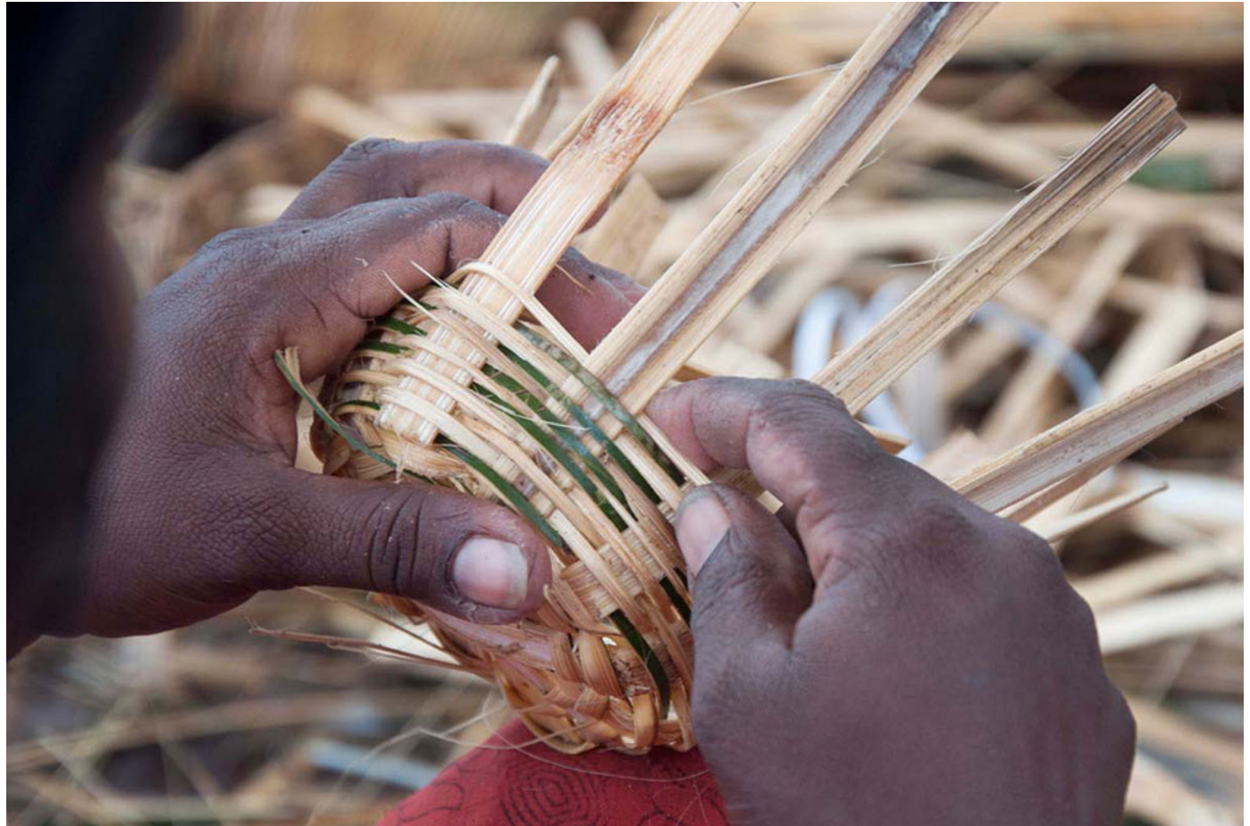
Making of a small bamboo basket.