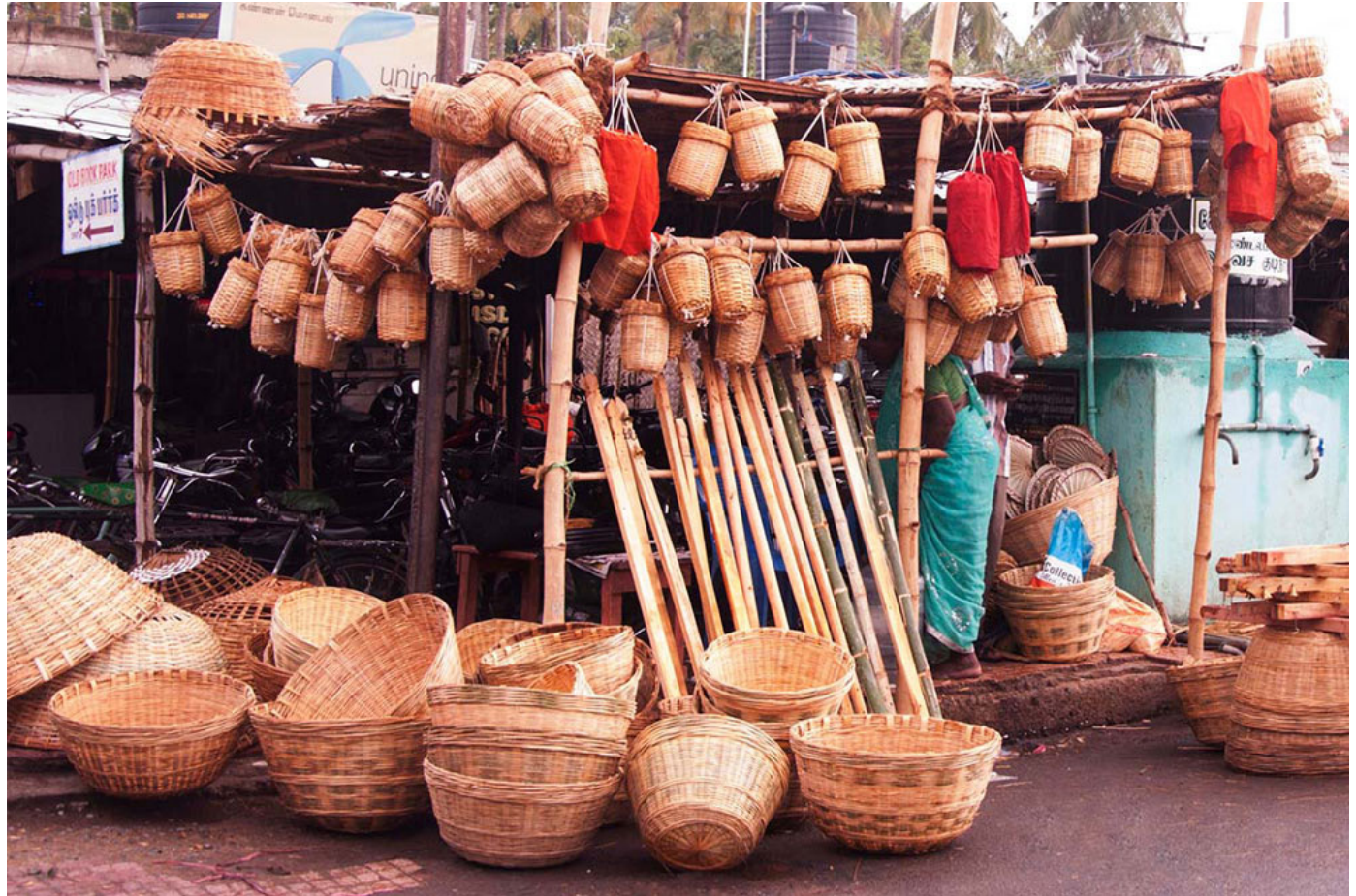
Bamboo shop at Vellore, Tamil Nadu.