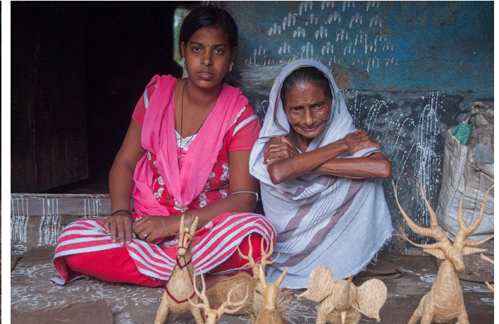
Artisan learnt coir craft from her grandmother.