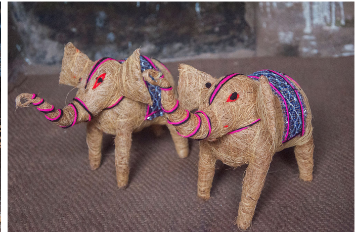
Idol of elephant with beautiful woolen ornaments on them.