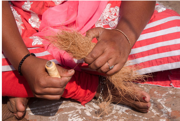
Artisan collects a bunch of coir and winds it with cotton thread.