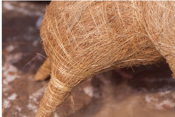
The cotton thread is winded more near the joint to make it stiff.