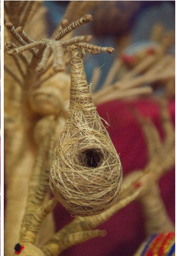
Minute nest on the tree made out of coir.