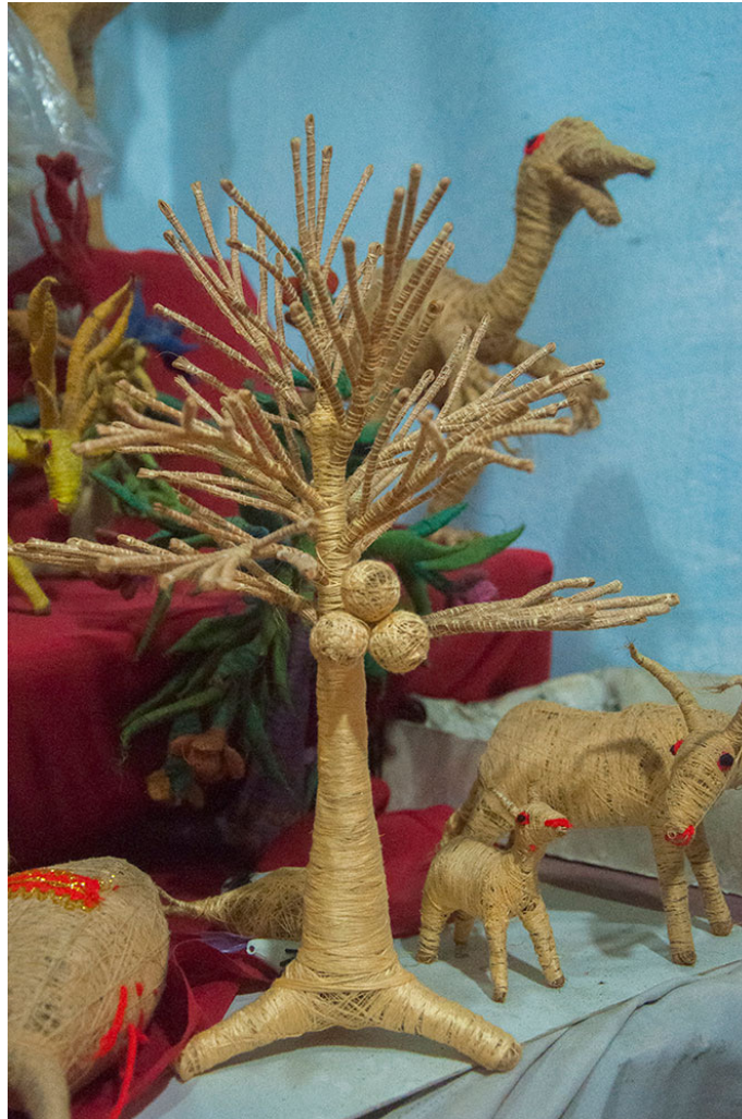
Intricately coir winded to make this beautiful tree.