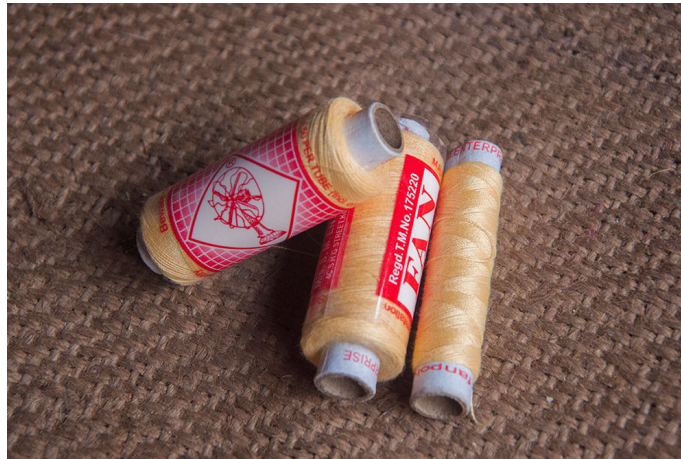
Cotton thread is used to wind the coir in the various shape.