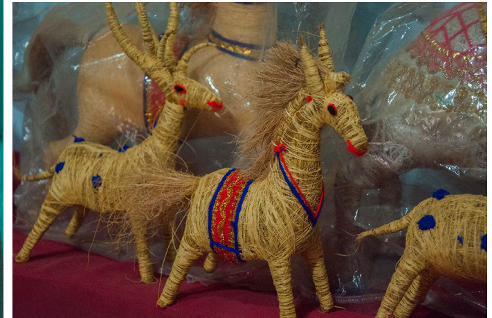
Adorably made horse out of coir with woolen ornamentation.