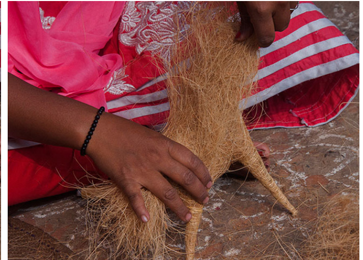
More coir is placed on the body to bring the shape of the toy.