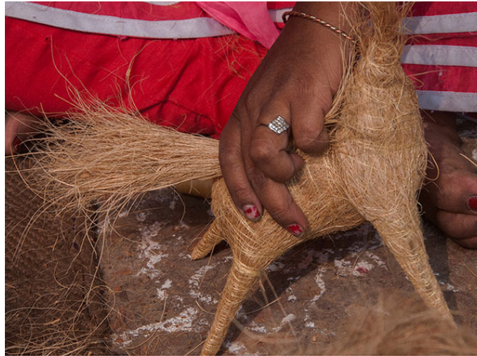
Bunch of coir is placed in the end of the toy to make a tail.