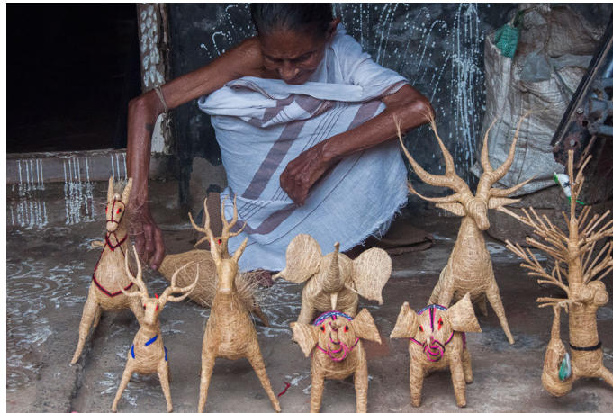
Senior artisan inspecting the toys.