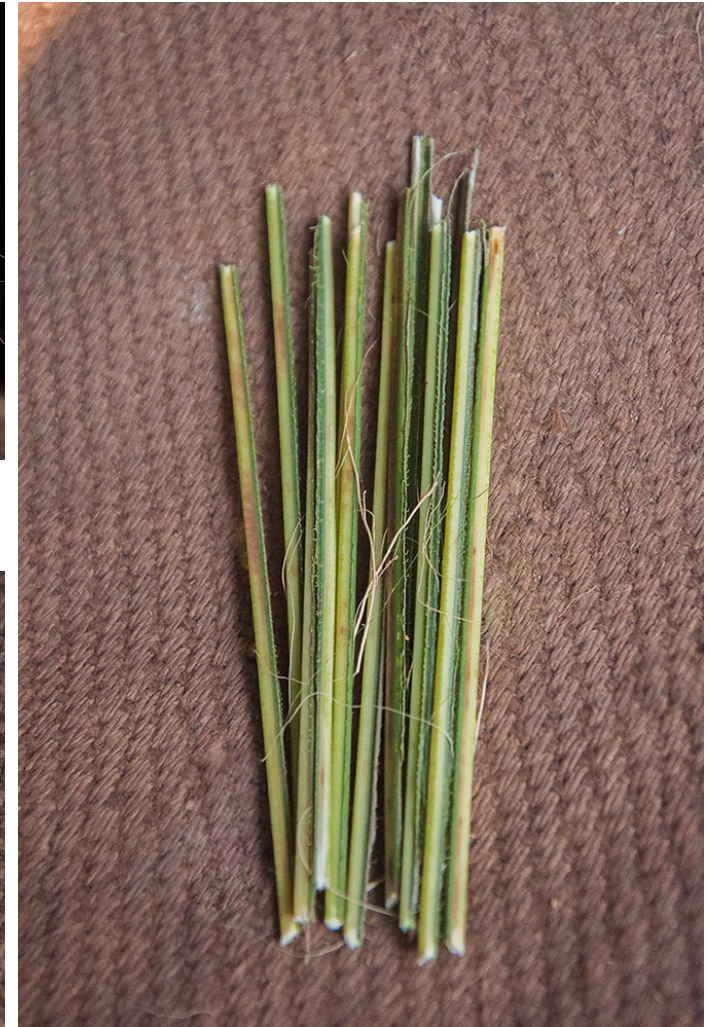
Sticks are placed in between coir to make the toy stiff.