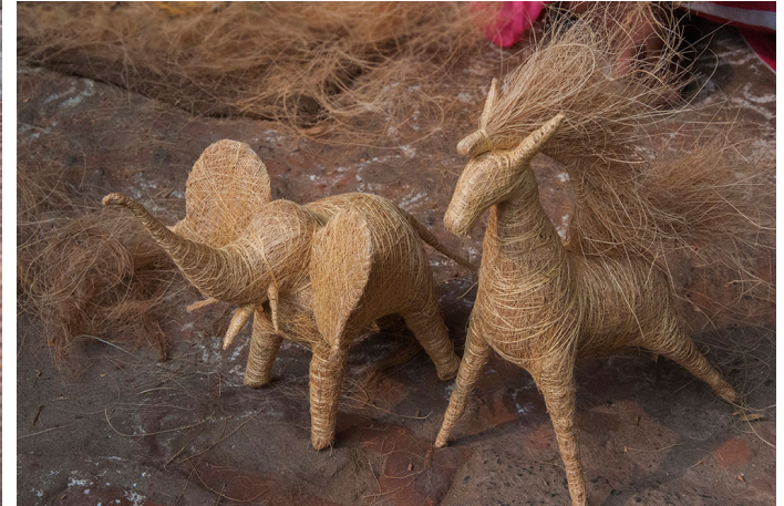
Coir toys are ecofriendly.