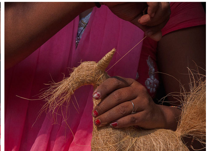
The horn is placed on the head and it is winded.