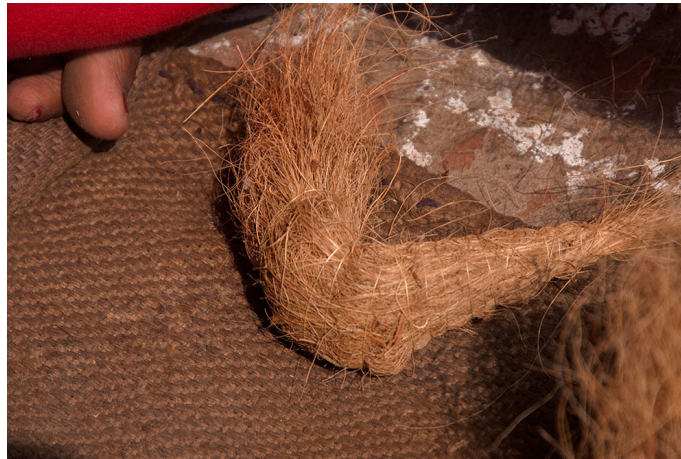
Initially the process of the idol starts from the neck.