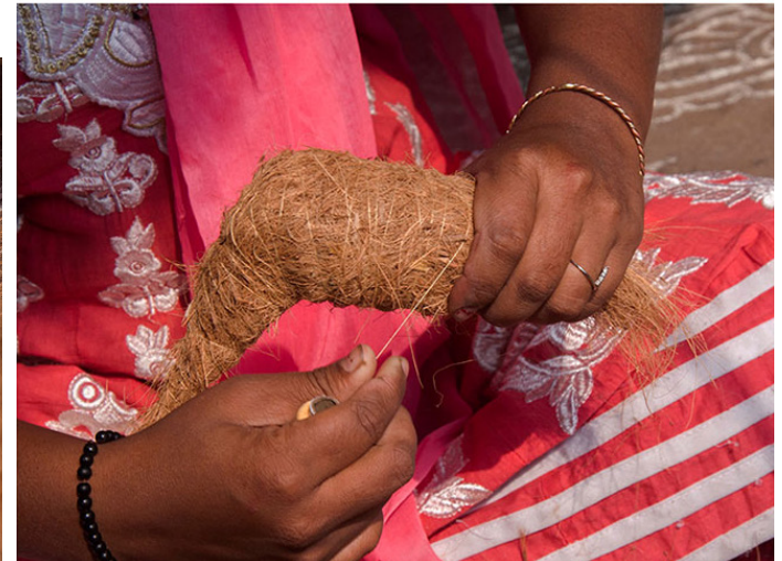
Handful of coir is collected and it is attached with the initial part by using thread.