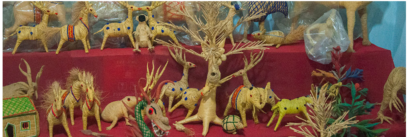
Toys displayed in an exhibition for sale.

Both domestic and worldwide markets are promising for coir products. Coir products are treasured all over the world. Within India, their work is being appreciated in Delhi, Mumbai, Kolkata, Bangalore, Kanpur and Chennai. The products are judiciously priced; therefore, it is liked by the local clients. The working process is so easy and springy that it can easily adapt to the changes according to the changes in the demand. Agents also take orders and designs from the customer. It is an eco-friendly product so it is easily exported to various countries like Japan, China, America and Great Britain.