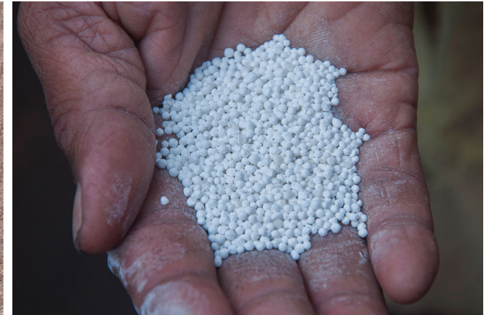
Tapioca pearl (Sabudana in Indian language) is diluted in water to make starch.