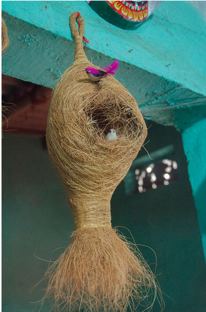
Nest made by using coir with artificial birds placed on it.