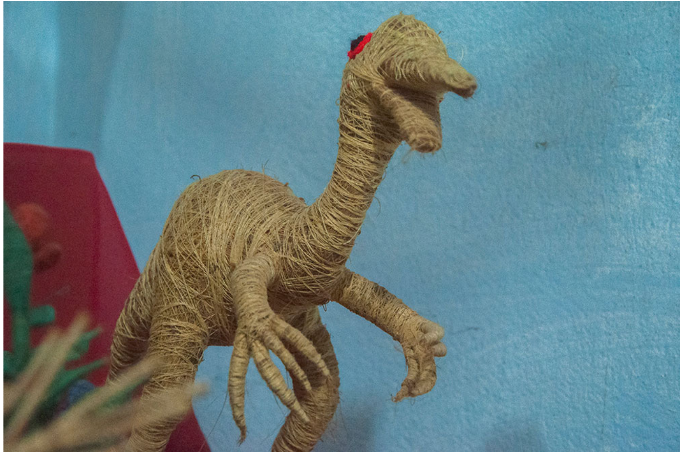
Marvelously made Tyrannosaurus with coir.