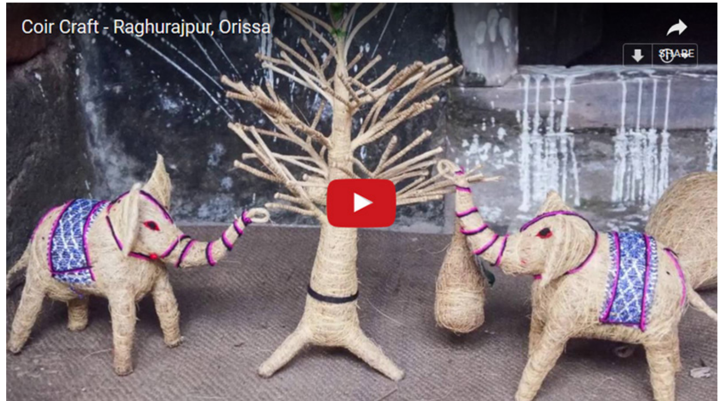
Coir Craft - Raghurajpur, Orissa