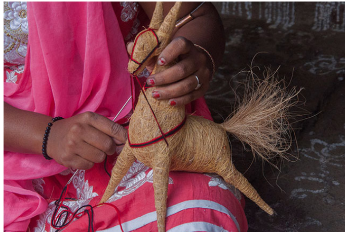
The idol is decorated with the woolen thread.