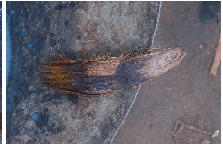
Waste coconut husk is used for applying glue on the toy.