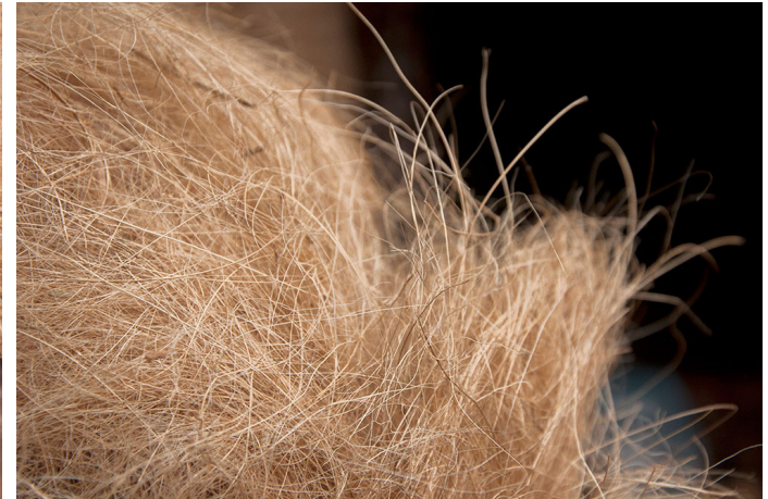
Well-refined coir fibers are used for making toys.