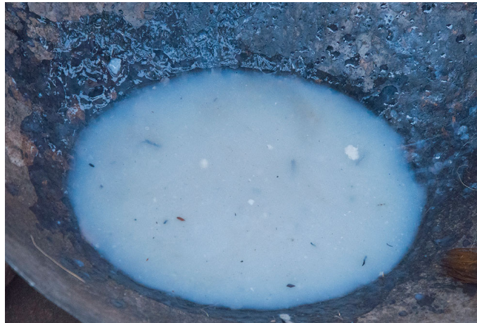
The mixture of water, fevicol and Sabudana (Tapioca pearl) is used as starch.