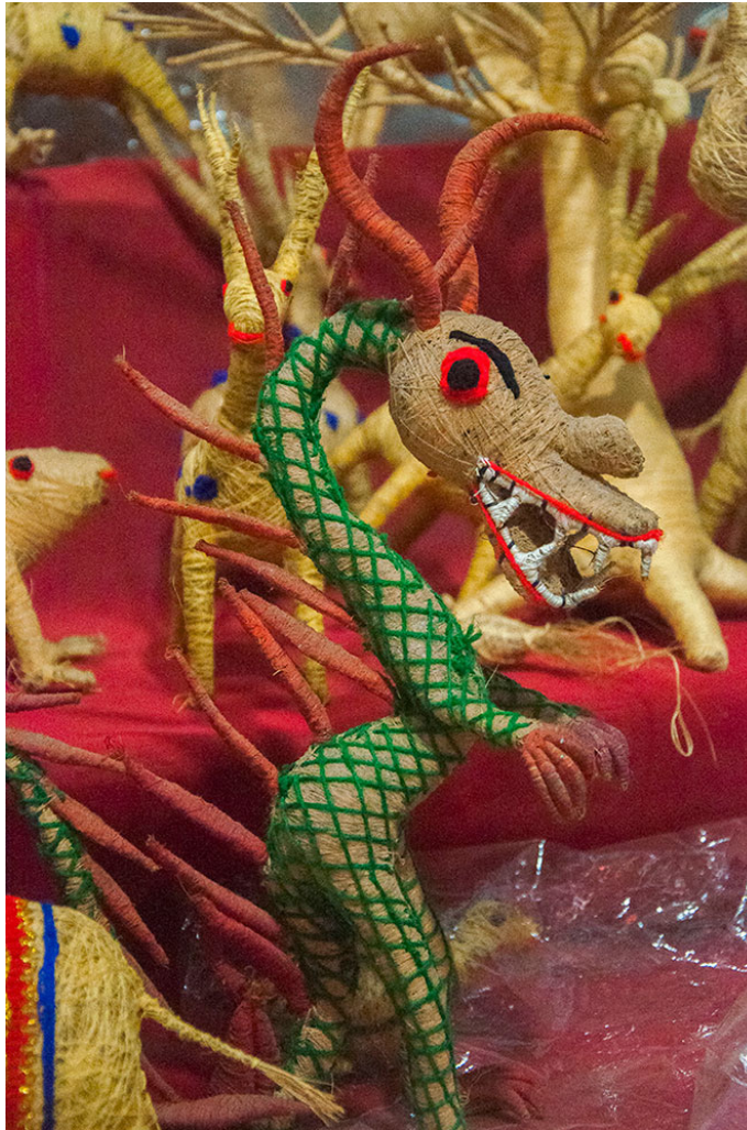
Colorful dragon made out of coir and bright colored woolen threads.