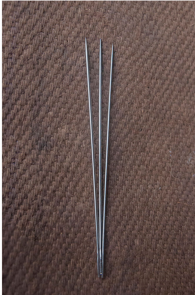
Needle is used in stitching designs on the coir toy.