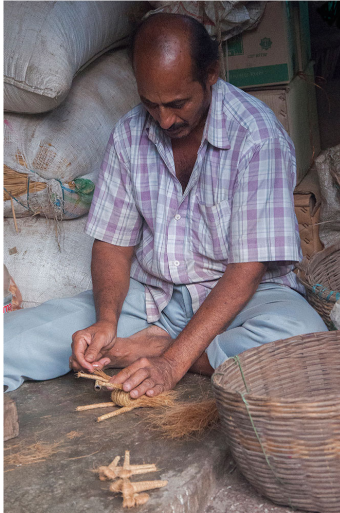
Skilled artisan of coir crafts.