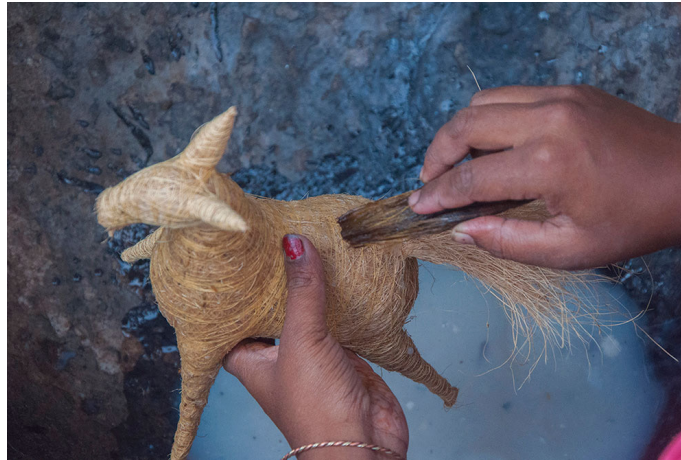
Starch is applied all over the idol to attain stiffness.