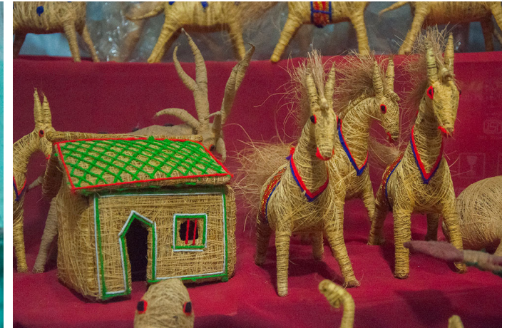
Beautifully made house and horses toys out of coir.