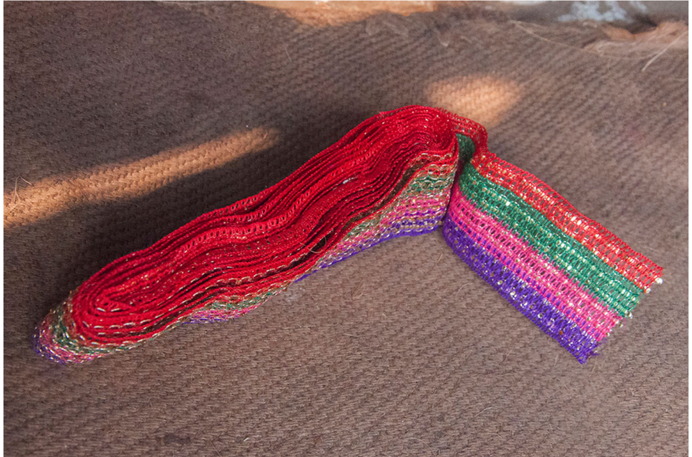
Embroidered lace is used to decorate the toy.