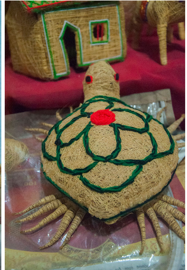
Turtle with decorative shell.