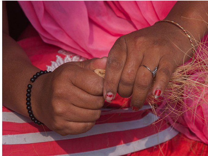
Coir is bent and placed on the neck, which is like head.