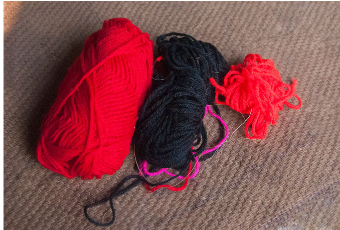
Different colors of woolen yarns are used to decorate the surface of the coir toy.