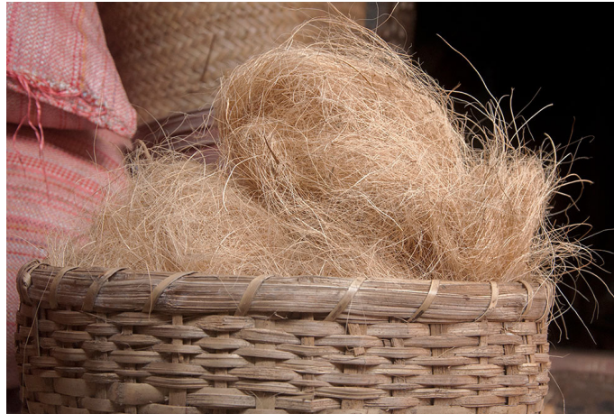
Refined husk (coir) is the main raw material used.