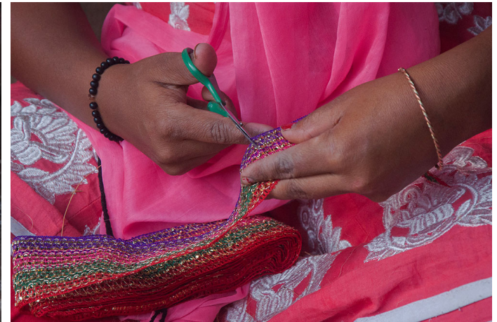
Embroidered lace is cut into required size of the idol.