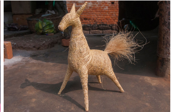
The idol is kept in the sunlight to dry.