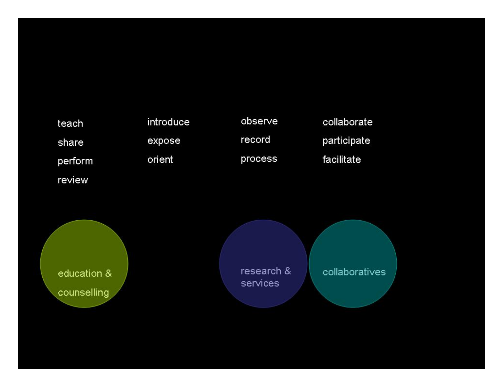
Figure 2: Design School Services