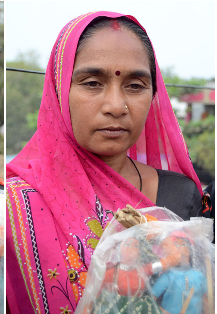
One of the women who make dolls at this workshop.