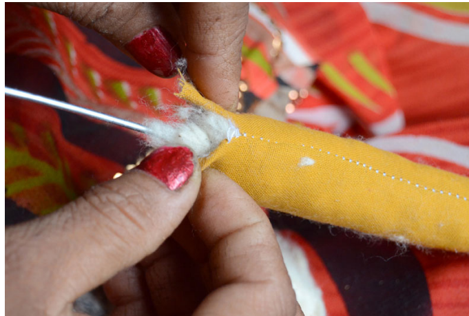
Fabric being stuffed with cotton.