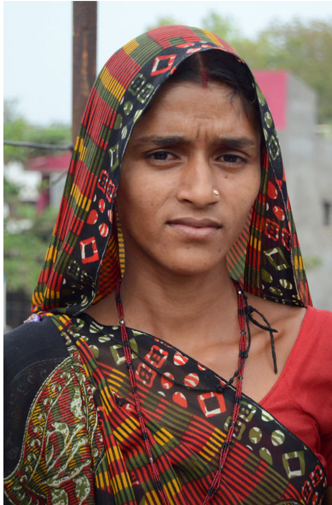
One of the women who make dolls at this workshop.