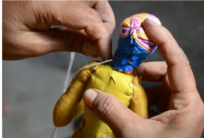
The face of the doll being stitched into the torso.