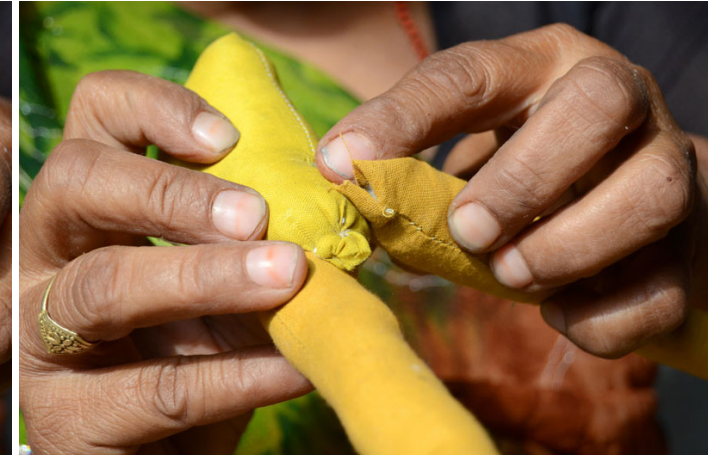
The leg of the doll being poked into the torso.