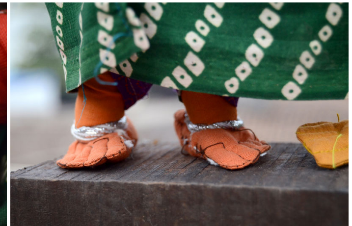
Detailing of the doll's accessories (woman) made at this workshop. Feet of the doll (woman) made at this workshop.