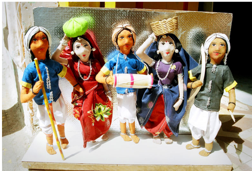
A set of tribal dolls at the Gudiya Ghar.