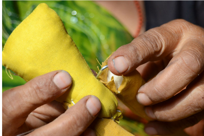
The leg of the doll being poked into the torso.

http://dsource.in/resource/dolls-jhabua/process