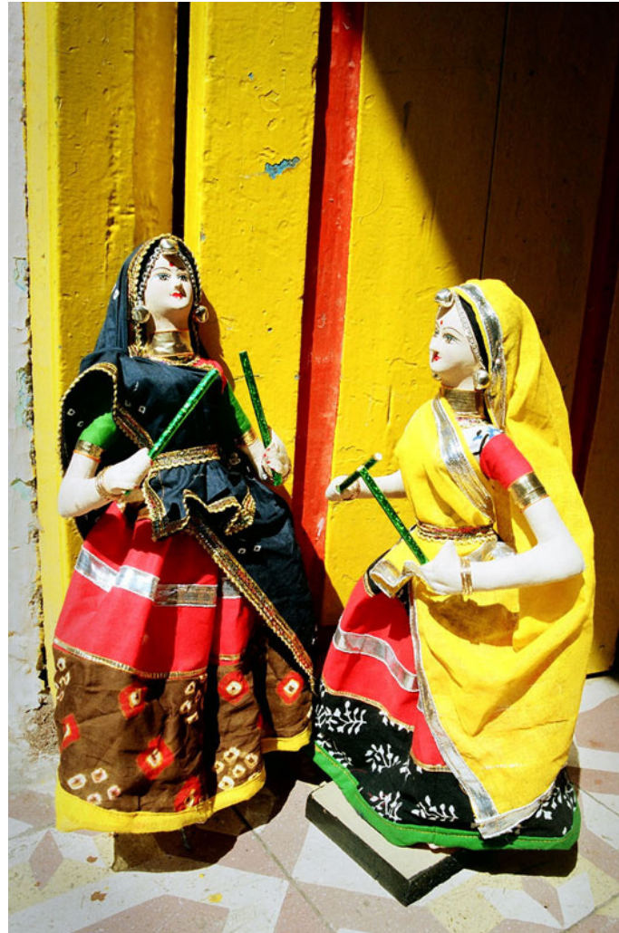
Dancing dolls at the Gudiya Ghar.