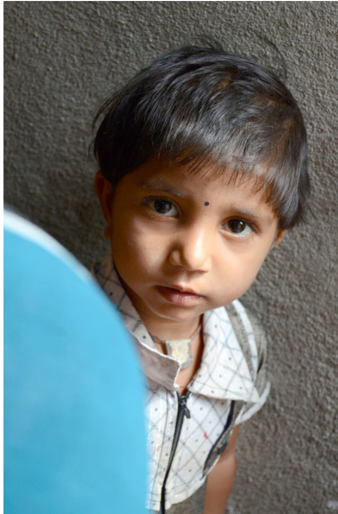
One of the kids in the house.