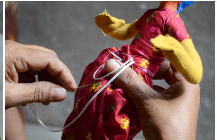
The clothes of the doll being stitched to fit well.