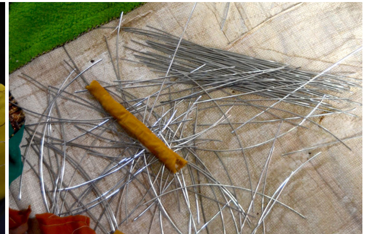
Metal pipes for making the legs of the dolls.