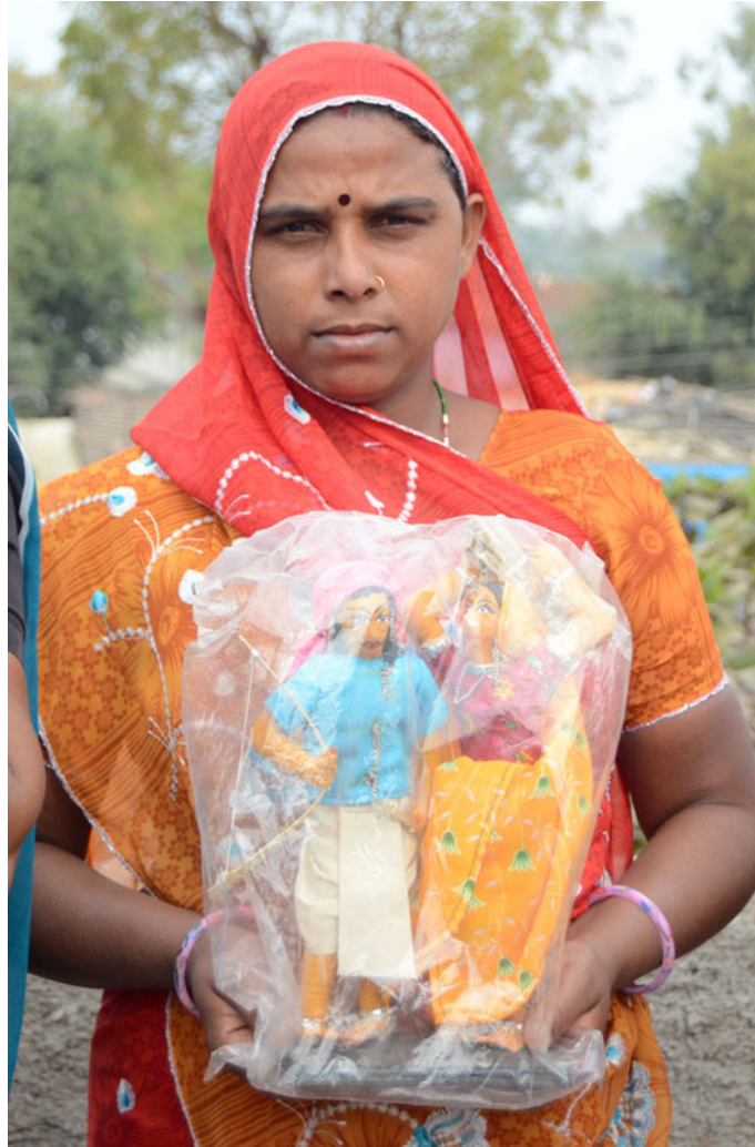
One of the women who make dolls at this workshop.