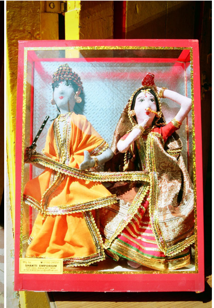
Radha Krishna dolls at the Gudiya Ghar.