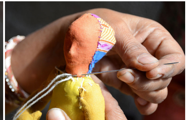
The face of the doll being stitched into the torso.