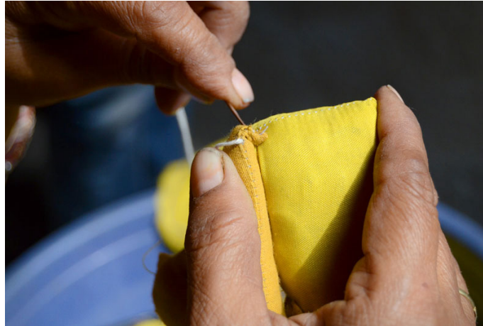
The arm of the doll being stitched into the torso.

http://dsource.in/resource/dolls-jhabua/process