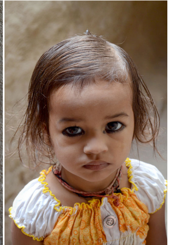
One of the kids in the house.