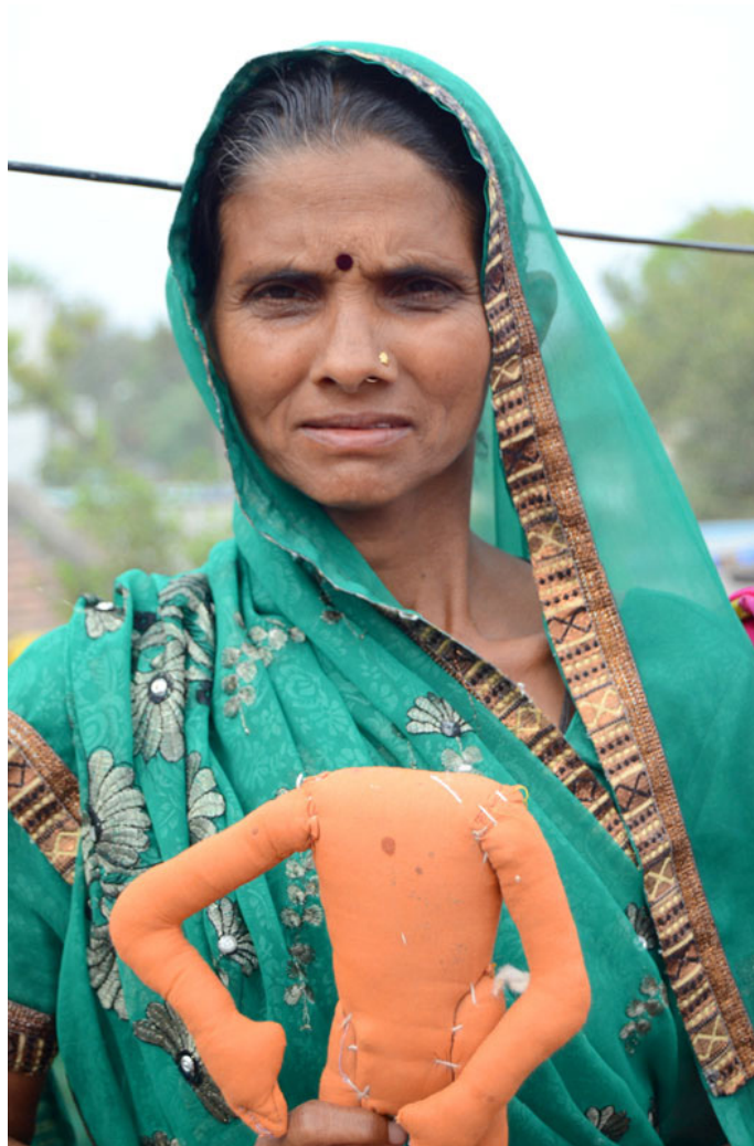
One of the women who make dolls at this workshop.