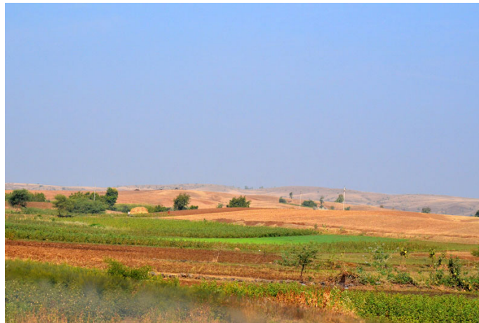
Greens, browns and blues, on the way to Jobat.

Jhabua is a predominantly tribal district located in the western part of Madhya Pradesh, bordering Gujarat, with its own collectorate and district court, police headquarters, bus stand and of course, the market. The urbanizing rurals live in harmony with the adivasis. It has a variety of handicraft products made indigenously using materials from the environment. The women make lovely ethnic items including bamboo products, dolls, bead-jewelry and other items that have for long decorated the living rooms all over the country. They are usually spotted wearing chunky, metallic tribal jewelry. The men have since ages adorned 'teer-kamthi', the bow and arrow, which has been their symbol of chivalry and self-defense. The vibrant colors and creativity of these crafts celebrate the joyous aspect of their lives, completely belying the hardships they face due to regularly poor harvest.