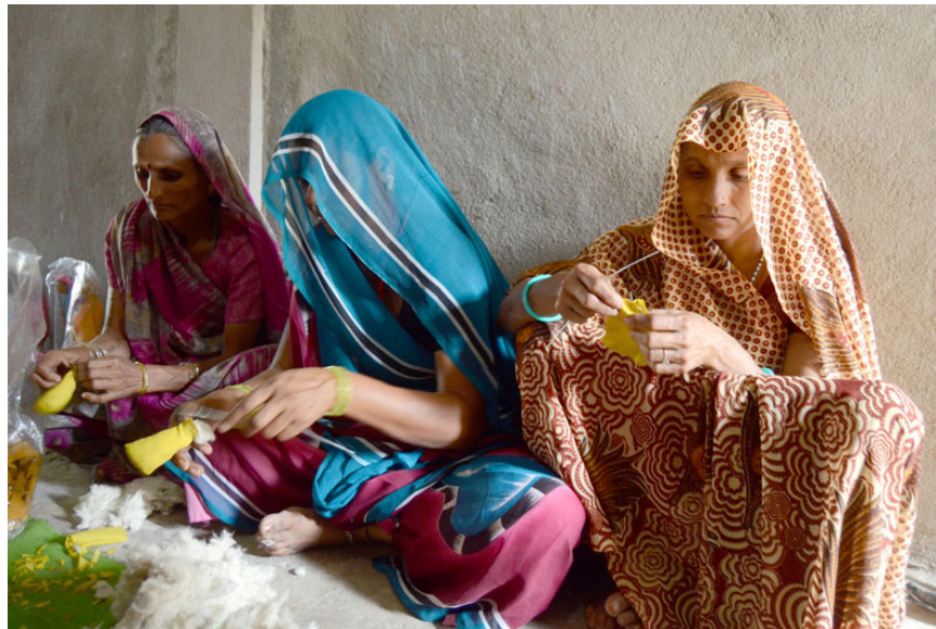
Women working at the doll making centre.