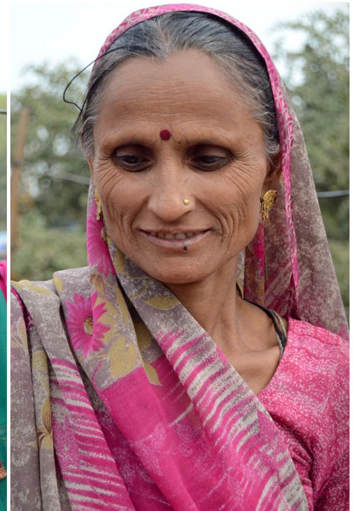
One of the women who make dolls at this workshop.