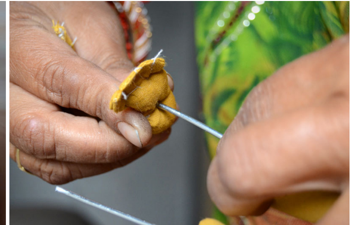
One of the feet being pushed into the metal wire.