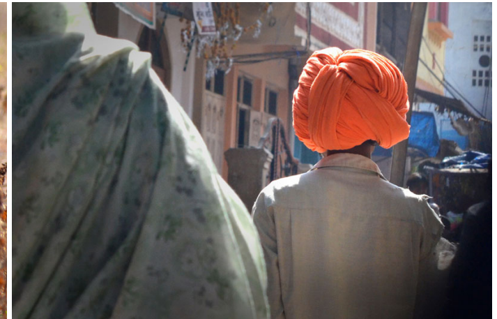
Bright colorful turban worn by an adivasi.