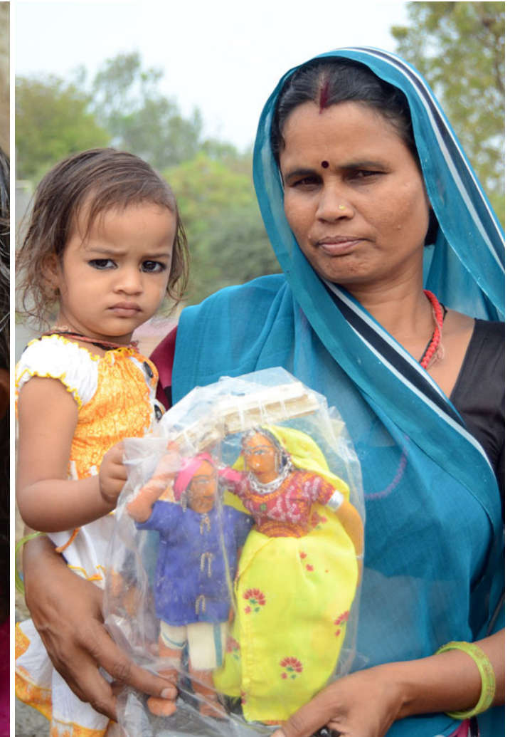
One of the women who make dolls at this workshop.