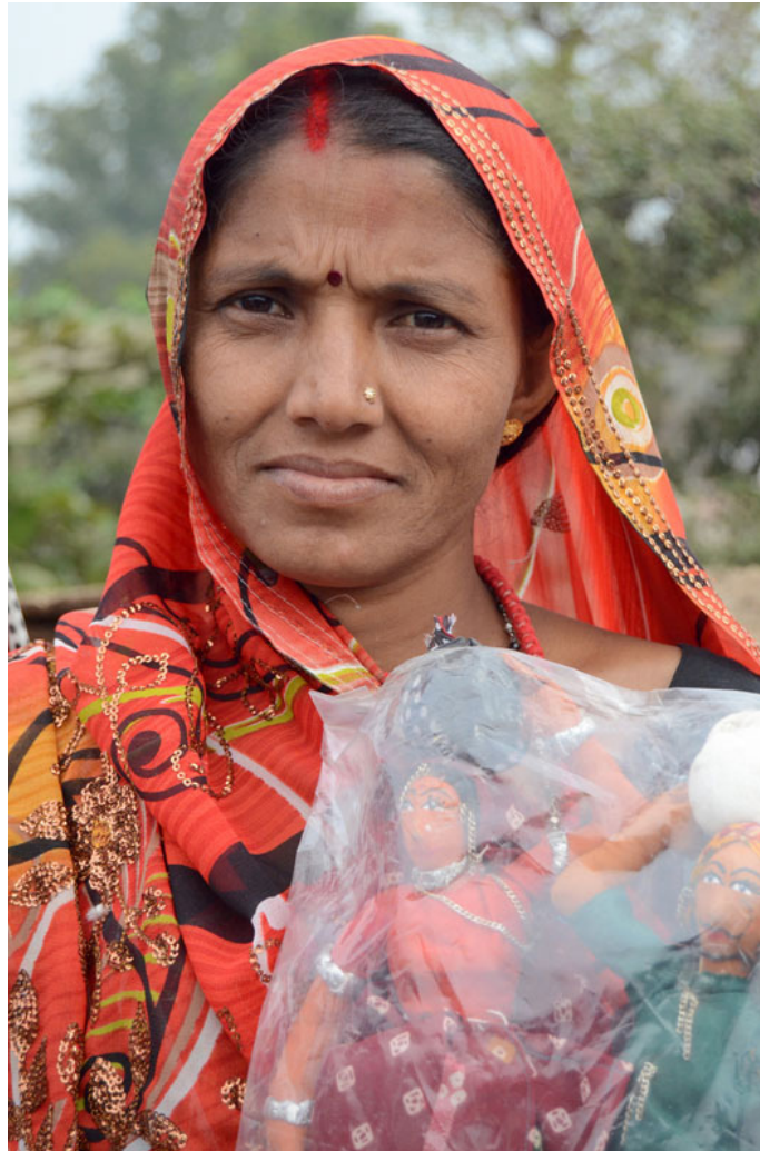
One of the women who make dolls at this workshop.