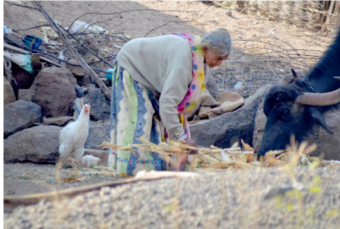
Colors against the raw brown background.

http://dsource.in/resource/dolls-jhabua/place