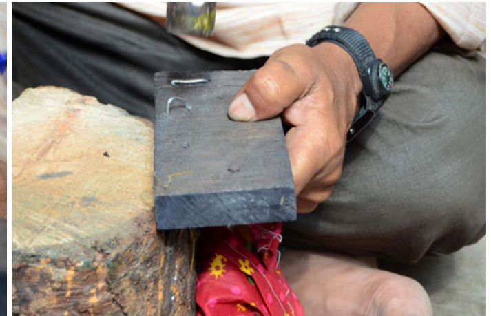
The metal wire being hammered from below.