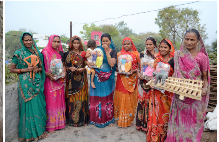
The doll making women posing with their products.