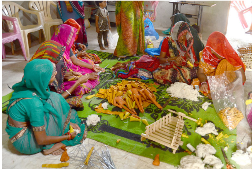
Women working at the doll making centre.

http://dsource.in/resource/dolls-jhabua/place