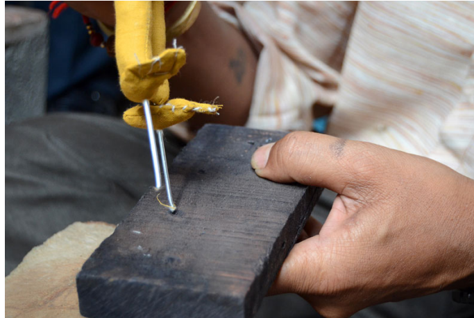
The doll is being made to stand on the wooden base.