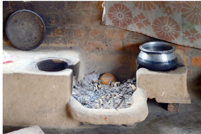
The 'chulha' for cooking food.