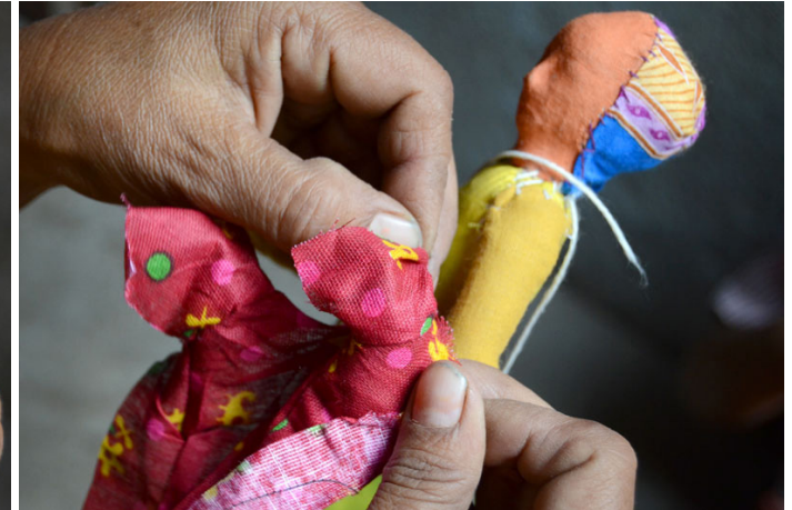
The doll being made to wear clothes.