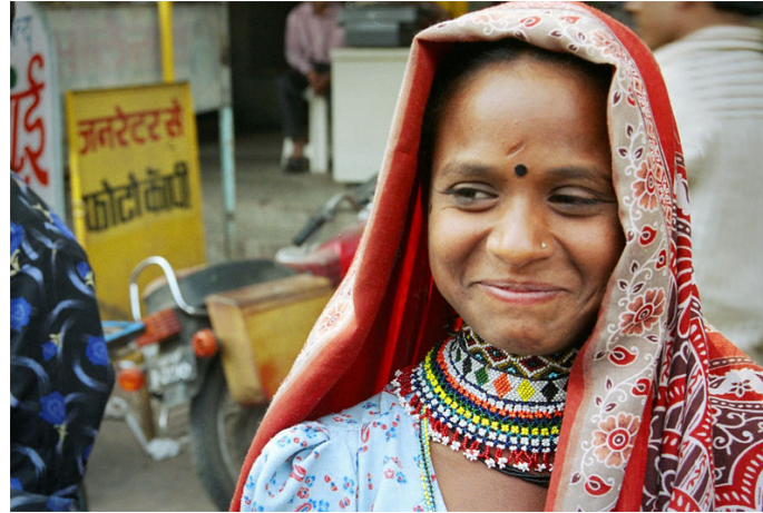
A tribal lady wearing a beaded necklace.

http://dsource.in/resource/dolls-jhabua/place