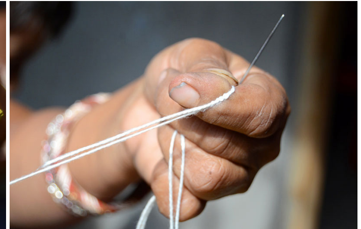
The leg of the doll being poked into the torso.