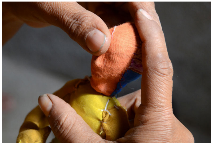
The face of the doll being stitched into the torso.