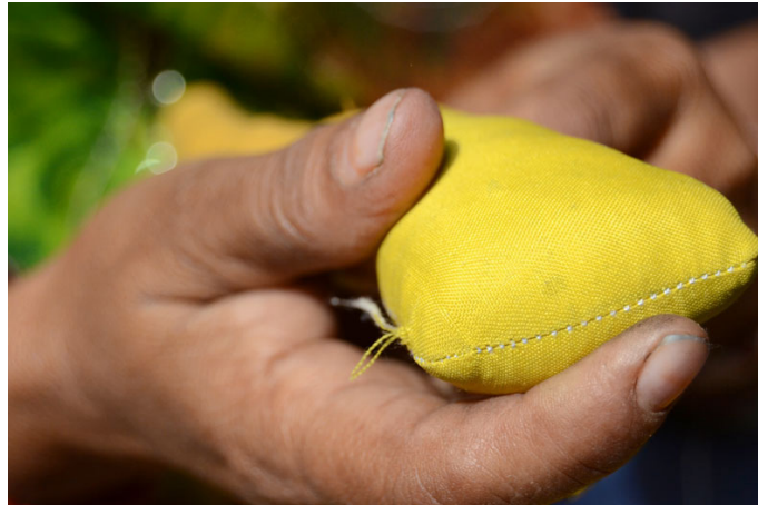
The leg of the doll being poked into the torso.