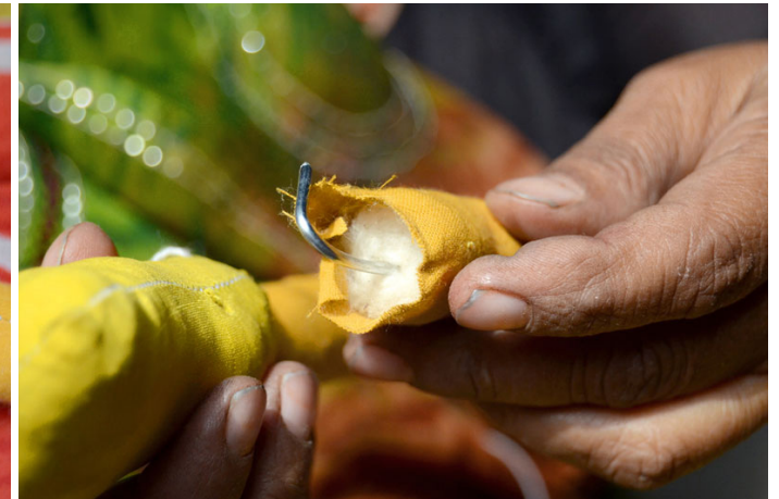
Fabric being stuffed with cotton.