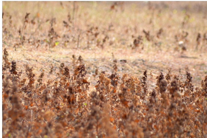
Plantation by the roadside.