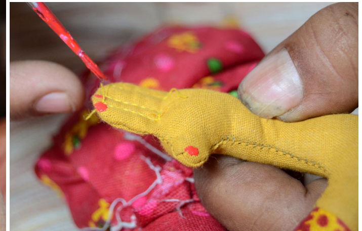
Nails being polished with red.