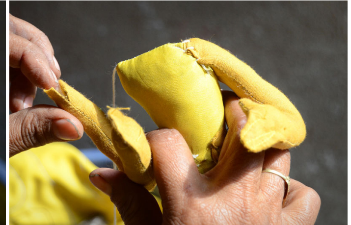
The arm of the doll being stitched into the torso.