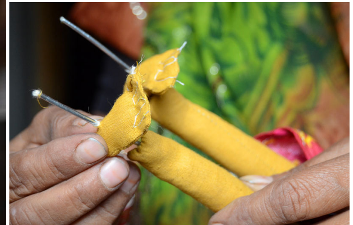
The other foot being pushed into the metal wire.