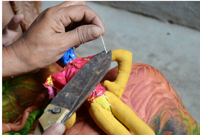
The clothes of the doll being stitched to fit well.