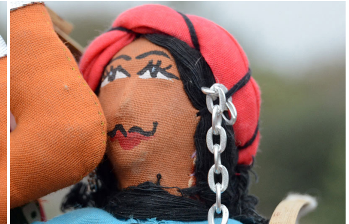
Expressions of the doll (woman) made at this workshop. Expressions of the doll (man) made at this workshop.