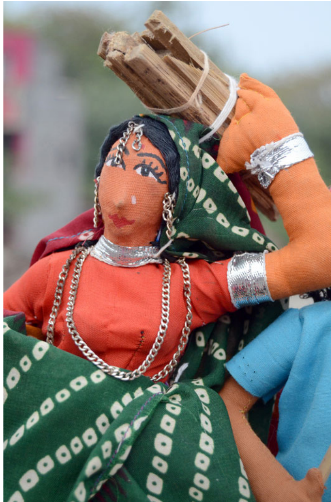
The doll (woman) made at this workshop.