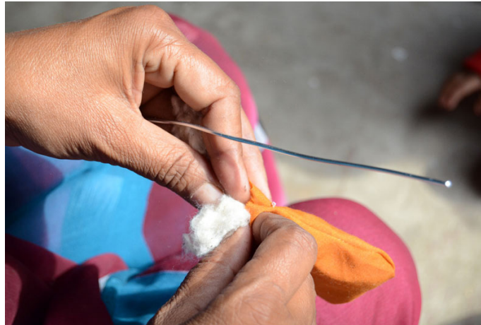
Fabric being stuffed with cotton.

http://dsource.in/resource/dolls-jhabua/process