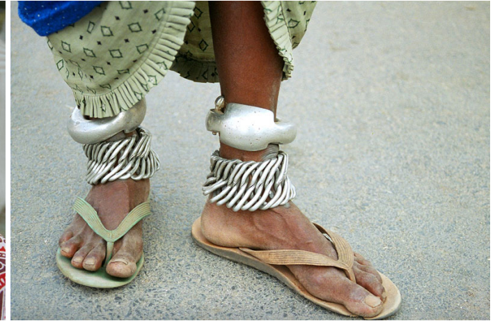
A tribal lady wearing chunky silver jewelry.