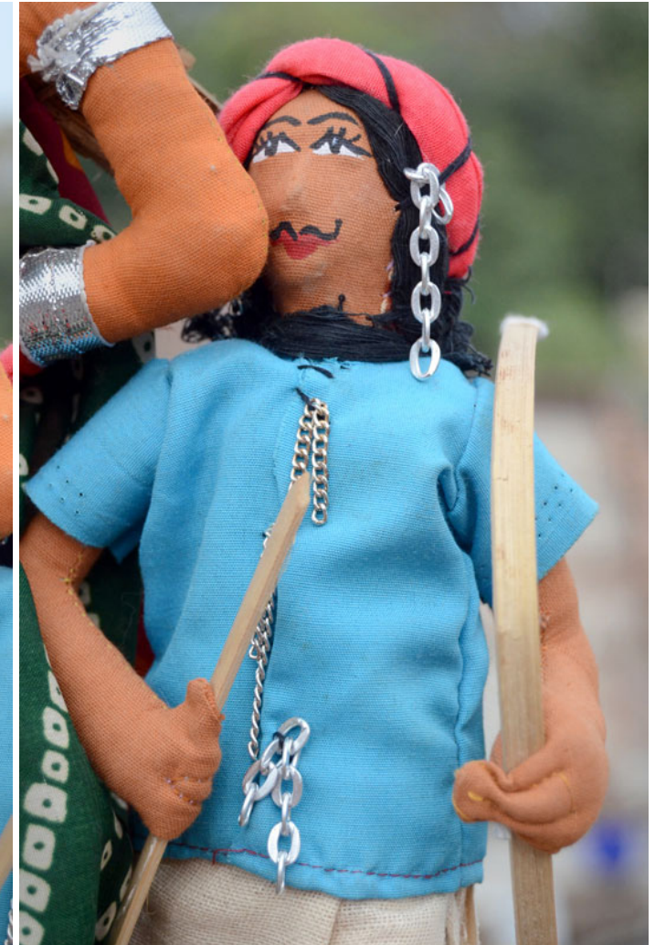
The doll (man) made at this workshop.