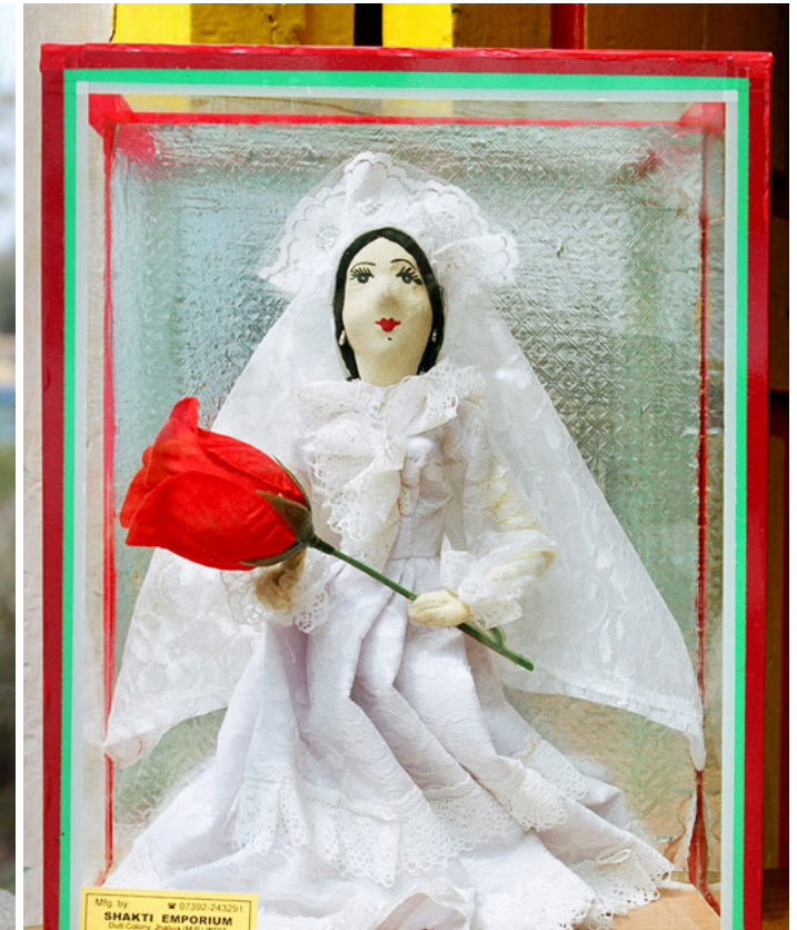
Queen doll at the Gudiya Ghar.