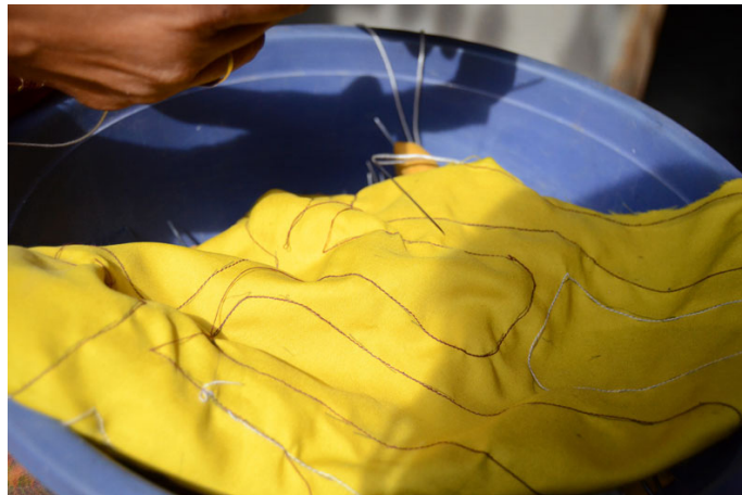
Body parts of the dolls made by stitching two layers of fabric.