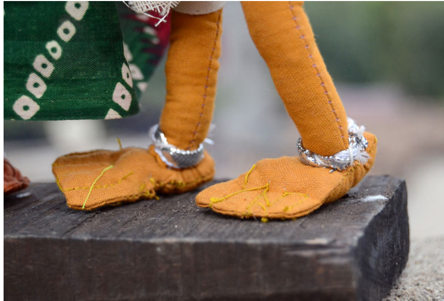
Feet of the doll (man) made at this workshop.

http://dsource.in/resource/dolls-jhabua/products