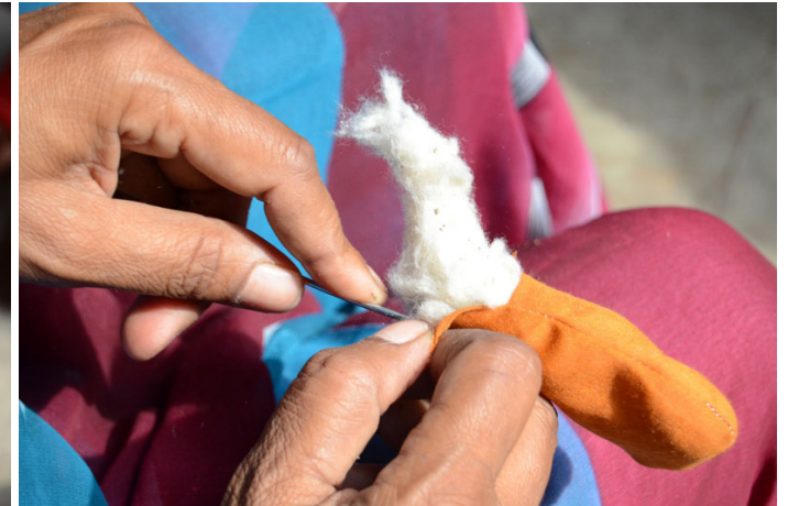
Fabric being stuffed with cotton.