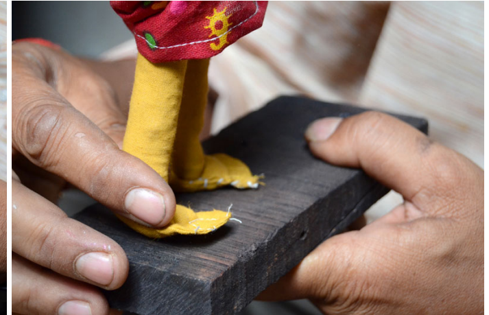
The doll is being made to stand on the wooden base.