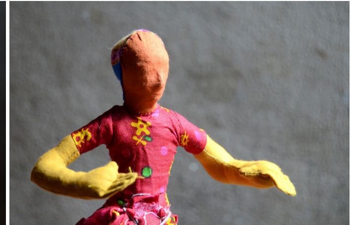
The doll's face is ready to be painted on.