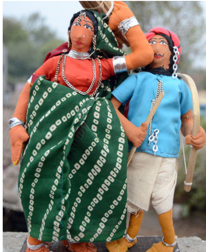
The doll pair made at this workshop.

Gudiya Ghar is how Shakti Emporium is locally known. It has the finest and perhaps only collection of dolls made by the tribals. These are slightly different from what the locals make, in terms of their dresses and accessories, and are more intricately detailed. Apart from dolls, the emporium also has a range of unbelievable bead ornaments, purses and the traditional teer-kamaans.