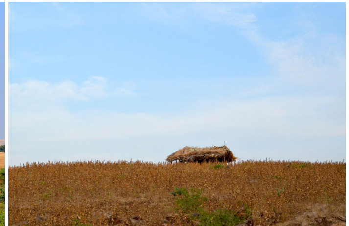
A hut on the way to Jobat.