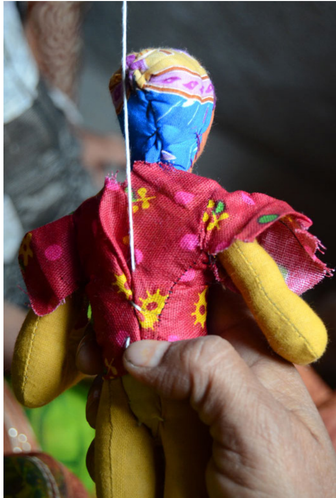
The clothes of the doll being stitched to fit well.