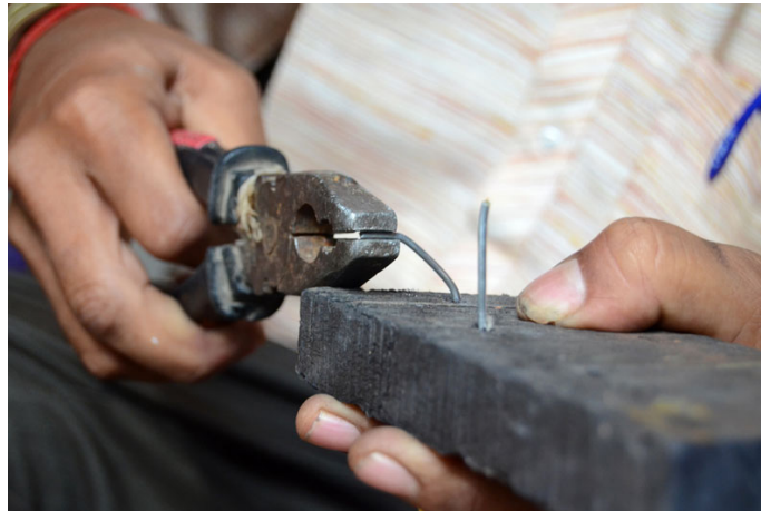
The metal wire being twisted from below.