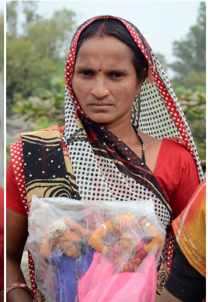
One of the women who make dolls at this workshop.