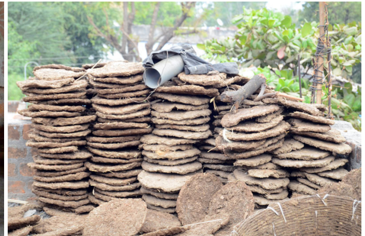
Cowdung cakes being sun-dried for firing clay faces of the dolls.