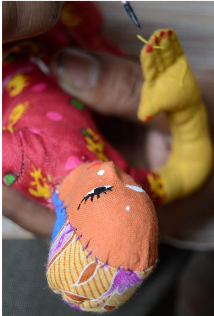
Expressions being painted on the face.