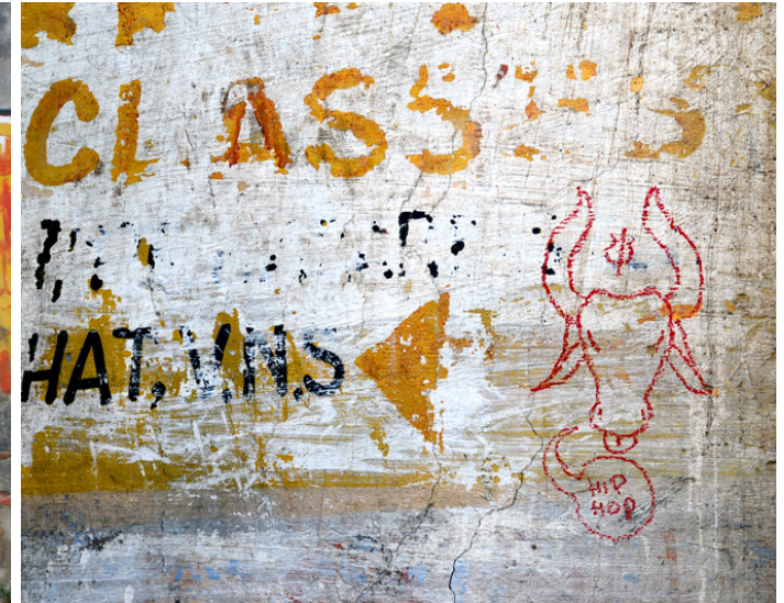
Hip Hop cow illustration.