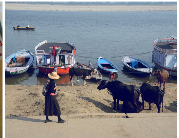
A lady wandering around the Ghats.