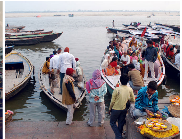
Devotees boarding boat to reach the other side of the river.