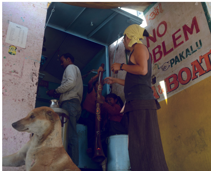
Conversation and music with tea.