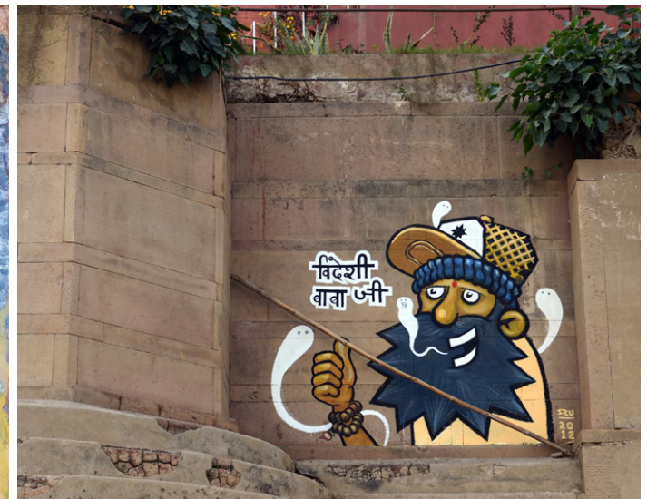
Illustration by local foreigners.