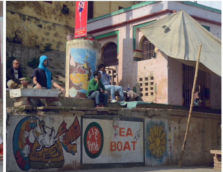
A foreigner meditating at the Ghat.