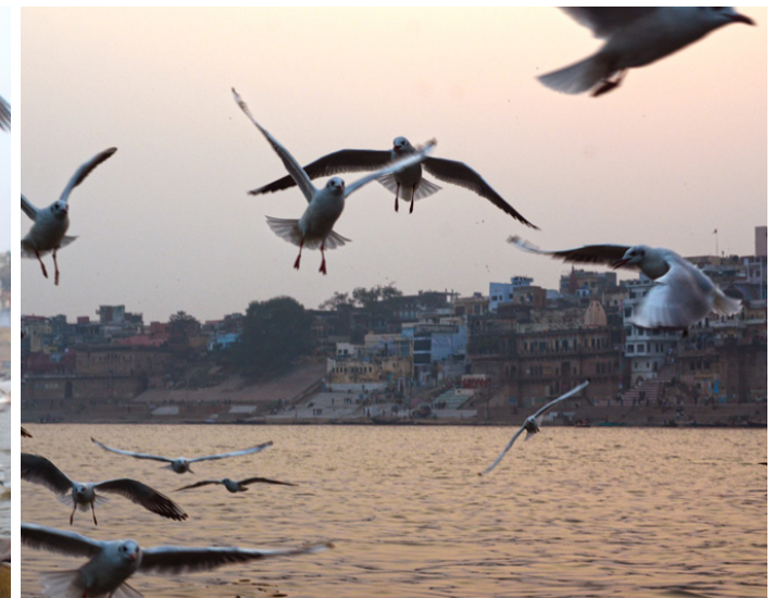
Fleet of migratory birds on the river Ganges.