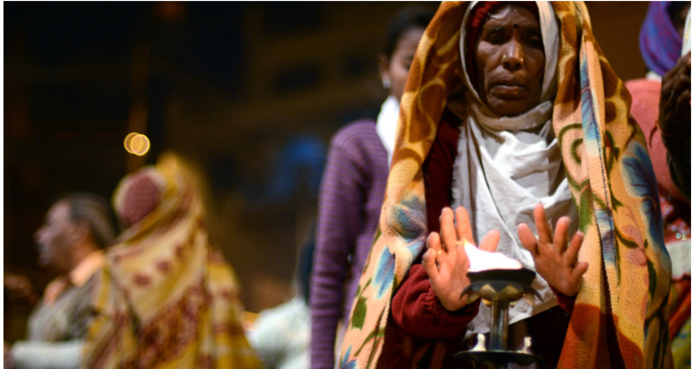
An old lady takes the blessings.