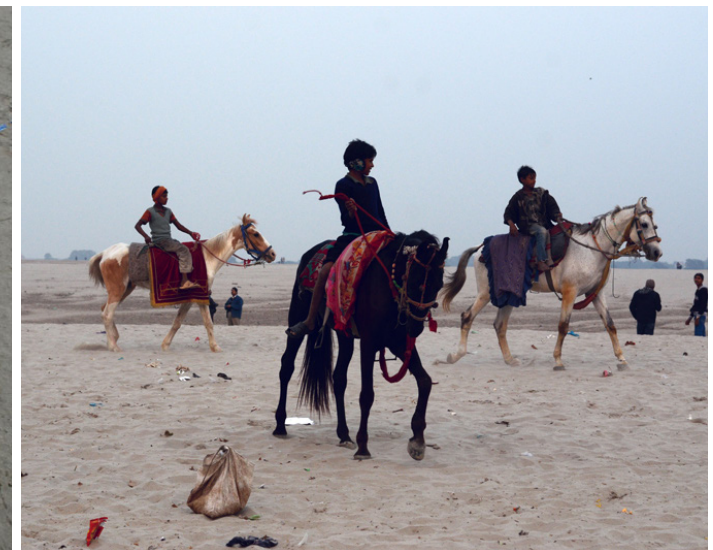
Horse riding on a deserted portion of the river bank.