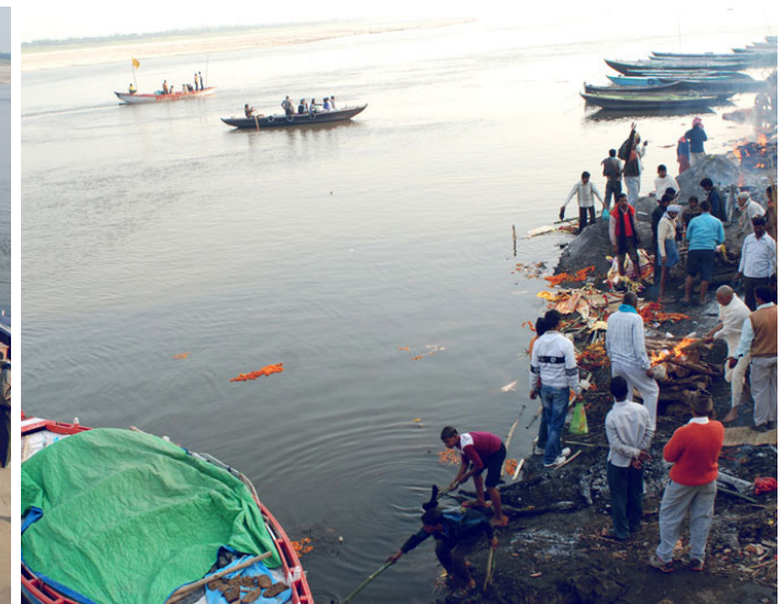
Cremations at the Ghat.