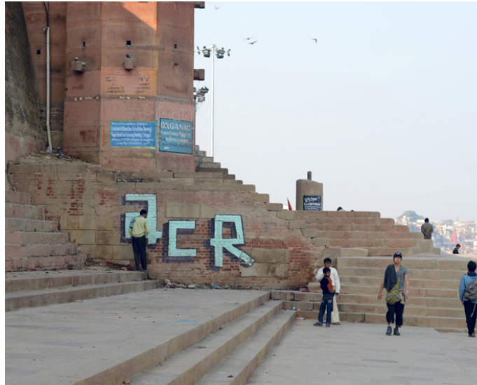
Evening at Ghat.

http://www.dsource.in/resource/ghats-varanasi/life-ghats