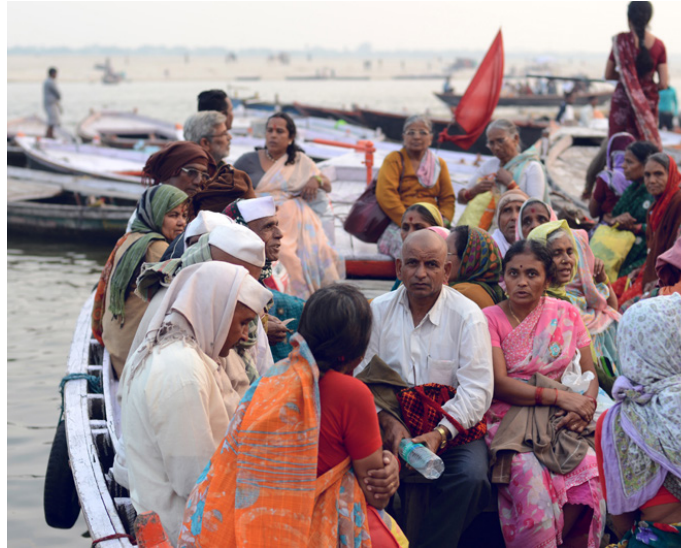
A group of people hire a full boat.