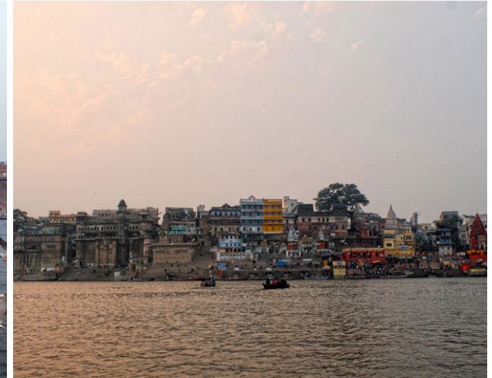
Ghat at the time of sunset.