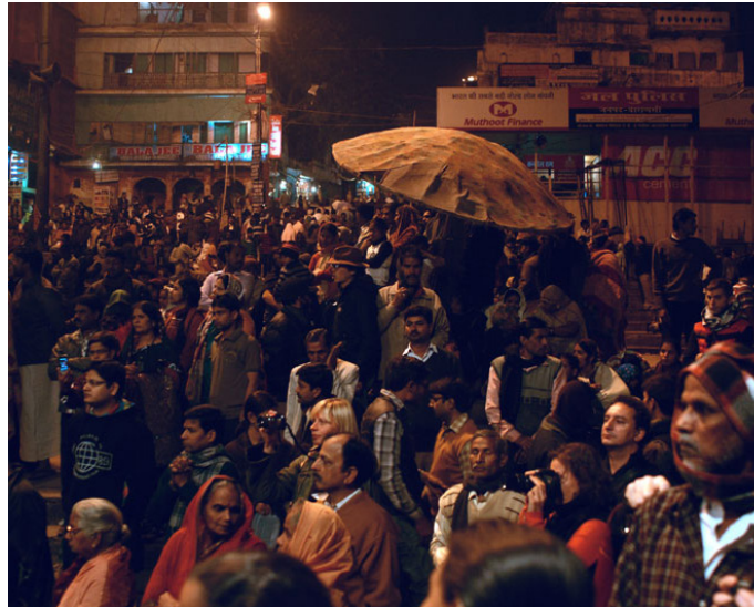
Crowd on Ghat stairs.