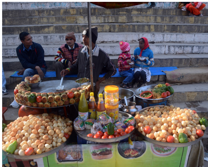
Food stall at Ghat, selling savouries.