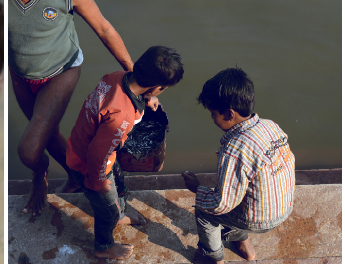
Kids enjoying the act of fishing.