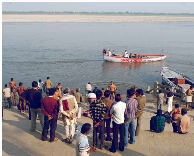
People bathing on the ghat.