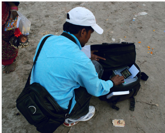
Photographer delivering instant photographs.