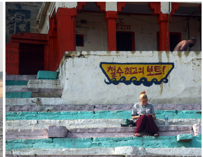
A girl reading a guide book.