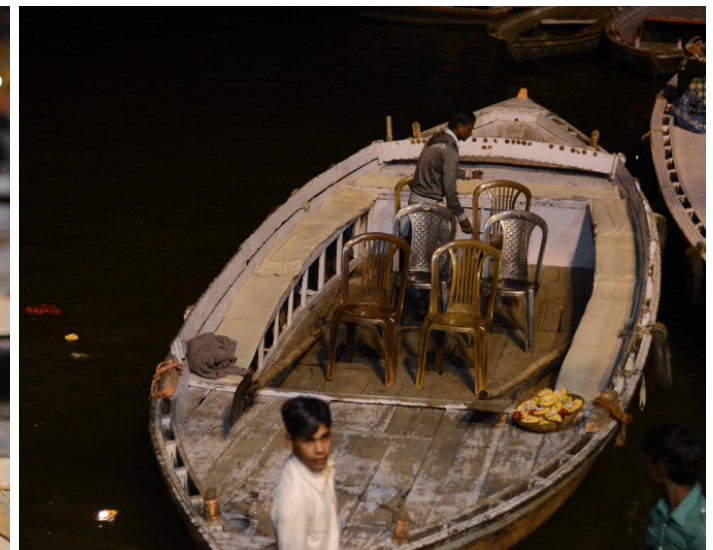
Arrangement of chairs in boat for viewing the evening prayer, 'Aarti'..