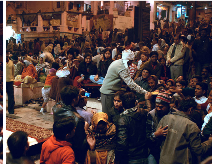
Ceremony of distributing deities' blessings, in the form of sweets.