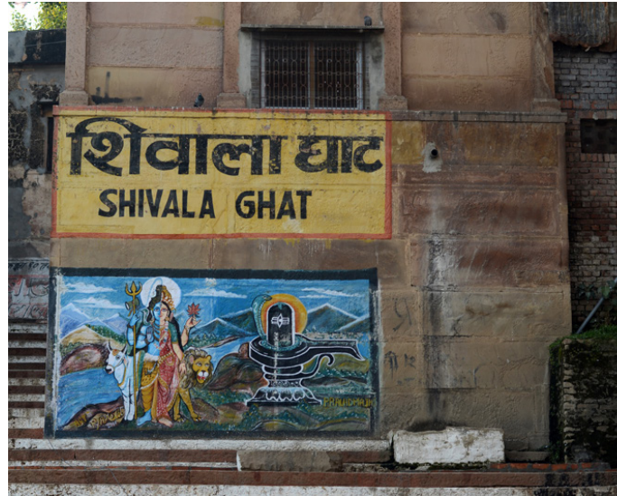
Illustration at Shivala Ghat.

http://www.dsource.in/resource/ghats-varanasi/life-ghats