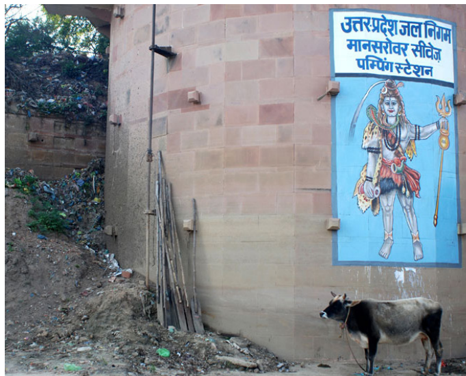
Illustration of Lord Shiva on a water tank.