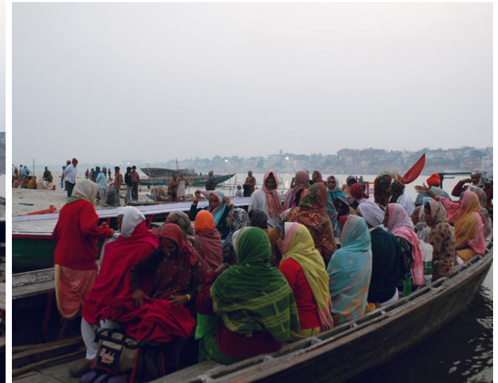
Loaded boats leave for Ghat.