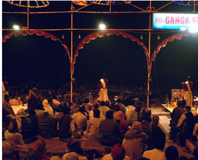
Holy prayers and chants witnessed by a huge crowd.

http://www.dsource.in/resource/ghats-varanasi/prayers