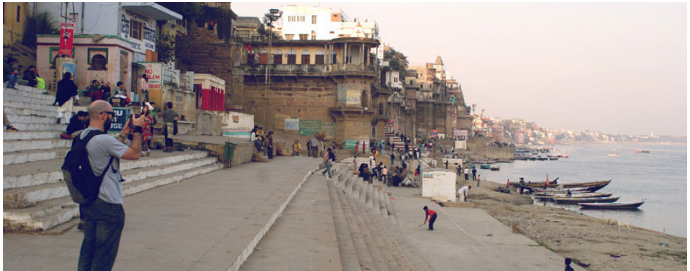
People clicking pictures.