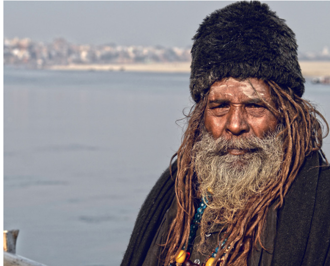
A lifetime spent at Ghats.