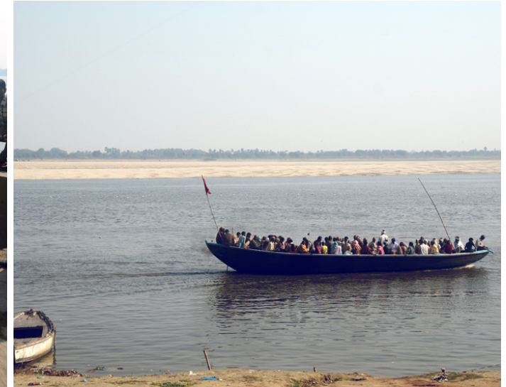
Diesel engine boat, with devotees on a tour across the Ghats.