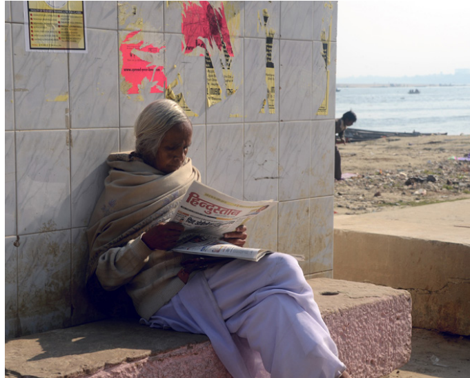
An old lady reading newspaper.