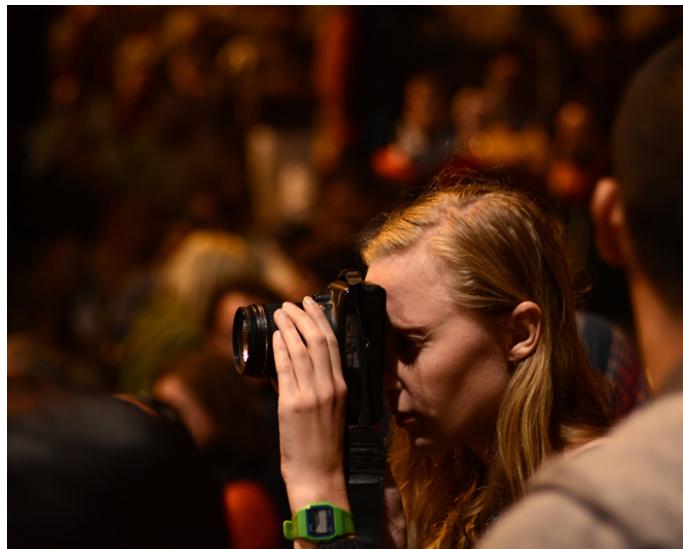
Foreigners can be seen photographing, the spiritual event.