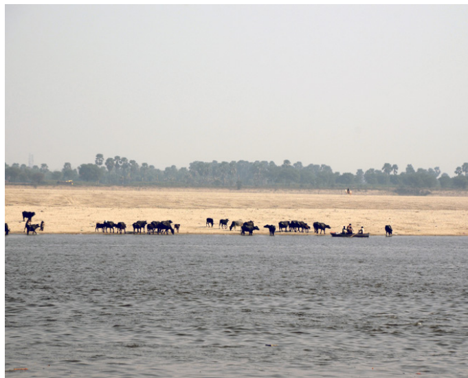
Buffaloes grazing at the opposite bank of the river.