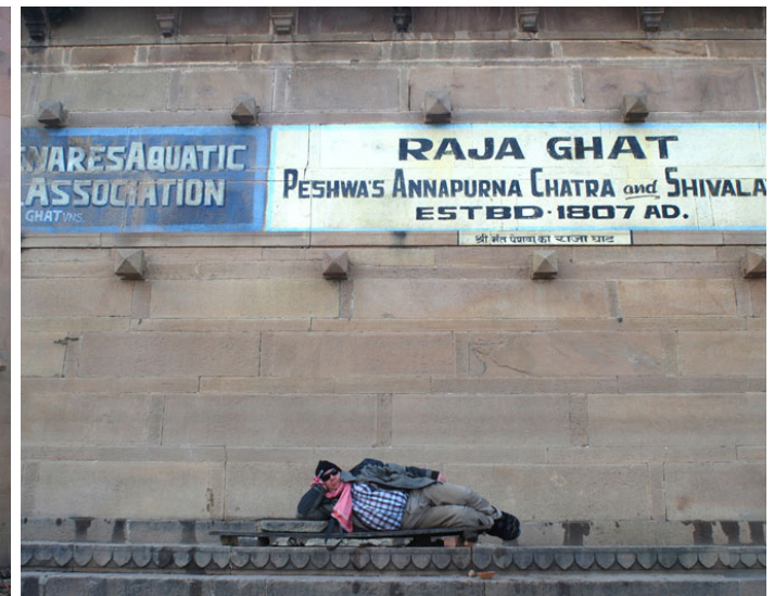
A man relaxing at Raja Ghat.