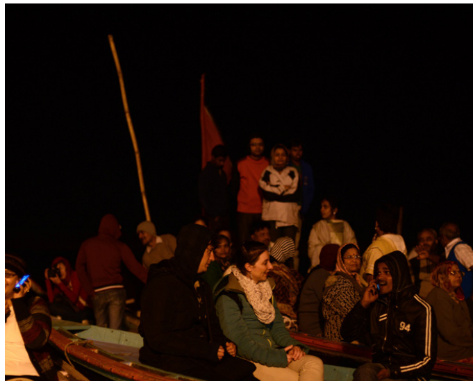
People on the boat.