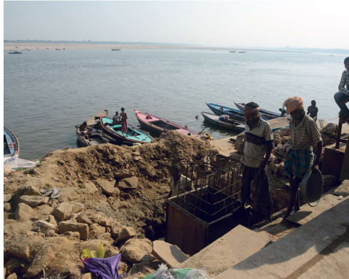
A glass factory in Firozabad industrial area.