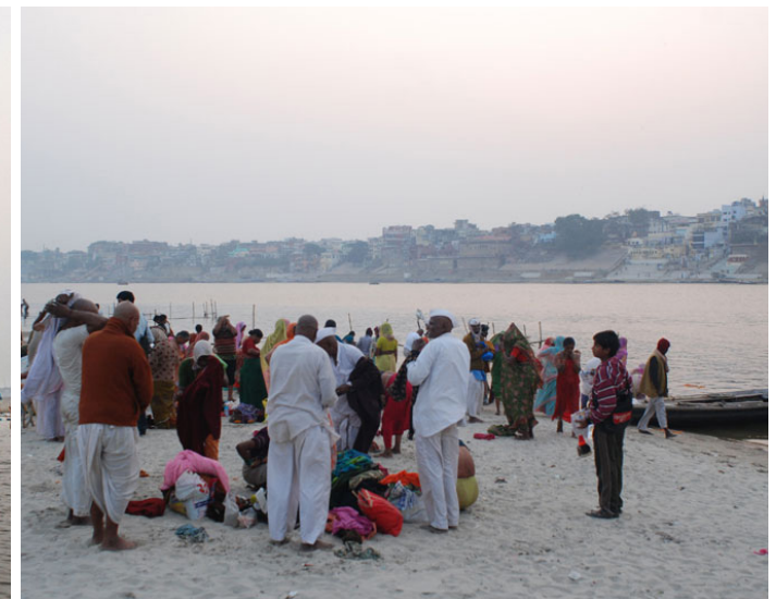
Devotees performing prayers.