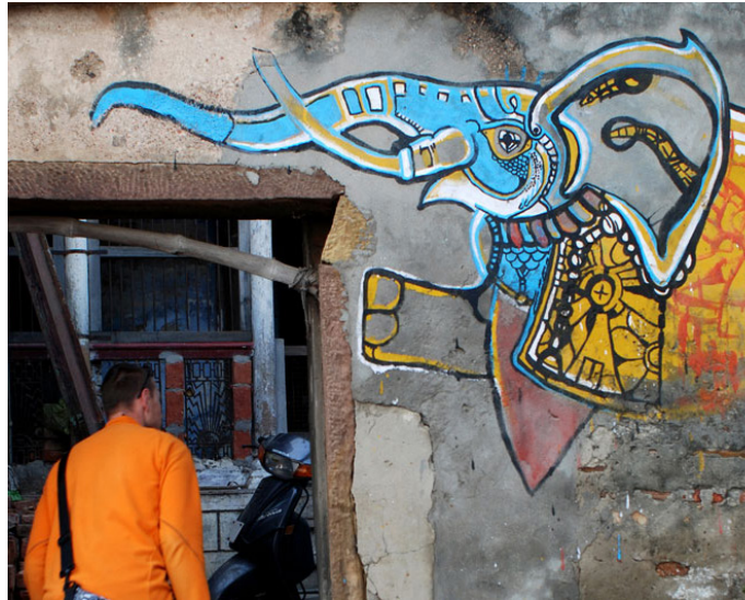
Illustration of a colourful elephant at an entrance.

http://www.dsource.in/resource/ghats-varanasi/life-ghats