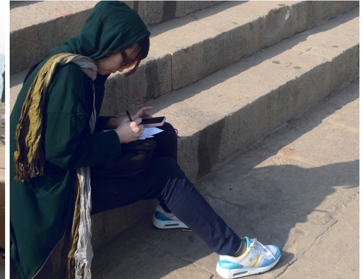
Girl writing notes of the places to be visited.