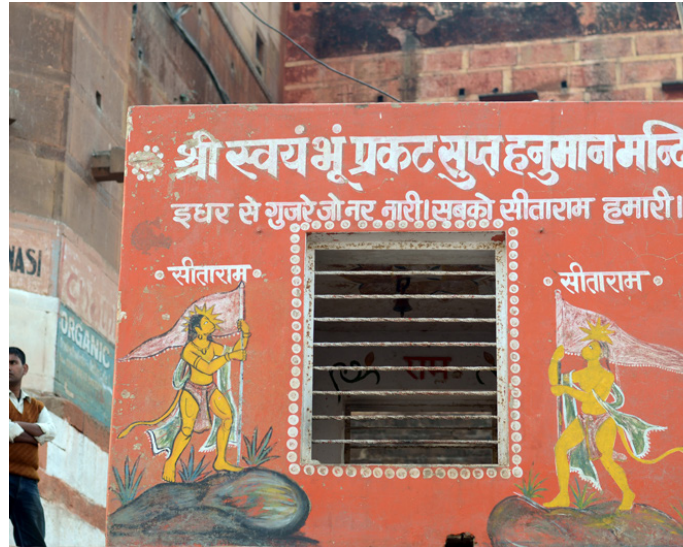
Mythological illustrations on small temple

http://www.dsource.in/resource/ghats-varanasi/life-ghats