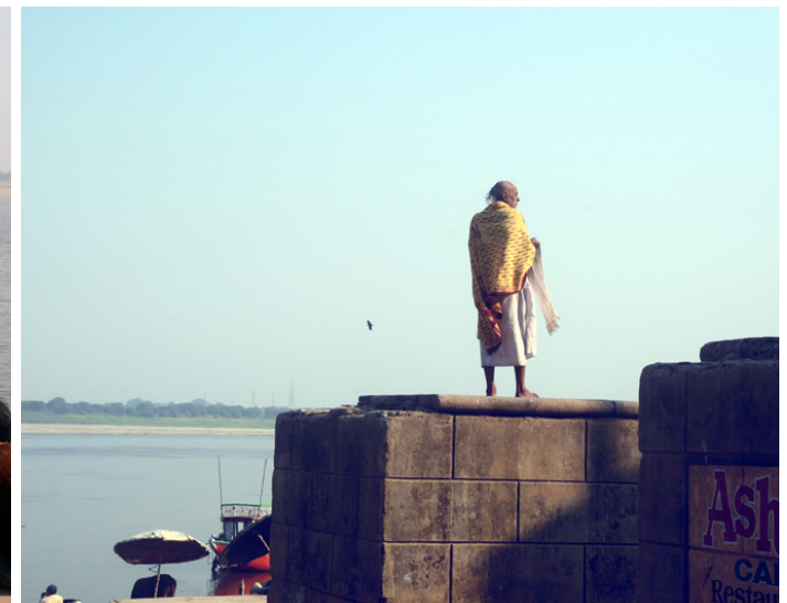
A priest preparing for evening aarti.