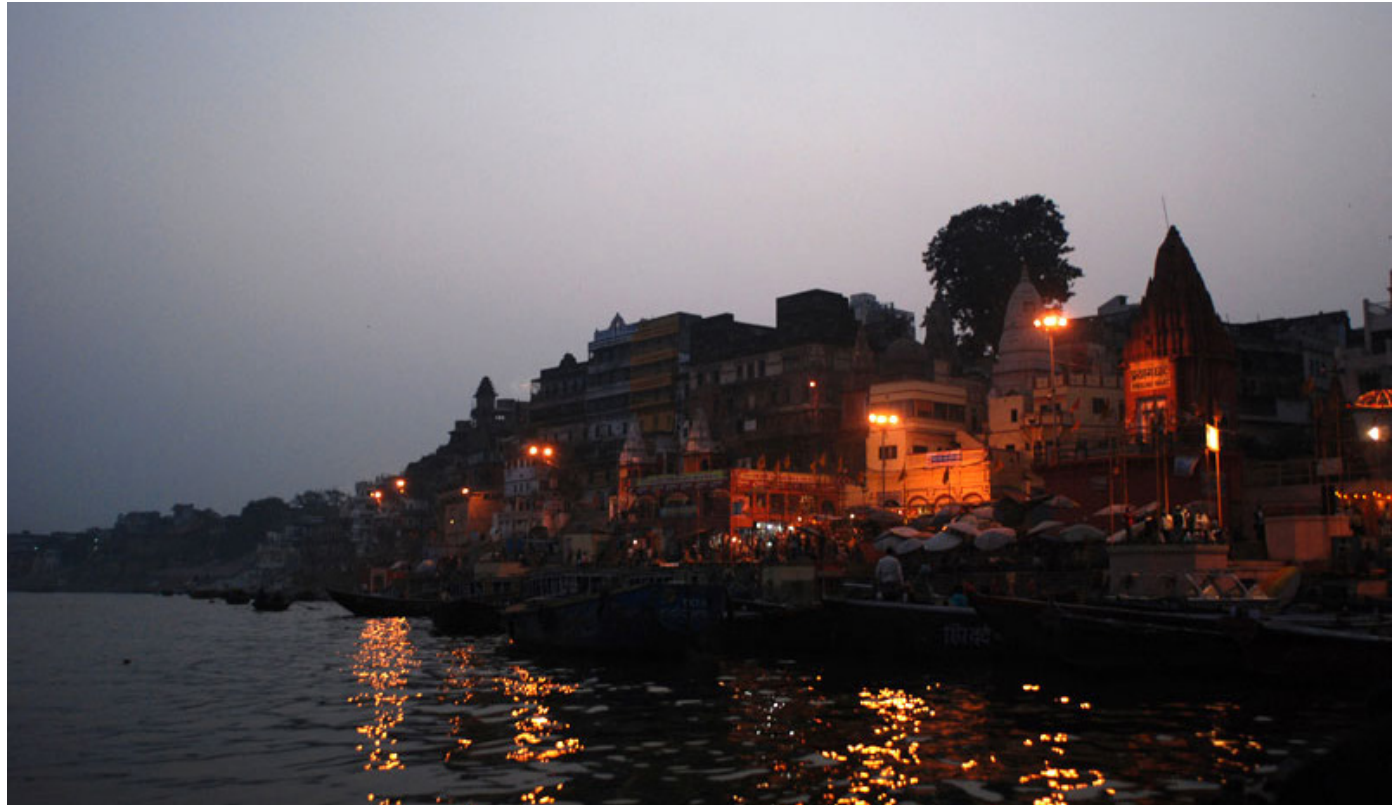
Ghat illuminates in the evening.