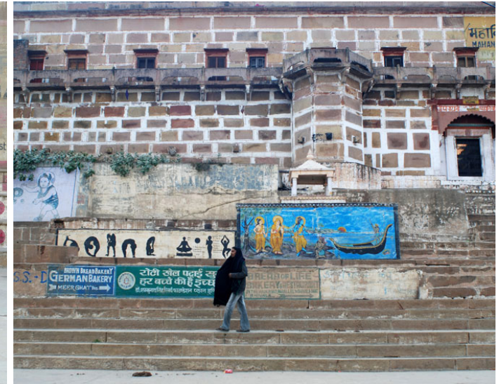
Assortment of different cultural graffiti at the ghat.