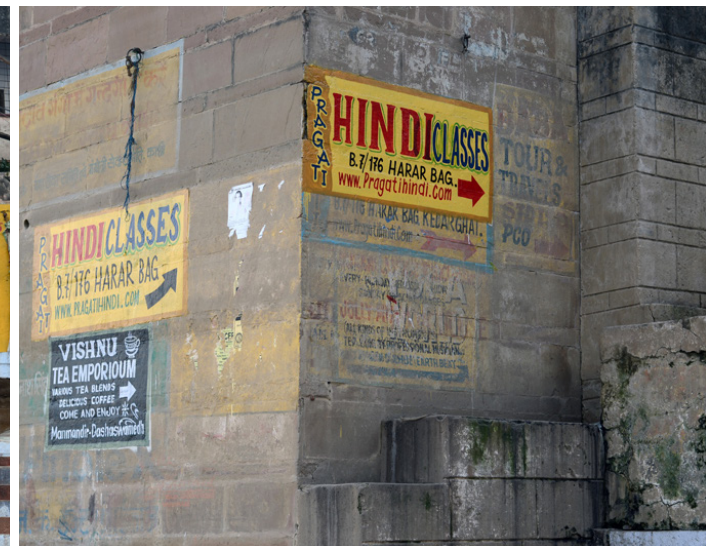
Advertisement for Hindi classes.