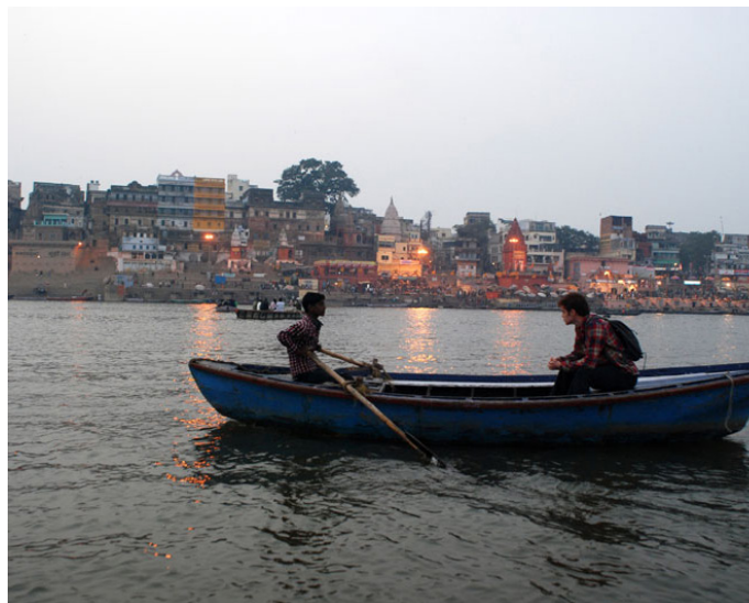
Few individuals prefer to hire small boat.