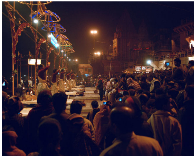
Slowly the crowd gathers.