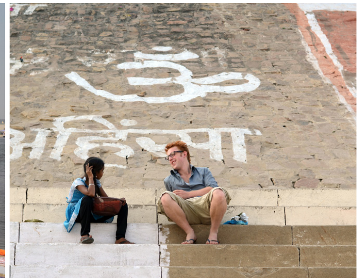
Conversation of two strangers.