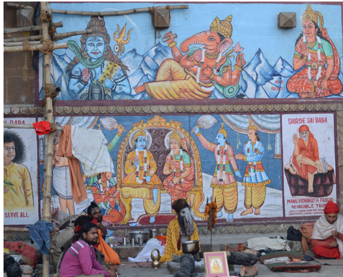
Saint with devotees practising meditation.

http://www.dsource.in/resource/ghats-varanasi/life-ghats