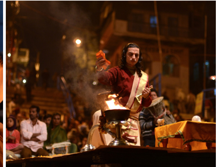
Priests performing prayers.