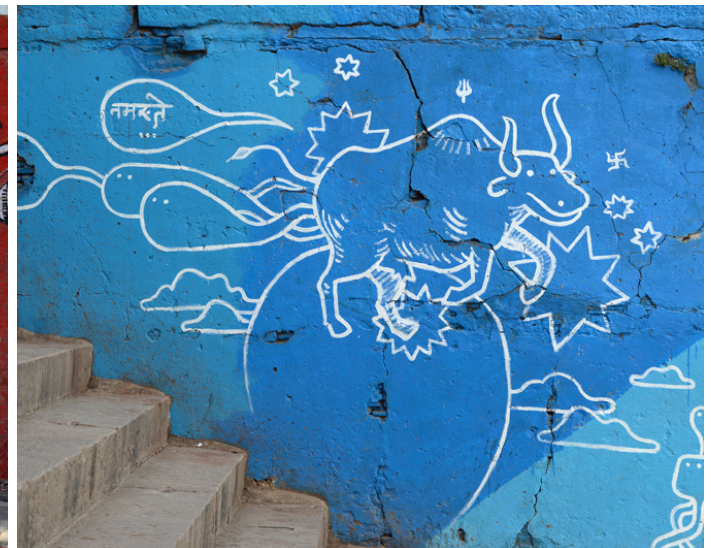
Illustration by local foreigners.