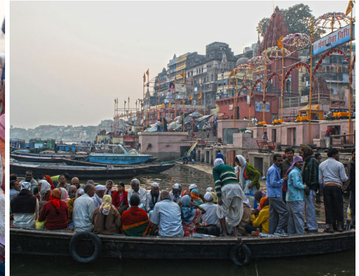
People enjoying the boat ride.