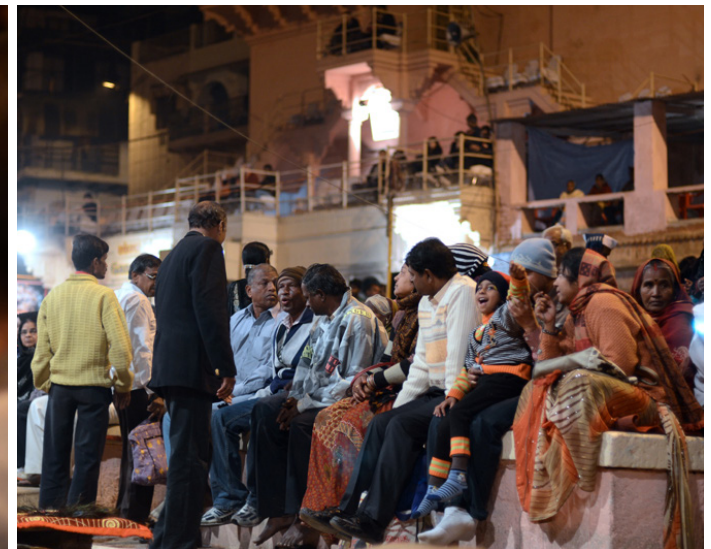
People witnessing prayers.