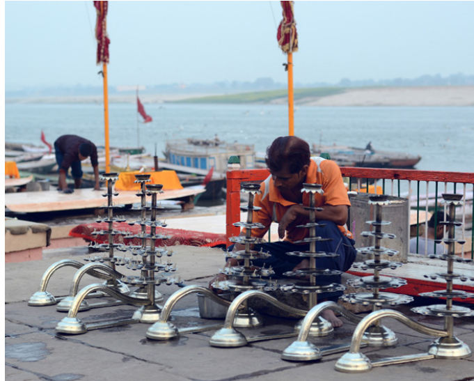
Setting up traditional oil lamps.