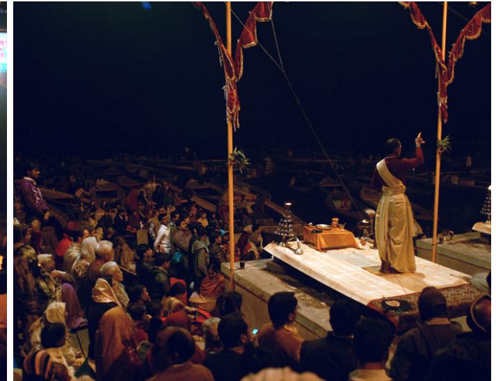
Holy prayers and chants witnessed by a huge crowd.