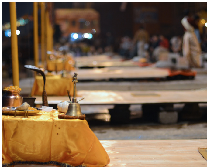
Final preparations for the prayer ceremony.