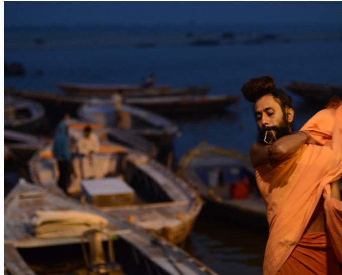
Priests dress up for the evening prayer.