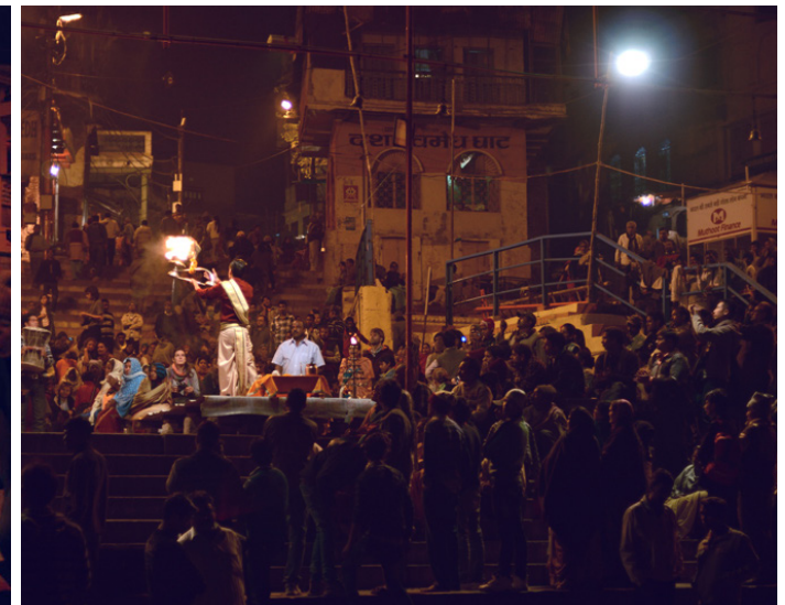
View of prayers from a boat.