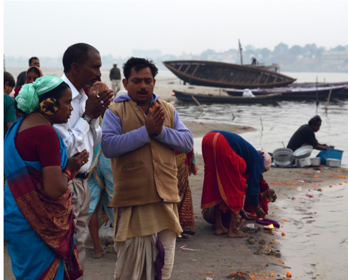
Priests performing prayers for devotees.