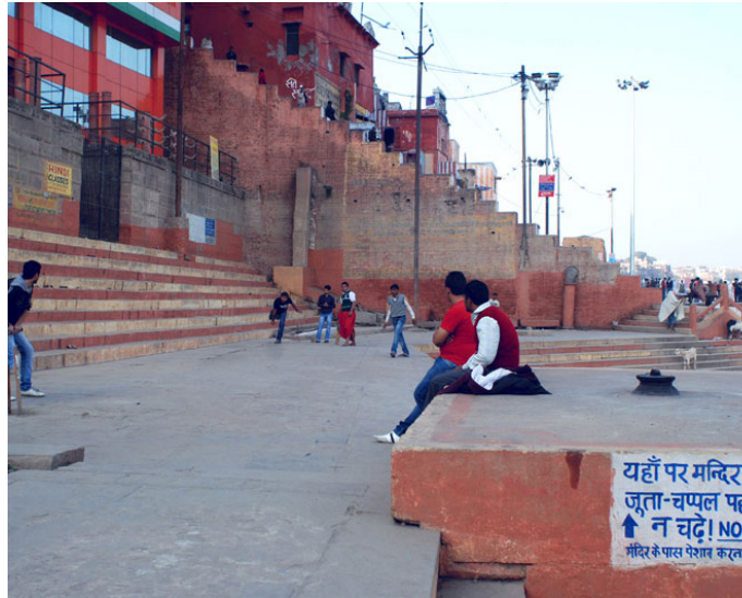
Kids playing cricket.

http://www.dsource.in/resource/ghats-varanasi/life-ghats