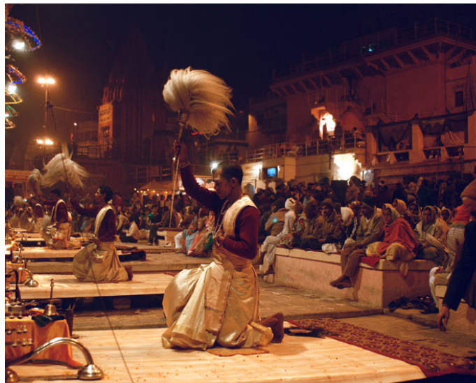
Priests performing sacred prayer.