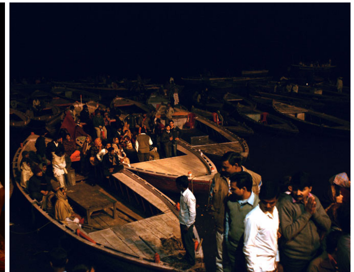
Crowd on Ghat stairs.