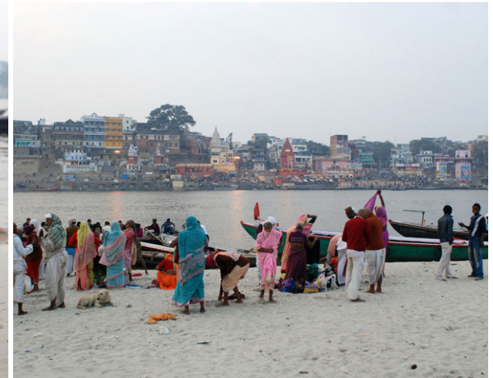
Huge crowd performing prayers.