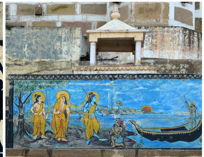
Graffiti on wall, showing mythological stories.