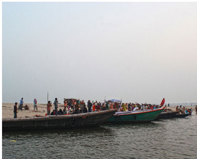
Boats reach the other side of the river.