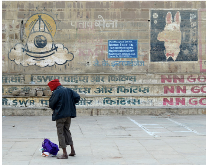
Graffiti at the Ghat.

http://www.dsource.in/resource/ghats-varanasi/life-ghats