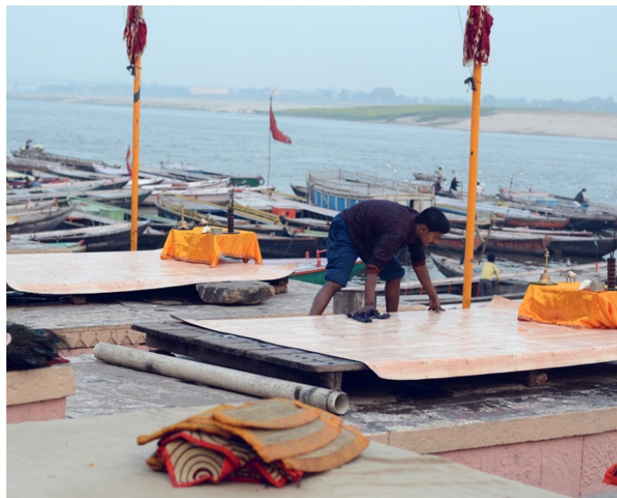
Cleaning and placing mat for evening procession.