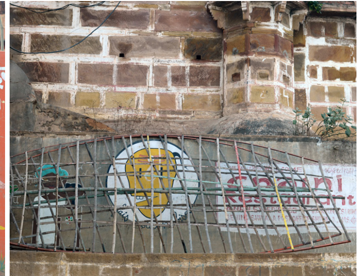
Graffiti on walls.