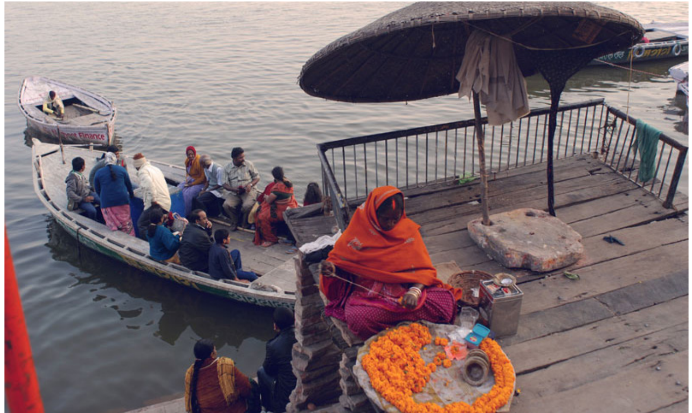
Flower shop at the Ghat.

Mythological figures illustrated on walls of the Ghats coexists with the advertisements and self expressing graffiti, is an uncommon view. Tourists enjoying their time, devotees offering prayers, graffiti on walls, fishing, various stalls or shops etc. all can be seen at one place itself.