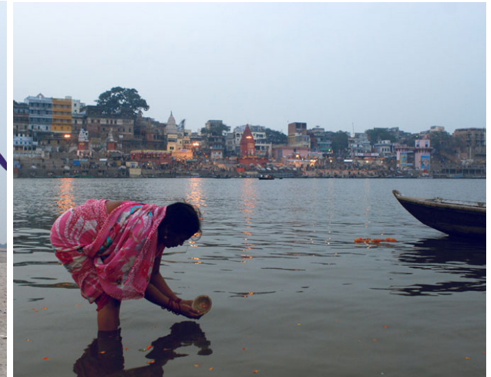
A few perform prayers in solitude.