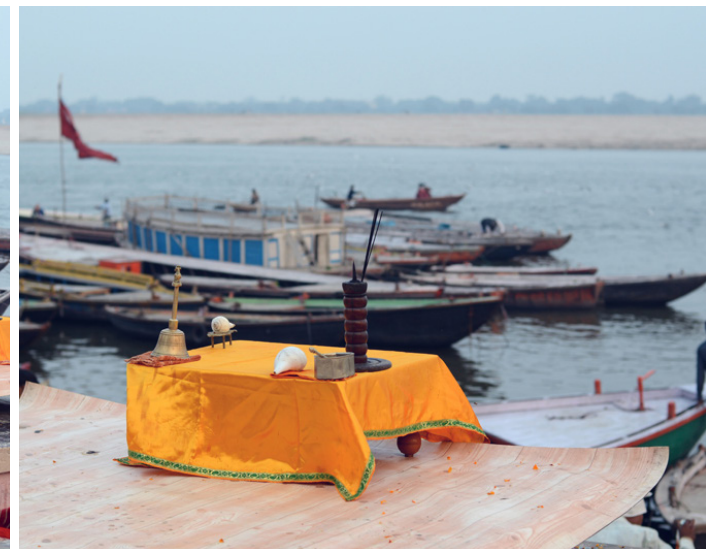
Cleaning and placing mat for evening procession.