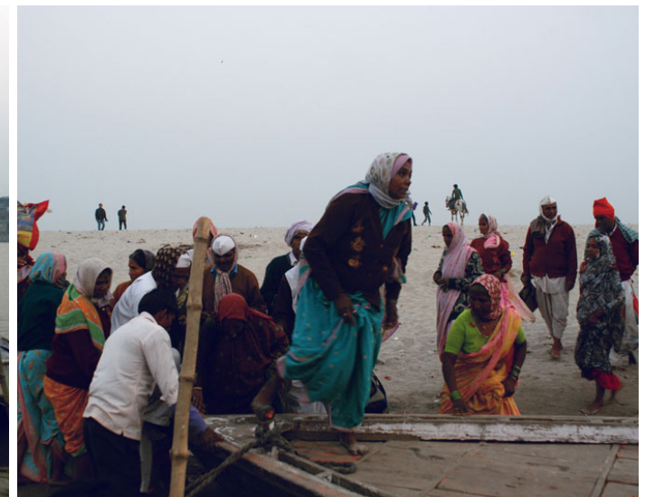
Devotees boarding back on boats.