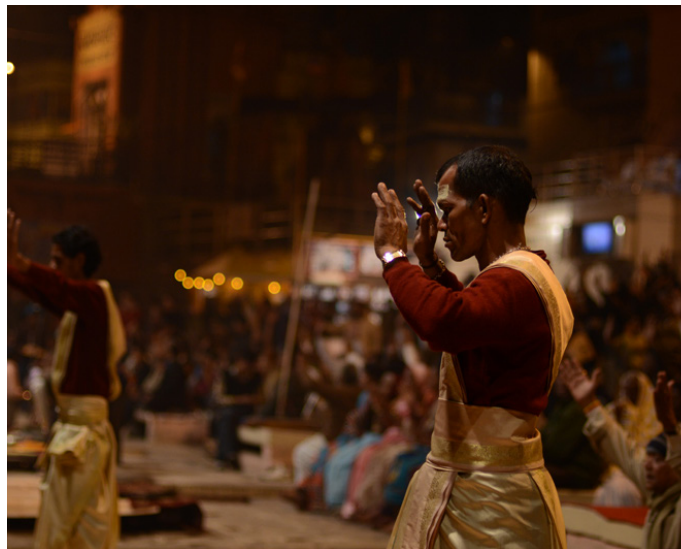
Prayer ends with final chants.