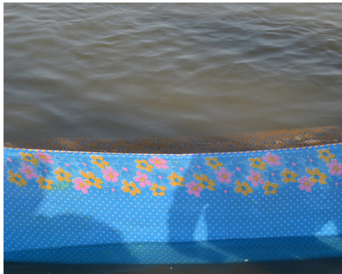
A saree being used as fishing net.