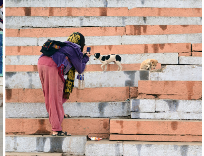
A few busy in capturing photographs at Ghat.