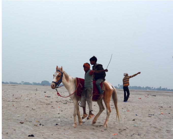
Kite flying on the river banks.