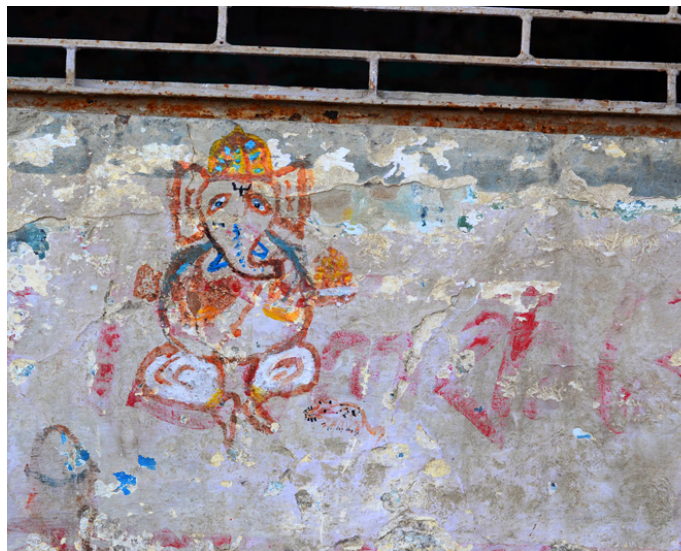
Illustration of Lord Ganpati.