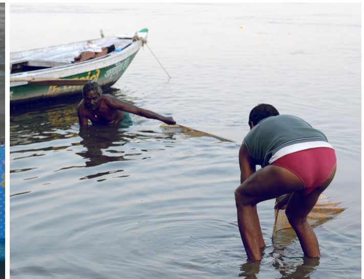
A saree being used as fishing net.