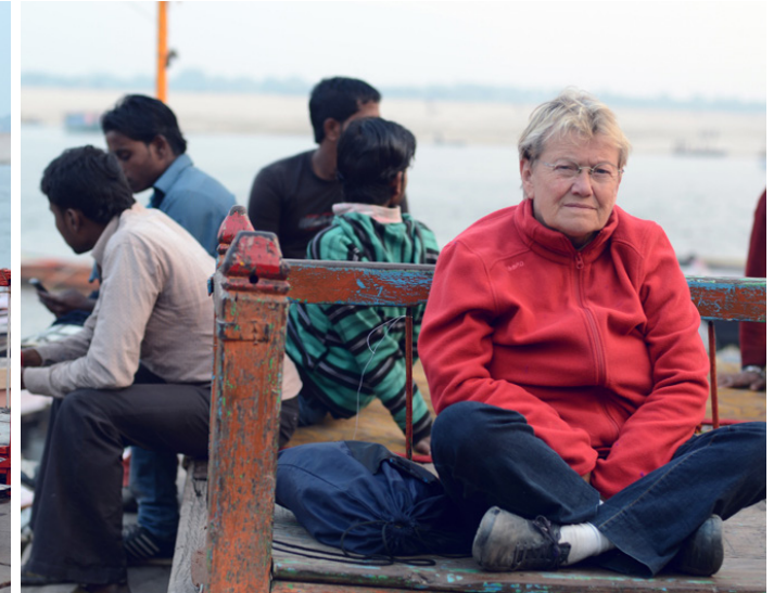
Lady waiting for the evening prayer.