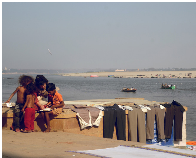
Learning time at the Ghat.