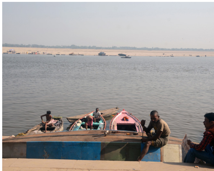
Repairing boat at the Ghat.