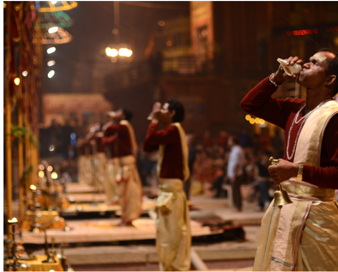
Priests blow the conch shell.