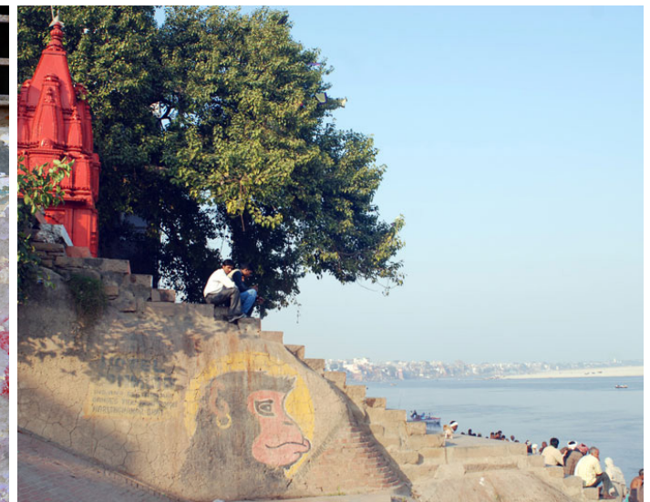
Illustration on the temple.