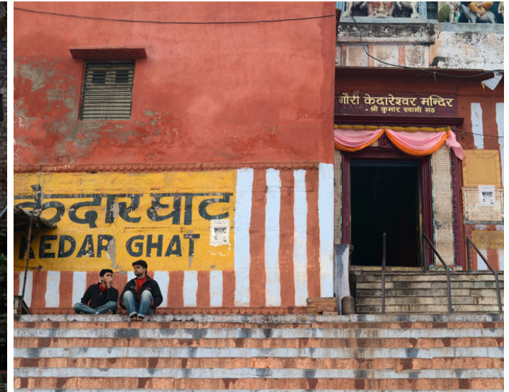
People sitting on the staircase of Kedar Ghat.