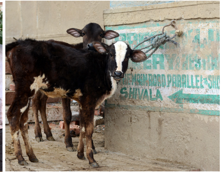
Calves tied at Ghat.