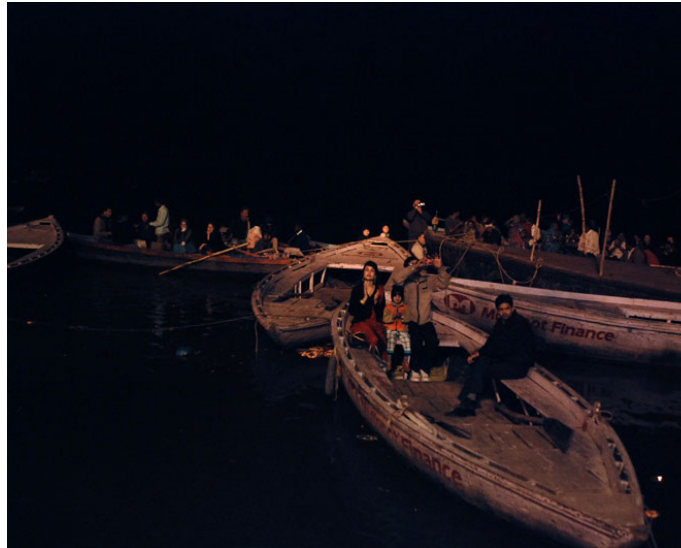
Families on a boat.