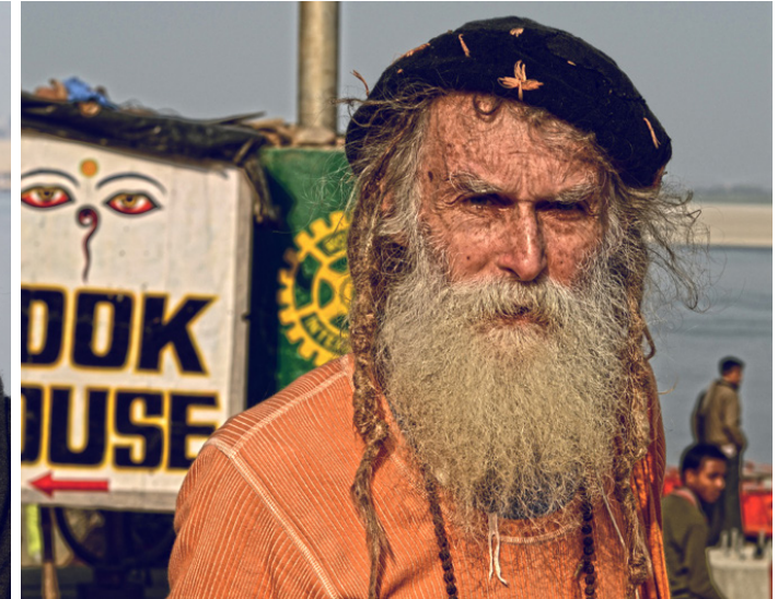
An old man tinted in Varanasi colours.