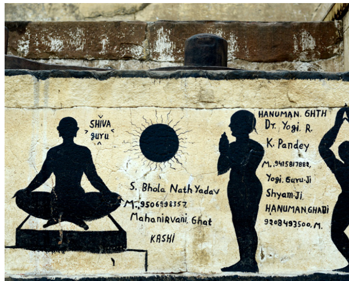
Yoga drawings with address.