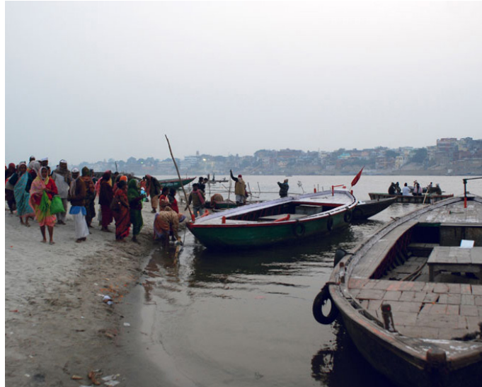
While rest of the boats wait for their passengers.