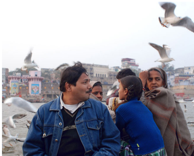
People enjoying the boat ride.