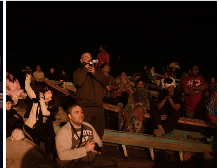
Foreigners capturing the event in their cameras.