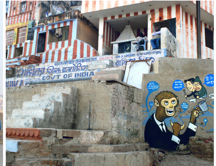
Restaurant advertisement on a wall.