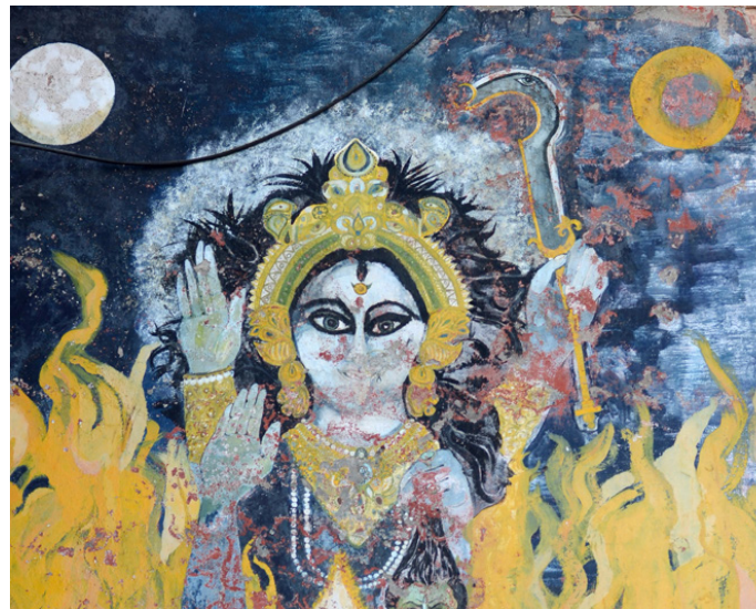
Illustration of Goddess Kaali on a wall.