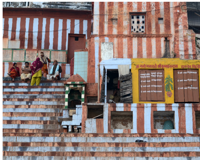
Staircase leading to the temple.