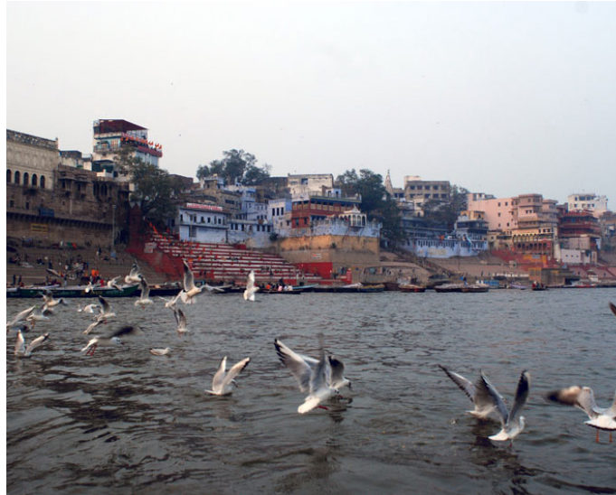
Birds flying over the river.