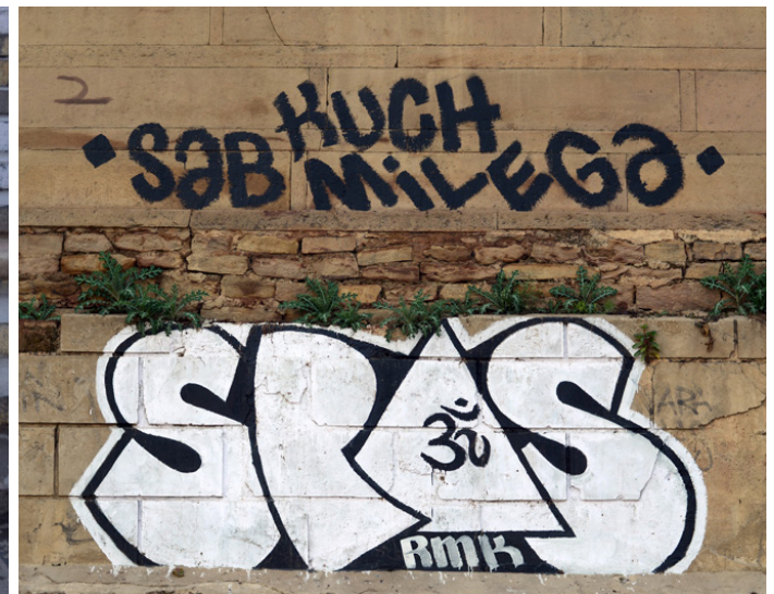
Huge Graffiti on the walls of the Ghat.