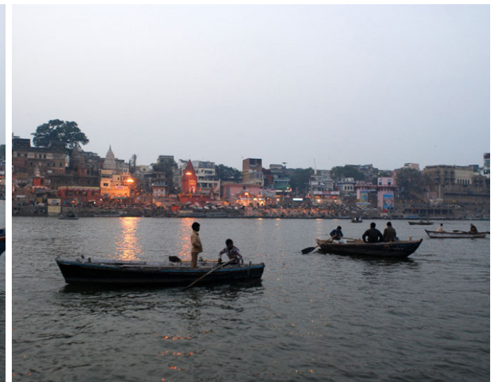
All the boats row towards the main Ghat.