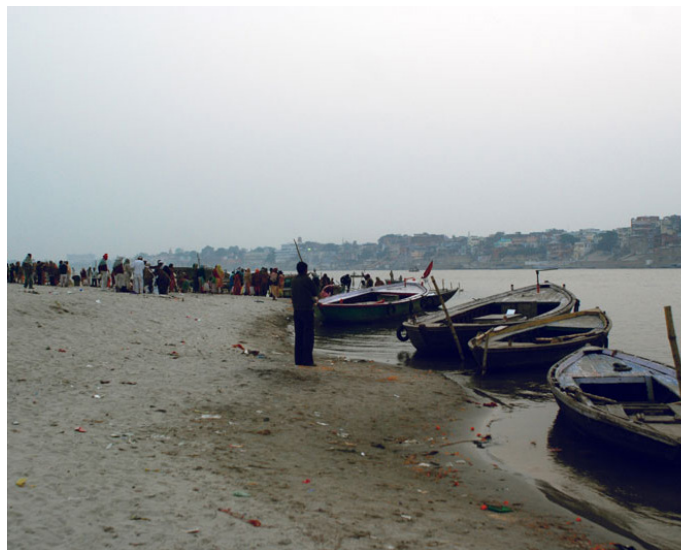
Fleet of boats await for the devotees.