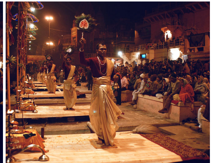
Prayer, called 'Ganga Aarti' goes for an hour and half.