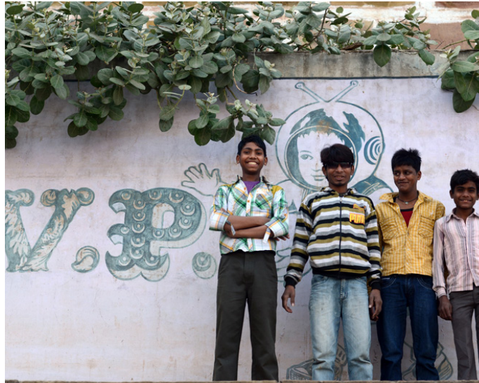
Youth at Ghat.

http://www.dsource.in/resource/ghats-varanasi/life-ghats