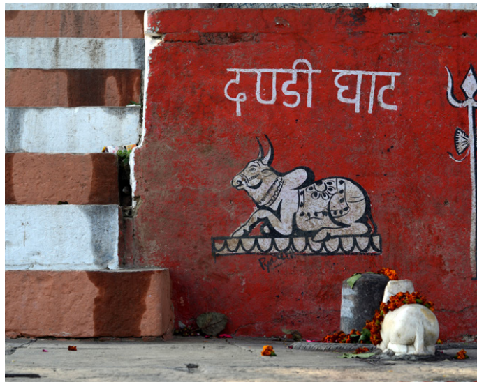
Daandi Ghat illustration.