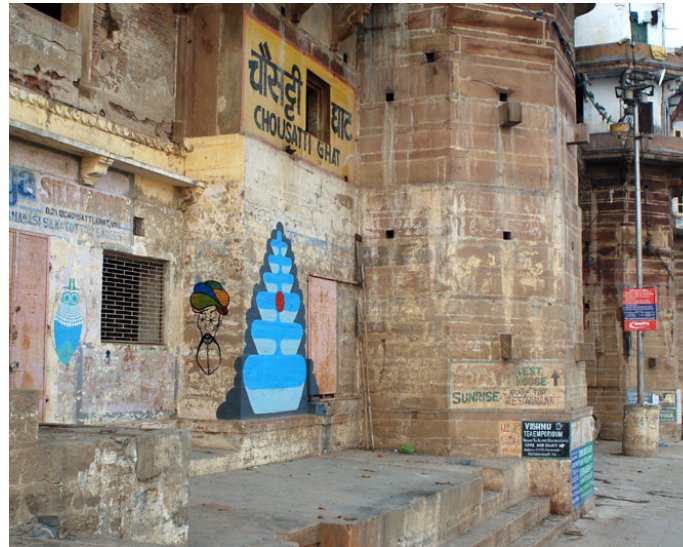
Illustration on Chausatti Ghat.

http://www.dsource.in/resource/ghats-varanasi/life-ghats