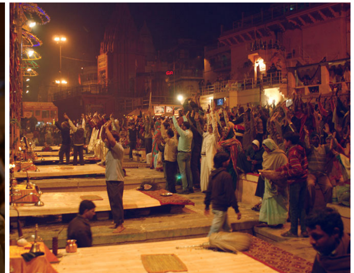
Devotees follow the priests for final chants.