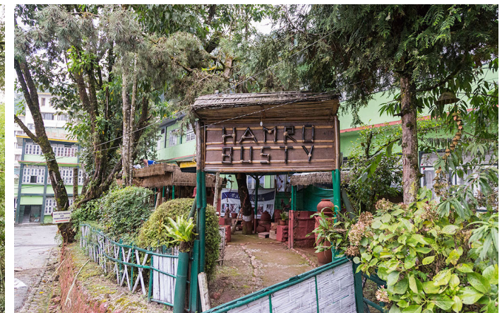
Bamboo exhibition at directorate of handicrafts and handloom.