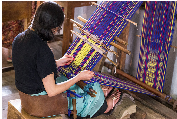
An artisan working on a weave.