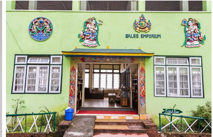
Sales emporium which sell all the items produced at DHH, Gangtok.