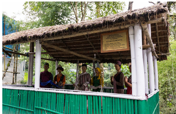
Mannequins wearing traditional tribal costumes.