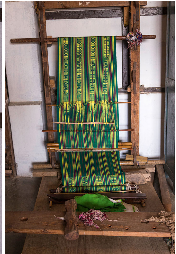
Lepcha weave, thara on a vertical loom.