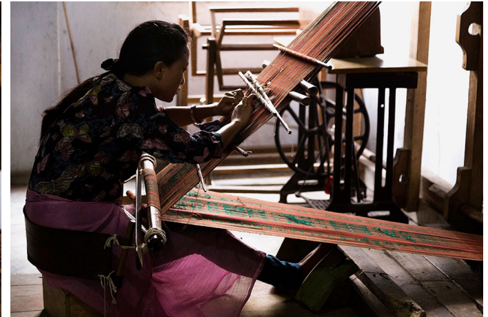
An artisan working on a weave.