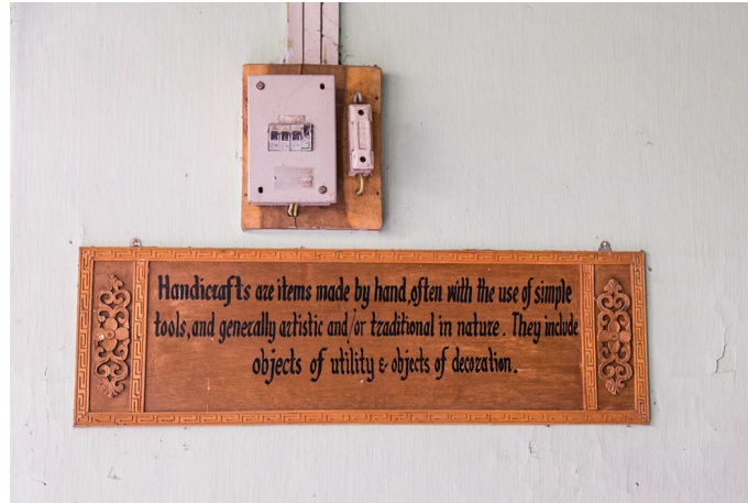
Plaque installed in corridor of directorate of handicrafts and handloom.

http://www.dsource.in/resource/handloom-sikkim/place