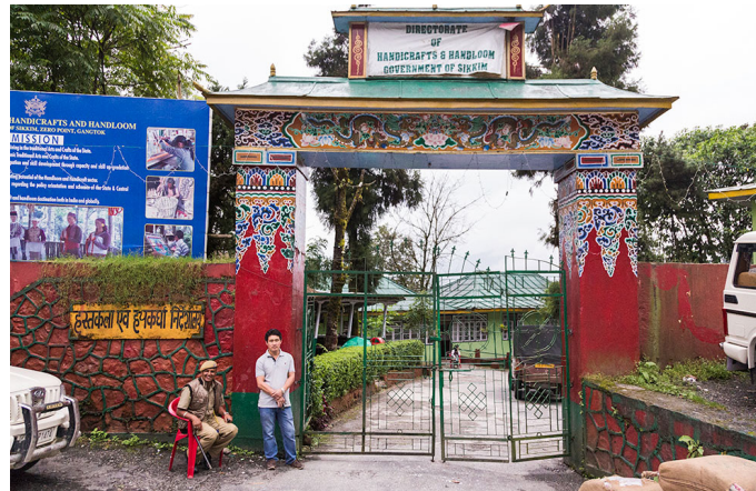
Directorate of handicrafts and handloom head office at Gangtok.

Sikkim is 2nd smallest Indian state located in the north-east India. Sikkim chose to remain independent when India got independence in 1947. In 1975 it became the 22nd state of India after a treaty with the then Prime Minister of Sikkim. Sikkim has been very successful in protecting its cultural heritage along with embracing the modern ethos. The state has a very diverse flora and fauna and occupy a special place in India for it.