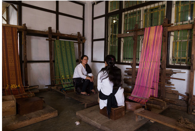
Artisans taking a break from work at DHH, Gangtok.