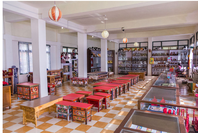
Inside the sales emporium at DHH, Gangtok.