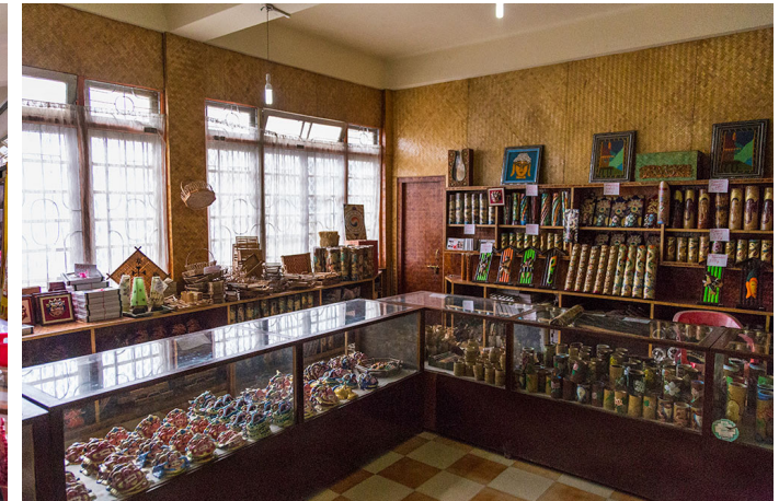
Sales emporium selling wood and bamboo products.