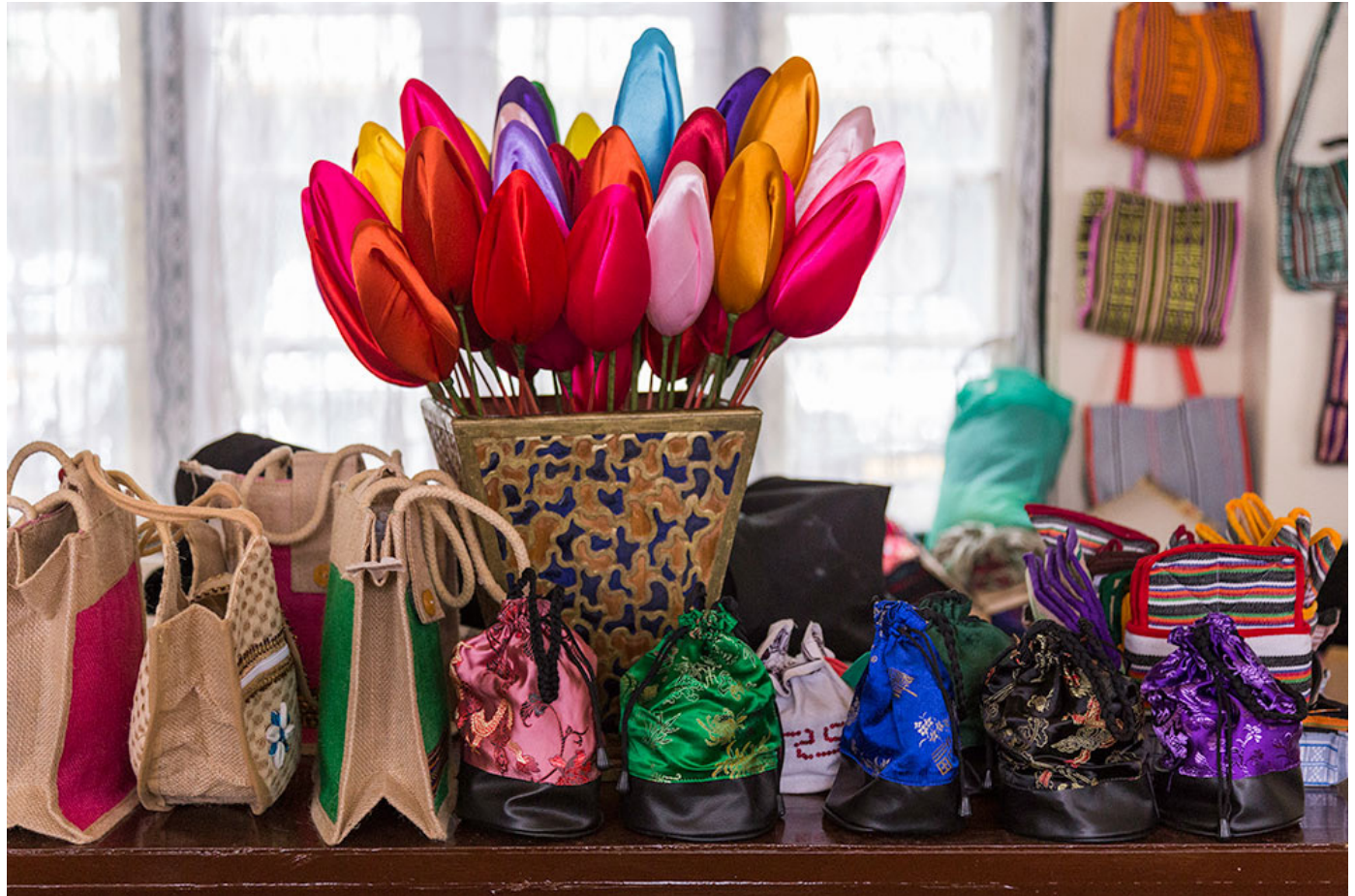
Handbags, lens bag and flowers at sales emporium.