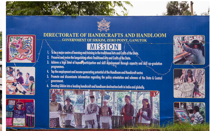
Hoarding explaining the mission of directorate of handicrafts and handloom.