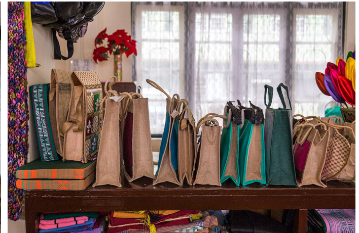
Handbags sold at sales emporium at DHH, Gangtok.