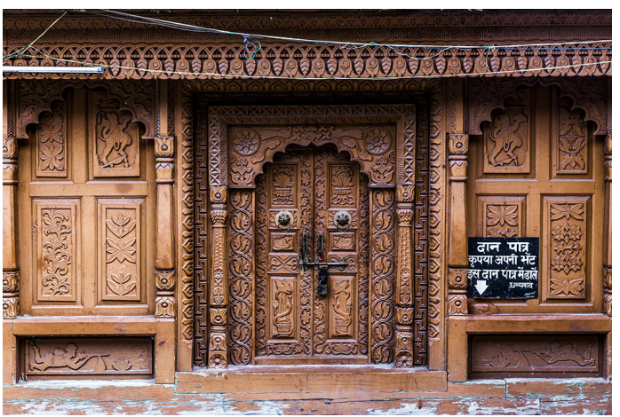
Gate of the temple.