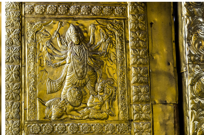
Metal-work showing Goddess Kali.