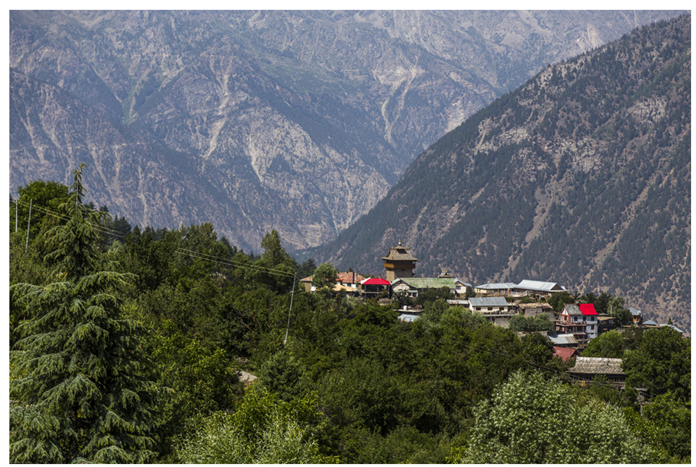
Kalpa village with apple orchards and deodhar trees.

Kalpa is situated at a height of 2960m, on the west of river Sutlej. It was once the district headquarter of Kinnaur which was later shifted to Reckong Peo due to its good connectivity and extreme weather conditions of Kalpa. Kalpa gives you opportunity to witness amazing views of Kinner-Kailash, mythically considered as the winter home of Lord Shiva. The Kinner-Kailash range is famous for its 79 feet high stone, resembling a Shivaling, which changes colours through the day. As the entire administration has been shifted to Reckong Peo, the atmosphere at Kalpa is peaceful and laid back. The region is full of apple orchards, woods, picturesque villages and hamlets.