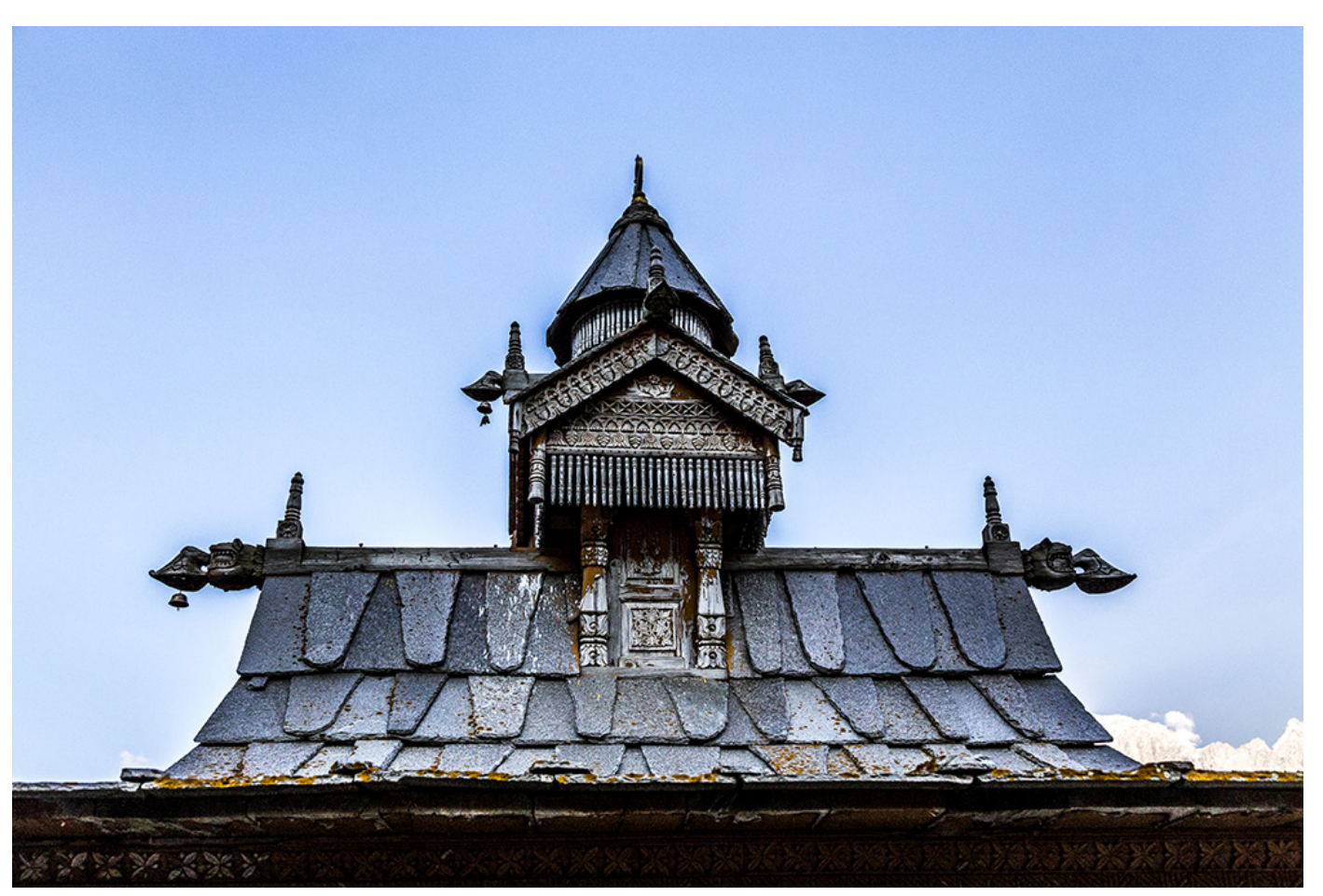
Roof of slates.