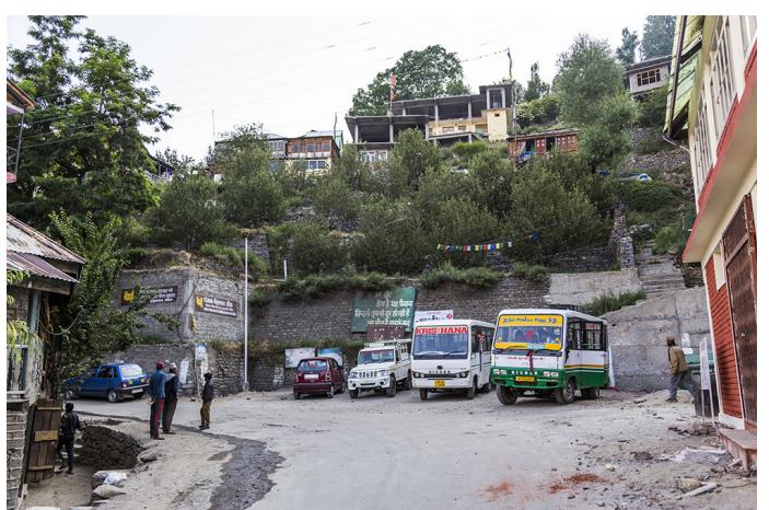
Bus stand at Kalpa village.