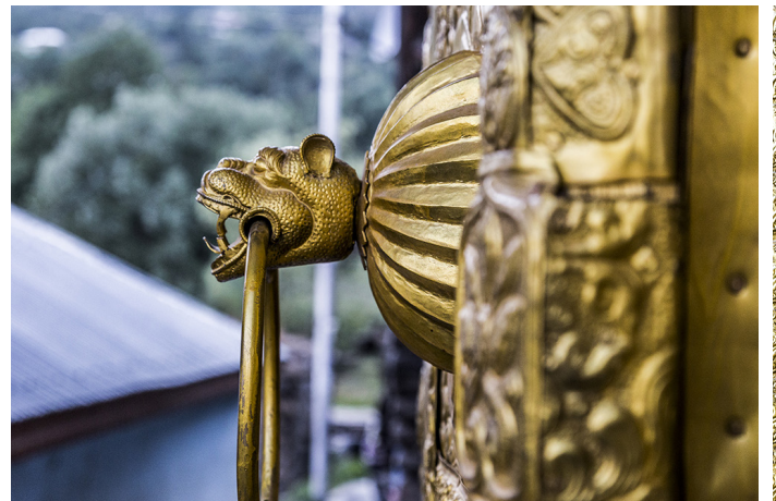
Metal-work on the gate.