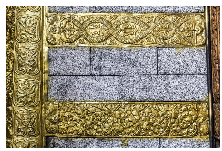
Metal-work with snakes.