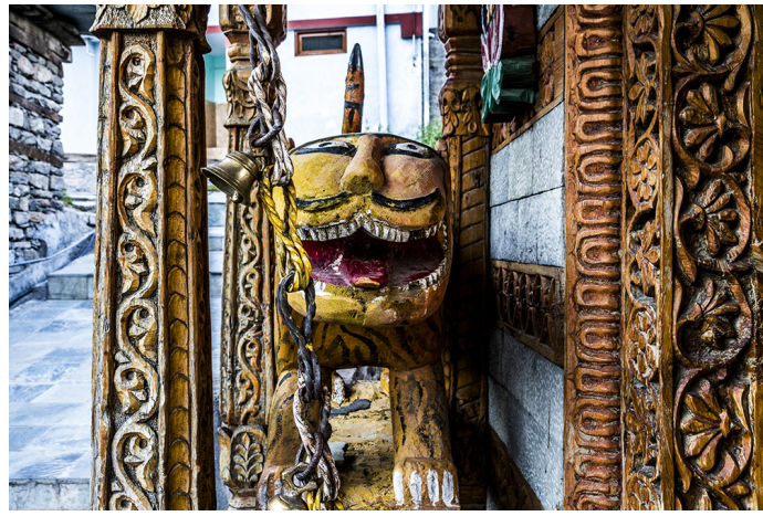
Tiger carved out of wood.