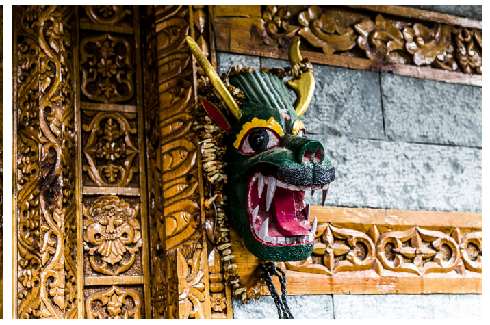
Snake/dragon carved out of wood.