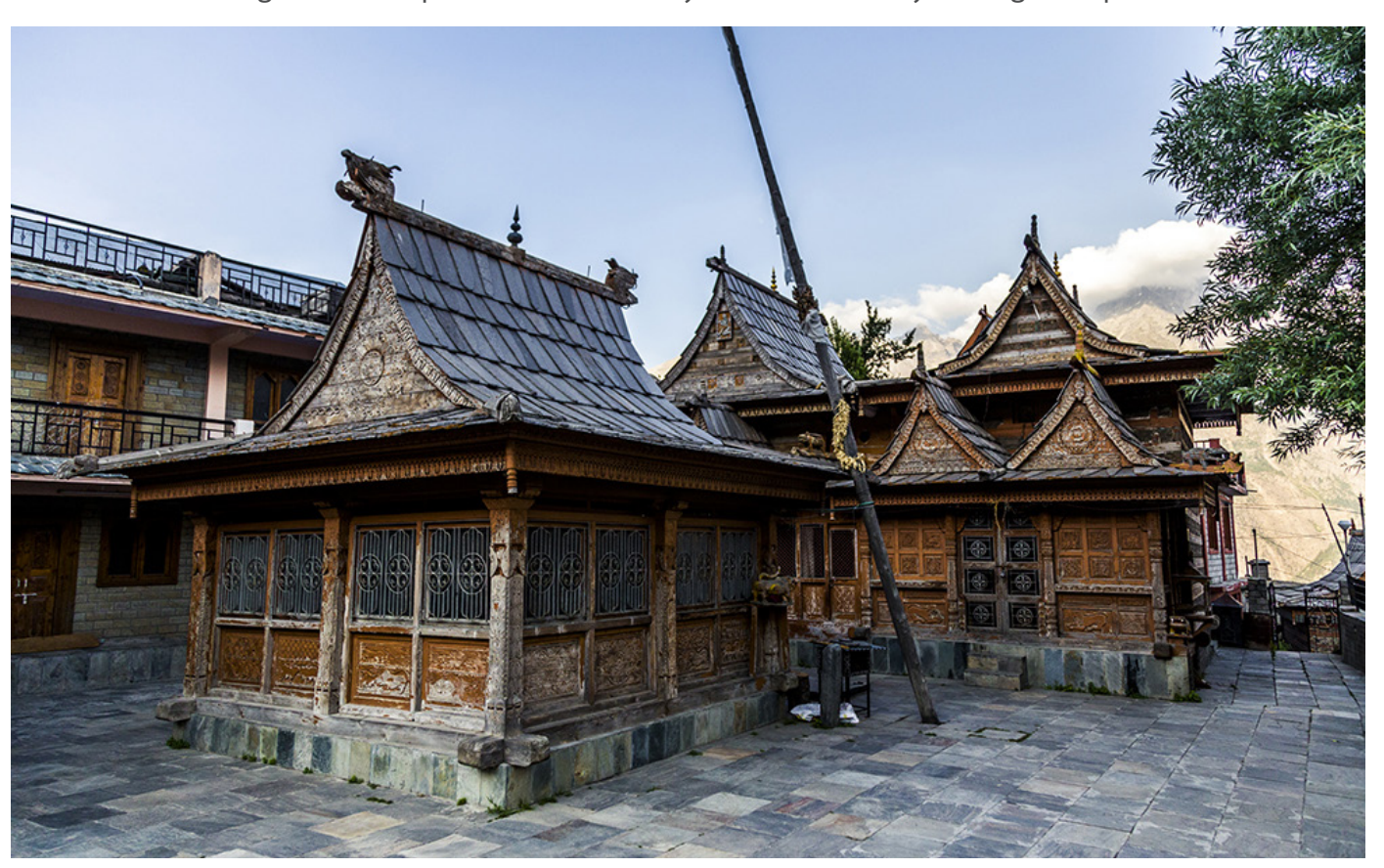
Hindu temple at Kalpa.

The temples at Kalpa are not so high, when compared to their counterparts in surrounding villages. They show detailed woodwork involving visuals of cows, local wildlife and local symbols. The first temple has two wooden carved snakes on its gate. The temples are often called by the name of Narayan-Naagin temple.