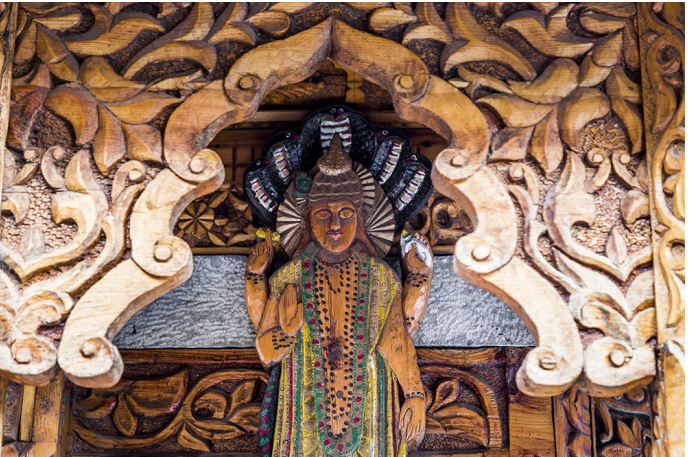
Wooden sculpture of Vishnu.