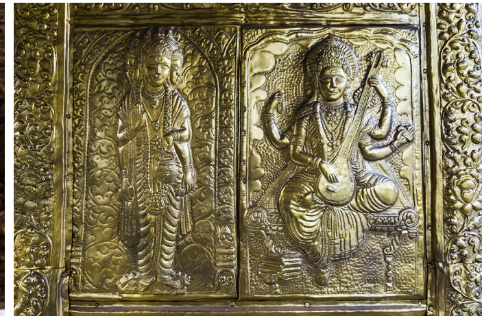
Metal work in gold on the gate of temple.