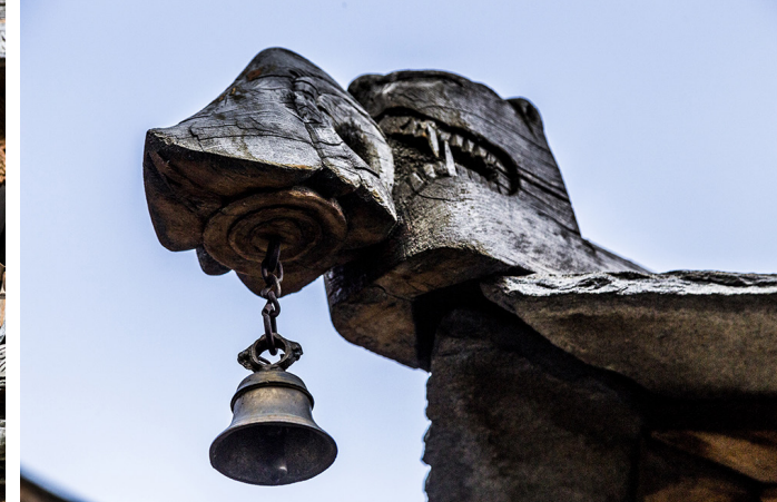
Wood-work in the hindu temples at Kalpa.