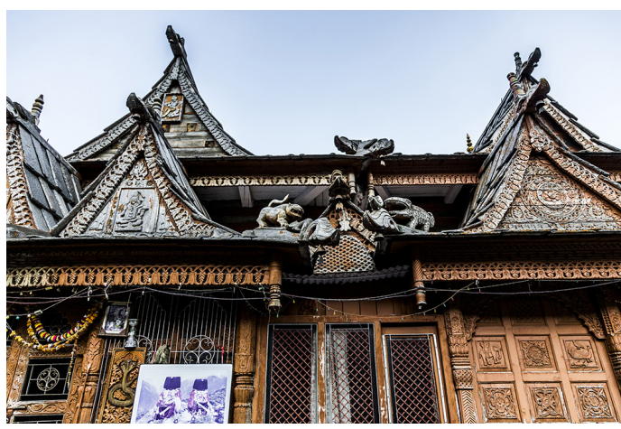
Temple with photograph of Devi hanging outside.