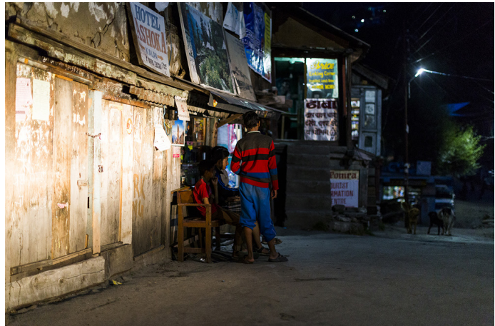
Kalpa town center at night.