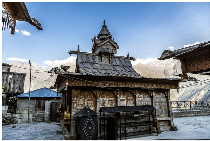
Temple against the backdrop of Kinner-Kailash range.