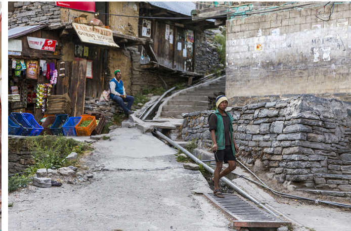
Town center of Kalpa village.