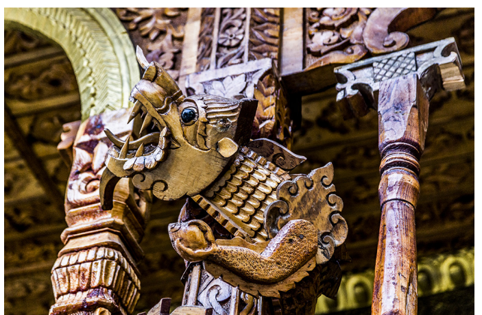
Snake/dragon carved out of wood.