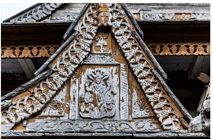
Wood-work in the hindu temples at Kalpa.