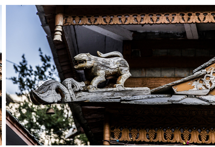
Wood-work in the hindu temples at Kalpa.