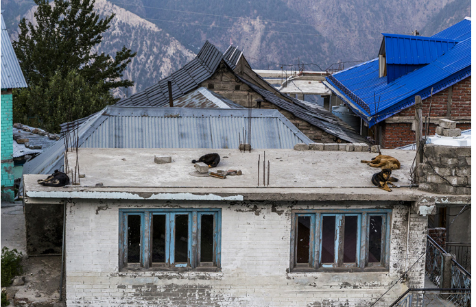
Dogs sleeping on a roof.