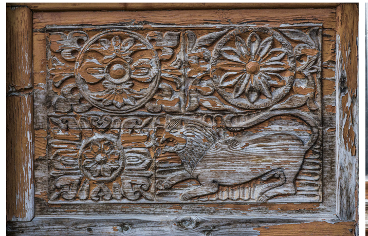
Wood-work in the hindu temples at Kalpa.