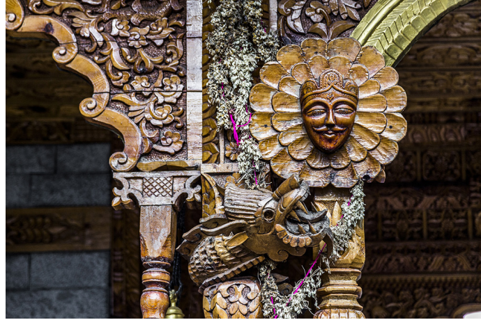
Wood-work done on the gate of hindu temple.