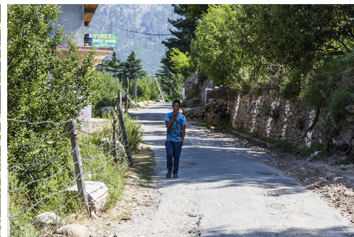
Road leading to Roghi village.