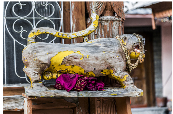
Wood-work in the hindu temples at Kalpa.