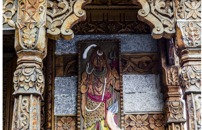
Wooden sculpture of Shiva.