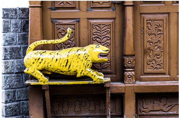
Wooden tiger outside the temple.