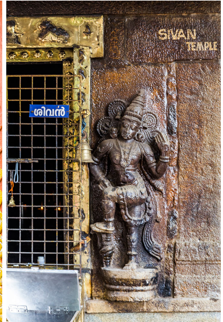
A stone statue at Shiva temple.