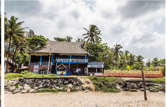
Shacks along the beach.