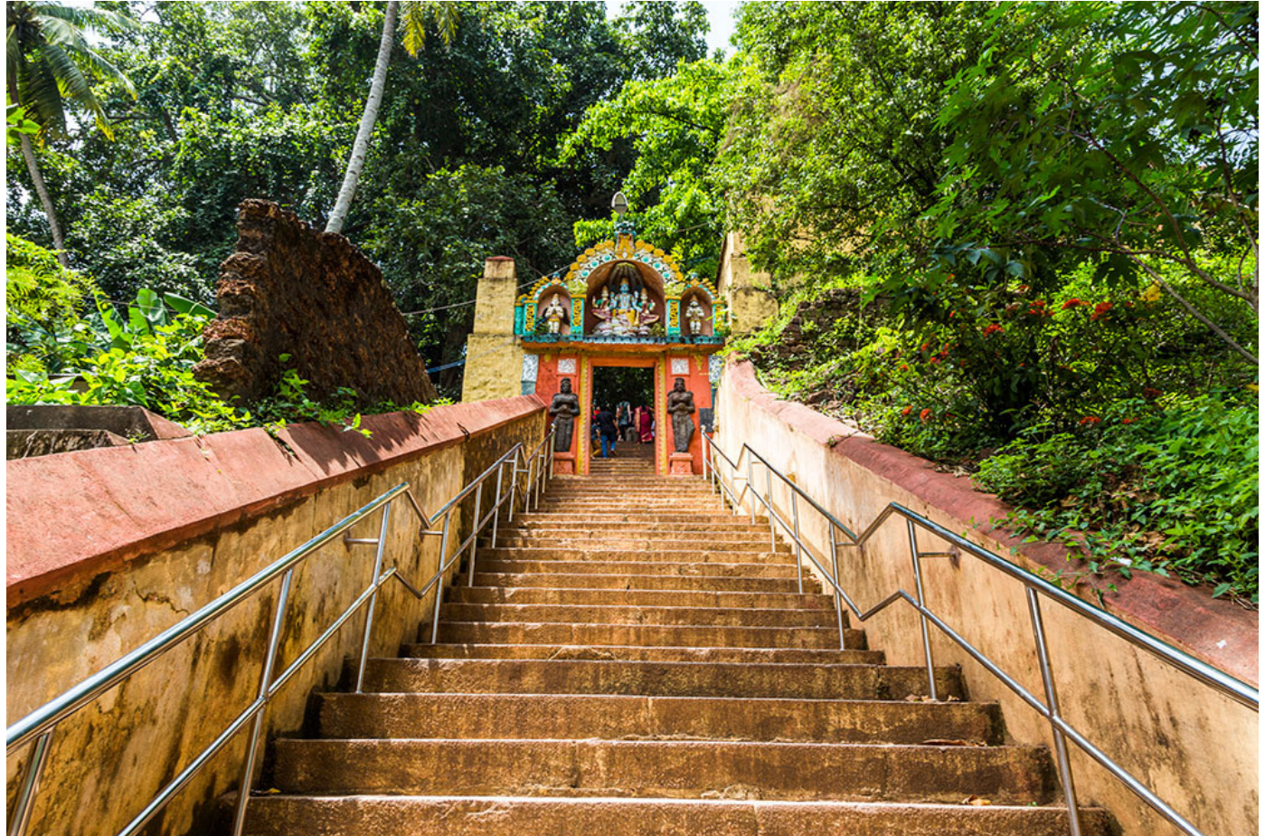
Stairs to the temple main entrance.