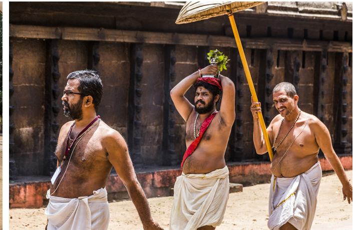
Main priest performing the prayer ceremony.