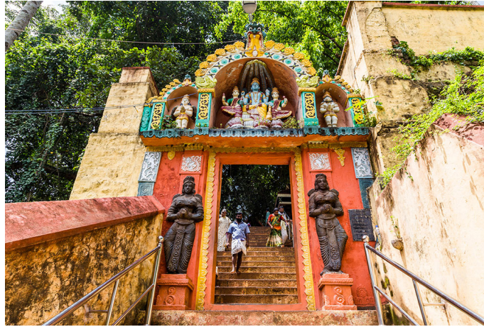
The entrance to the temple.

http://www.dsource.in/resource/janardanaswamy-temple-varkala/place