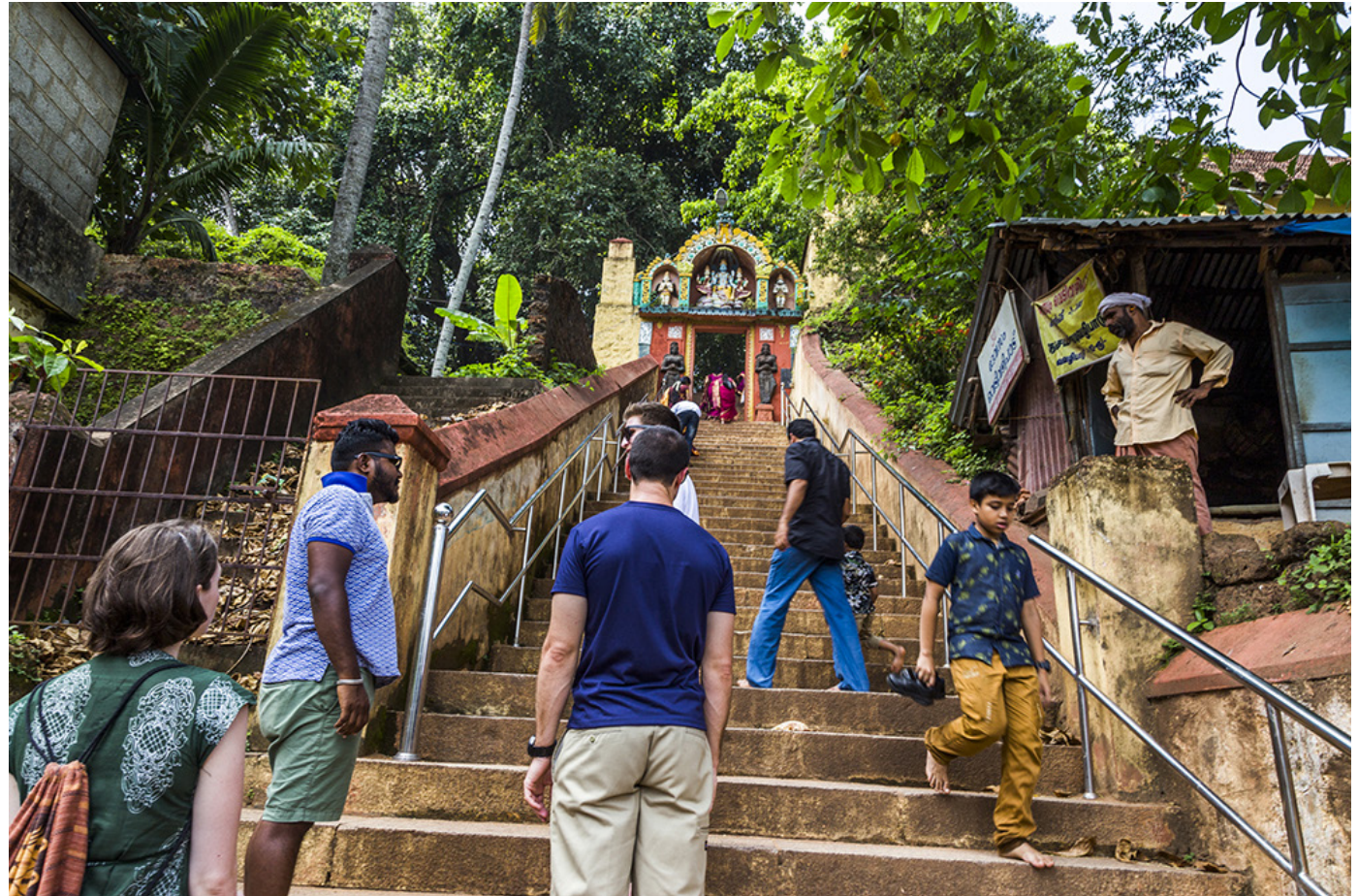
Devotees and tourists walking up the stairs of the temple entrance.

People of Varkala are conservative in religious affairs yet modern in social issues. Kerala has one of the highest literacy rate in the country. Yet there are strict rules which one has to follow inside the temple. Males have to remove any upper-garment and people belonging to other religions are not allowed inside the main sanctum. Also, there are specific rules for the prayer ceremony. Four prayers are conducted each day. The chief priest for the prayers has to be an outsider. Travel industry provides most of the jobs in the Varkala area.