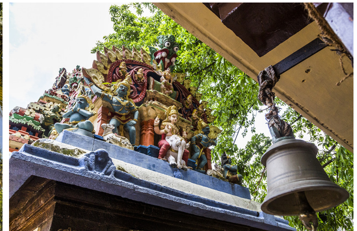
Top of Shiva temple 2.