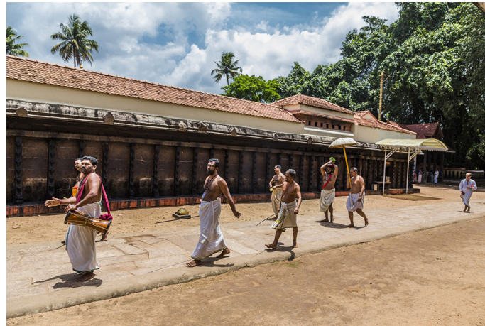
Priests during the prayer ceremony.