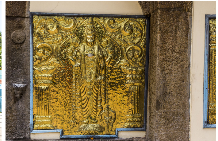
Metal work on a image of Lord Vishnu.