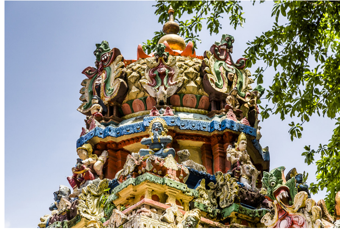
Top of Shiva temple 3.