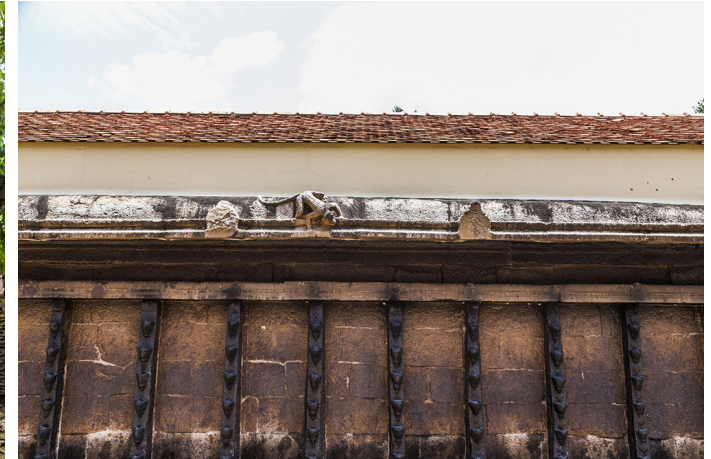
Side wall of the temple with lamp posts and a stone monkey.