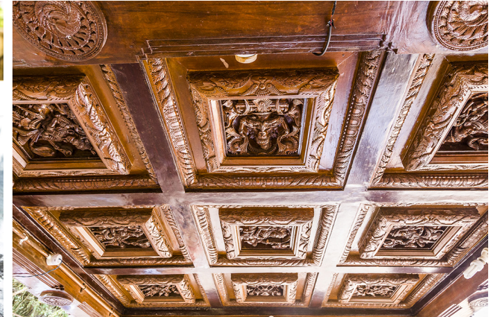
Wood-work done on the roof.