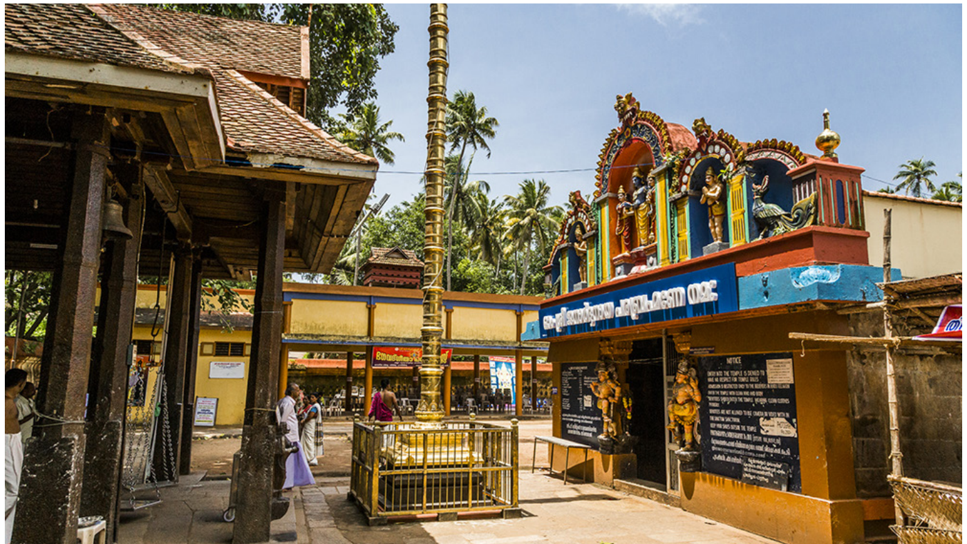
Temple area with main temple on the right.

There is a interesting story behind the temple. One day sage Narada, was returning to see Brahma. Lord Vishnu enchanted by Narada's music followed him to Brahmlok. Lord Brahma offered salutations to Lord Vishnu, but Lord Vishnu being caught off guard disappeared. The devas laughed on seeing this and thus cursed by Brahma to born on earth. Narada told them to perform penance at the place his 'Valkalam' fell. The name Varkala is said to be corruption of 'Valkala'.