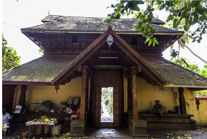
The second entrance.