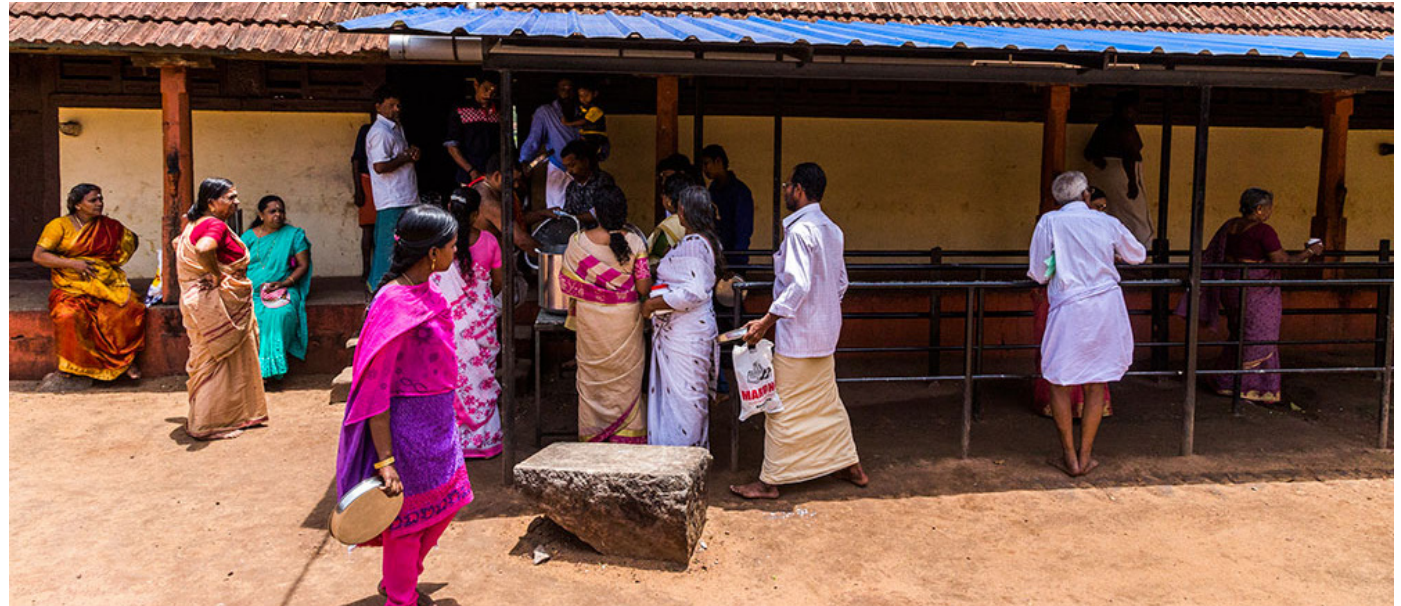
People queuing up to get prasadam after the prayer ceremony.

http://www.dsource.in/resource/janardanaswamy-temple-varkala/people