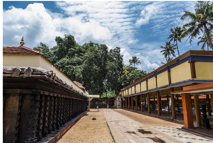
Side gallery with the path to do parikrama.