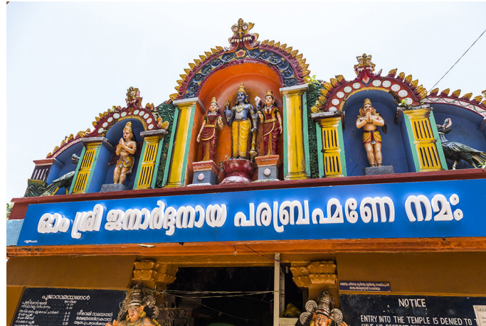
Front of the main temple.

http://www.dsource.in/resource/janardanaswamy-temple-varkala/temple