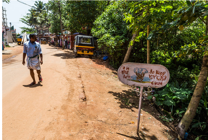
Road going from Varkala town to beach.

The most popular beach at Varkala is Papanasam beach. It translates literally to 'sin destroyer'. The water is considered to have medicinal properties as it washes the nearby medicinal plants. Devotees carry the ashes of the loved departed ones and place them in the sea at the beach.