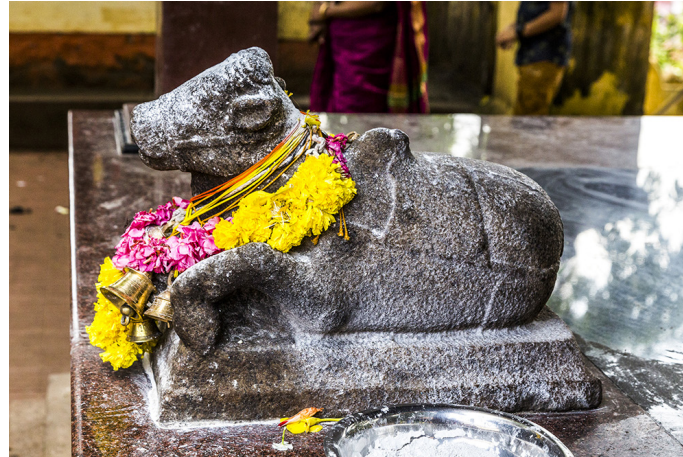
Nandi, bull considered as one of the main devotees of Lord Shiva outside Shiva temple.