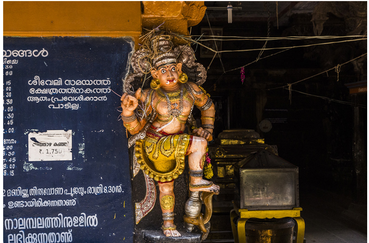
Stone statue at the entrance of main temple.