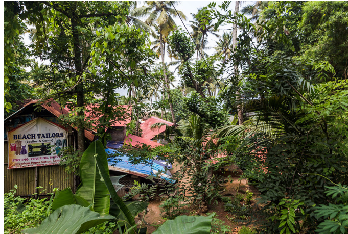
Houses along the beach area.