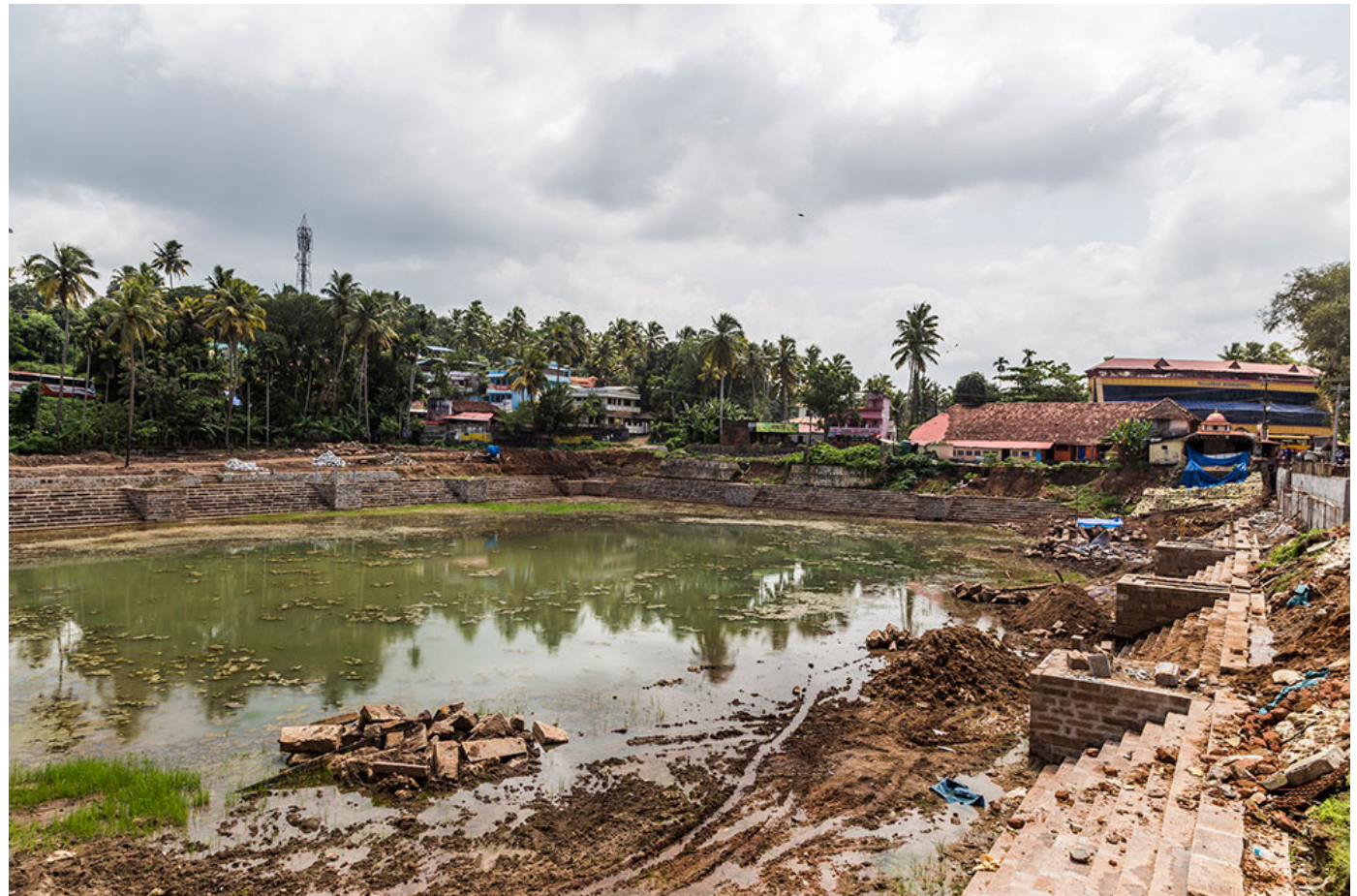
The pond outside the temple area.

Varkala is a town in the Thiruvananthapuram district of Kerala. It is located on Arabian sea shore, about 50 km northwest of Thiruvananthapuram and 37 km south of Kollam. It is a well known tourist destination, popular for its beaches, ayurvedic treatment centres and Janardan temple. It is a unique place in terms of its geology. It is the only place in south Kerala to have hills along the beach. This unique formation is called Varkala formation and is declared a geological monument by Geological Survey of India.