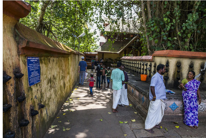
Area in front of main temple with lamps on the walls.

http://www.dsource.in/resource/janardanaswamy-temple-varkala/temple