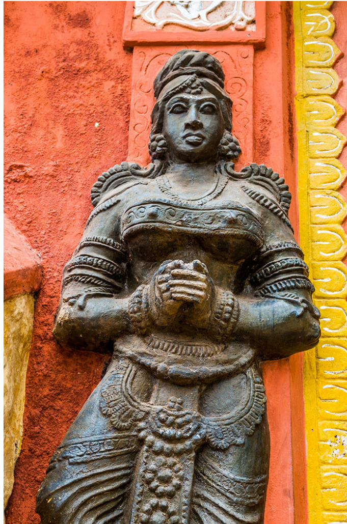
Statue outside the entrance showing the stone-work and aesthetics.