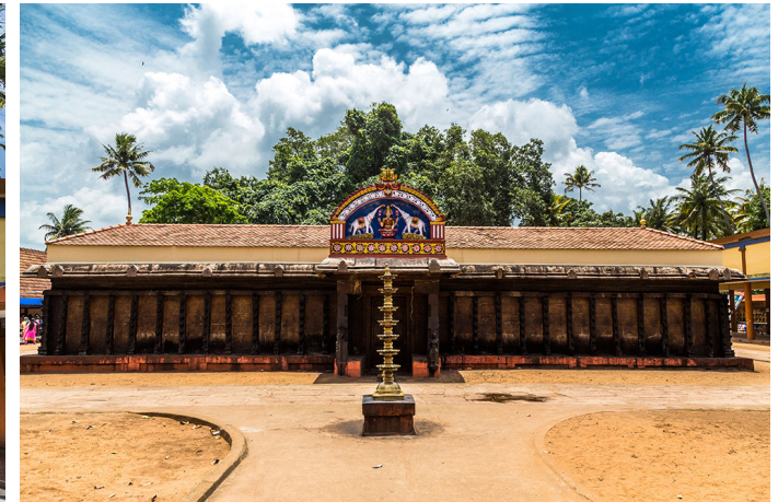
Side wall of the main temple.