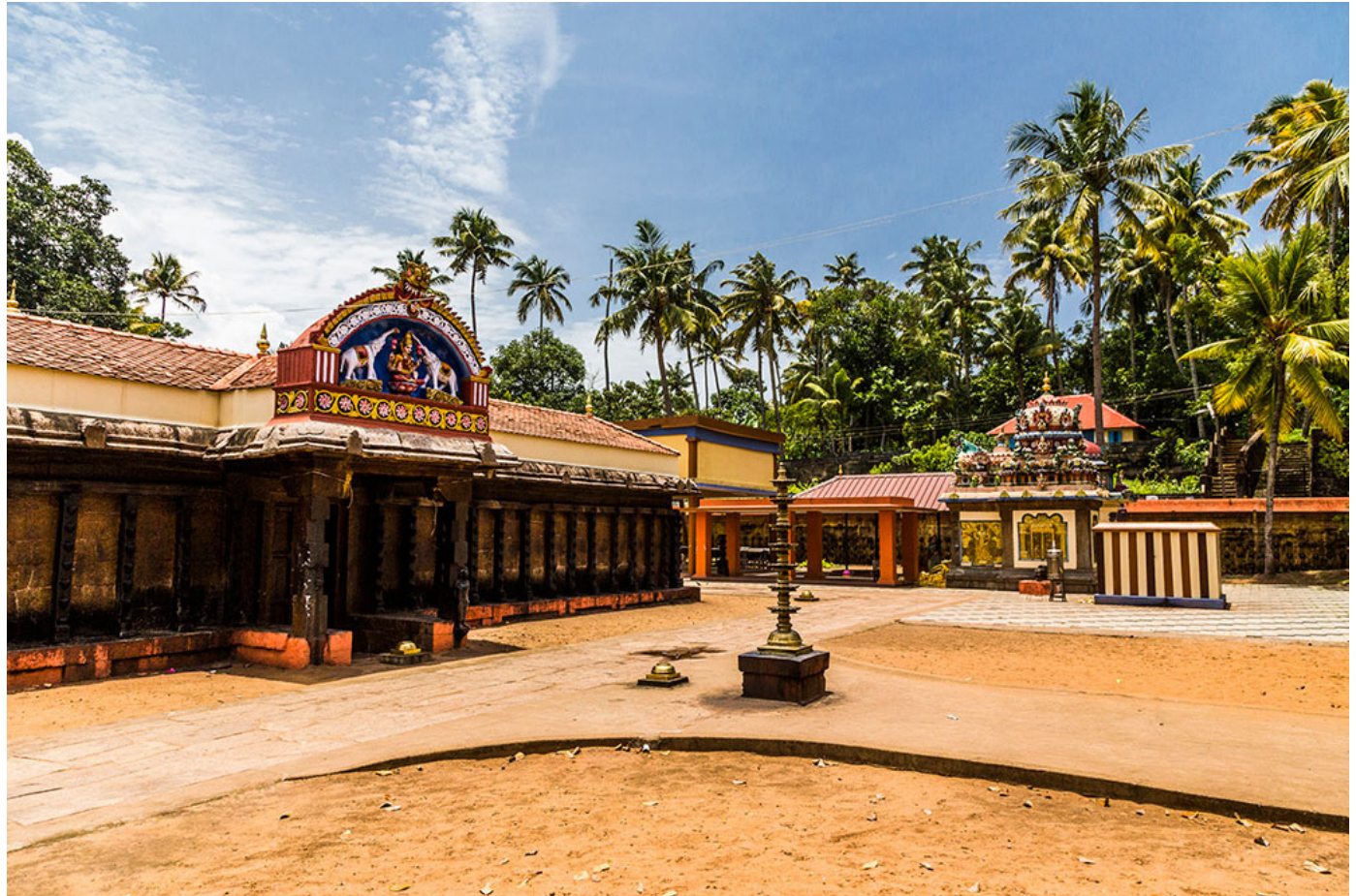
Temple complex area.