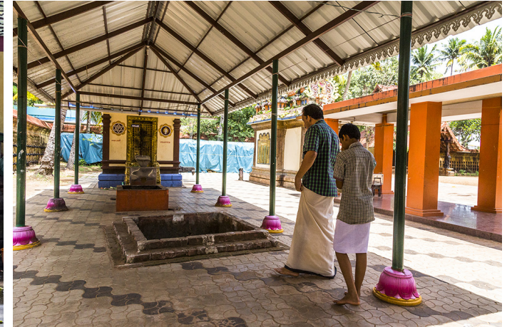
Devotees praying at Lord Ganesha temple.