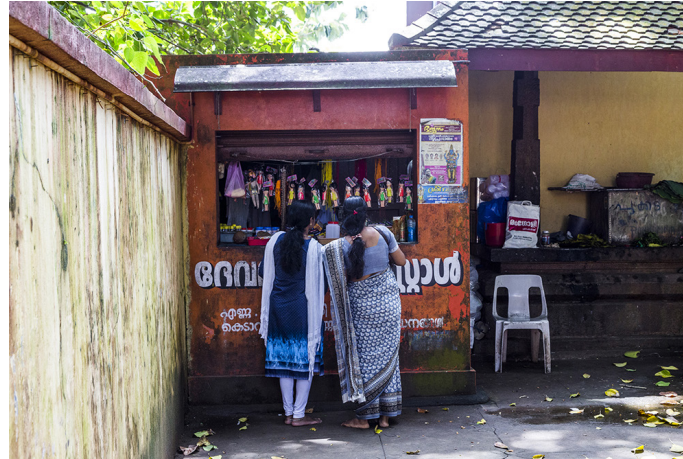
Shop inside the temple area selling prayer ingredients.

http://www.dsource.in/resource/janardanaswamy-temple-varkala/people