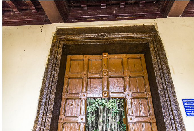
Kerala style wooden gate.