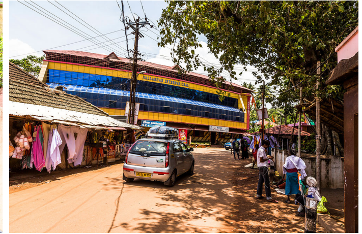
The road going from Varkala town to beach.