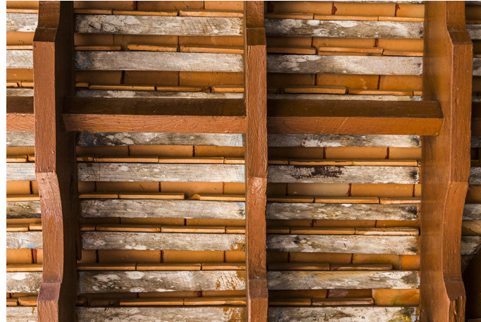
Woodwork on the roof.