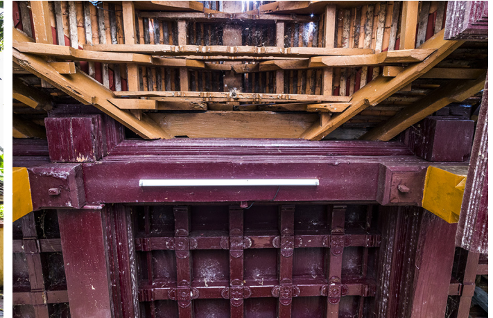
Wood-work on the roof.