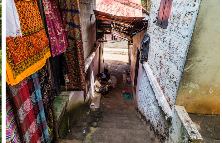
Shops selling souvenirs.