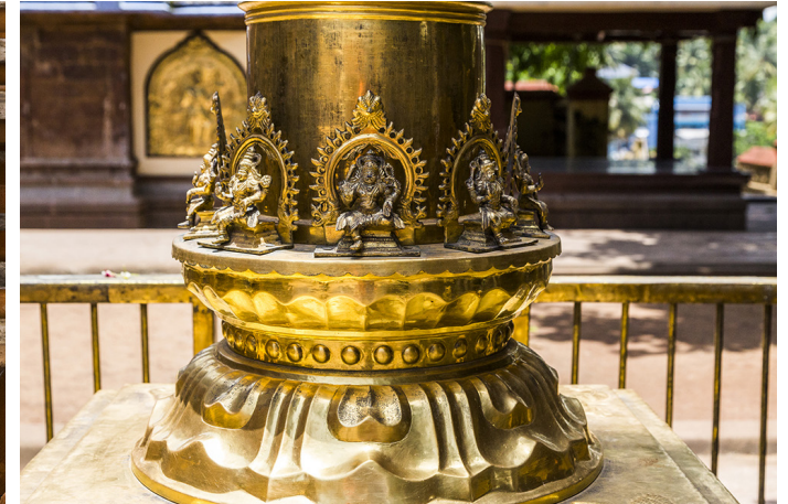
Intricate metalwork done on one of the metal pillars.