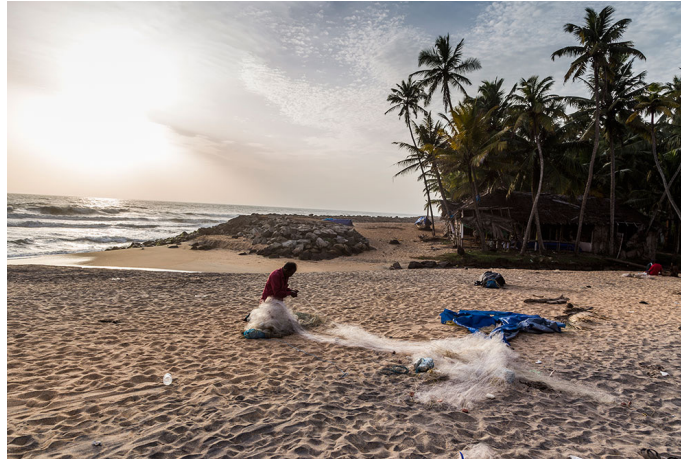
Fisherman working on net.