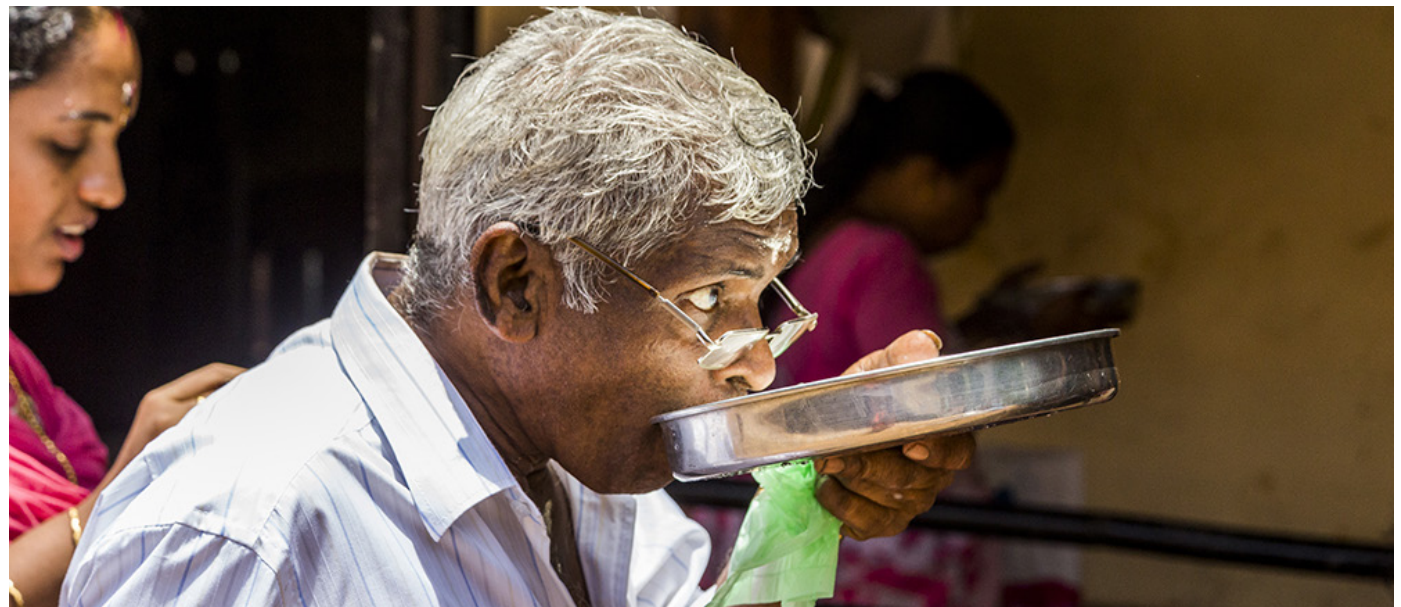
Devotee drinking the prasadam.