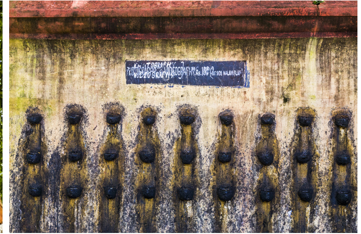
Lamps installed on the walls around the temple.