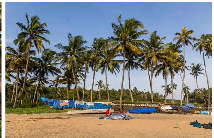
Coconut trees with two fisherman.