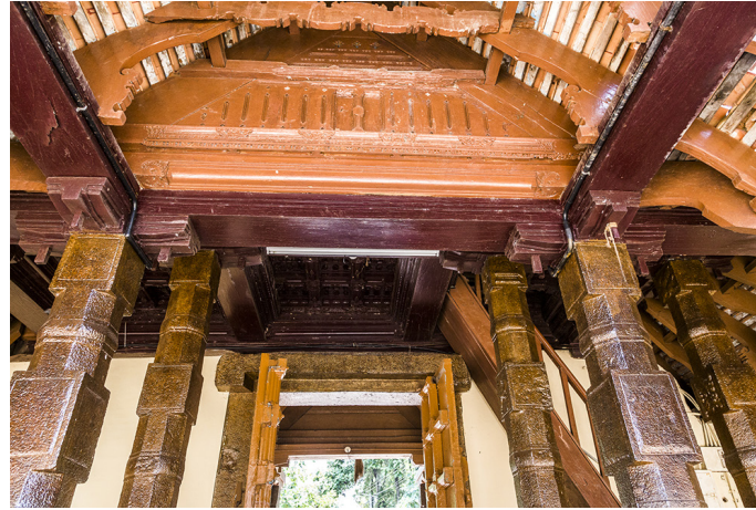
The amazing mix of stone and wood to build the gate.

http://www.dsource.in/resource/janardanaswamy-temple-varkala/temple