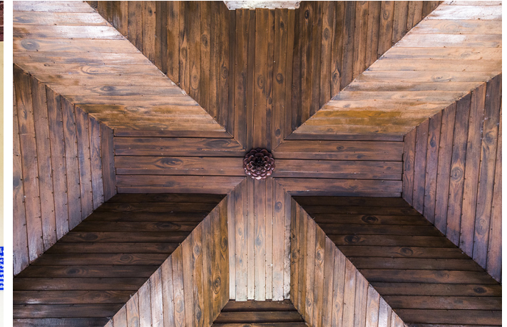
Roof made of only wood.