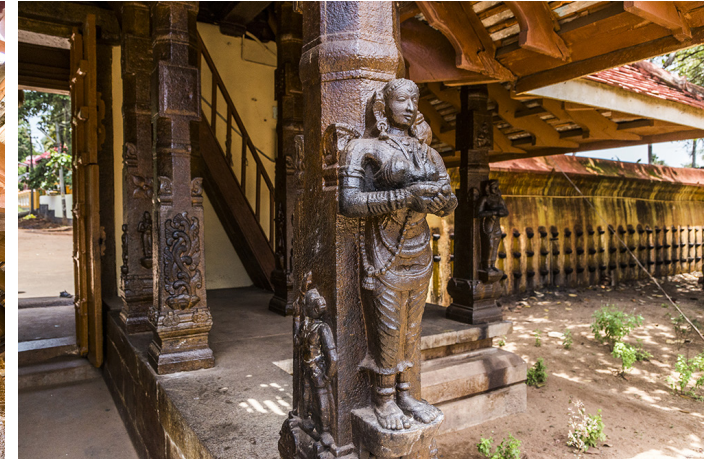
Stone statue at the second entrance.