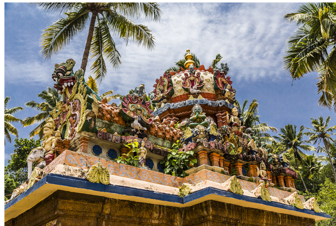
Top of Shiva temple.