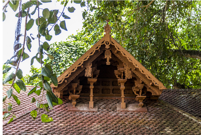
Intricate woodwork on a gable.

http://www.dsource.in/resource/janardanaswamy-temple-varkala/temple