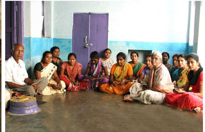
Group of artisan involved locally for Kaudi craft, which supports their livelihood.