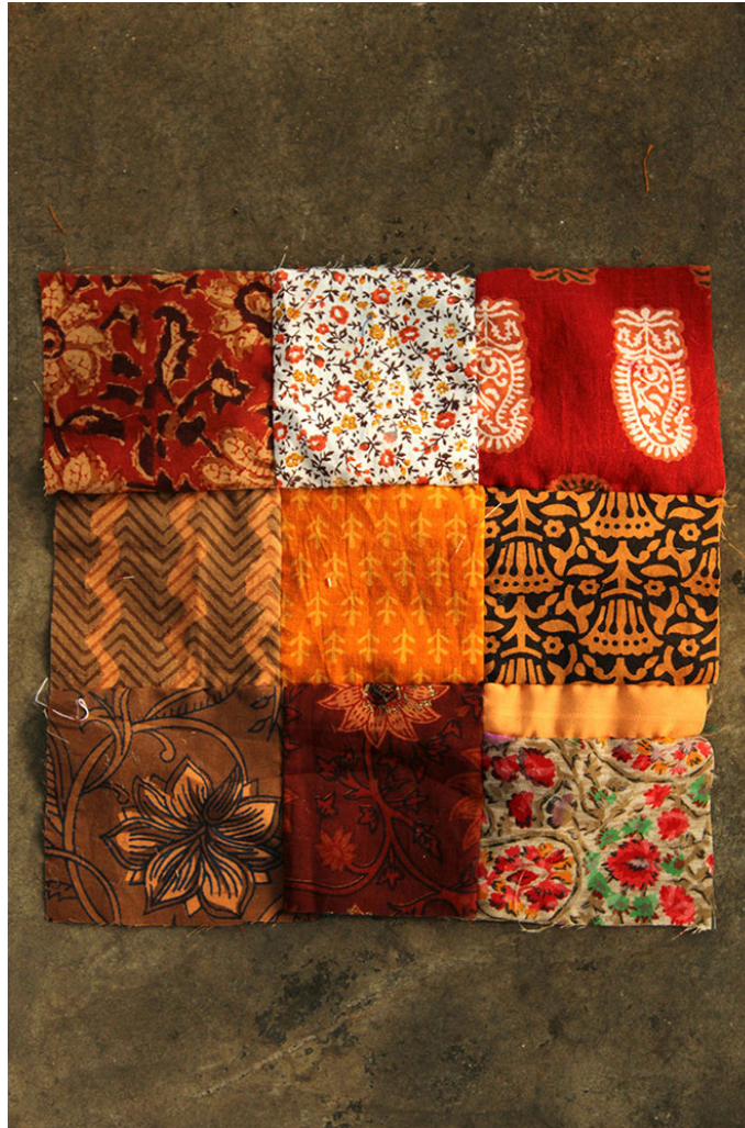
A piece of cloth roughly of square feet in size, after it is stitched.