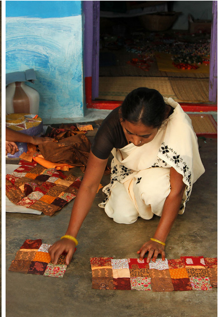
Similar pieces are then joined to make a seamless fabric.