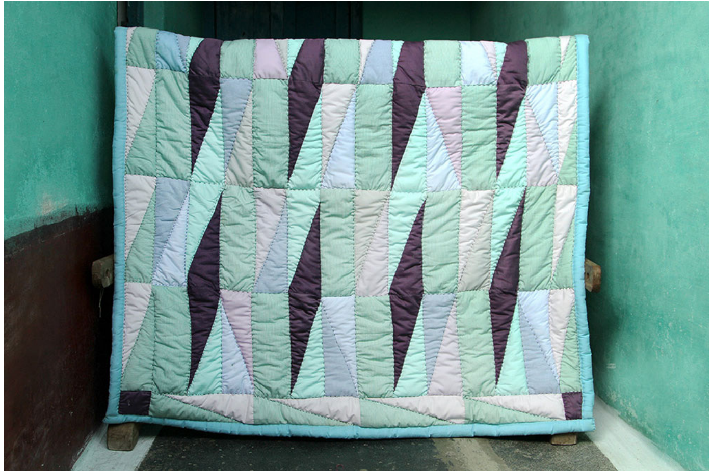
Kaudi blanket with triangular pattern stitches.