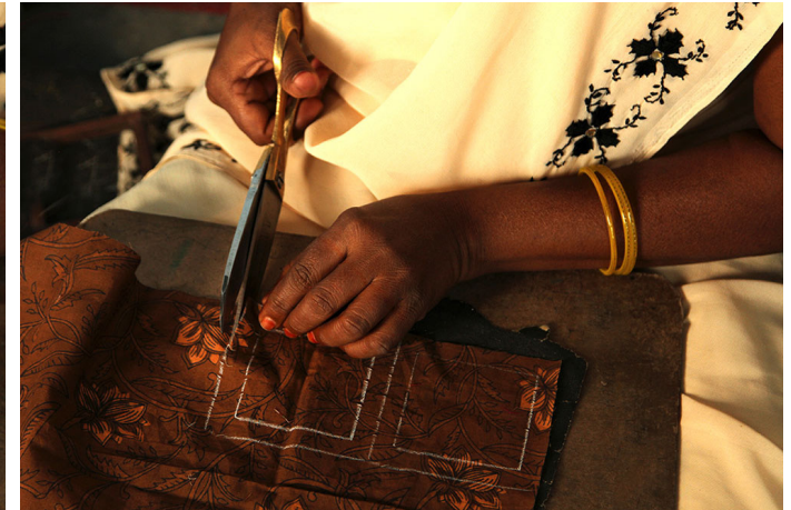
She then cuts the marked area out of the cloth piece.