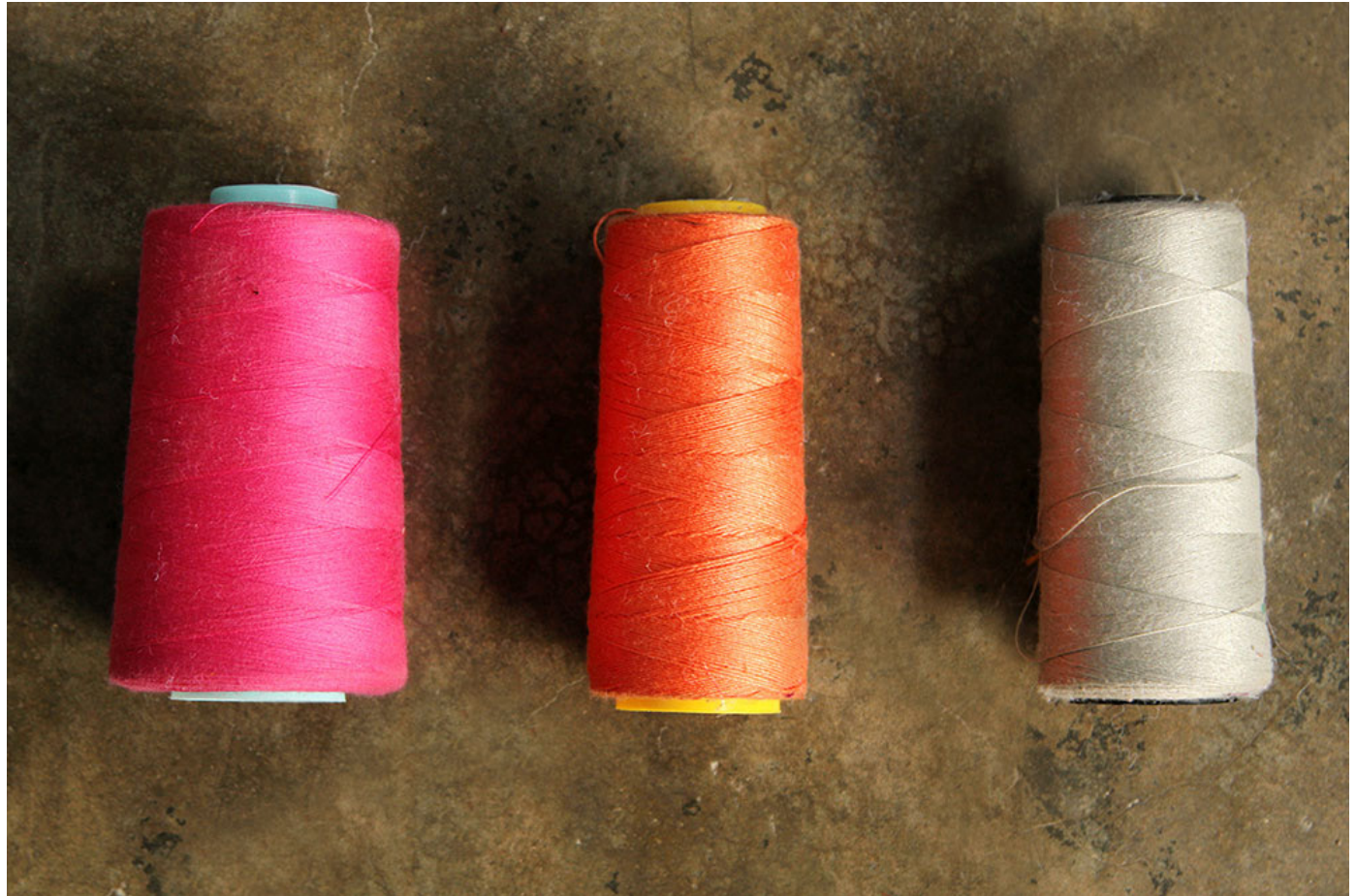
Cotton thread reels of different colors.