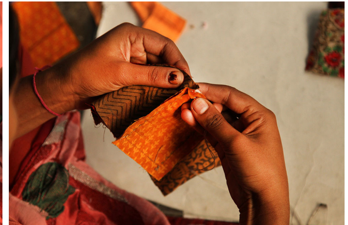
It is then added with few more similar size, with different design cloth piece.