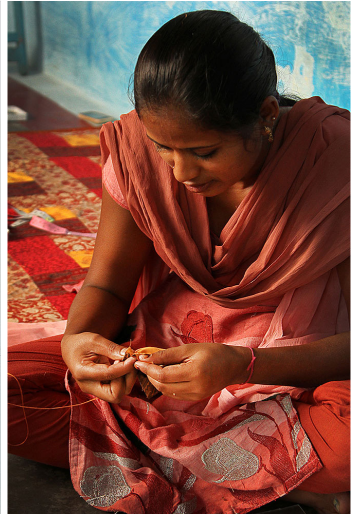
Local women quilting, helps them for their daily wages.