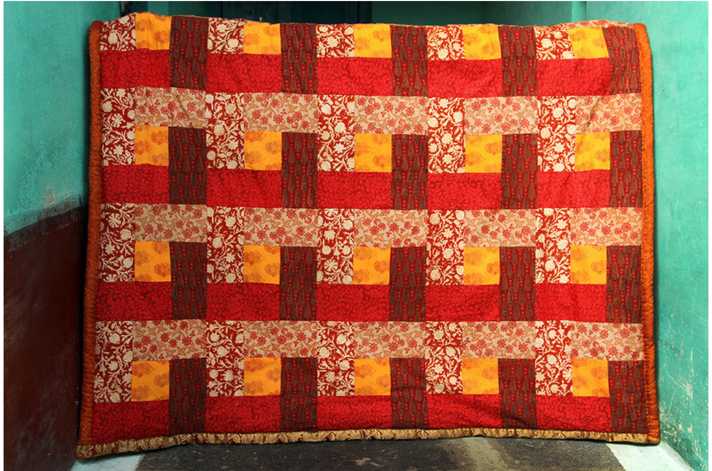
Kaudi blanket with floral pattern.