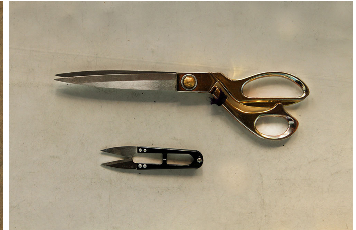
Large and small scissor for different modes of cutting.