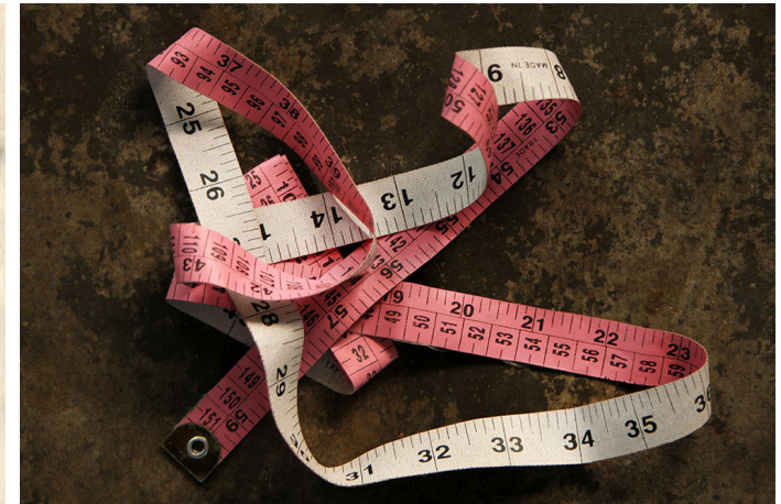
Measuring tape to measure and mark the size of product.