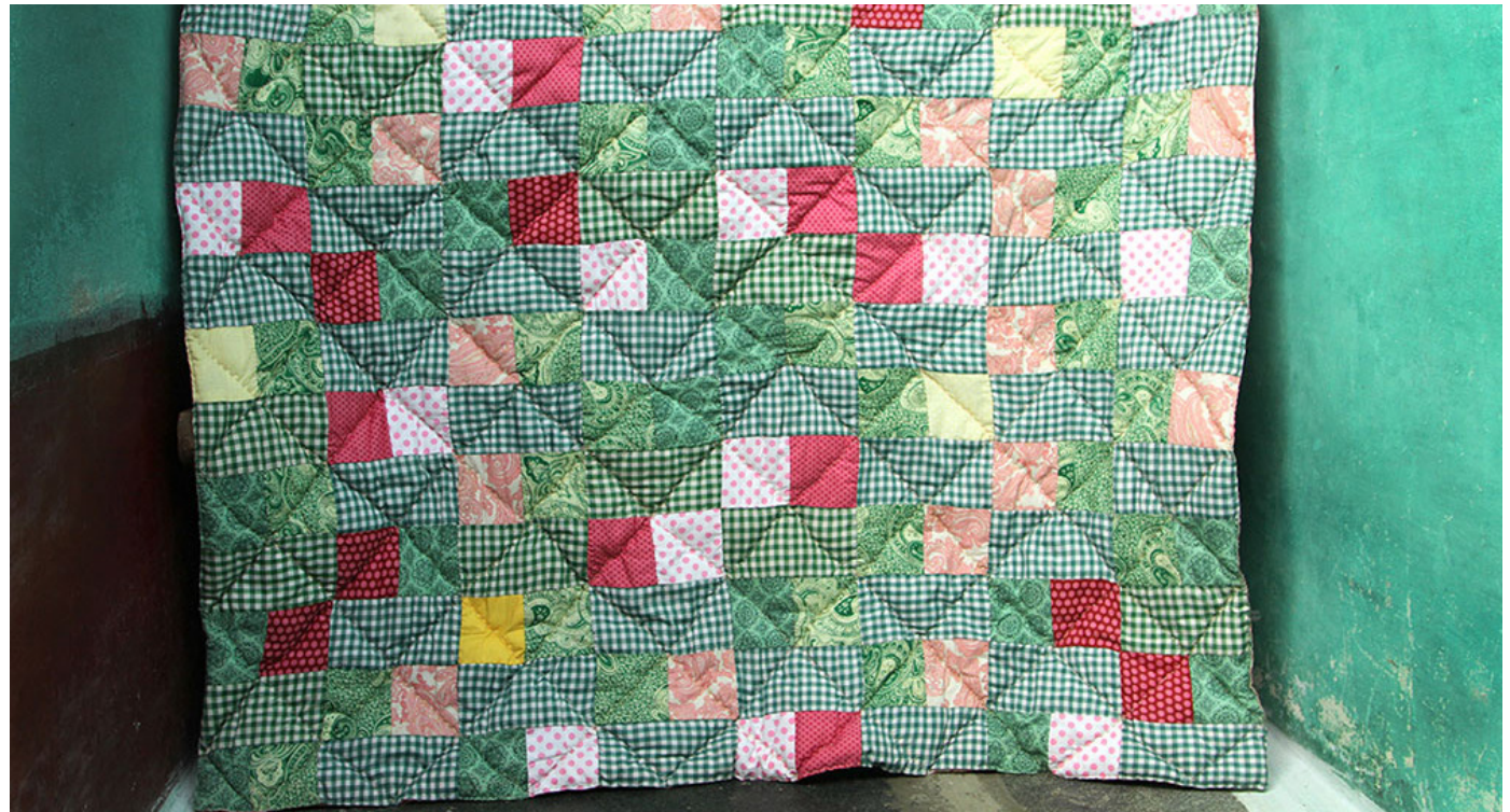
Kaudi blanket with crisscross stitching.