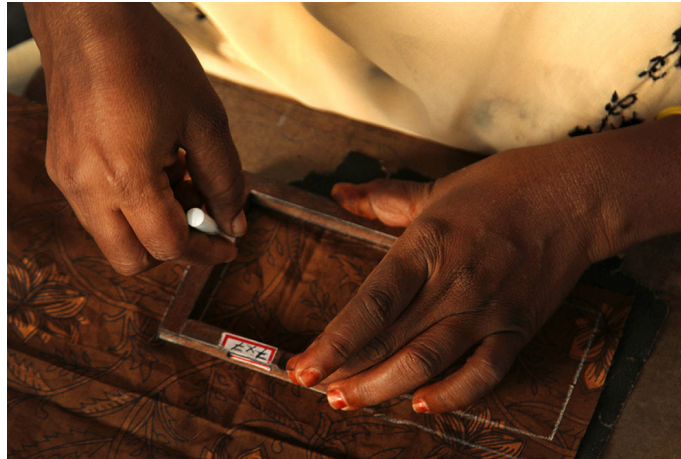
Artisan marking on cloth piece with the help of a template.