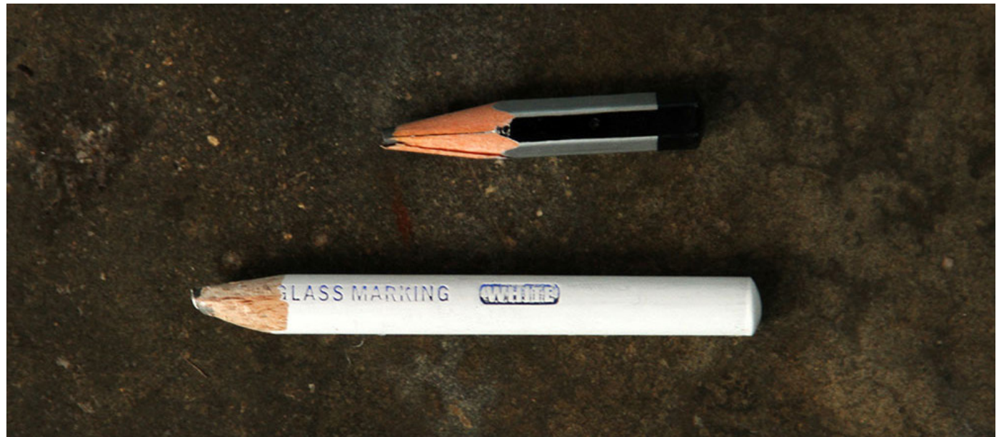
Pencil & glass marker, to mark on cloths.