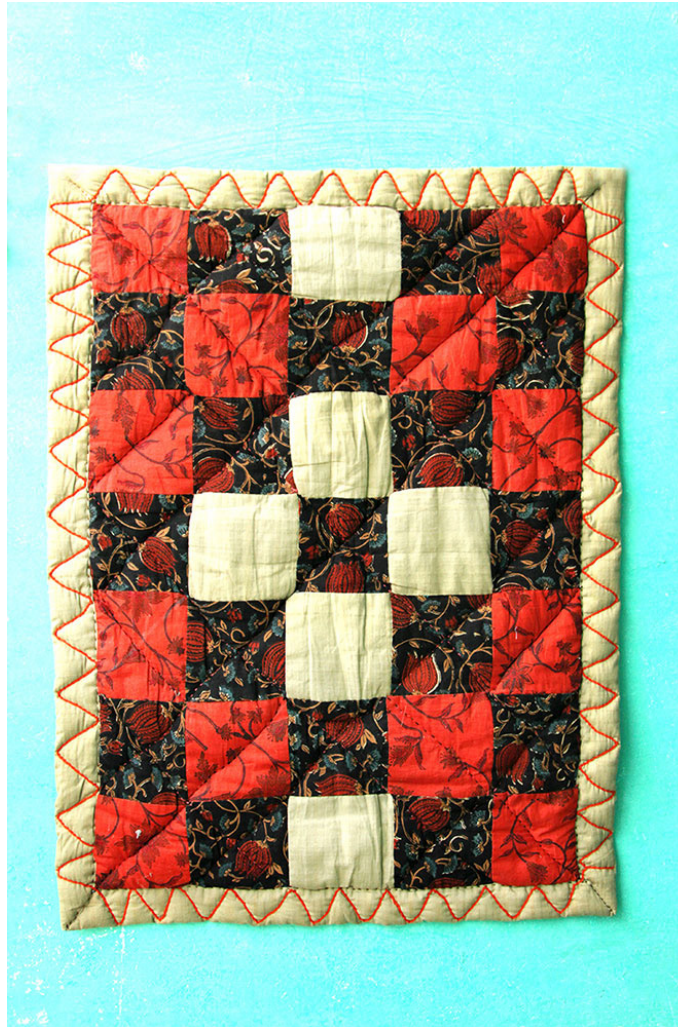
Kaudi mat for seating.