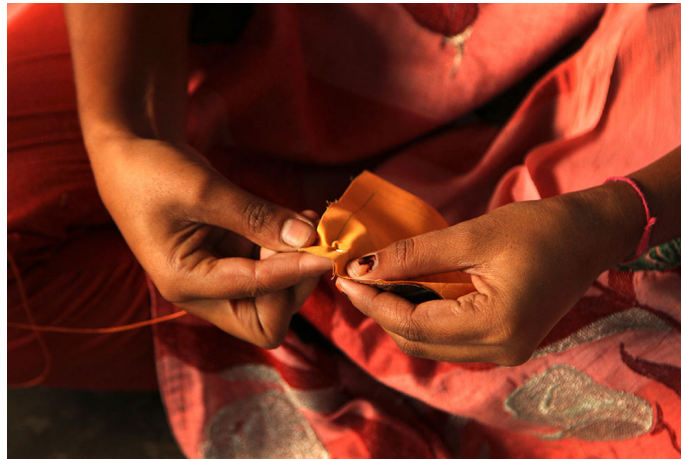
Two similar size pieces are stitched together.