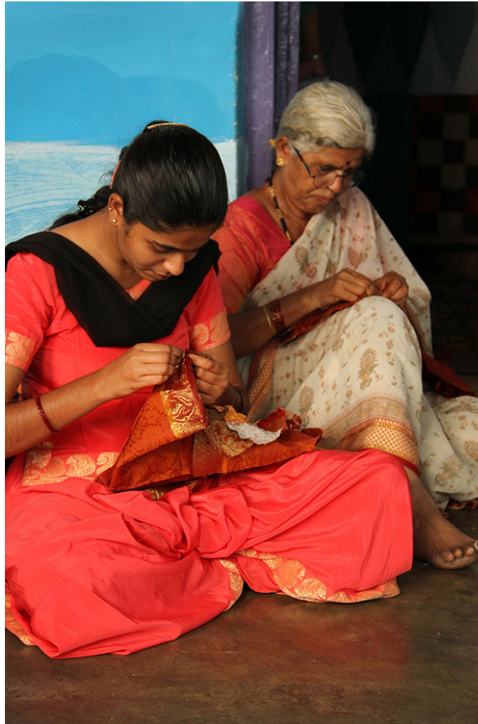
An image showing different generation of women's involved in this age old craft form.