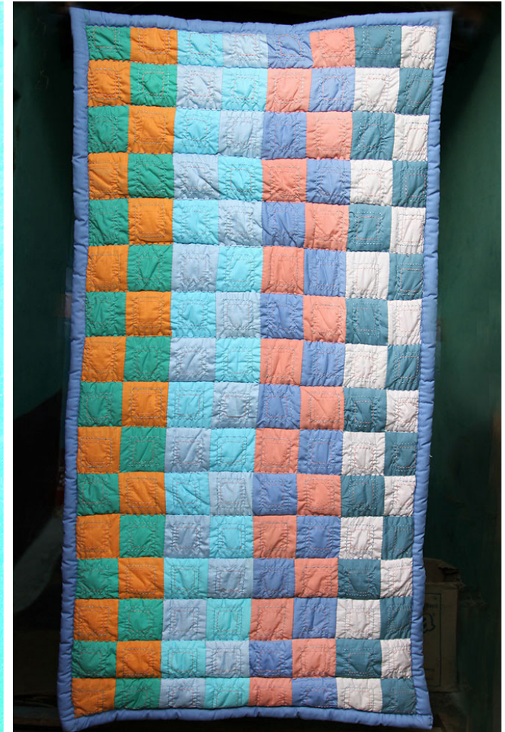
Kaudi bed spread, with pastel shade patches and different kind of stitching.