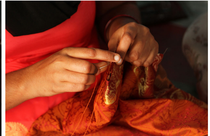
Sari border & other cloth pieces being used to create variety of pattern.