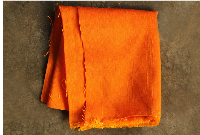
Different types, and colors of cotton being used in this craft.

http://www.dsource.in/resource/kaudi-making-anegundi-karnataka/tools-and-raw-materials