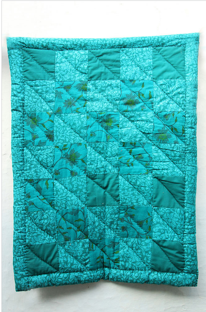
A medium size Kaudi blanket / bed spread for kids.