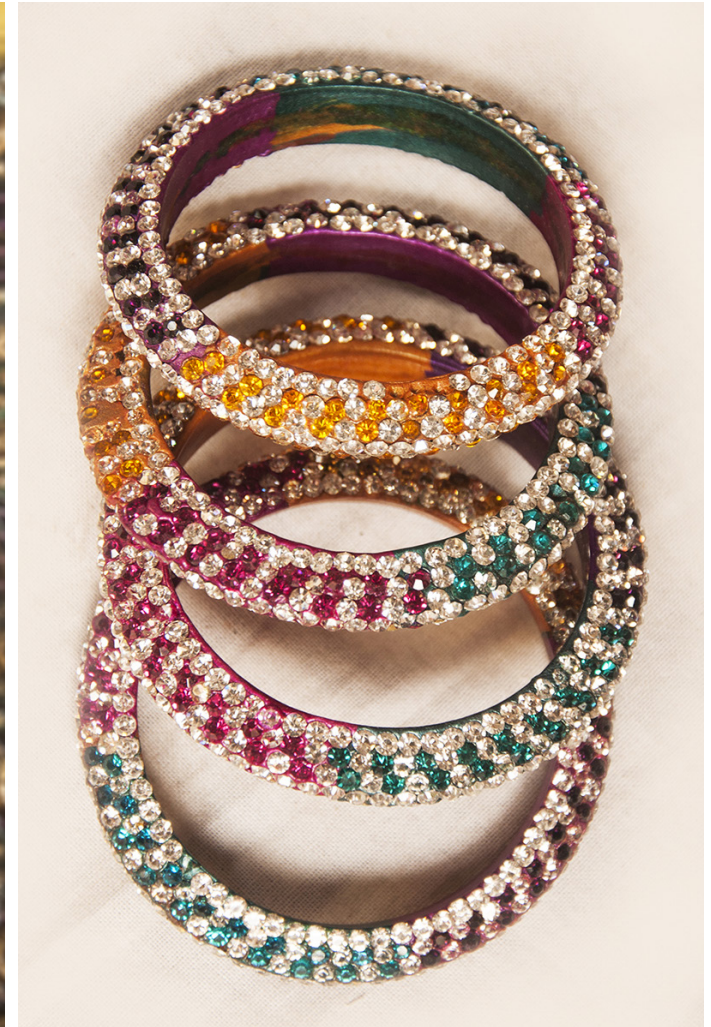
Thicker lac bangles, which are studded with plastic replica of diamonds.