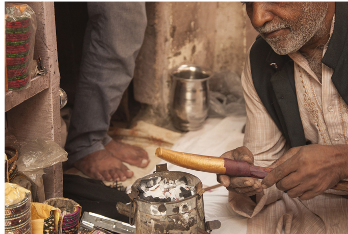
Artisan melting the lac, in order to shape it to required design.