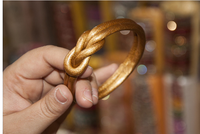
A modern makeover for traditional lac bangle, done looping lac into each other.

http://www.dsource.in/resource/lac-bangles-jaipur-rajasthan/products