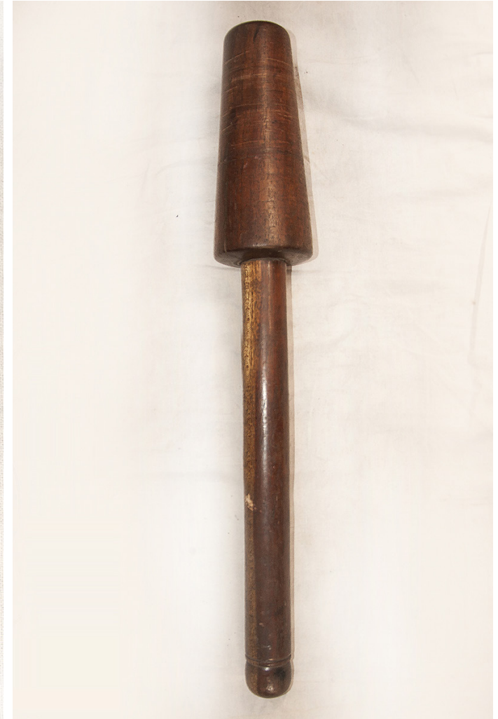
A round wooden log, which helps in making varying sizes of bangles.