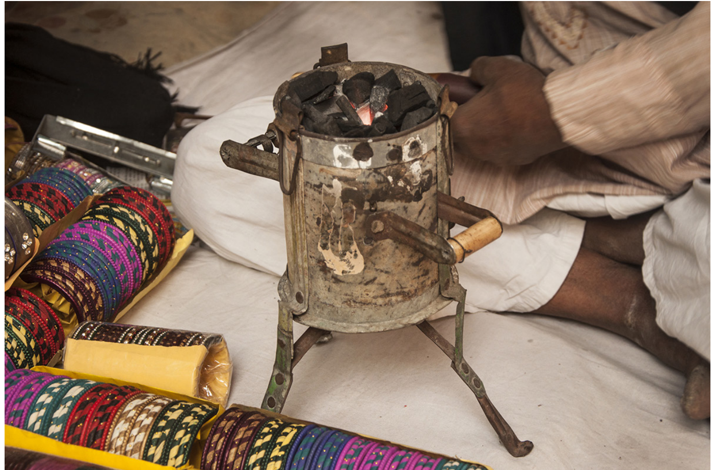
A charcoal stove, commonly used by lac bangle artisans in the vicinity.