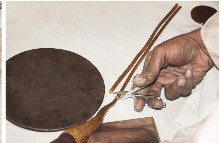
The completed lac ropes are then measured and cut, to required length.