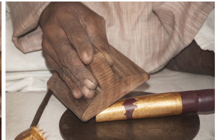
It is then brought down and rolled again on heated iron disc, until desired thickness is attained.