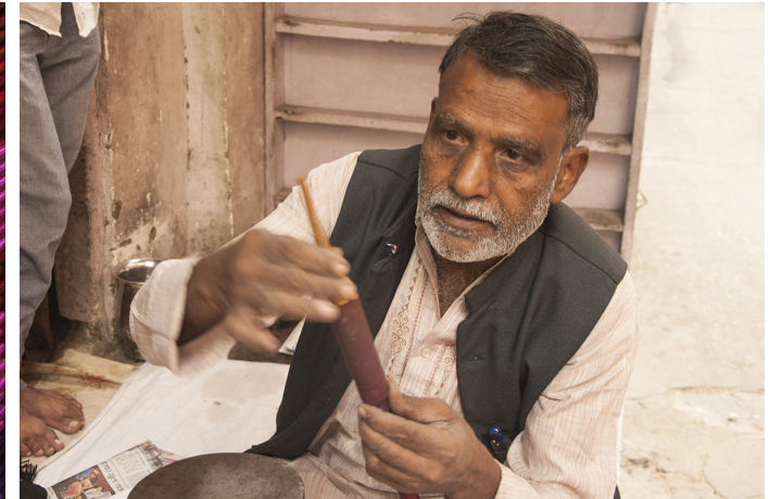
Artisan explaining the process, holding a bar of Lac.