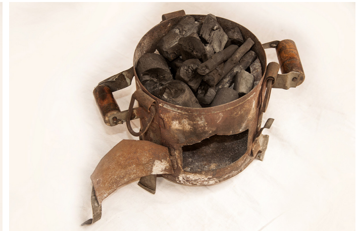
A charcoal stove, used in melting the lac, for various process during its making.