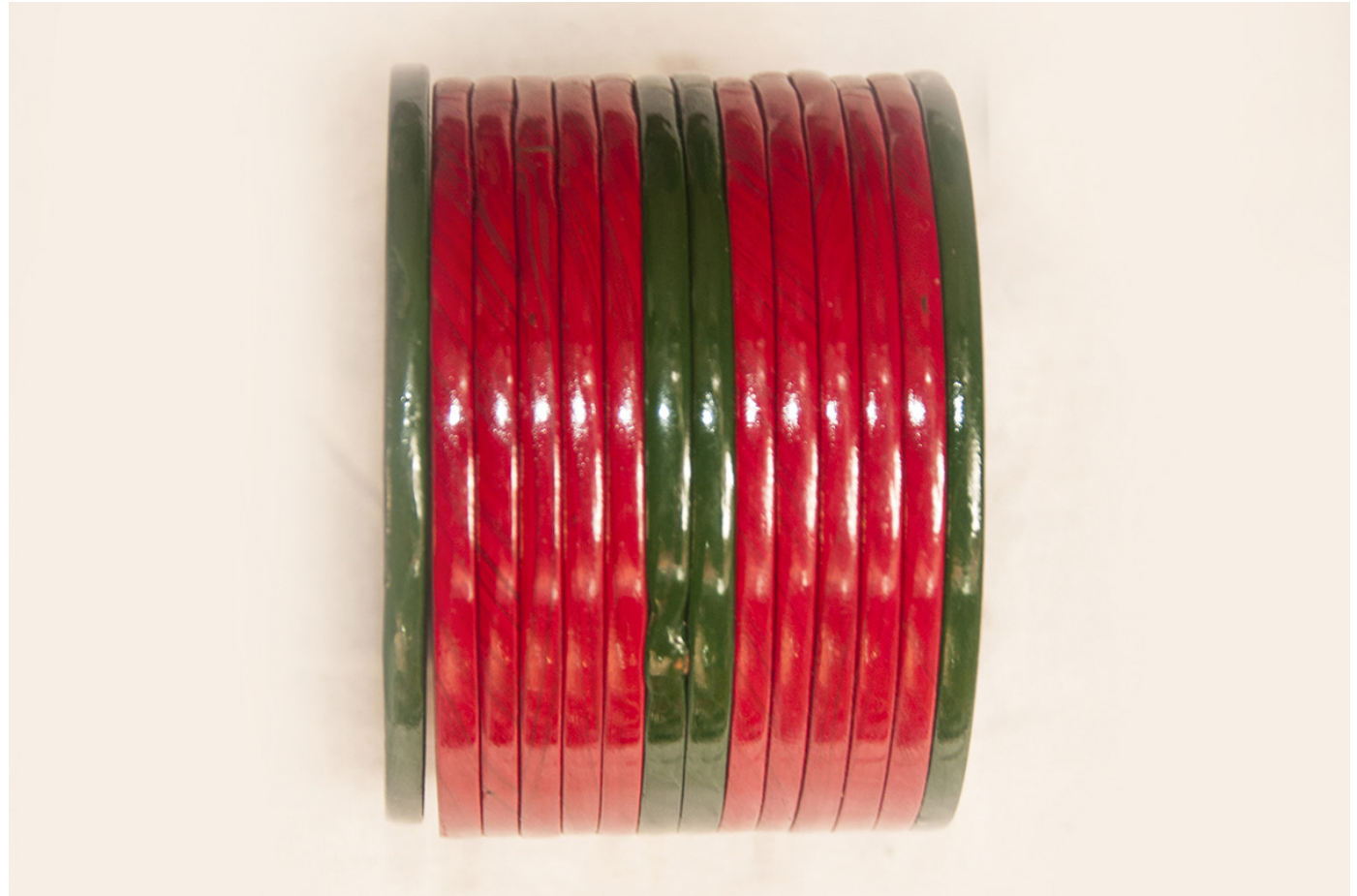
Green and red set of pure lac bangles, commonly used in marriage ceremony by local communities.