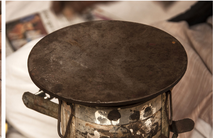
An iron disc is kept on the charcoal stove.