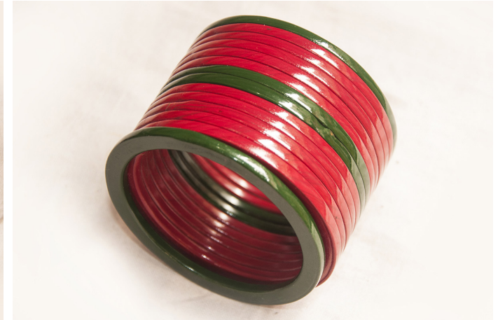
A combination of red and green lac bangles, used commonly in marriage ceremony by the local communities.