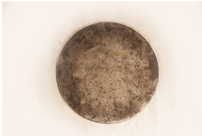
A circular iron disc, which is heated on charcoal stove, to roll up the lac.