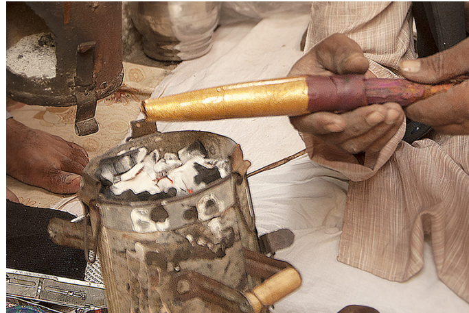
Artisan carefully rotates the stick, while heating it, such that it is heated evenly all over.

http://www.dsource.in/resource/lac-bangles-jaipur-rajasthan/making-process