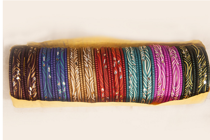
Lac bangles of different shades, having same design pattern.