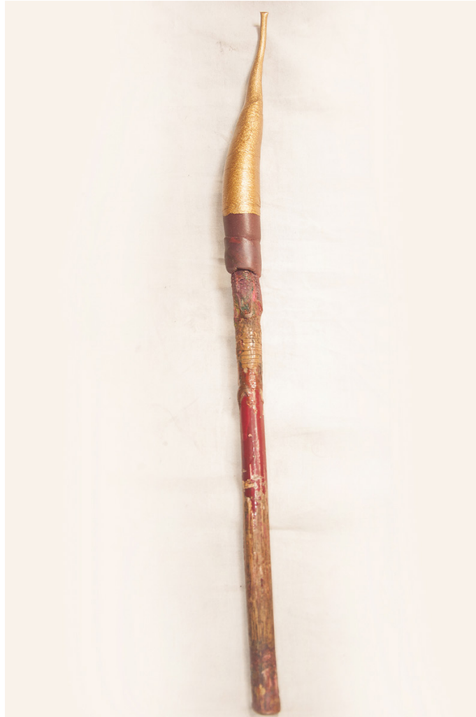
A stick on to which lac is melted, to handle it well.