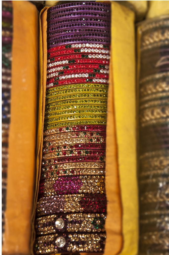
Thin lac bangles, which are studded with colorful stones.