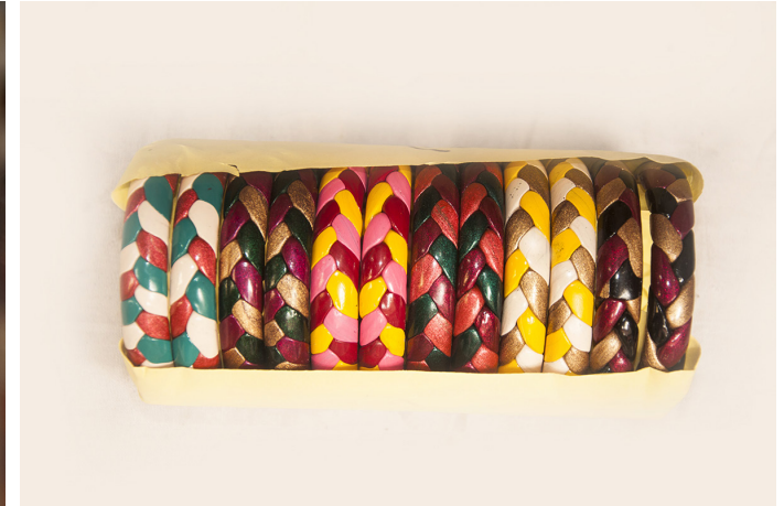
Lac bangles, formed by interlacing different shades of lac.