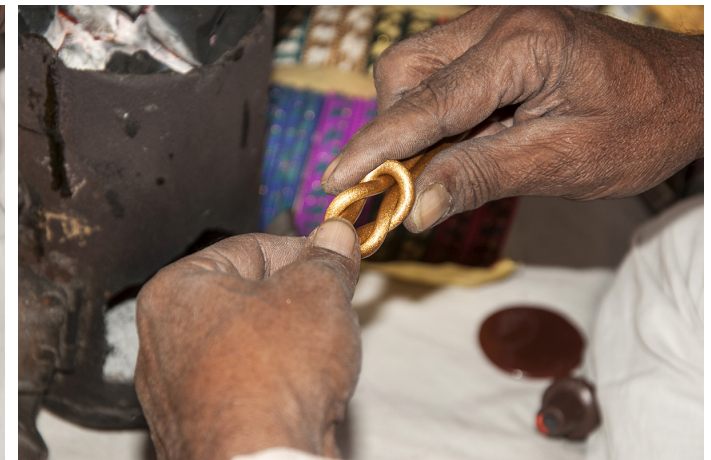
He then shapes it by hand for accuracy, while it is still soft to handle.