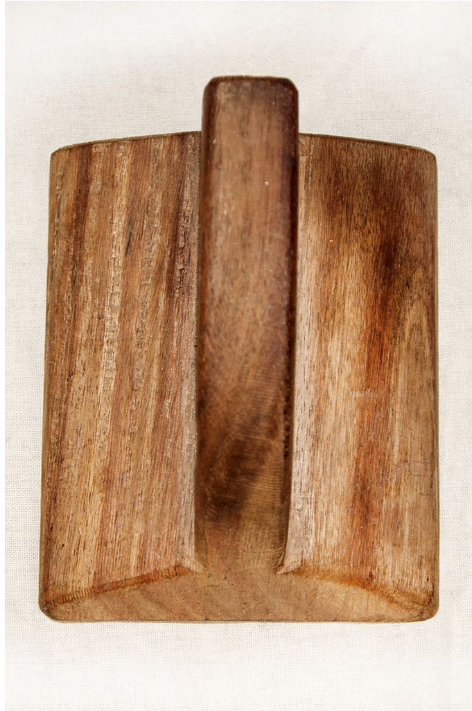
A flat wooden mallet used in pressing lac bangles sideways for a precise width.