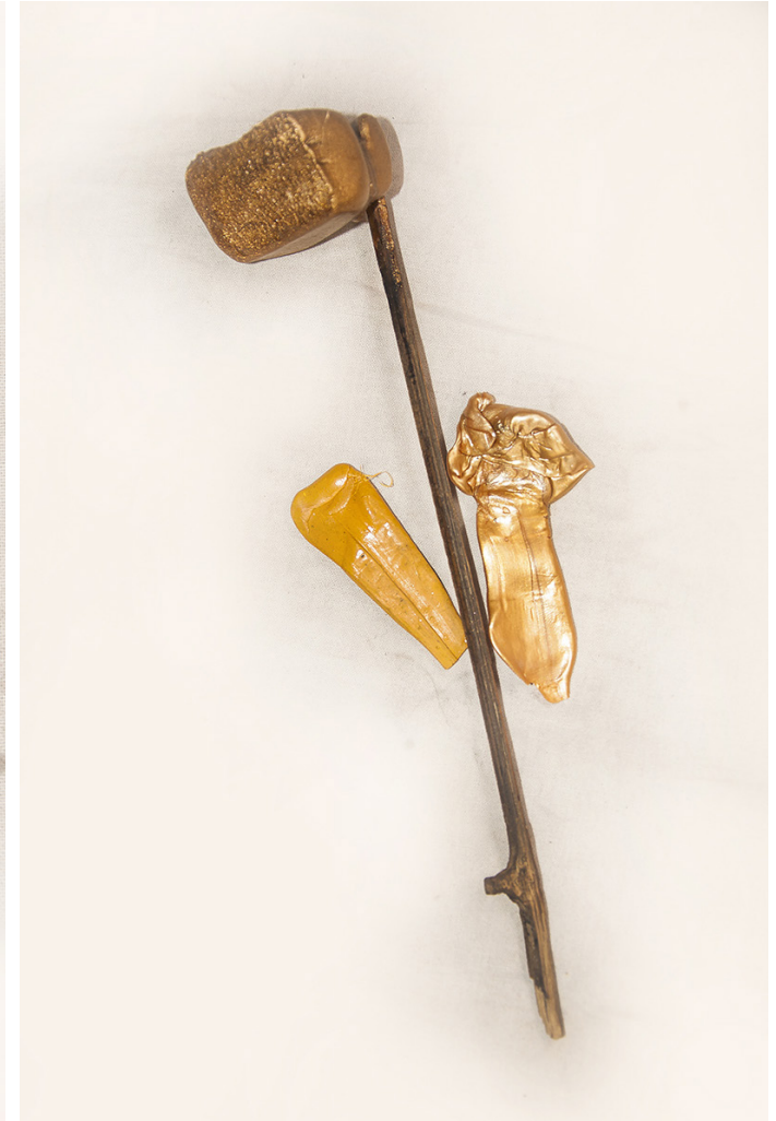
Image showing a stick holding bar of lac, which is applied on a lac base.