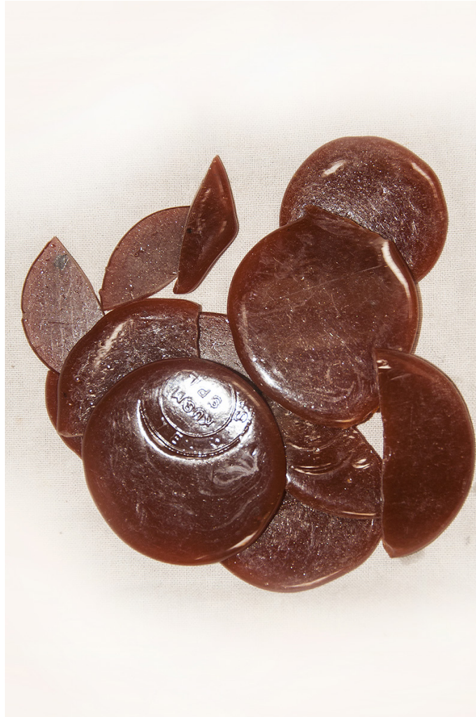
Raw lac chips, which are to be melted and used further.