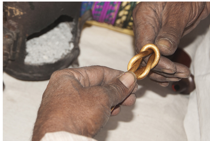
A design is made by the artisan by interlacing two of such lac rope.