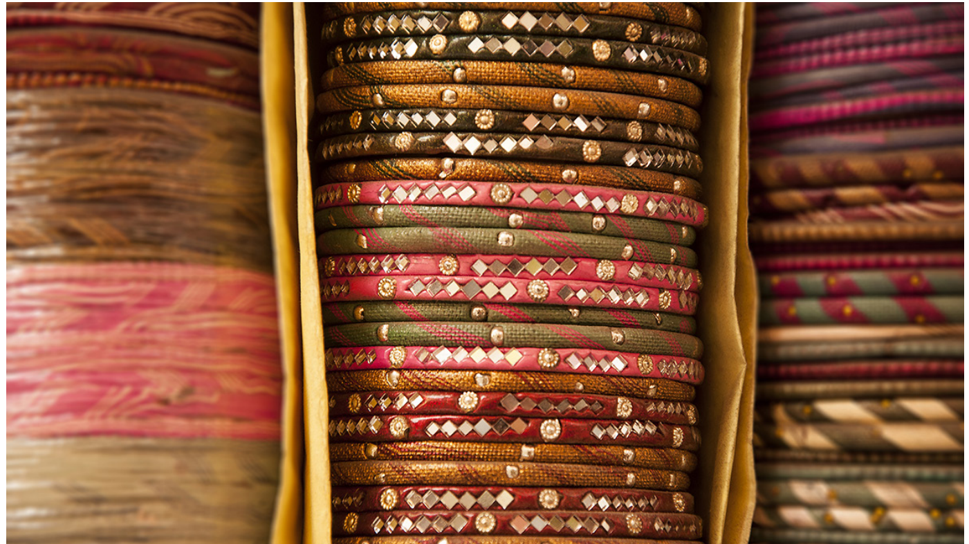
Different colored lac bangles, infused with glass and various plastic based gem replicas.

Price of a 2-4 sized lac (Leheriya) bangle in pair costs 90/- rupees each.