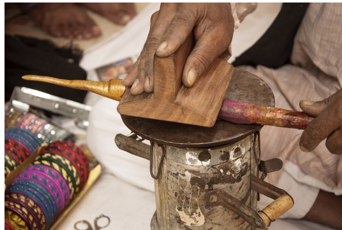
The heated lac is rolled upon it with the help of a flat wooden mallet.