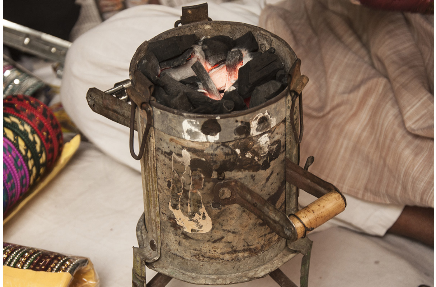
The stove is prepared by adding charcoal to it and burning it up.