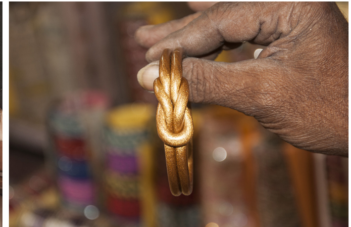
A completed bangle, with a coat of golden lac on it.