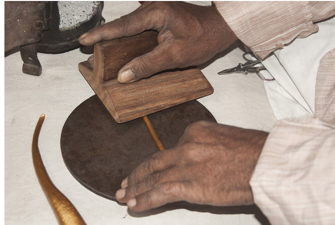
It is being rolled down to a thinner lac rope, according to required design.

http://www.dsource.in/resource/lac-bangles-jaipur-rajasthan/making-process