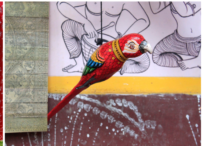
A vividly coloured parrot put up for a display made using the same process.