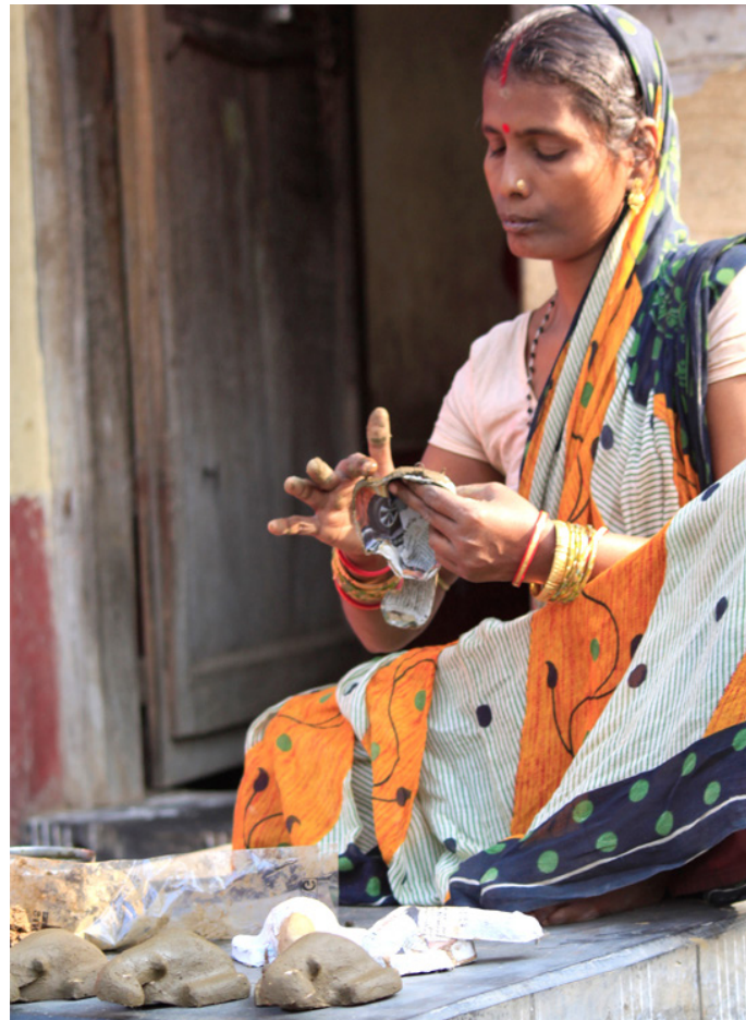
An artisan applies clay on the mask to prepare it before taking it to the next stage.