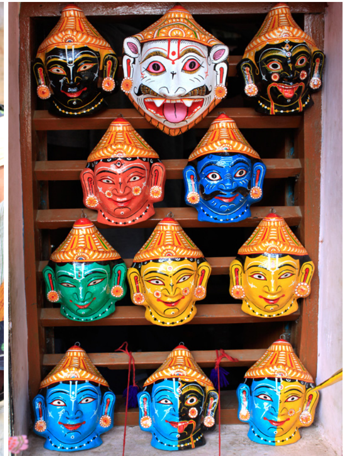
Various kinds of exotic masks flaunting their bright colours and the perfect art of mask making.