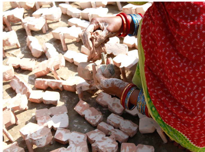
Various parts of a product are sun dried for them to be taken to the next level in the process.