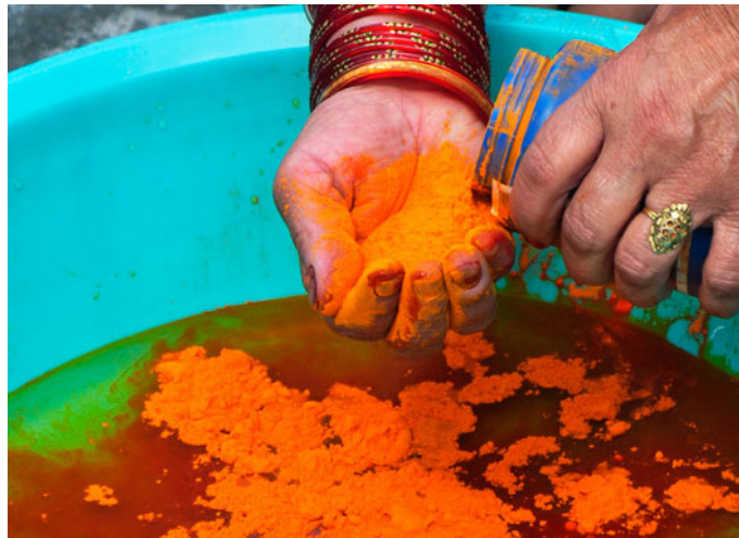
Yellow color dye solution is prepared to dye the cloth.

The design is made using red color solution. 50 paisa coin and gram is tied in a piece of cloth, which is dipped in the red color solution and then design is made on the cloth. Line patterns are made using 50 paisa coins and dot patterns are made using gram (grain type). The design made in the middle of the cloth is called as ‘Surya chandra Codi’. The design consists of Surya (Sun God), Chandra (Moon), Ghanti (bell), and shankh (shell) which is considered auspices. Dotted design is covered on the remaining area of the cloth. After the design is made, the cloth is dried in the sun. Once it is dried, golden or silver color lace locally known as ‘kiran’ is stitched all around in the periphery is stitched.