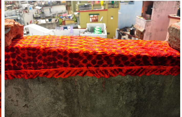
The shawl is decorated by stitching golden lace on the borders.