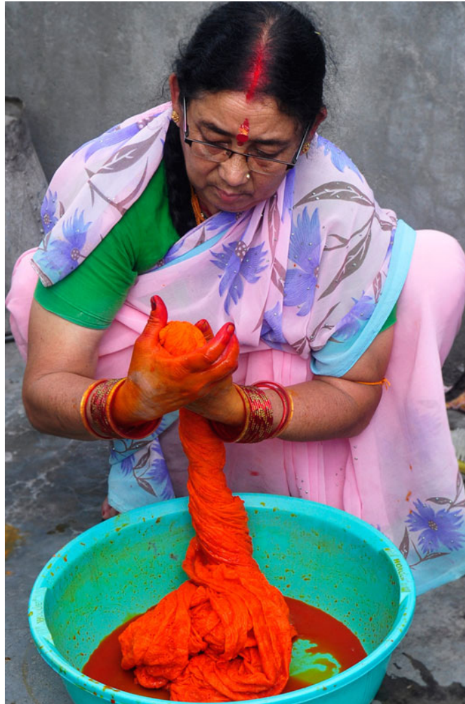
Artisan strains/remove out the water from the cloth.