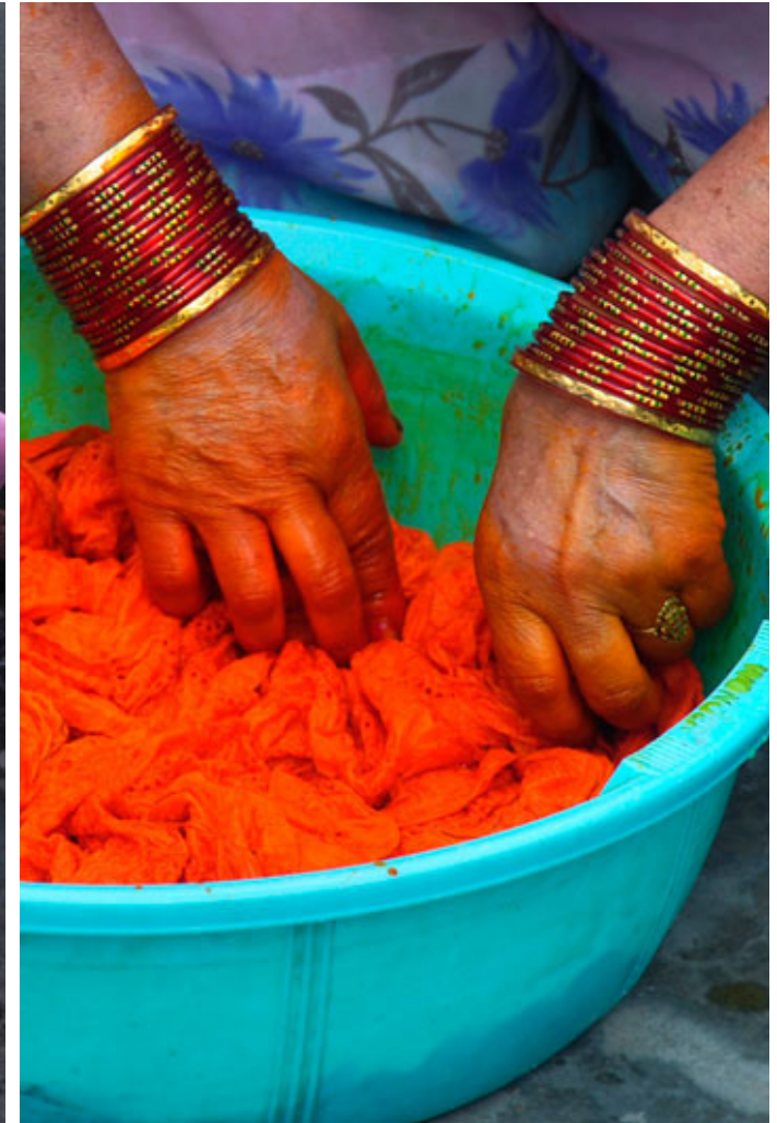
The fabric is soaked in the dye solution for five minutes.