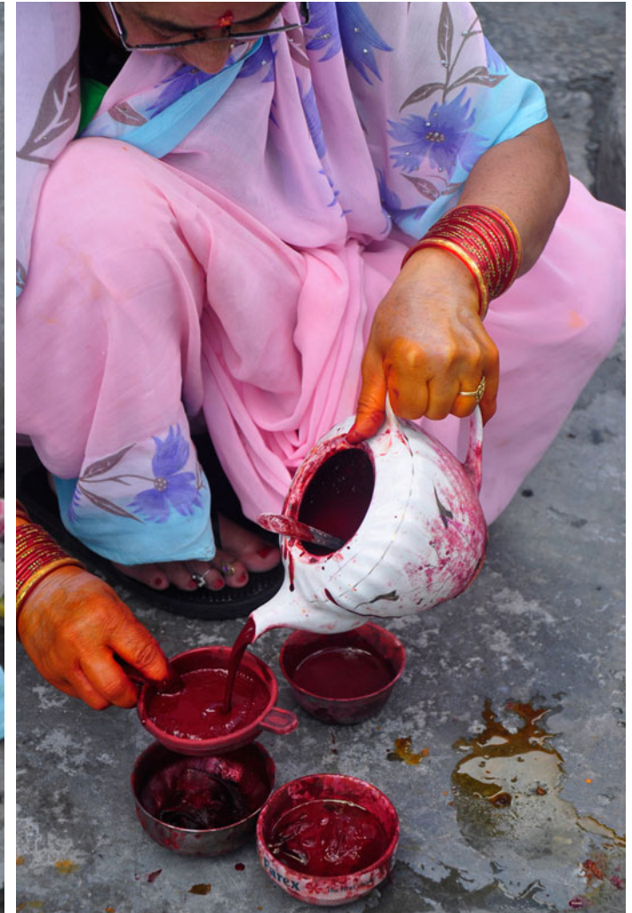
Red color solution is made and filtered, which is used to make design on the cloth.