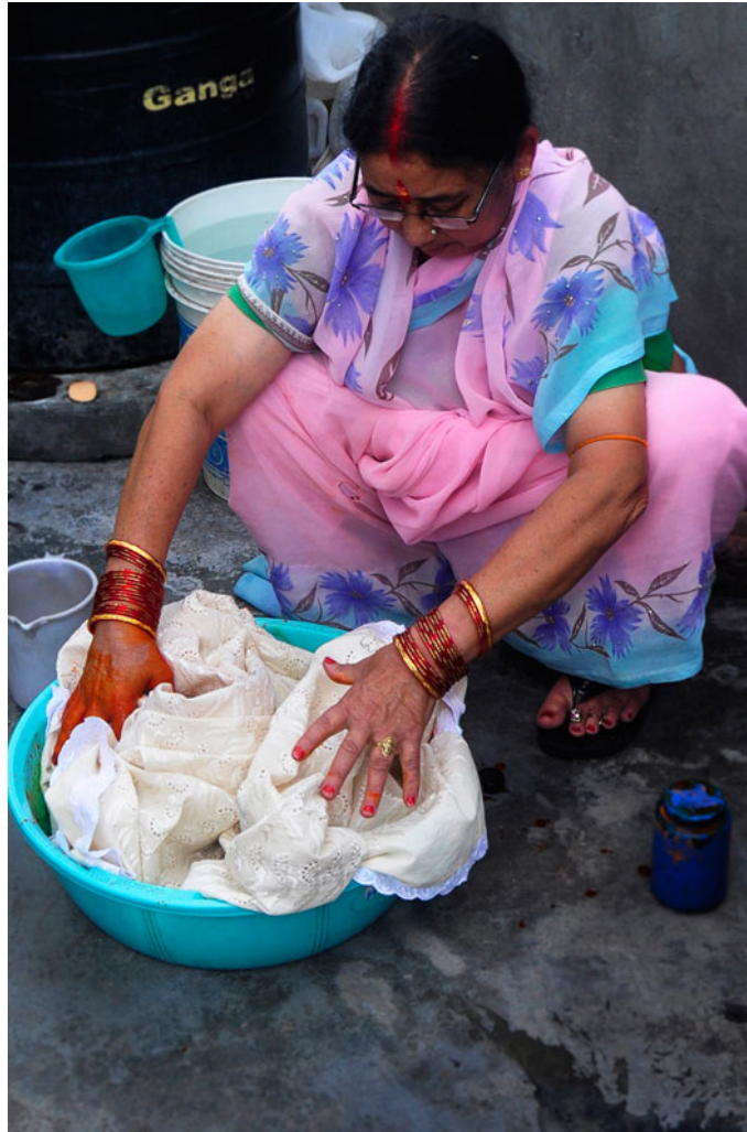
Artisan immerses the cloth in the dye solution.