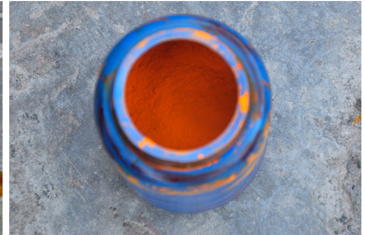
Yellow color is used to dye the cloth.