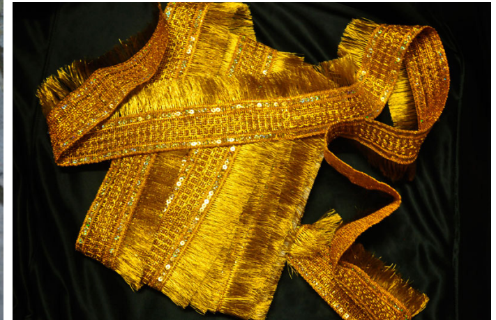
Golden color lace is stitched at the border of the shawl for decoration.