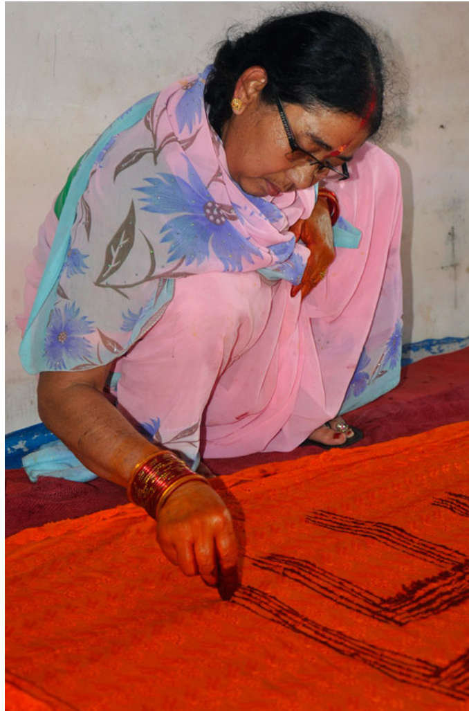
The left remaining area is covered with design of dot patterns.