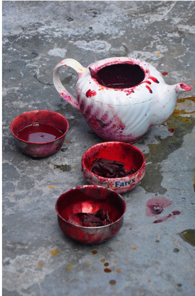
The design is made using red color.