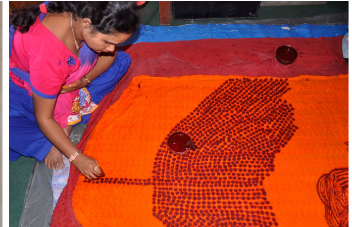
Once designed the cloth is dried in the sun.