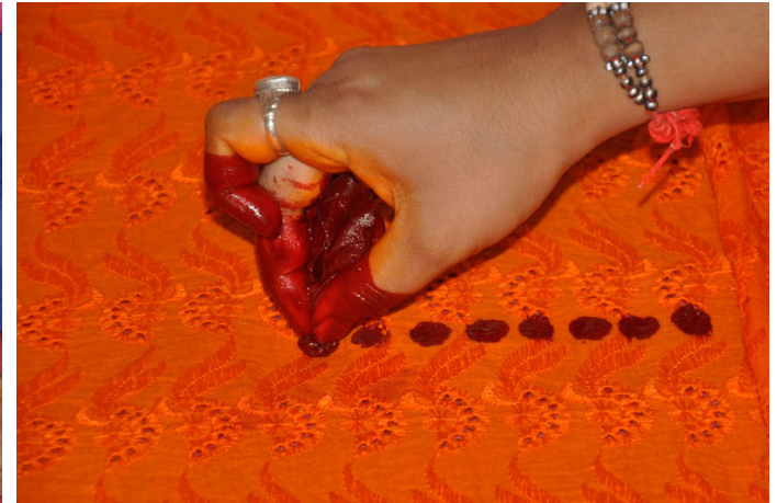
Dot design is made using a gram tied in cloth, dipped in the red color.