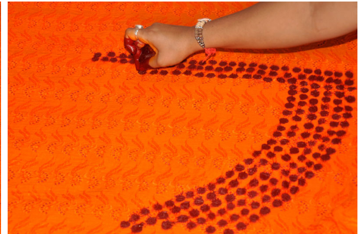
Surya Chandra codi design is drawn in the center of the shawl.