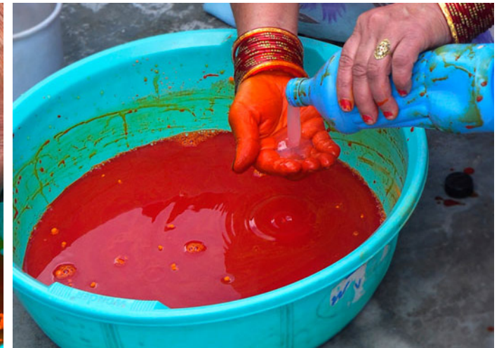
Adhesive is mixed in the solution, to make the color stick strongly to the fabric.