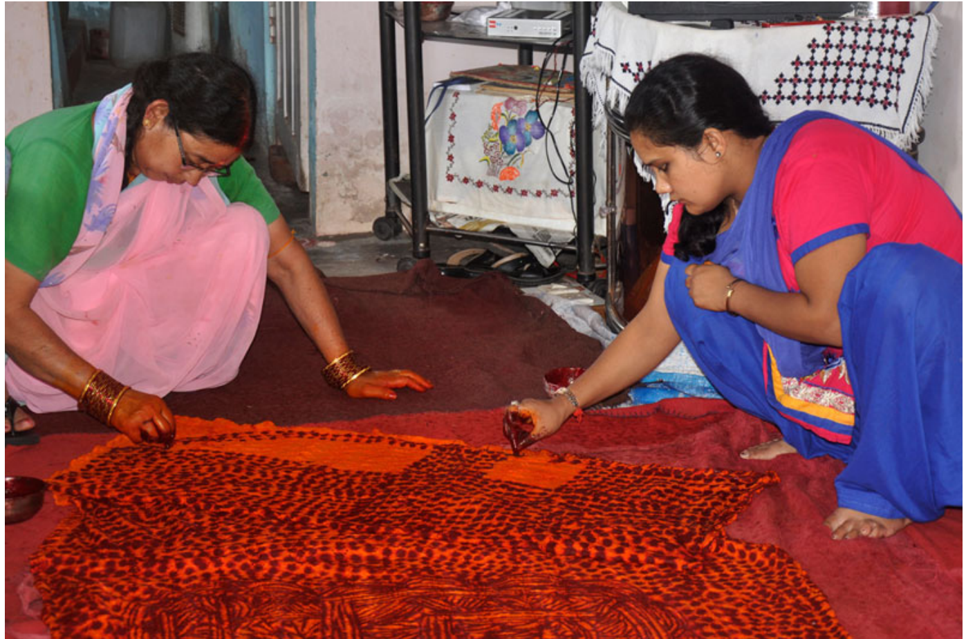
This shawl is designed by women artisans by hand.