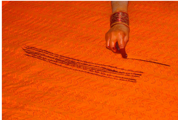
Line patterns are drawn using 50 paise coin tied in cloth and dipped in the red color.