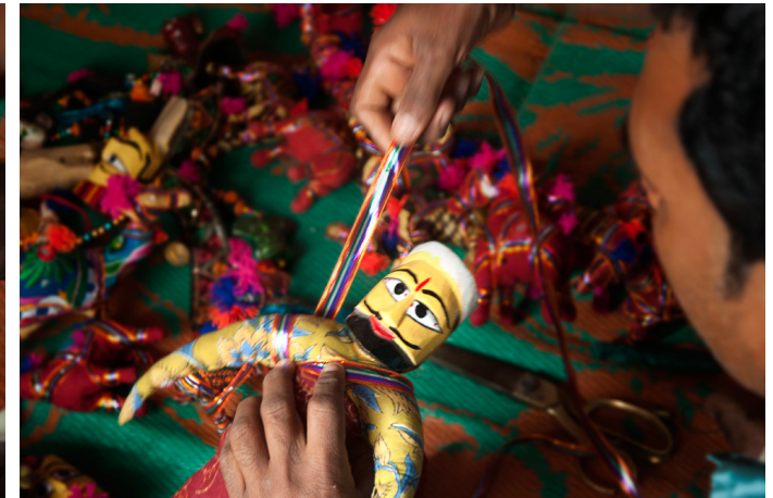
Stitches are covered as well as the puppet is decorated with colorful ribbons.