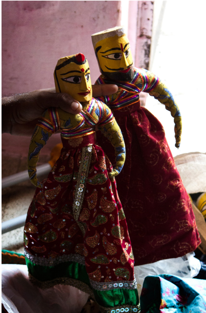
Puppets costumed with traditional theme fabric.