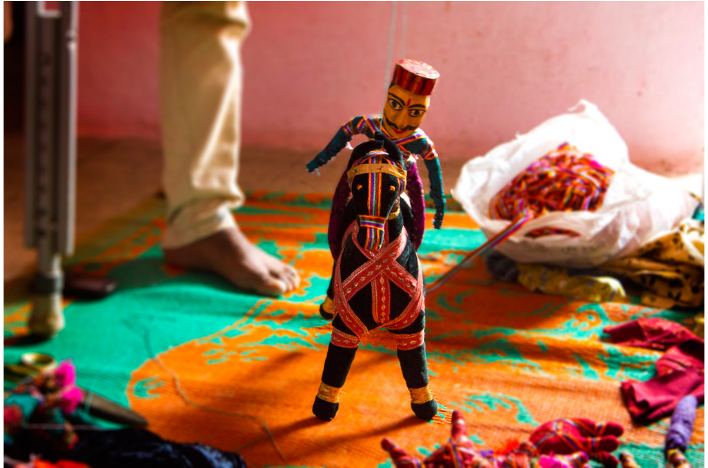
Puppets controlled to perform the action of horse riding.