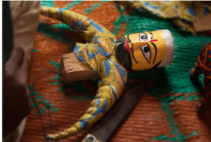
Upper part of puppet's body is completed.