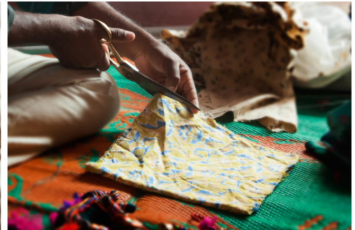
Required size and length of the fabric is cut using scissors.