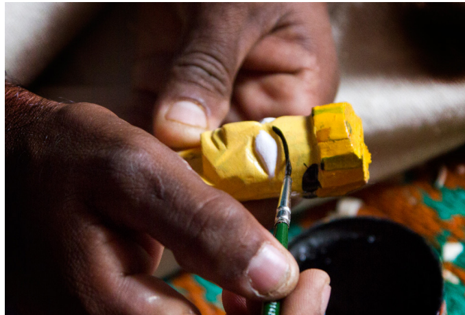
Eyebrows are painted first.