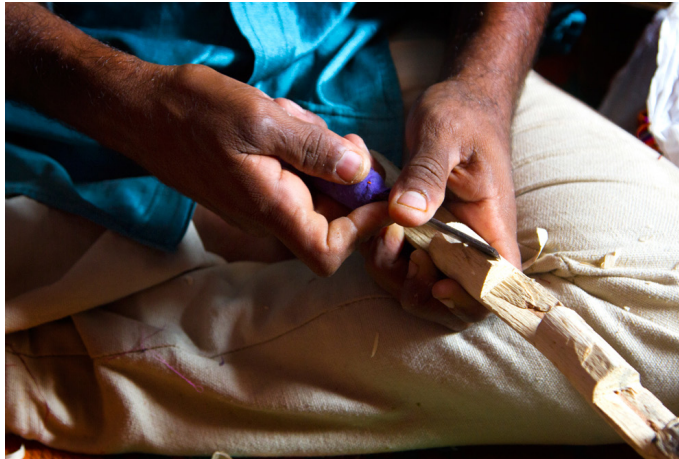
According to the measurements the wood is carved.