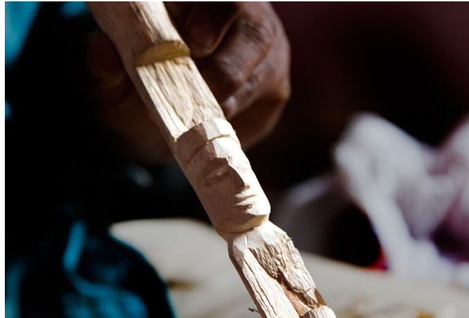
Carved face of the puppet.