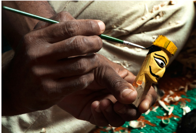
Hair is painted according to the type of character.