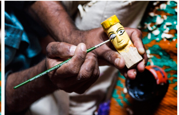
Eyes are painted secondary.