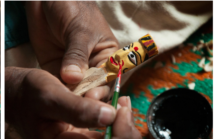
For female character nose ring and bindi is painted.