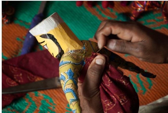
The fabric is stitched from front and back for firm fitting.