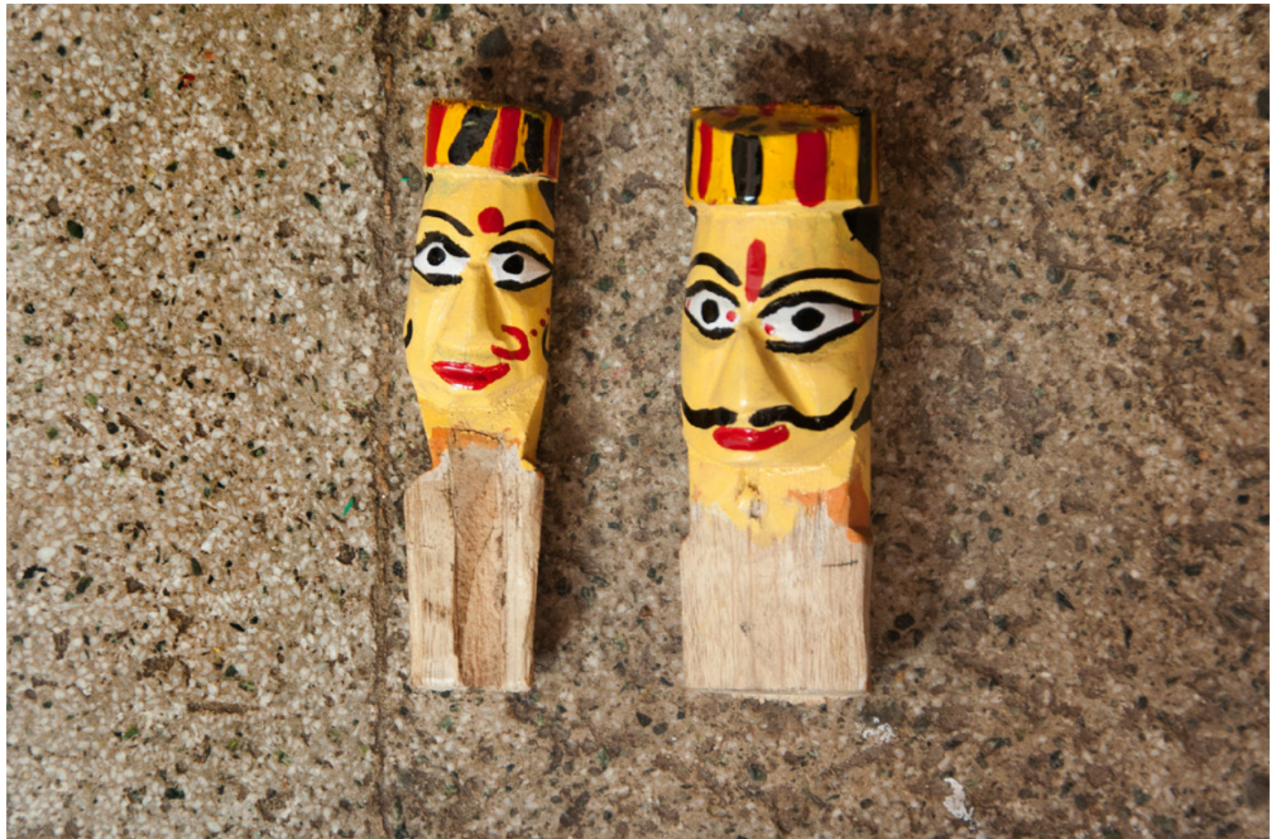
Faces of a male and female puppet made of wood.

Wooden cut pieces with various characters are made at different expressions to signify the play or drama taken as per the role to be played with various colours of paint on it. Mostly the hands are stitched with fabric and stuffing materials to enrich the character playing. Puppets with different items of the plays for the social and religious aspects are taken care of to highlight the in and around activities. Sizes varies from 2.5 inches to 20 inches with varying cost from about Rs.50 to Rs.150. In most of the cases puppets are made for the shows or given to the Handicraft Emporium.