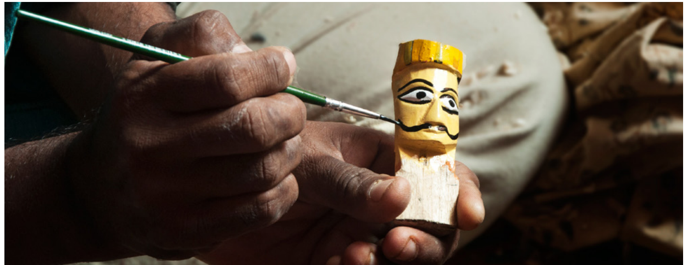
Artisan painting the facial features on the puppets face.

The craftsmen at Ahmedabad makes the puppet by himself and plays them with the help of twines and threads. Craftsmen moves their own body in order to play the character of the show with full enthusiasm in the presence of the crowd watching the puppet show.