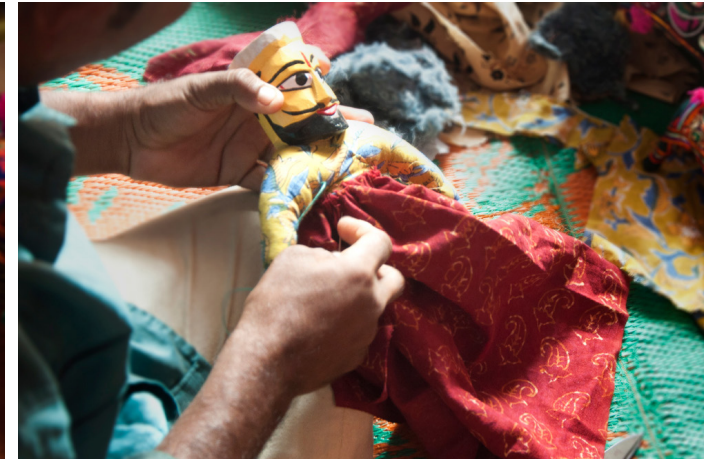
Fabric shaped like a long skirt or pants are attached with the upper body.