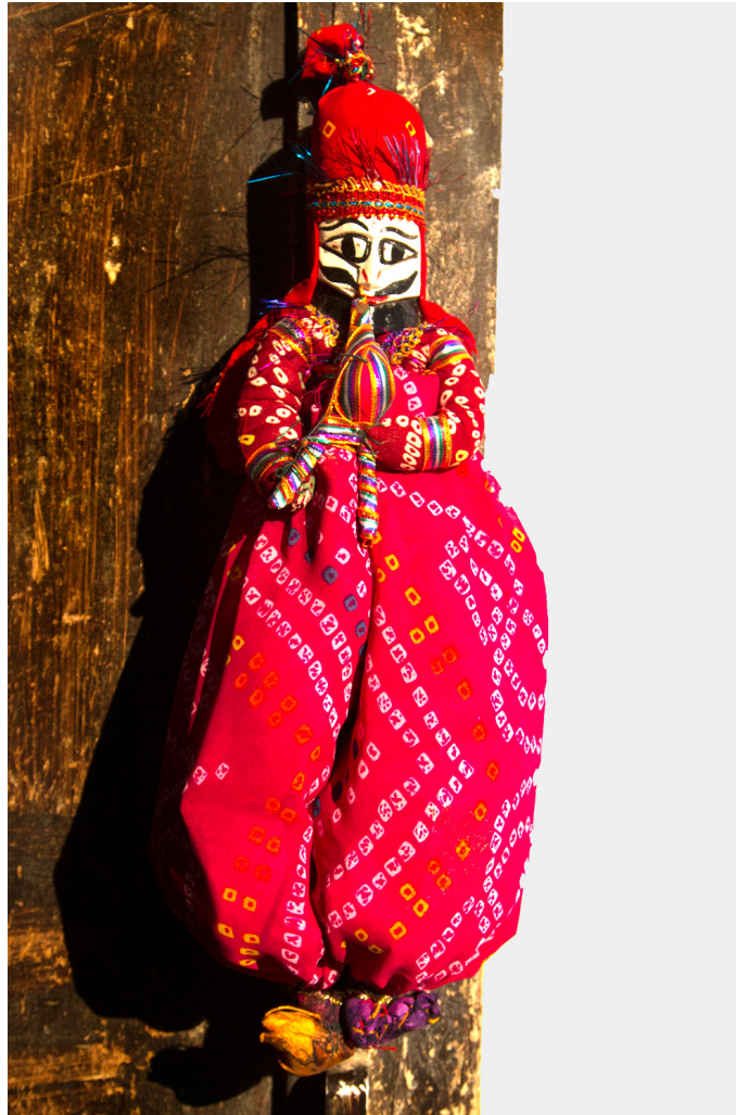
Male puppet customized like a snake charmer.