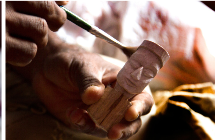
White is painted as a base paint and later light yellow color is painted.