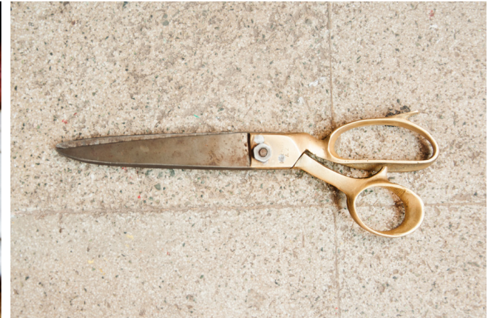
Scissors are used to cut the fabric and thread.