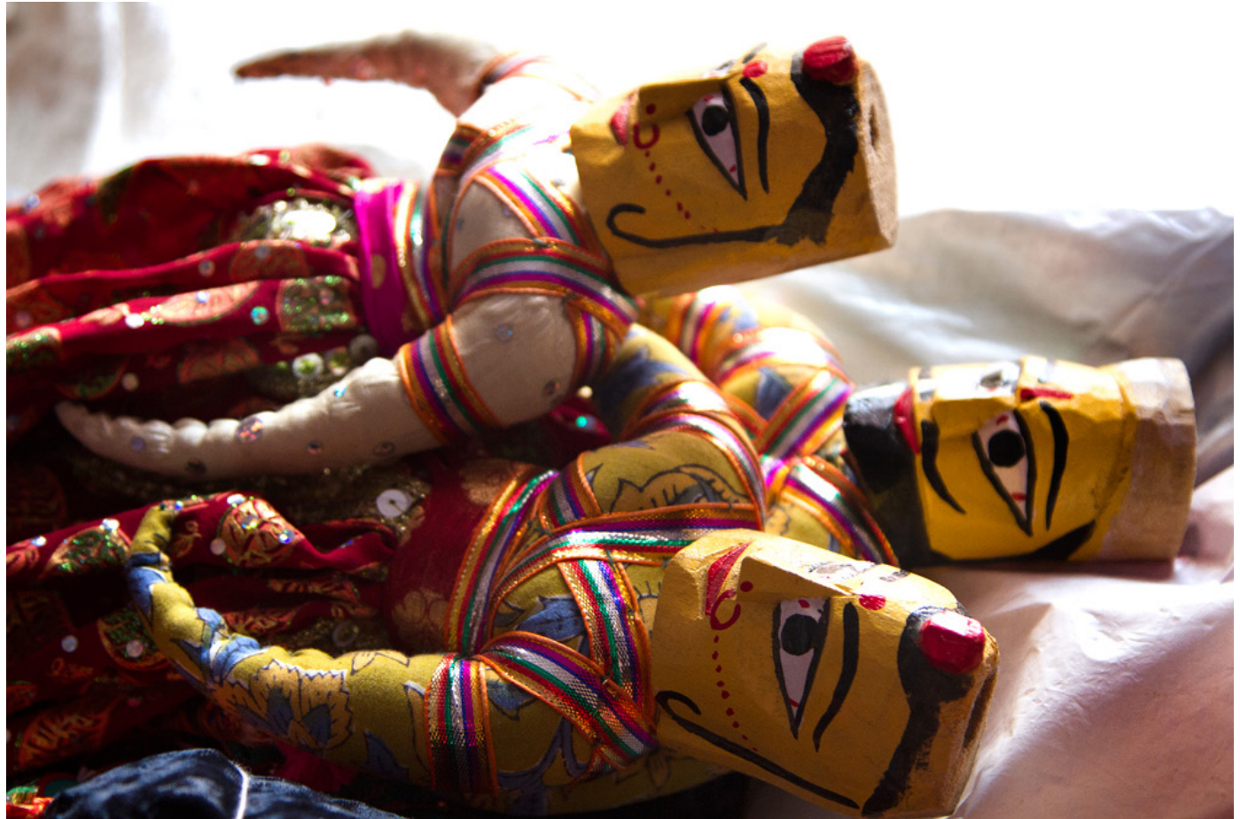
Finished products of the puppets depicting various characters for the puppet show.