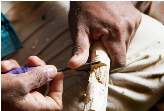
Details are added to the carving.