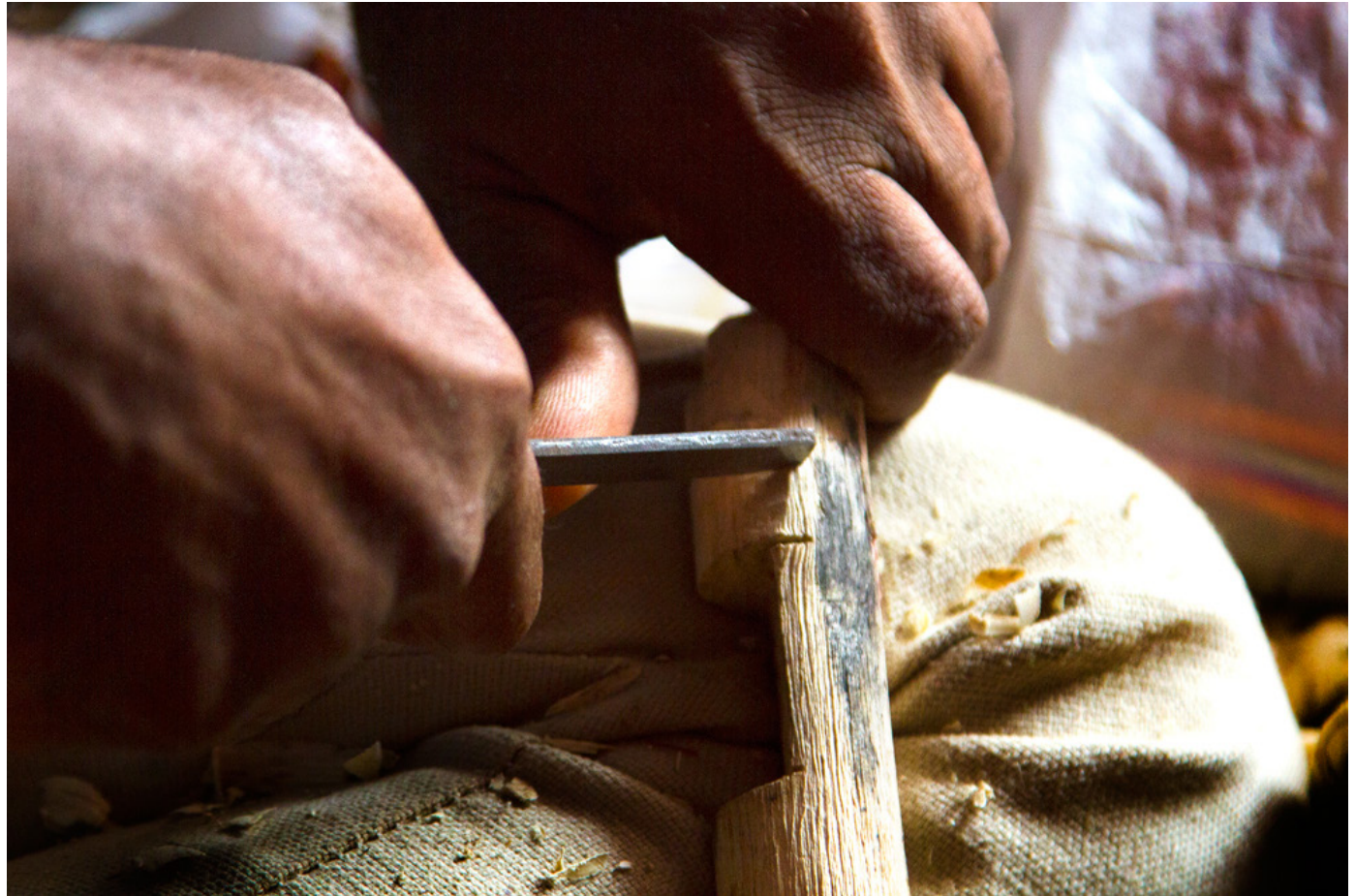
Measurements markings are made on the wood.