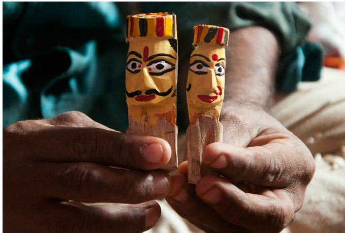
Painted wood pieces of the puppet's face.