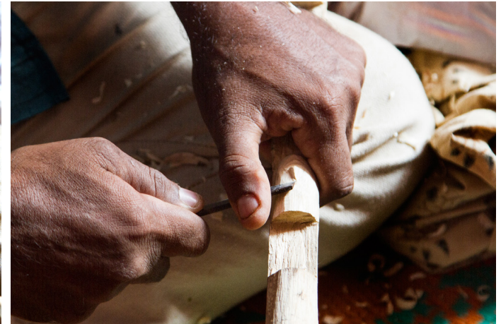
Basic carving of the face features are carved.