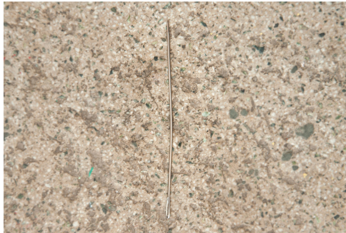
Needle is used stitch the costume and body for the puppet.