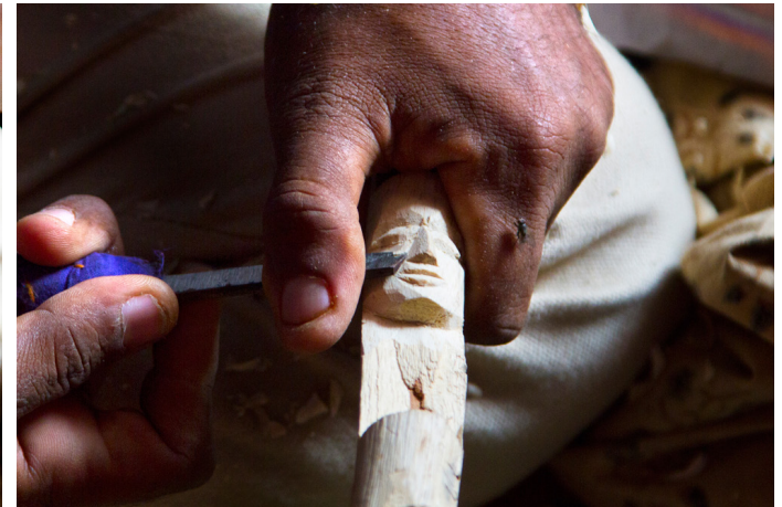
Excess part of the wood is scraped out leaving the surface smooth and even.