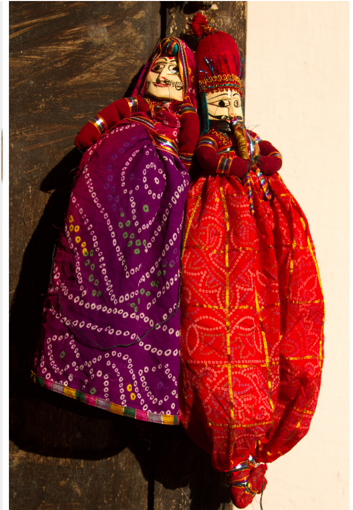
A female puppet and a snake charmer puppet dressed in the traditional costume.