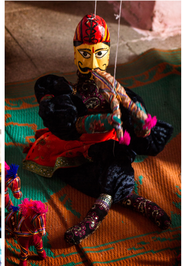
A snake charmer puppet controlled with the strings playing the instrument.