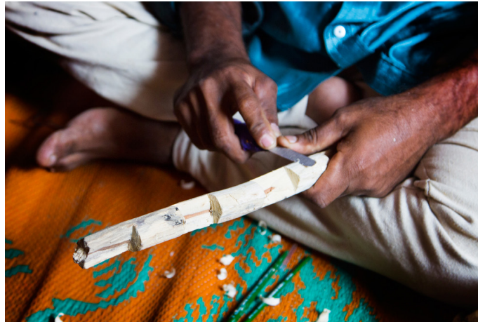
Gulmohar tree's wood is used to make the puppet's face.