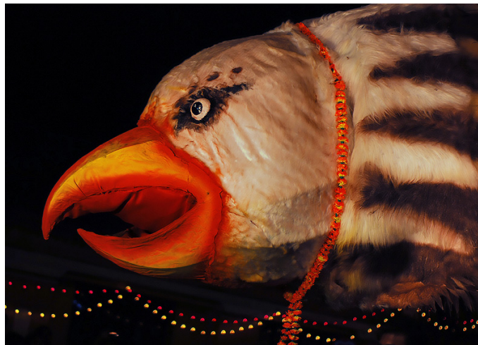
The huge puppets are not only of god or goddess; in these floats have each and every supporting character such as Garuda being a carrier for one of the saints from the mythical stories of India.