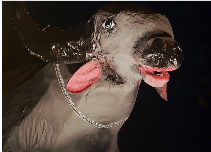
Bibos, the carrier of Lord Yama in its normal look made in the structure of bamboo and wrapped with paper and coloured by spray work.