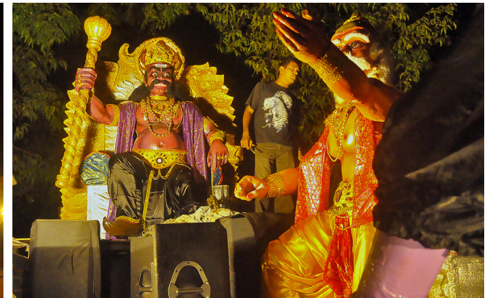
The scenario installed on a trolley from the stories of Lord Yama and his royal adviser. Such floats also carry the huge stereo music systems to play the spiritual songs and also the recorded dialogues from the relevant stories to make the presentation effective during the celebration.