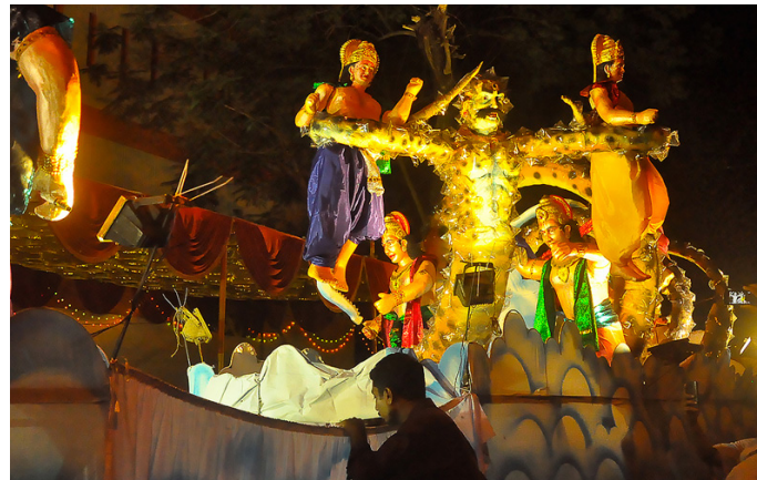
Float carrying the huge mobile puppets of unusual gesture of demon in the battlefield with gods. One gets to enjoy watching the float carrying the number of characters in the procession of Shigmotsav. Such float carries its own identity and uniqueness.