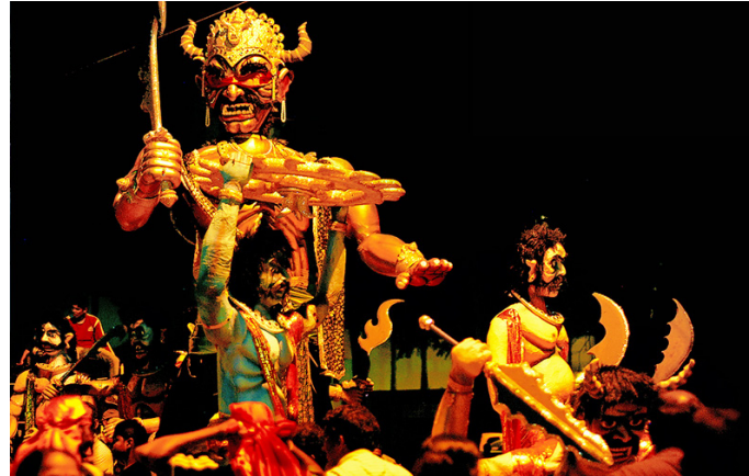
The float is carrying the death god Yama with his followers.

http://www.dsource.in/resource/shigmotsav-goa/procession-floats