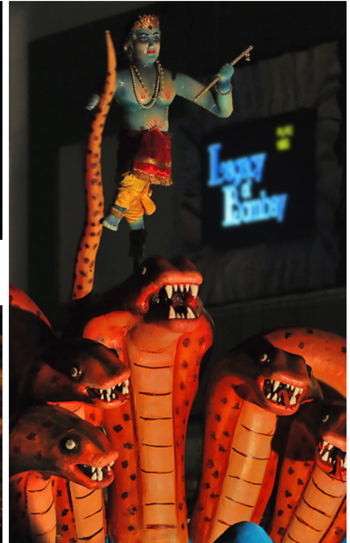
Though the original forms or characters such as Sheshnag are the same but the individual approach of an artist makes it stand out among all other floats. One can enjoy the superior work which not only enhances the beauty of the floats but also gives a meaning to it in the presented scenario.