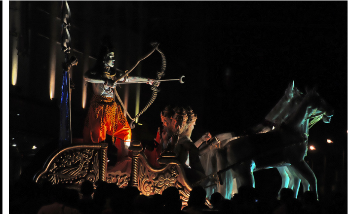
A float carrying the scenario installed on a trolley from the stories of Lord Shiva and Lord Brahma is his Charioteer. The detailing has been done in a very creative manner and proper fabrics are used to justify the characteristics of the personalities mentioned in the stories of mythology.