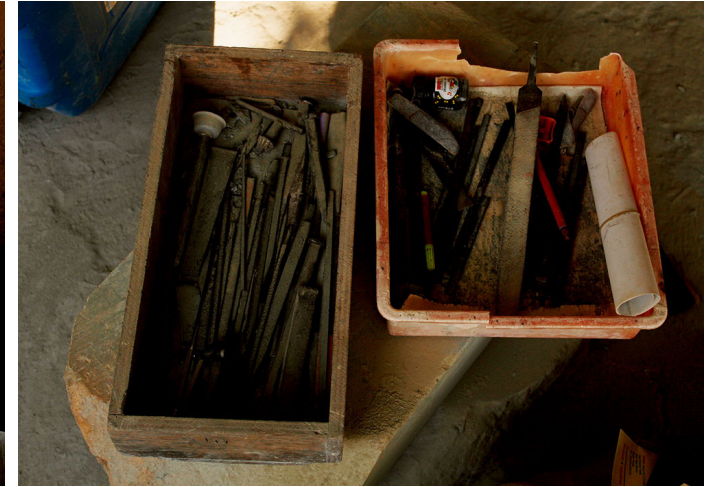
Different Types of files.