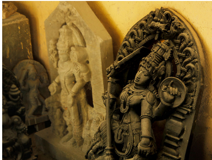
Beautiful details of goddess Mahishasurmardini.