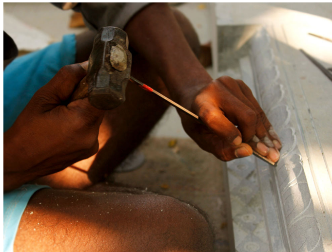
Detailing lotus petals pattern on the doorframe.