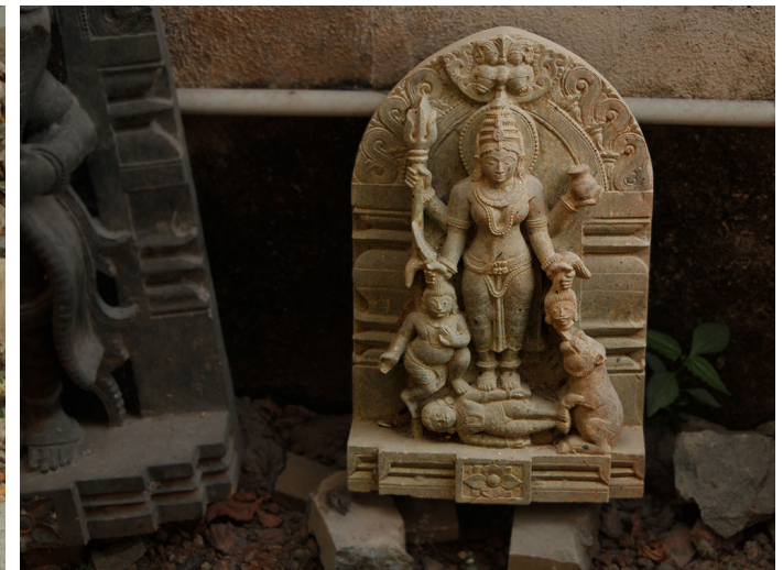
Folk goddess Mahalsa.