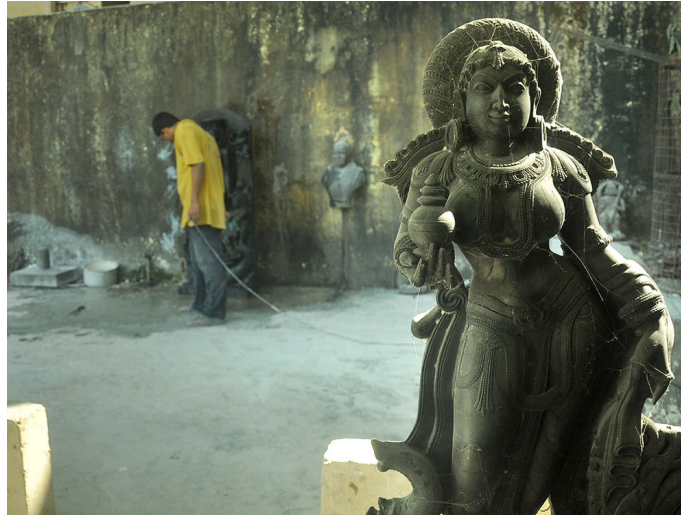
Elegant sculpture of river goddess Narmada.