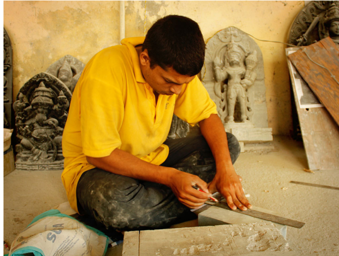
Artist making graph on raw stone block before starting carving.