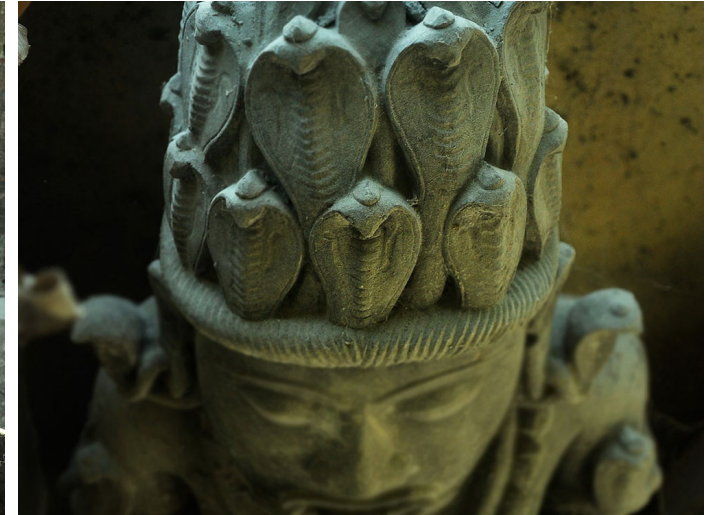
Cobras as a Headgear of folk god Vetala.