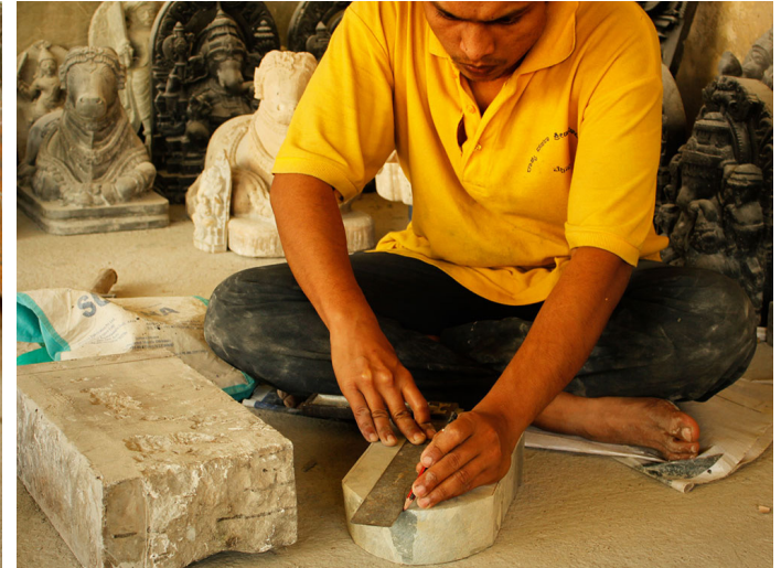
Artist taking measurements of the stone block.