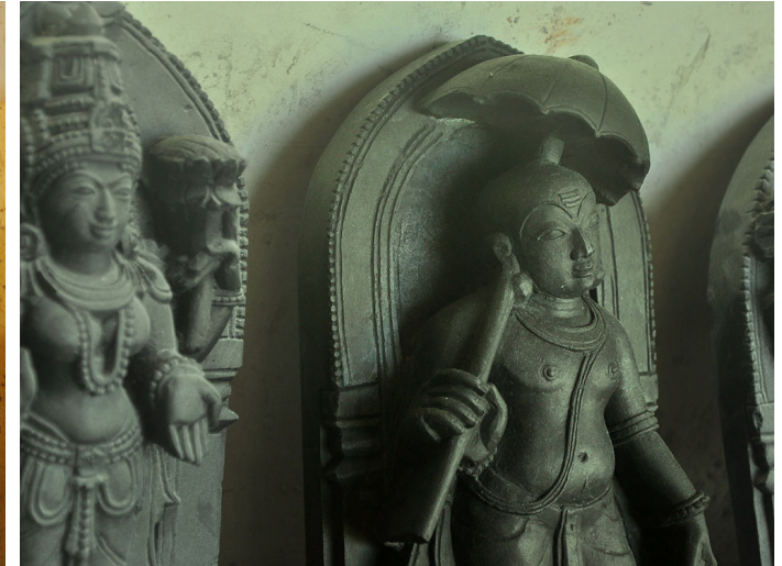
Sculpture of Vamana the fifth incarnation of Lord Vishnu.