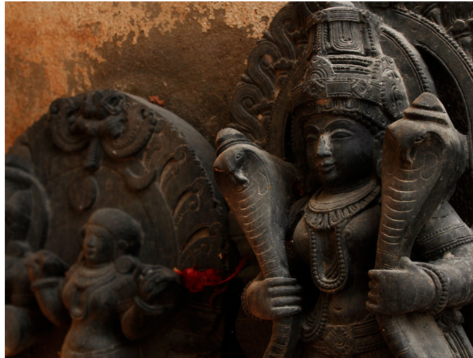
Nagdevi the folk goddess holding beautiful cobras in her hands.