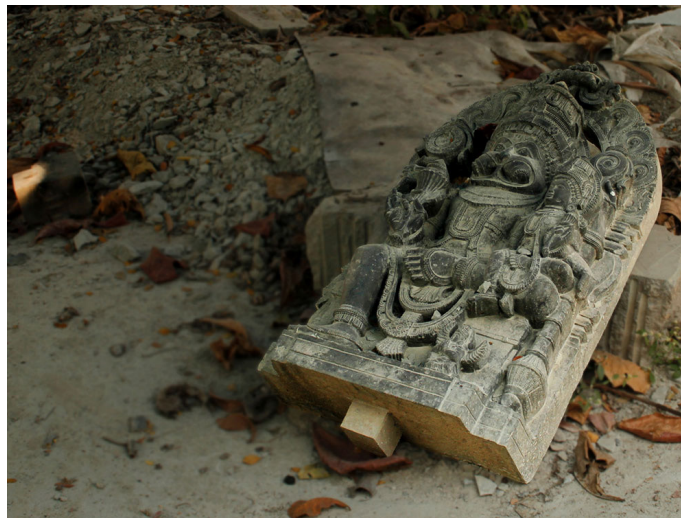
Narasimhalakshmi in a style of Hoysala School of sculpting.