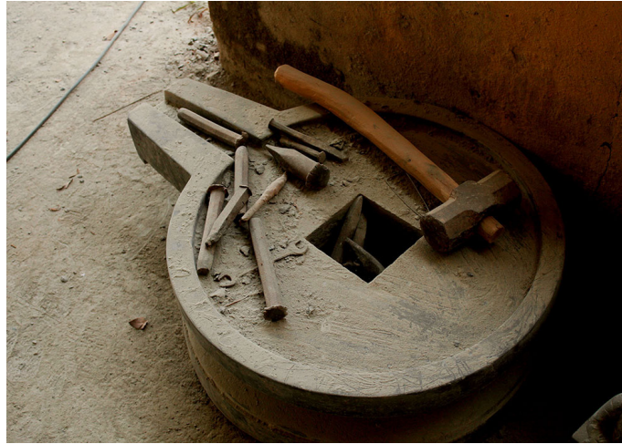
Types of chisel and hammer.