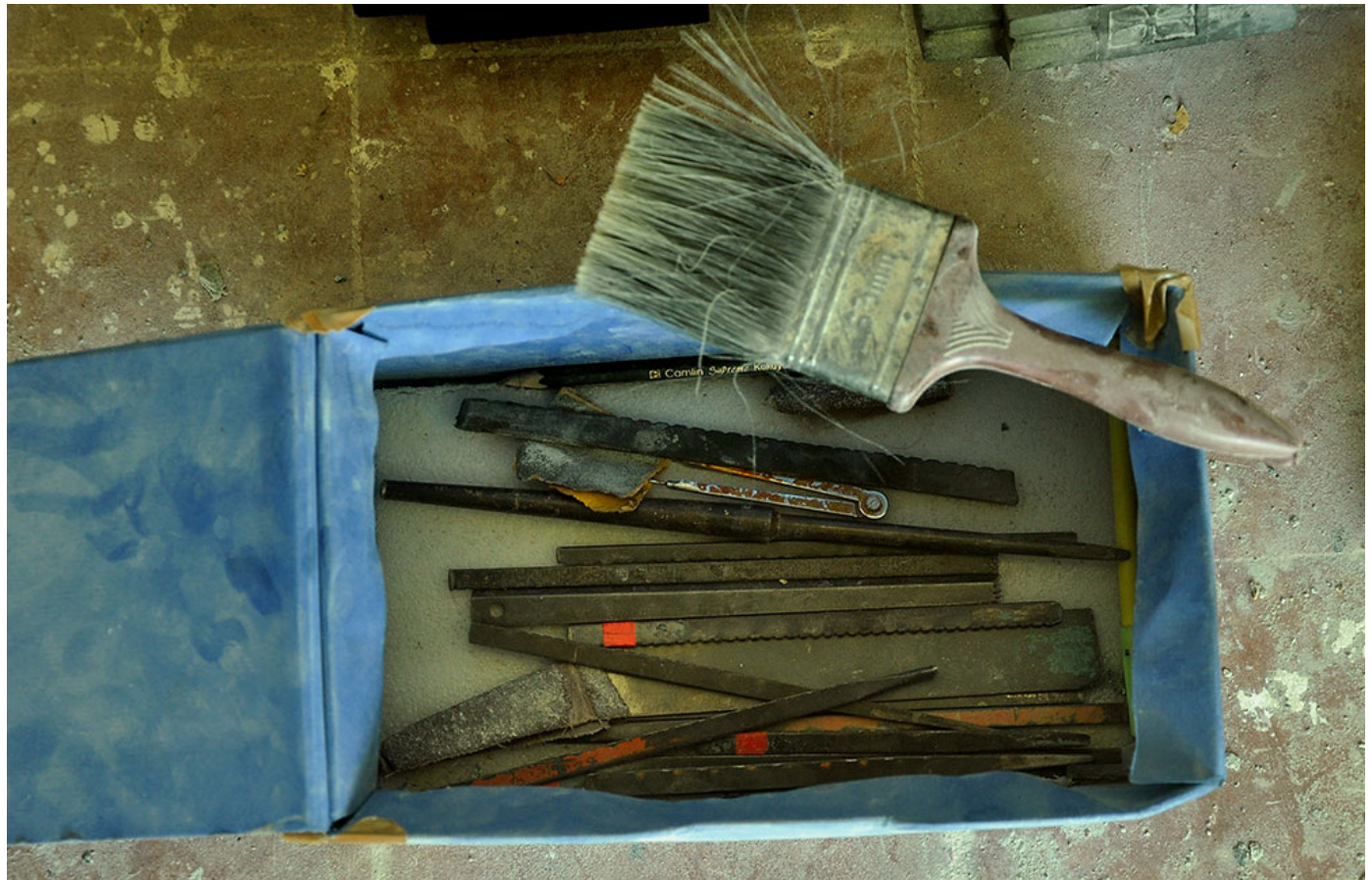
Filing tools and brush.

In addition to these traditional tools they have access to power tools like angle-grinder, hand drills and electric cutters which gives ease in their frantic work.