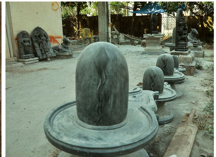
Shivalingas carved in different sizes.