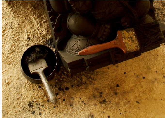
Brushes to polish the sculpture.