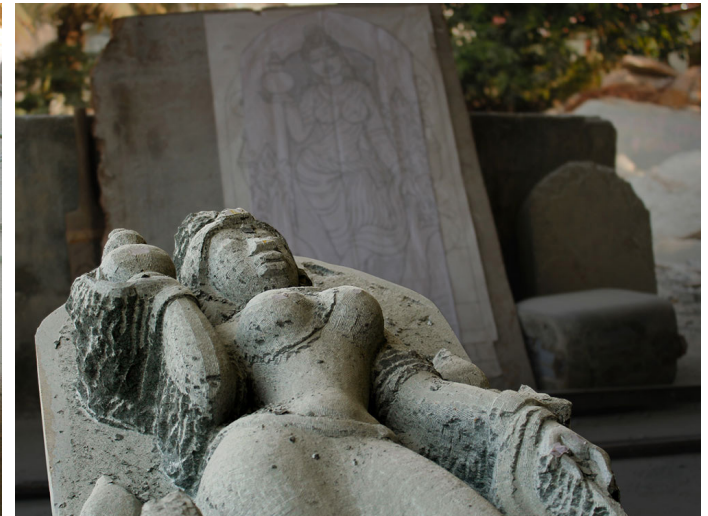
Sculpture in process with the help of Drawing.