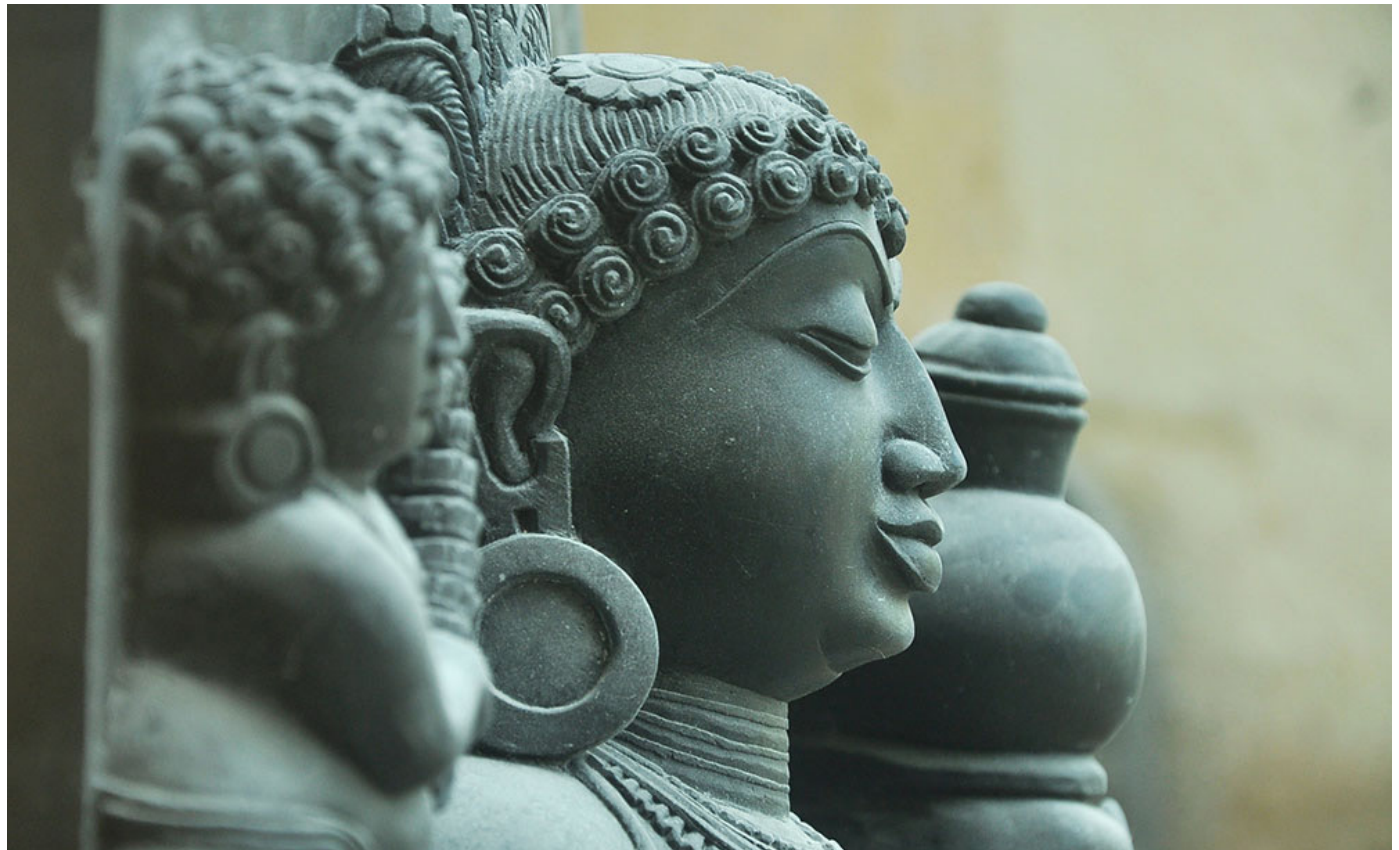
Beautiful stone sculpture of river goddess Ganga.

Shilpaloka offers distinctive and inimitable products to their customers which glorifies their name in the hearts of art lovers. They provide authentic sculptures of various ancient Indian schools of sculpting like Kadamba, Chola, Rashtrakuta which is uniquely carved in various mediums such as black stone, marble, wood and bronze. Their products includes the sculptures of Indian gods and goddesses like Goddess Durga, Lord Brahma, Goddess Mahishasurmardini, Nagdevata(Snake God), Lord Vishnu and his ten incarnations, Lord Nataraja, Lord NarasimhaLakshmi, river goddesses like Goddess Ganga and Narmada as well as some folk lords like goddess Mahalsa, Lord Vetala, village deities and they also make customized door frames. Shilpaloka is specialized in customization according to the prerequisite. Pricing of final product is done according to the use of raw material, design detailing, workmanship; time invested in sculpting and size of the sculpture.