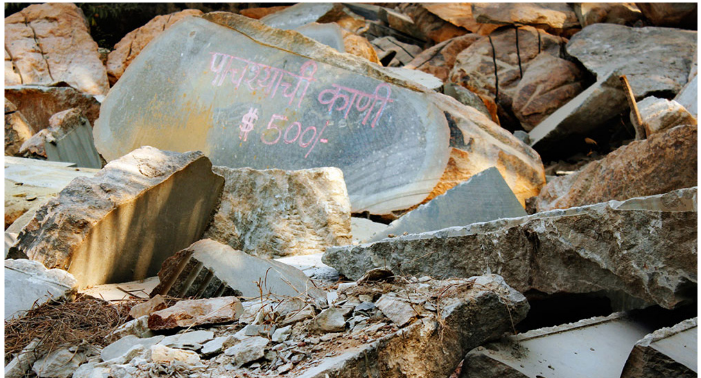
Huge blocks of stones as raw material.

The working philosophy and strategy of Shilpaloka is to revive the ancient Indian school of sculpting and they completely dedicated in customizing sculptures for customers as per their requirement. A customer can approach them with pictorial references and have a one to one design discussion. Once the decision is made artists move on to their research process in which they go through the old paradigm of referred deity or idol to identify the particular iconic elements which is essential for its new depiction and manifestation. As soon as all elements are acknowledged and balanced, artists starts to prepare the line work and transfer it on translucent tracing paper. Afterwards they choose the stone and transcribe the line drawing on it. Once it is done they proceed to carving. Carving is done with the traditional tools like hammers, chisels in various shapes and files. There are few modern tools to smoothen workload of the tedious part like making holes and trimming stone in particular ways, there are drill machines and stone trimmers which are helping the artisans to make carving easy. After the completion of detailed carving they move on to putting black polish to enhance the beauty of artwork, polish helps to shine the surface and it gives the smoother effect to the final output.