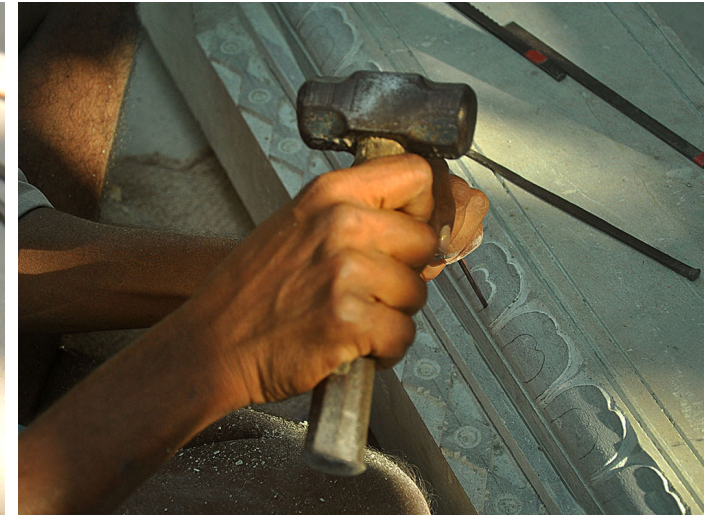
Detailing lotus petals pattern on the doorframe.