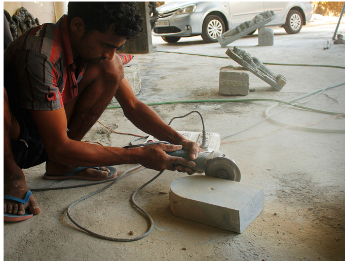
Trimming stone according to the design is one of the important steps in the process of making sculpture.