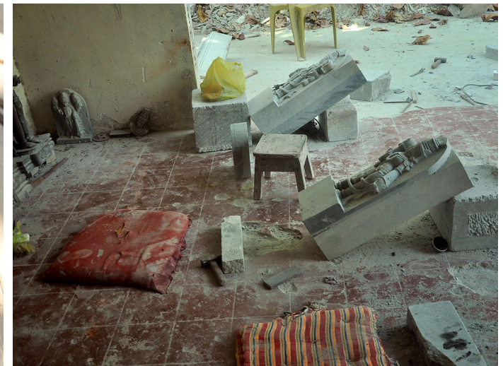
Seating arrangement for artists in working area.