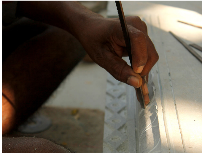
Artist working on a Doorframe for the temple.