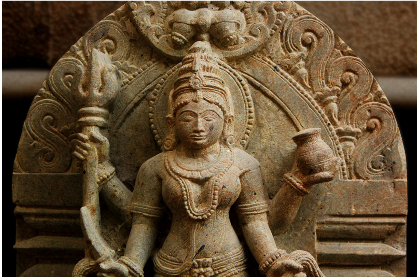
Details of folk goddess Mahalsa.