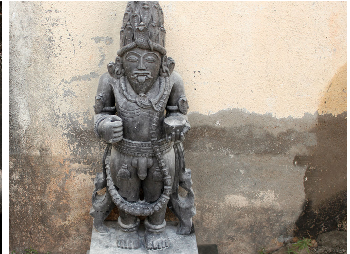
Vetala the folk god.