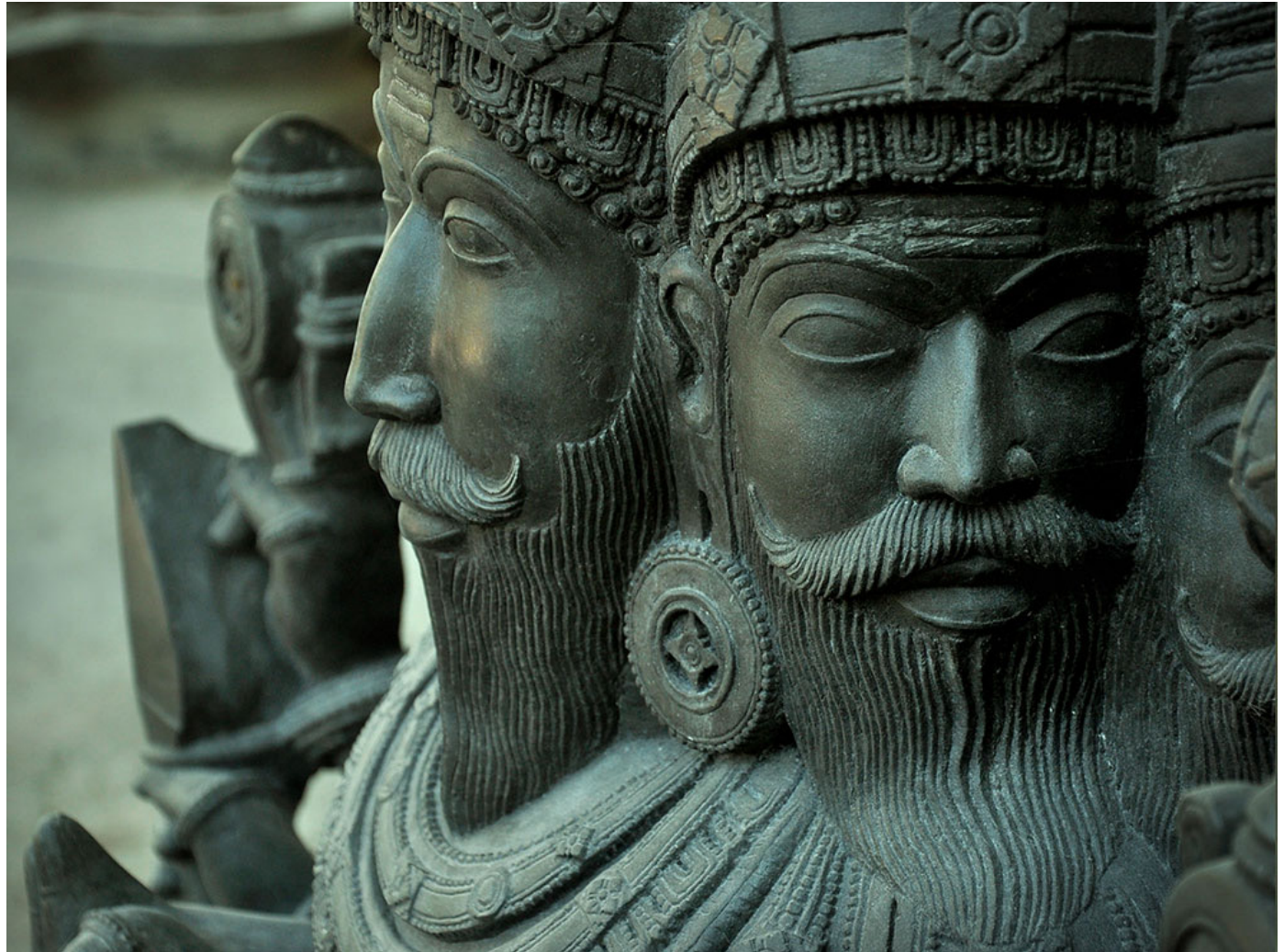
Detailings of Lord Bramha.