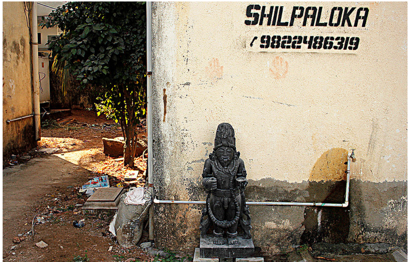
Wall imprinted contact number with the art piece of Shilpaloka.