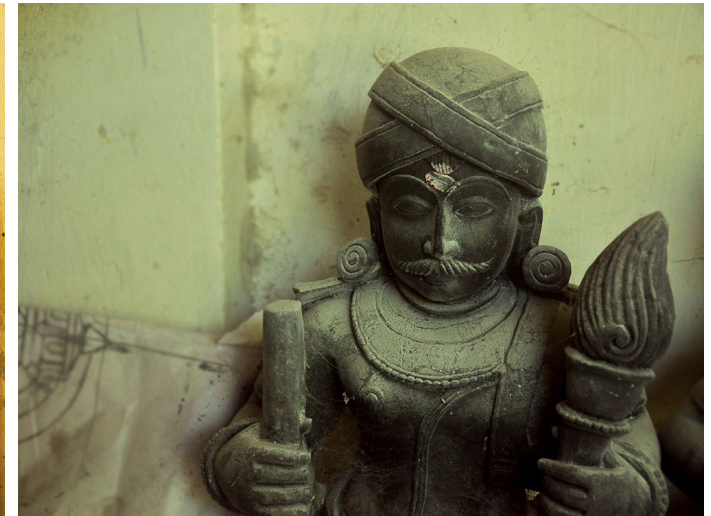
Folk god from nearby village of Goa.