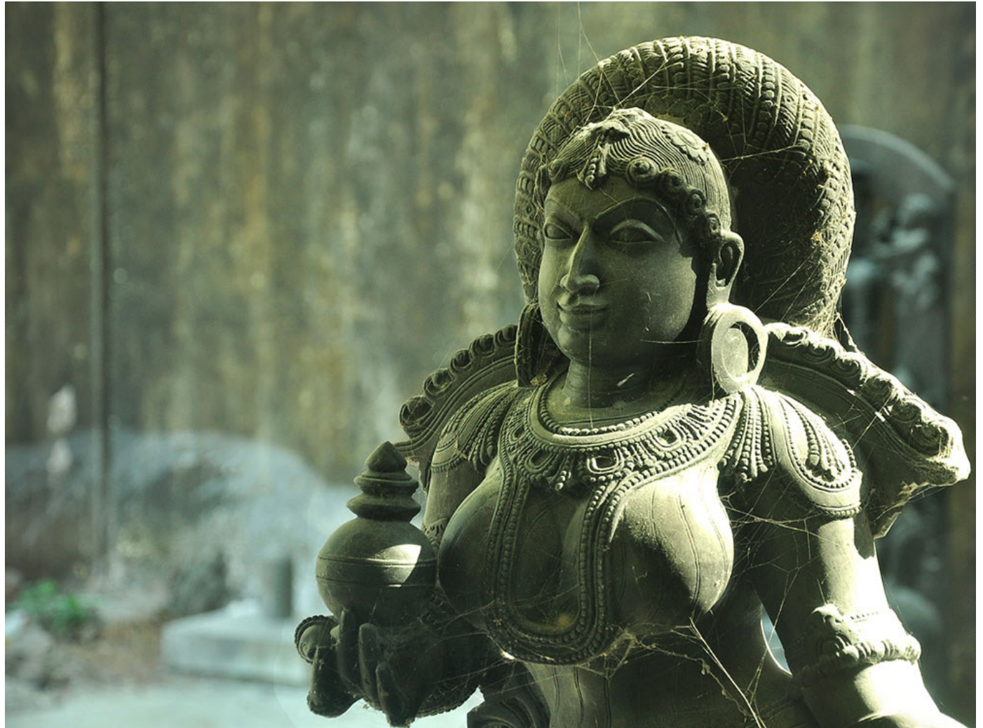
Beautiful details of river goddess Narmada.