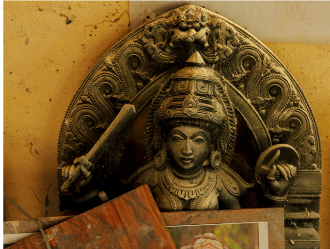
Godess durga in a style of Hoyasala School of sculpting.