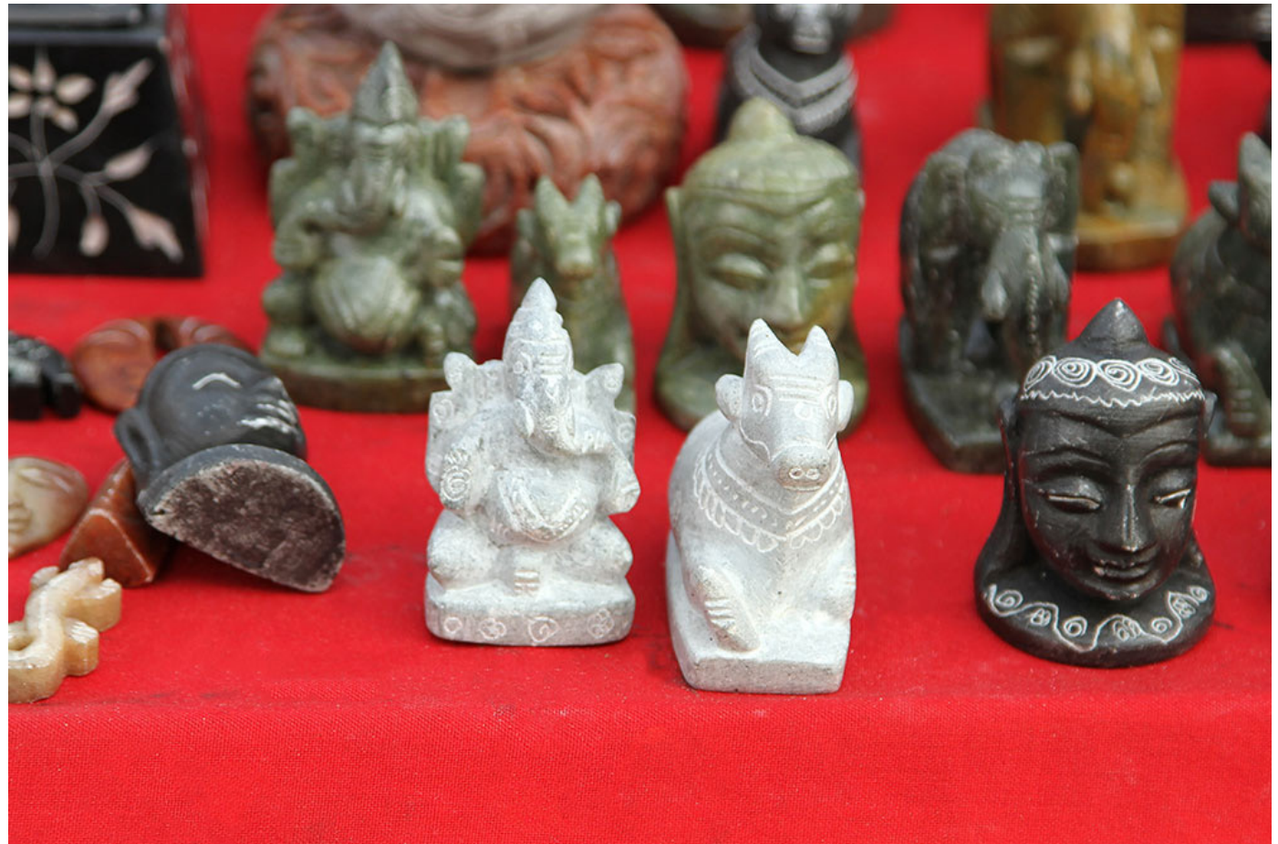
Various types of idols and showpieces are carved out of the soft tone.