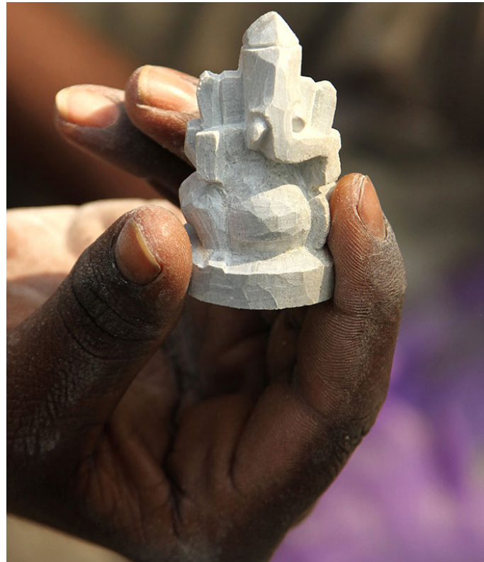
Small idol of lord Ganesha carved out of soft stone.

Hampi was the former capital of the Vijayanagar Empire which is located at the banks of the river Tungabhadra, it is largely known for the existing monuments. It is surrounded by the Tungabhadra on one side and by the invulnerable hills on the other sides. As per the craftsmen this tradition is handed over to them only from their ancestors since various generations. Hampi is located at the Bellary District of Karnataka in India and also known as the former capital of the Vijayanagar Empire.