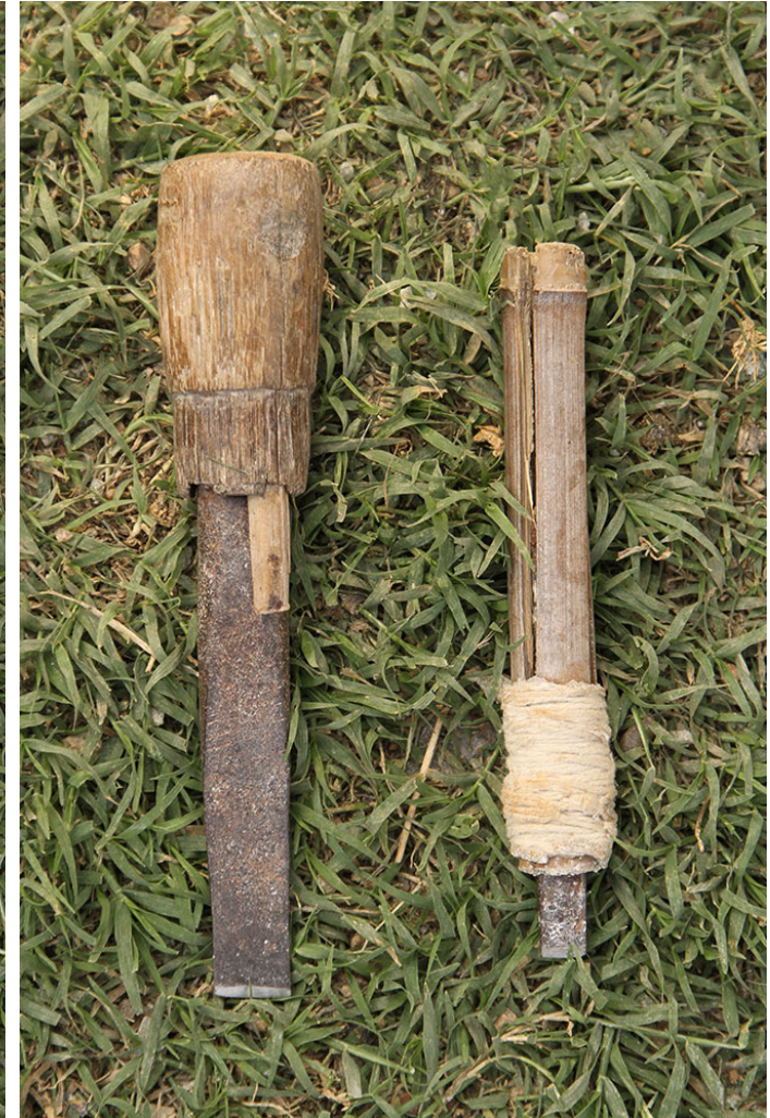
Big and small flat chisel used to give the desired shape to the stone.