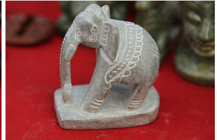
Carved piece of an elephant used as a showpiece.