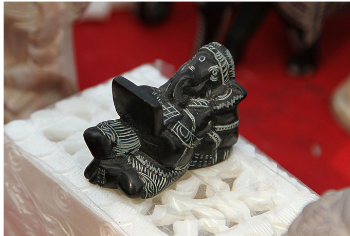
A carved idol depicting lord Ganesha holding a laptop.