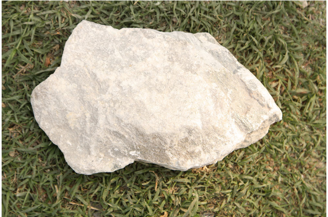
Small idol of lord Ganesha carved out of soft stone.