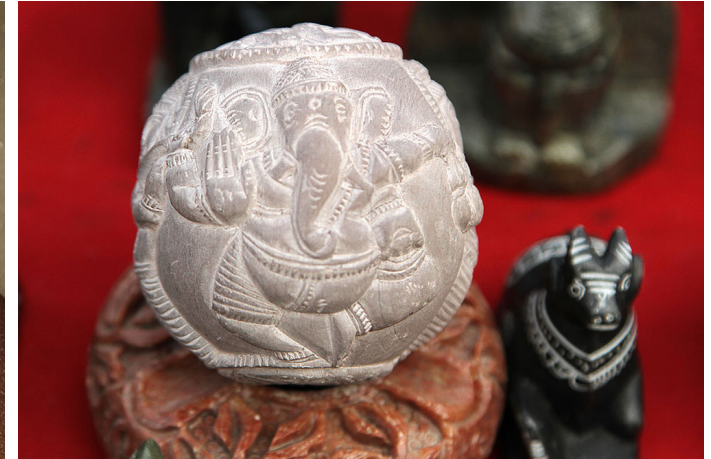
Figure of lord Ganesha carved on a sphered shape stone which can be used as a paper weight or as a showpiece.