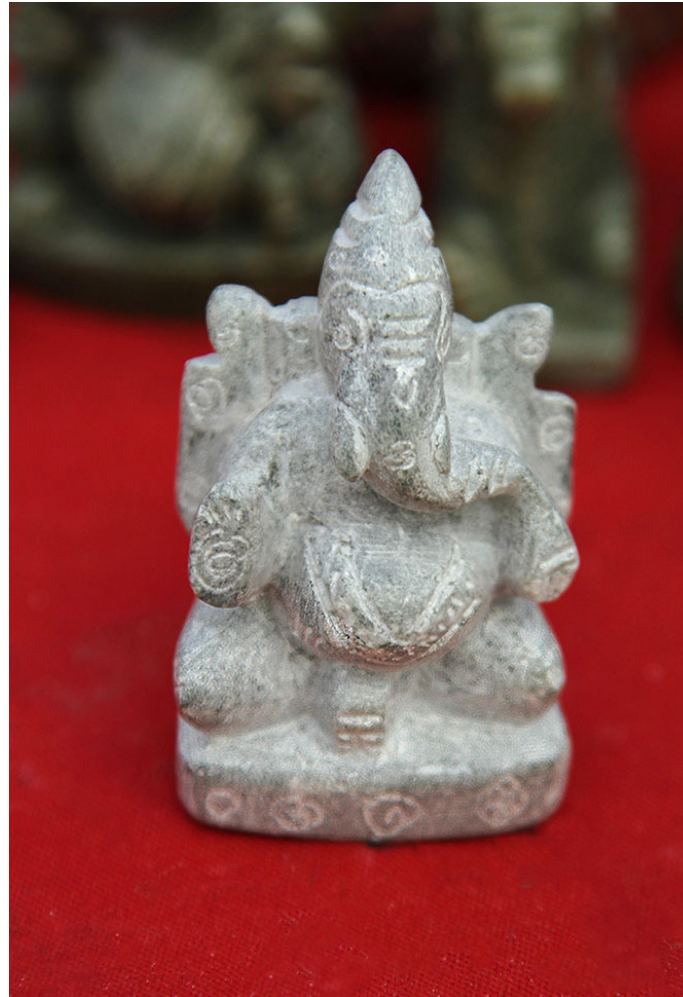
Soft stone carved into an idol of Lord Ganesha.

The products are generally of Ganesh Idols more often, of the smaller sizes in large numbers with the cost from Rs. 300, bigger ones of about Rs. 400 and above. Statutes of Nandi, Elephant, Shivalingam, black coloured Elephants, idols similar to Buddha are made by the craftsmen. Also this craftsmen makes Idols out of the marbles as per his design inspirations.