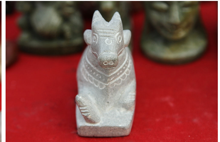
Small-carved idol of Nandi.