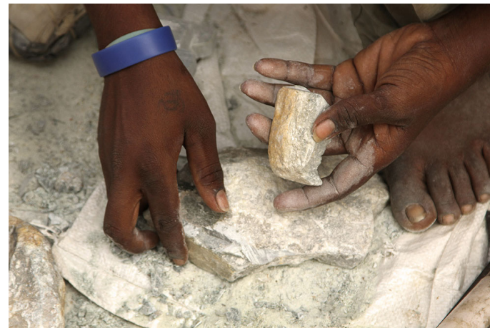
Required size of stone is cut out from the big piece or block of stone.