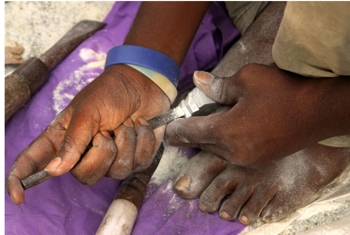
Edges and curves of the idol are chiseled to give accurate shape.

http://www.dsource.in/resource/soft-stone-carving-hampi/making-process