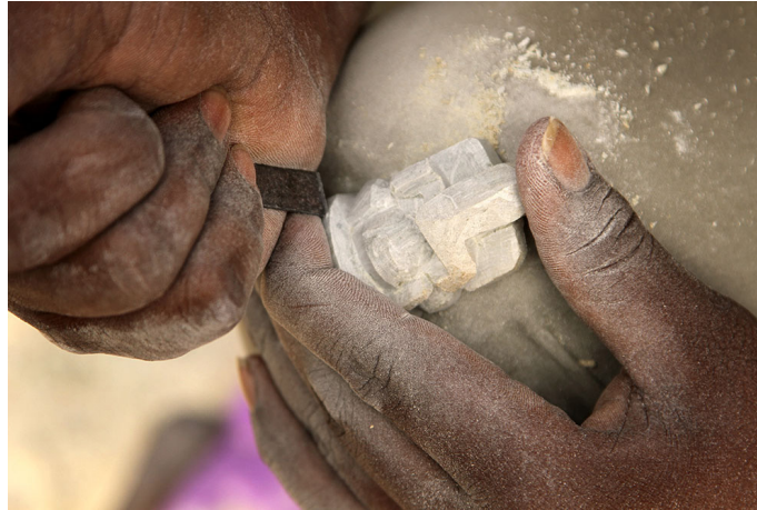
The stone's nature is soft enough to be carved without the pressure of hammer on the chisel.