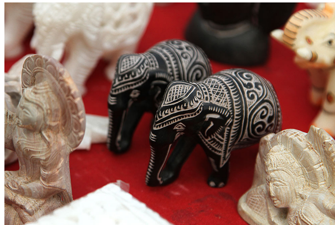
Carved pieces of elephants painted with black color giving the product a rich look.