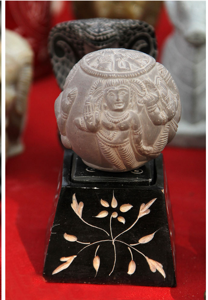
Carving of god made on a spheroid shaped soft stone used as a showpiece.