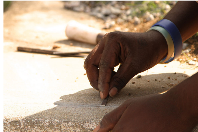
Edges of the chisels are sharpened before carving.

http://www.dsource.in/resource/soft-stone-carving-hampi/making-process