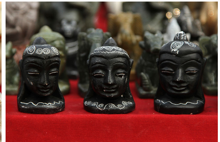
Idols depicting lord Buddha.