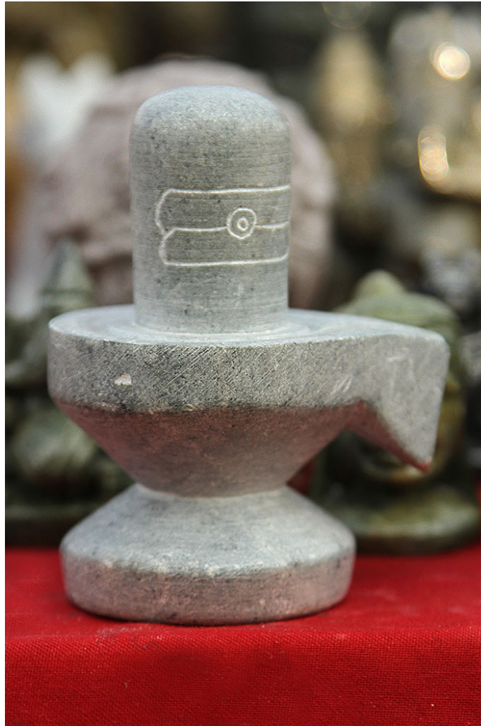
Shiva linga carved out of soft stone.