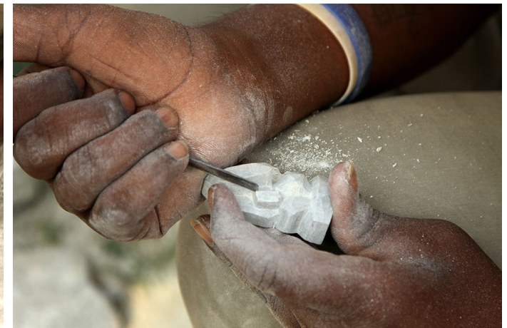
With flay chisel the rough edges are scraped and smoothen.