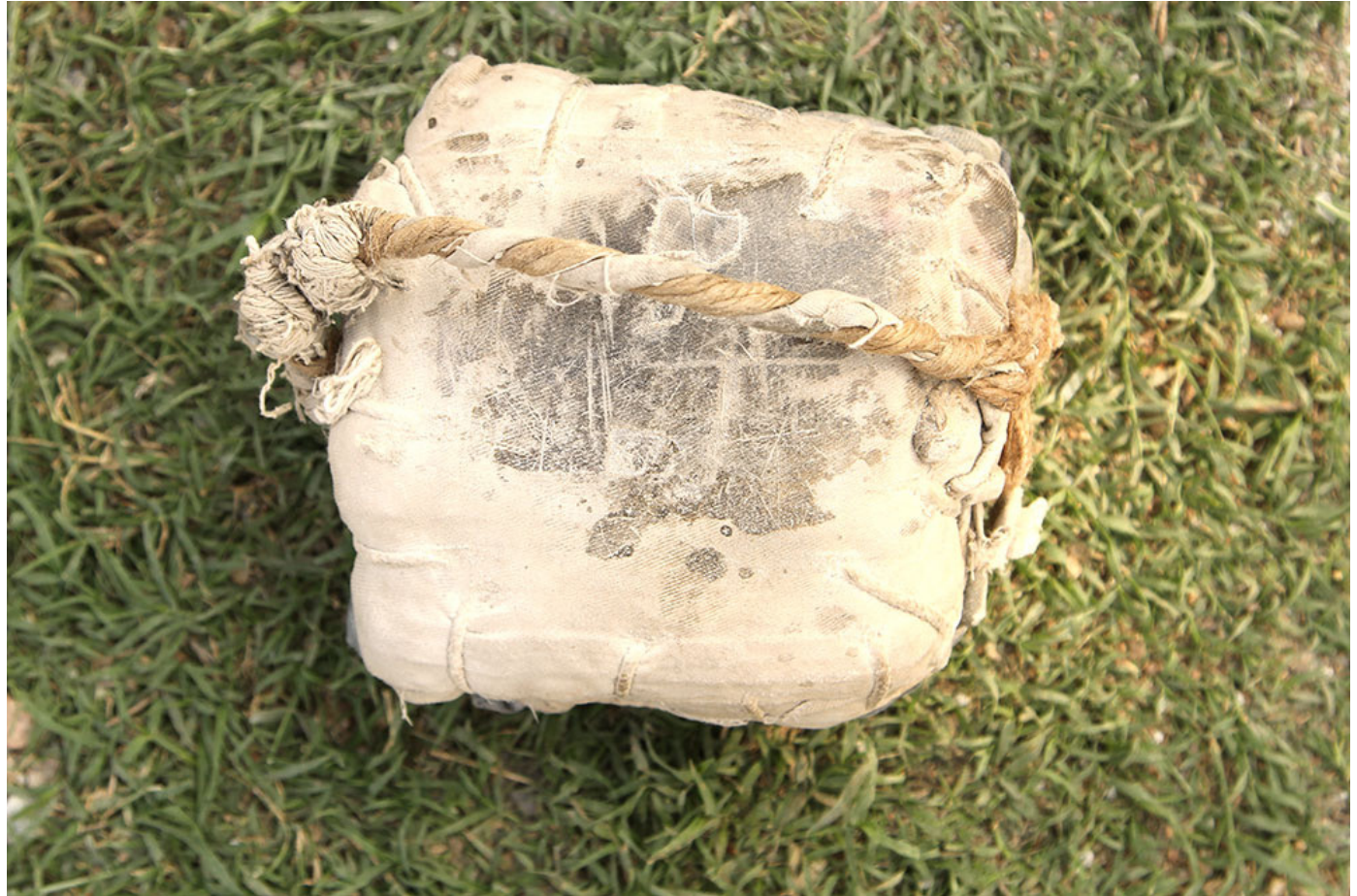
Customized palm cushion made of cloth and rubber sheet, which is used, as a hammer to hammer the chisel while carving.