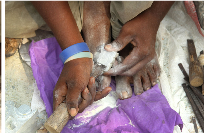
Back part of the idol is scraped out to keep plain surface.