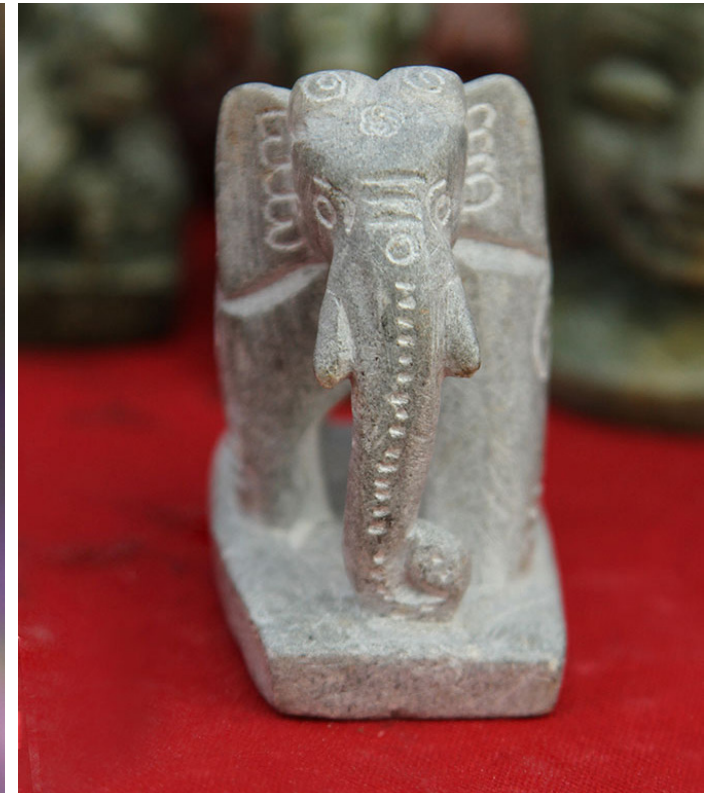
Carved idol of an elephant used as a showpiece.