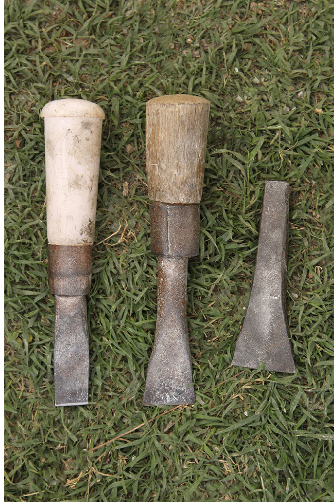
Big flat chisels are used to cut the stone to the required size and shape.