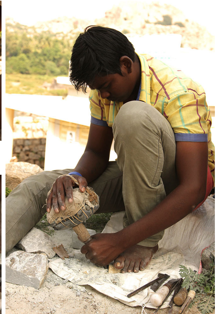
Stone is begun to chisel to give the desired shape.