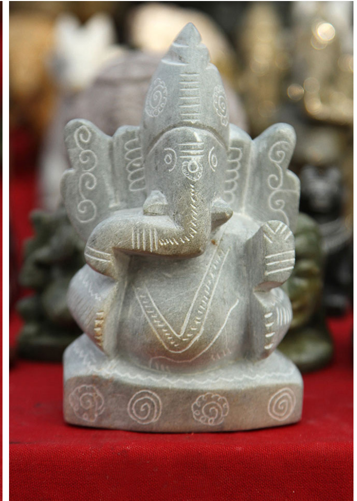
Another carved piece of Ganesha with a smooth finishing.