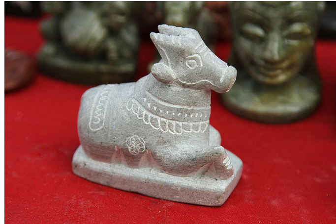
Idol of Nandi carved and chiseled with few designs.

http://www.dsource.in/resource/soft-stone-carving-hampi/products