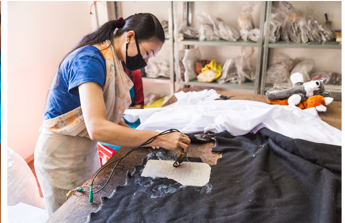
Alternative way of cutting parts using heated wire frames.