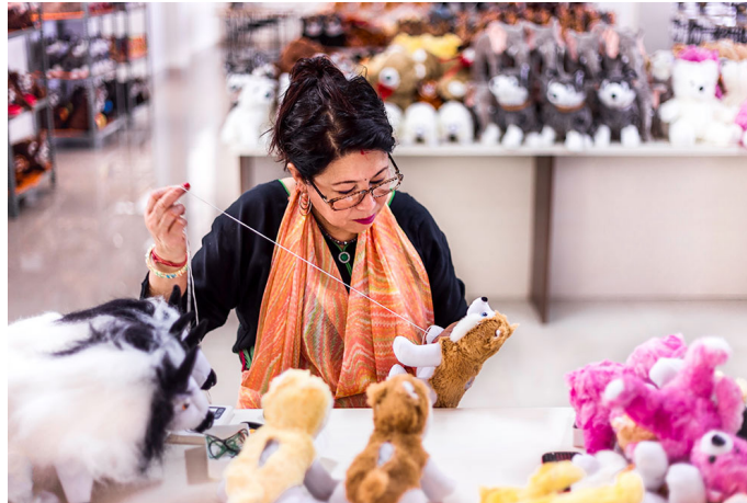
Artisan finishing a soft toy at the production unit.