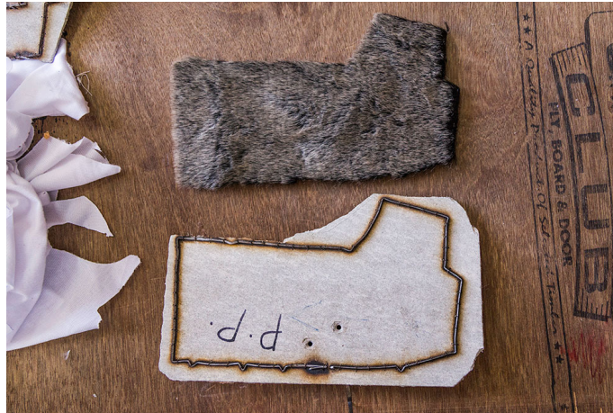
Alternative way of cutting parts using heated wire frames.