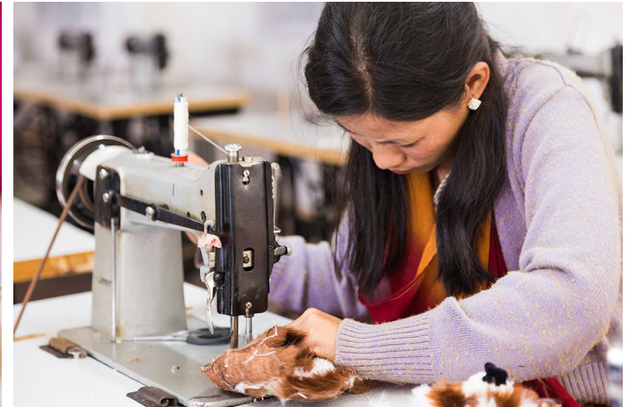
Stitching the individual parts.