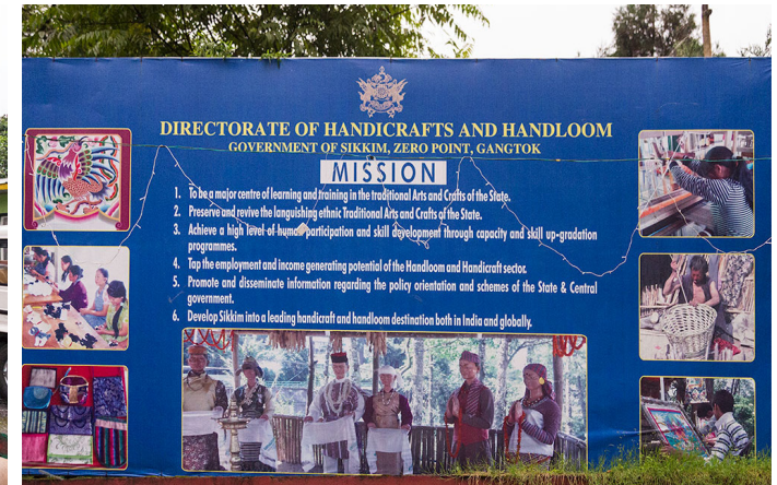
Hoarding explaining the mission of directorate of handicrafts and handloom.