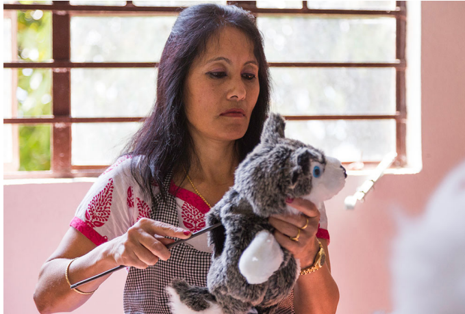
Filling with cotton.