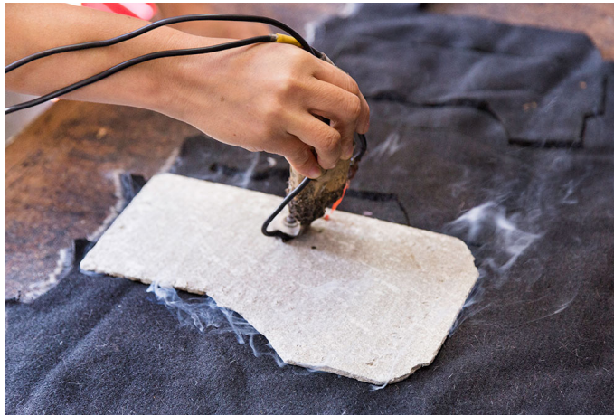
Alternative way of cutting parts using heated wire frames.