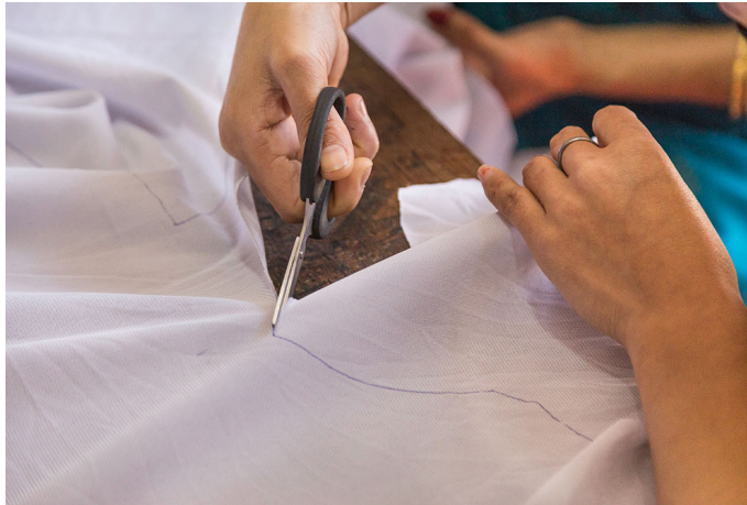
Artisans cutting different parts of the design.