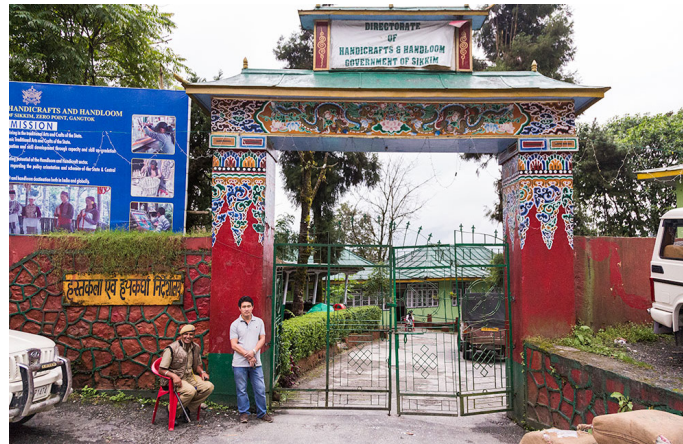
Directorate of handicrafts and handloom head office at Gangtok.

Sikkim is 2nd smallest Indian state located in the north-east India. Sikkim chose to remain independent when India got independence in 1947. In 1975 it became the 22nd state of India after a treaty with the then Prime Minister of Sikkim. Sikkim has been very successful in protecting its cultural heritage along with embracing the modern ethos. The state has a very diverse flora and fauna and occupy a special place in India for it.