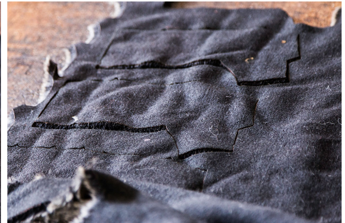
Alternative way of cutting parts using heated wire frames.