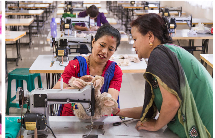
Trainees learning at the training unit.