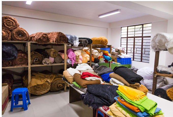
The store room at the soft toys unit.

Soft toys production process starts with design of the product on paper or a computer. A prototype is then created to test whether it is working or not. After iterating again and again the design is finalised. A mould is then constructed to produce the design at a mass level. The process of creating a soft toy involves cutting the parts, stitching, eyes, filling with cotton and finishing.