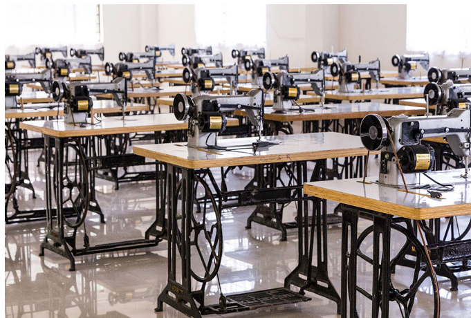
Sewing machine at the soft toys training unit.