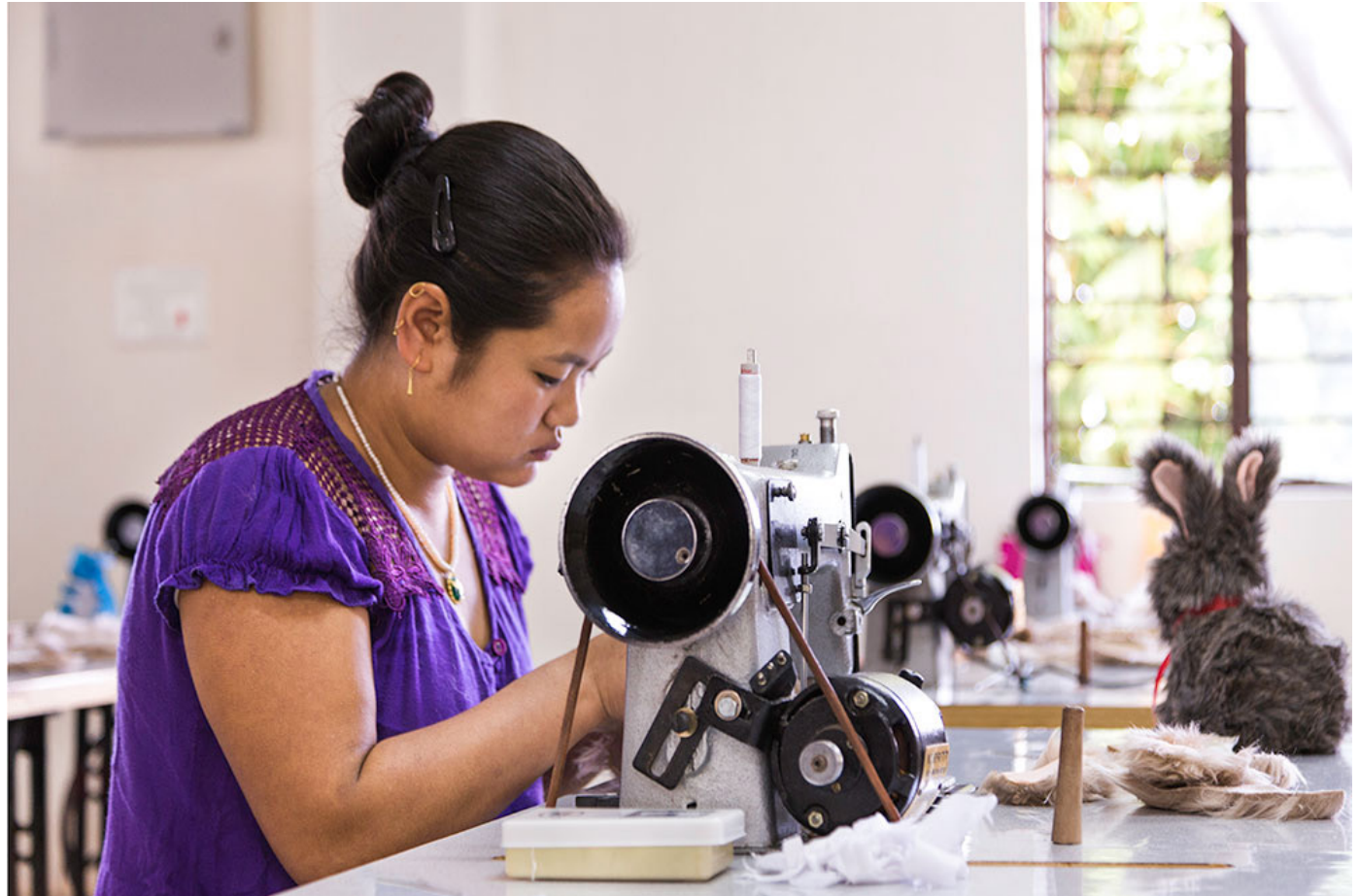
Trainee learning at the training unit.

Soft toys unit is recently established so not all the seats in the training as well as production unit are filled. It is slowly becoming a significant part of the institute.