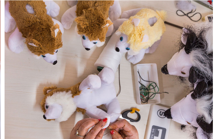
Filling with cotton.