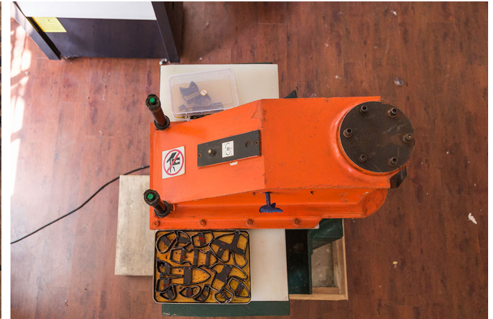
Cutting machine with frames for cutout.