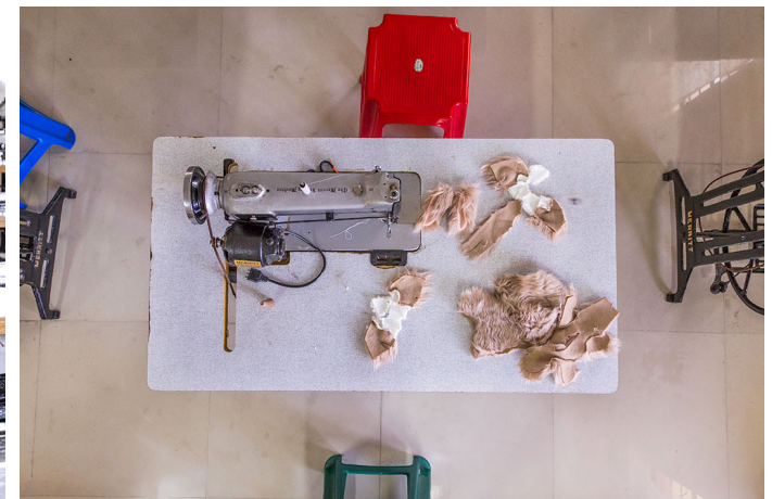
Sewing machine table at the training unit.