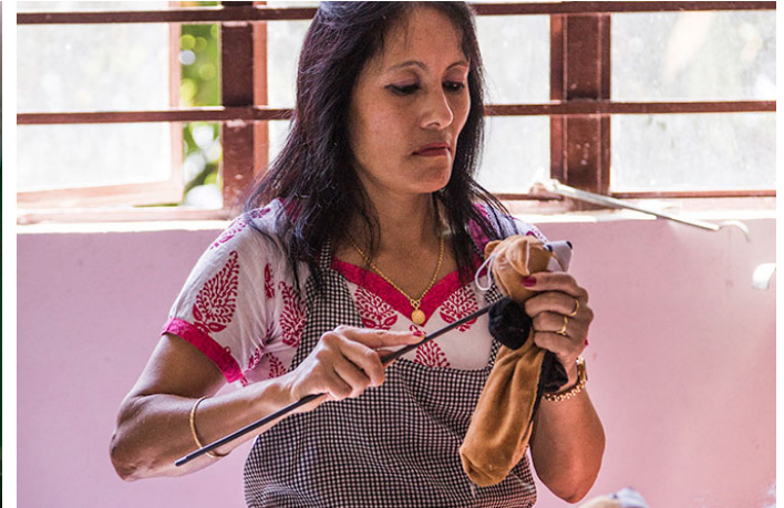
Filling with cotton.