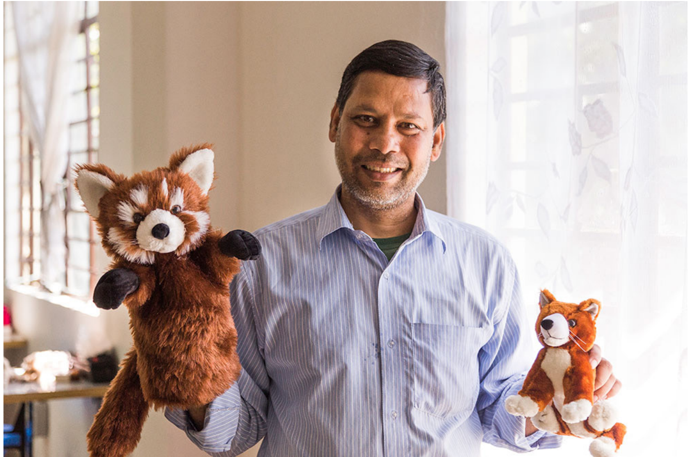
The instructor and head at the soft toys unit.