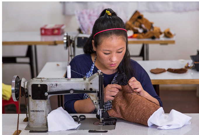
An artisan working at the production unit.