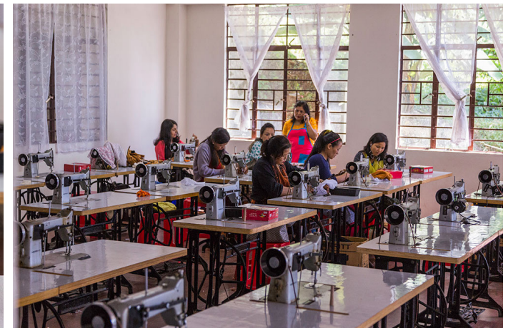
Production unit at the soft toys unit.