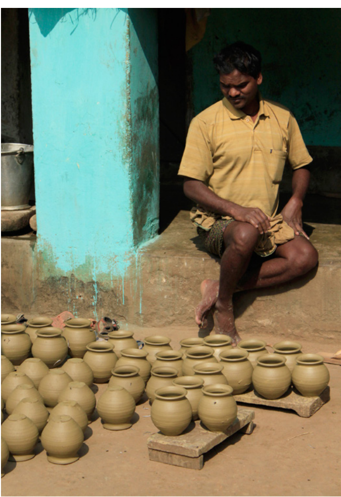
The pots are afterwards kept in the sun to dry before placing them in the kiln for baking.