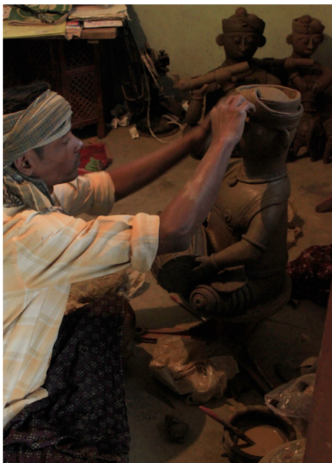
A Potter gives final touches to the terracotta statue created by him.