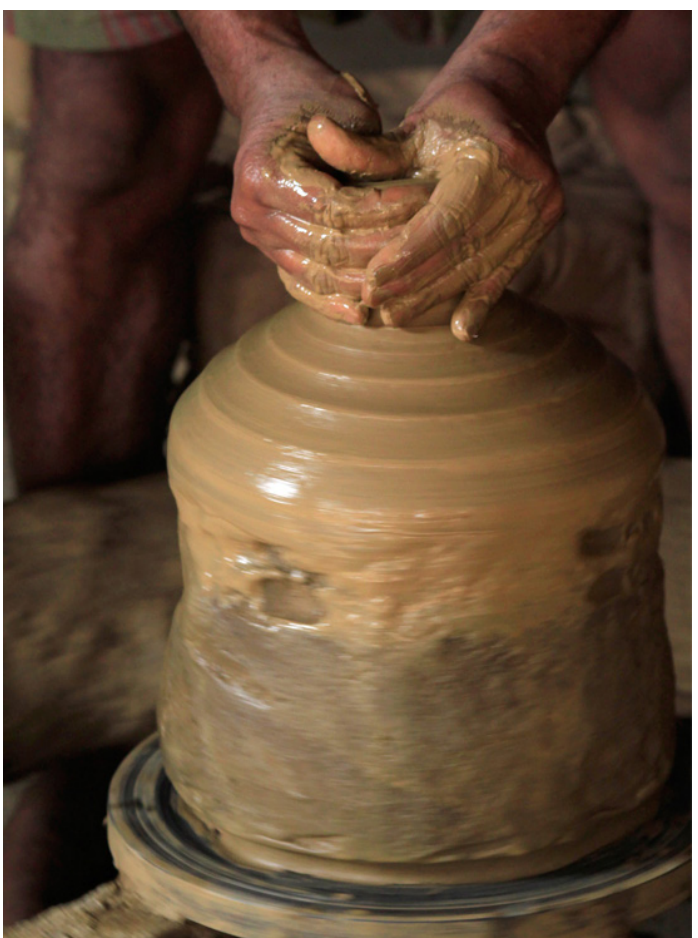
The potter starts shaping the pot by placing a lump of clay on the potter's wheel.