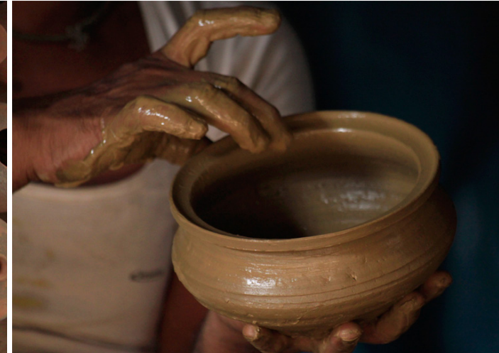
The potter gives the final finishing to a freshly made pot before sun drying.