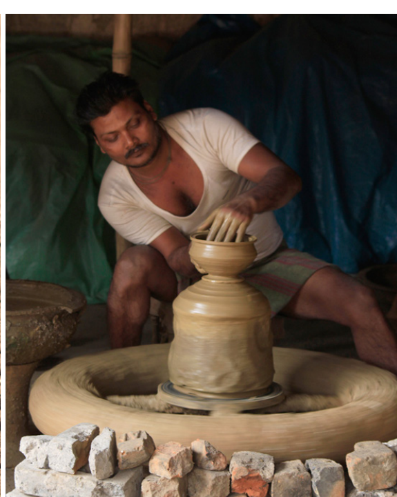
Kumharka charkha: Potter's wheel.