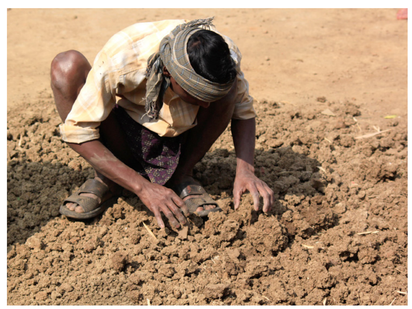
A potter separates stones and other impurities from the clay to be used in the pottery making.