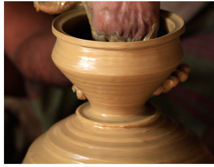
The pot is slowly reaching the stage of completion with close examination by the potter.