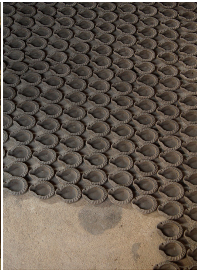
The diyas left for drying after they have been shaped using dyes.