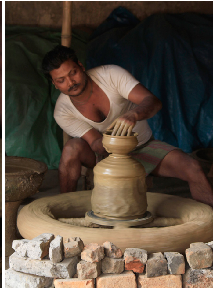
The pot is half shaped when the potter starts examining it carefully.