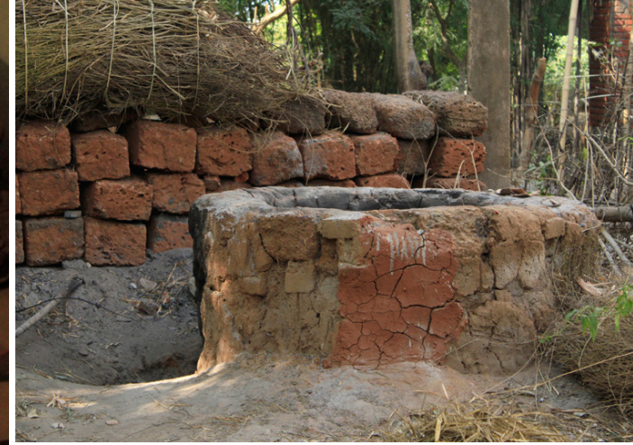
The kiln for baking the clay products after sun drying them.