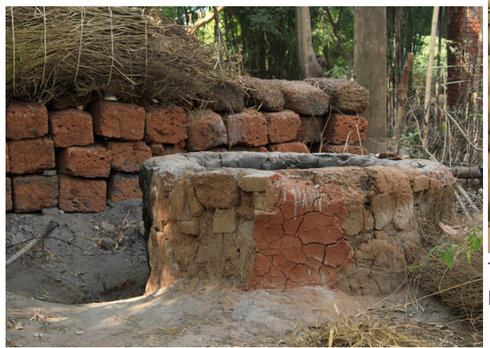
The pots are then placed in the kiln and the final product is ready to be sold in the market.