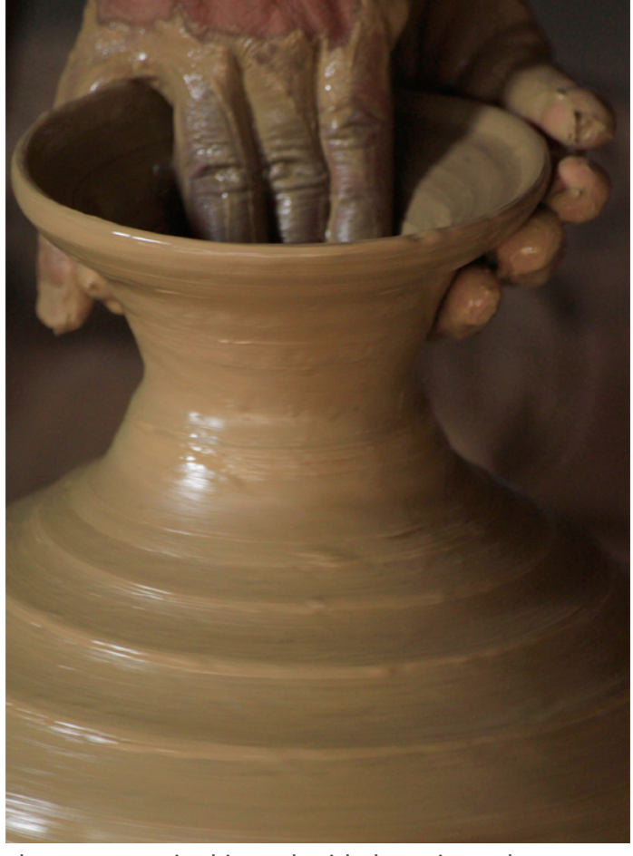
cy and delicacy.