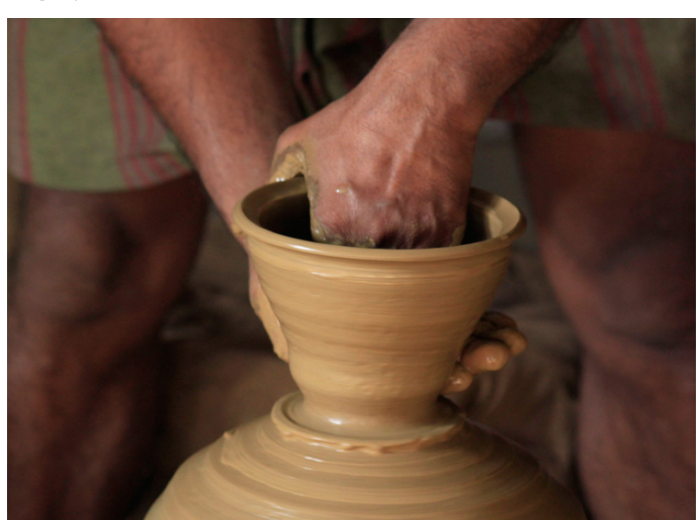
The Potter prepares the pot in a potter's wheel by rotating n shaping it with his hands.