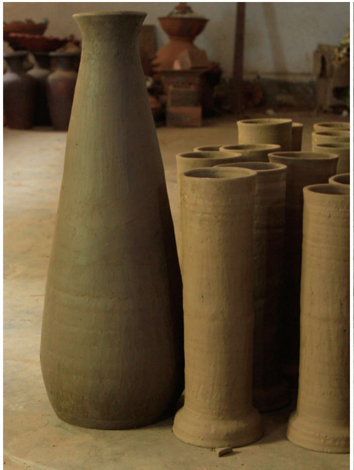
A display of the terracotta pottery products after they have been completed.