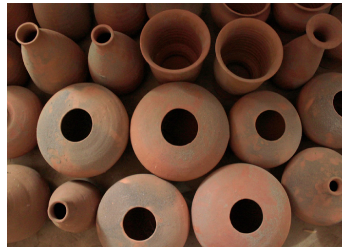
Various pots of different shapes and sizes at a display.

Orissa has a claim on many of the world renowned masterpieces made out of terracotta. This work is mostly done by the tribal people. They use special clay and designs in an excellent manner to come out with products such as plates, roof tiles, tea cups, jars and many others. Artists prepare products and highlight them with color but they mostly leave the items with their natural terracotta color. Animal figurines of horses, elephants and bulls are also elegantly molded in very natural, strong forms. Potters of Orissa still make earthen pots to be used in many ritualistic ceremonies. They are made in various forms and designs. The products range from household ones to the artistic ones like pots, pitchers, diyas, cups, incense burners, jewellery sets, bangles, masks, toys, candle stands and many more.