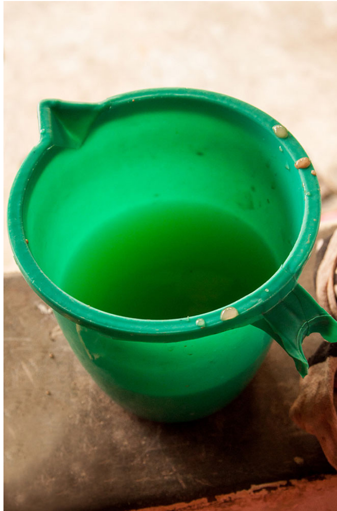
Water is used for kneading the clay to make terracotta work.