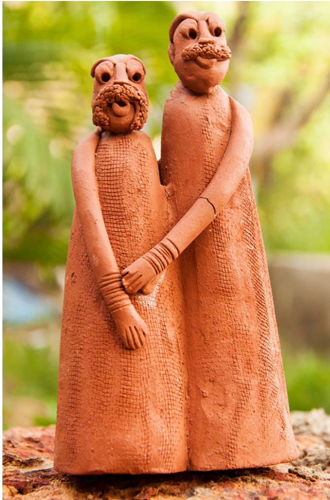
Sculpted clay model of couple.