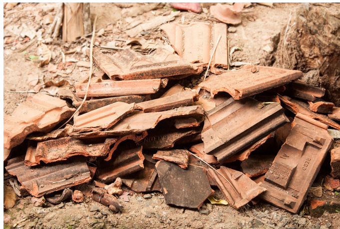
Clay lid that is used to cover the clay works during the time of baking.