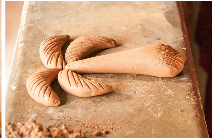
Refined clay is made to the desired shape that need to be fired.