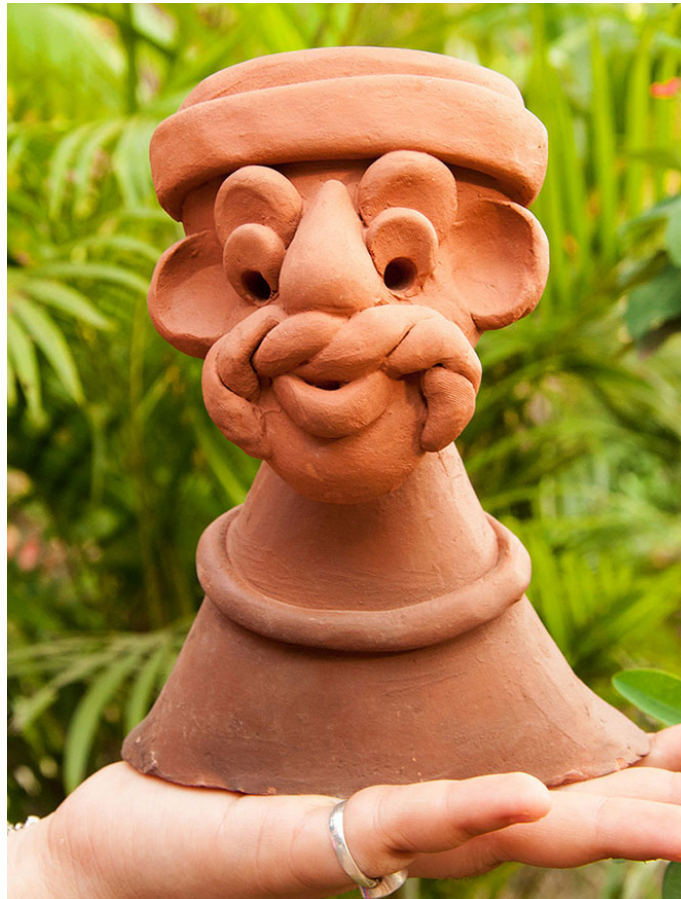
Panaji the northern district of Goa is well known for its terracotta works.

Terracotta is an art that is made from natural clay, which gives reddish brown in color by its characteristic. It is one of the simplest process for creating decorative items with much lower material costs. Wall Hangings which are made from Terracotta is the magnificent art work that are specially used to design and decorate walls which fascinates the visitors. Some of the special products are custom designed and prepared. This art is practiced for more than two decades in the Artisan family and are successful by introducing contemporary designs in the products.