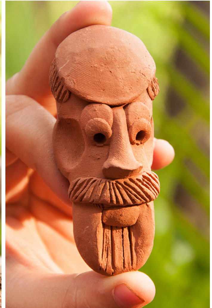
Modeled face in clay.