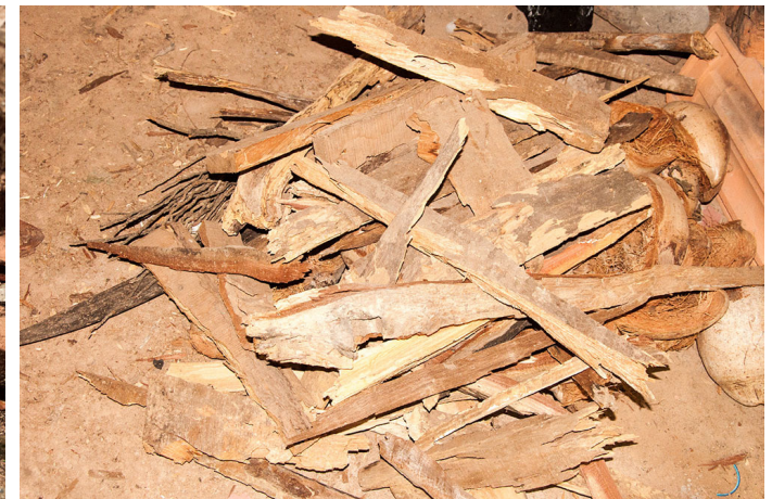
Red fire is used for the furnace.