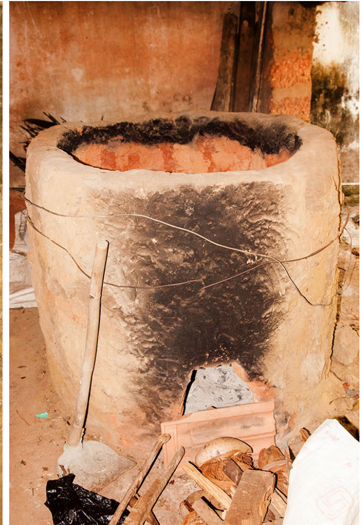
Furnace is used for baking the terracotta work.