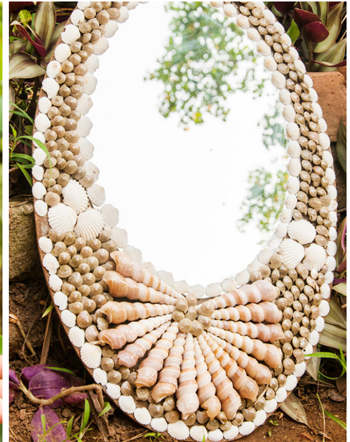
The most striking artistic shell work done on the mirror.