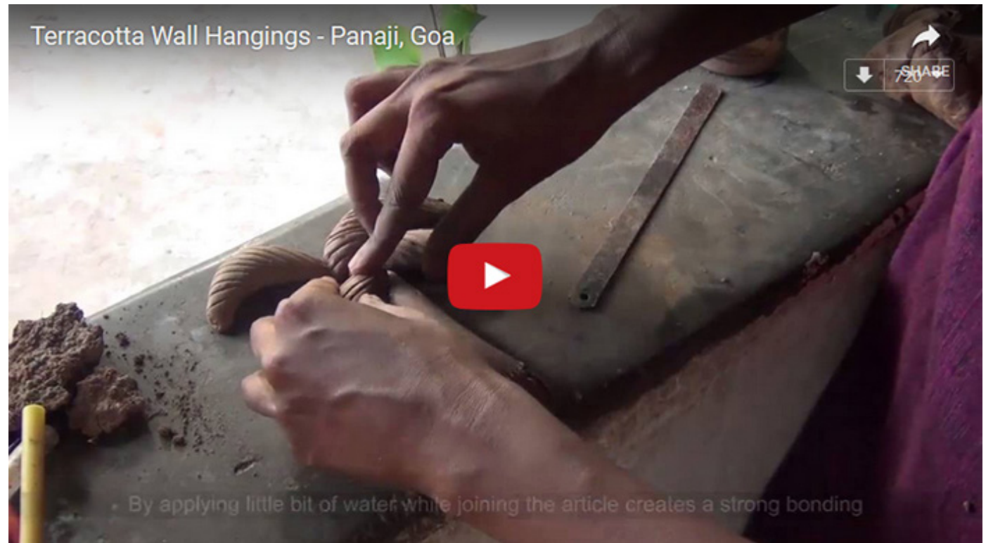
Terracotta Wall Hangings