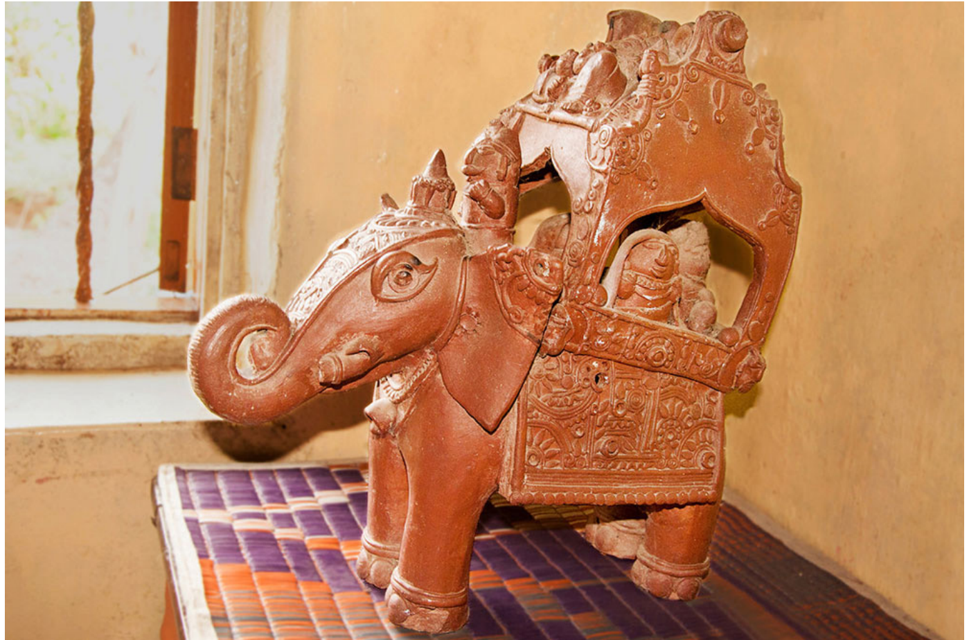
Intricately carved elephant chariot is one of the best terracotta work.