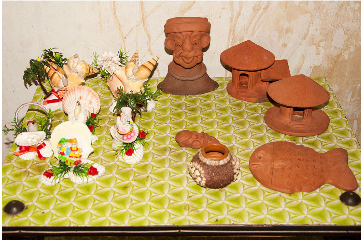
Artisan displays her terracotta work along with the shell works made by her.