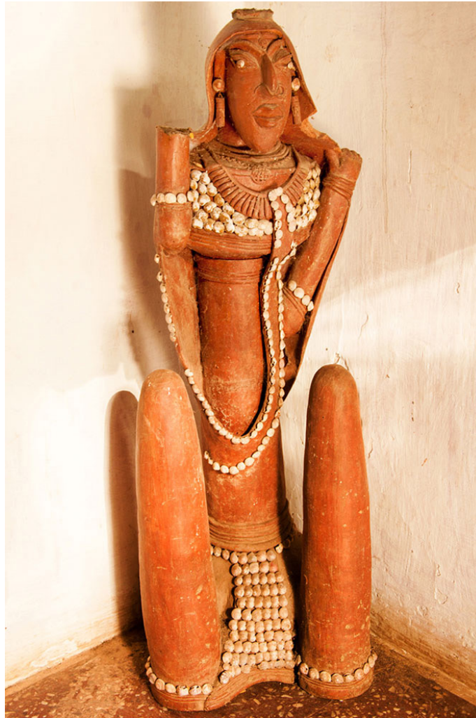
One of the attractive sculpted figurine of clay.