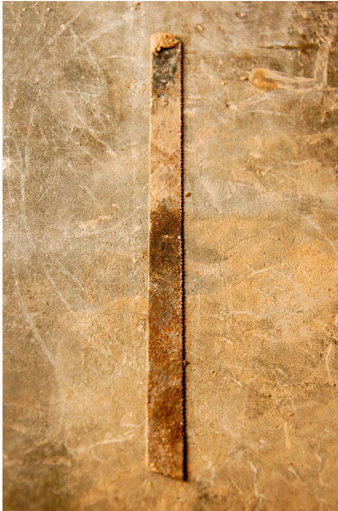
Hacksaw is used for carving the designs on the wet clay.