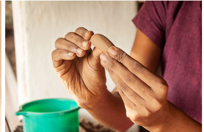
Artisan demonstrating the making process of the clay work.