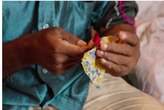
The bright color cloth is been inserted inside the stitched cloth at the place where it is needed.