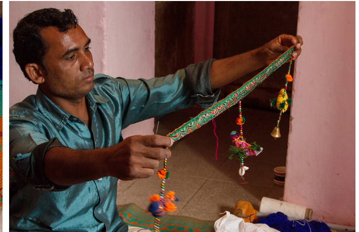
Torans are of different types, most unique types consists embroidery, mirror and beads.