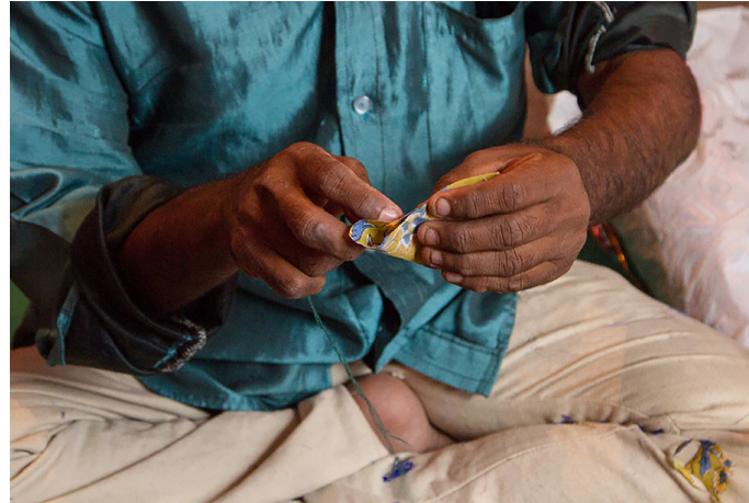
Then the cloth is been stitched.

http://www.dsource.in/resource/toran-making/making-process