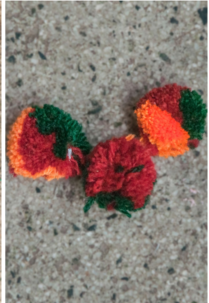
Woolen pom pom baubles are used in toran design as a decorative substance.