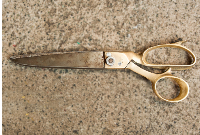
Scissor is used for cutting the cloth, extra threads and lace.

http://www.dsource.in/resource/toran-making/tools-and-raw-materials