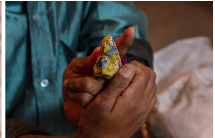
When the cloth is reversed the beautiful bird shaped cloth is been seen.