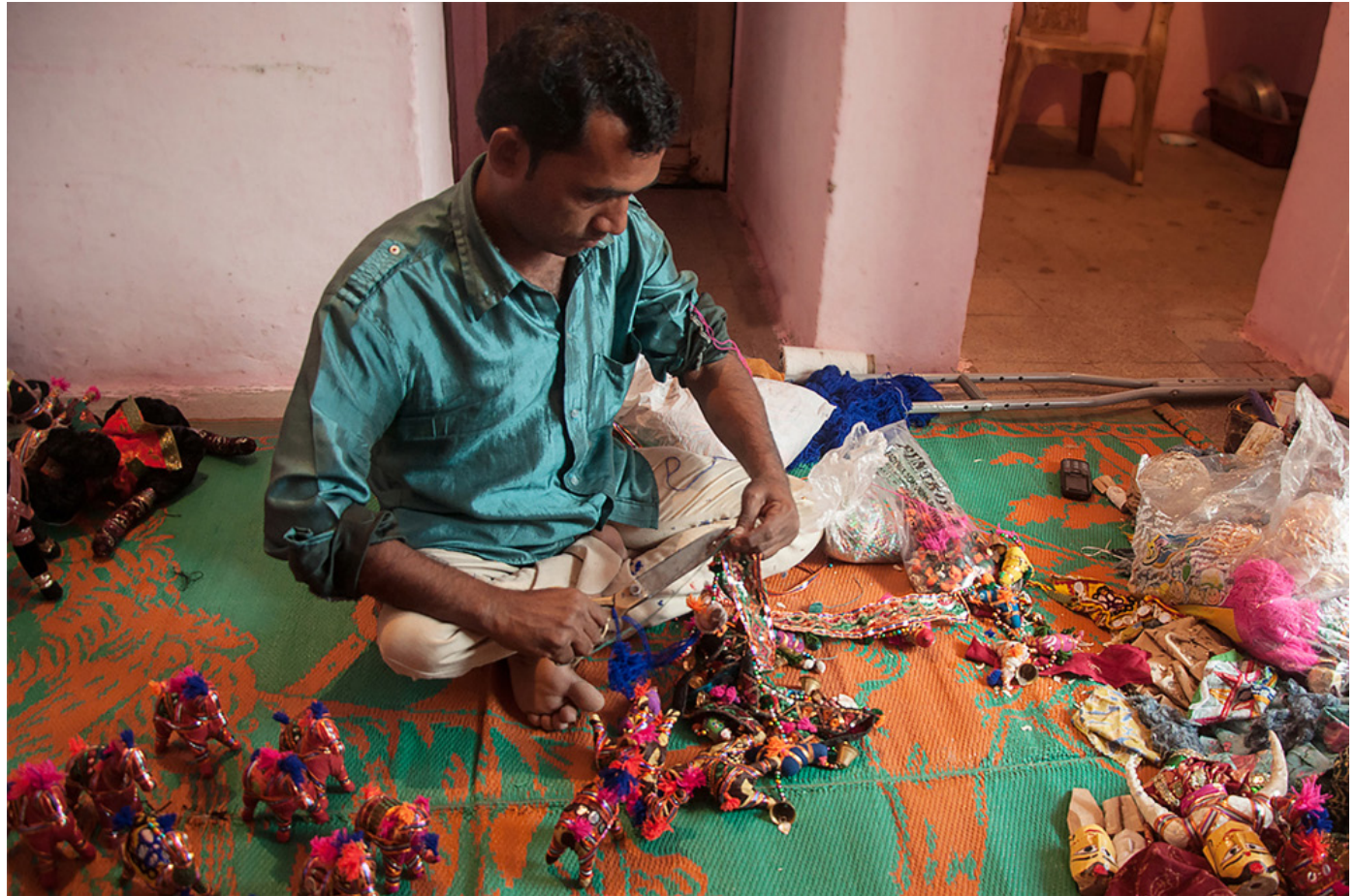
Beautifully crafted torans by the artisan.