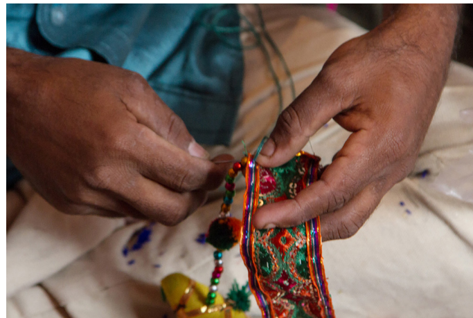
Excess of thread which was used during the time of stitching is been cut by scissor.