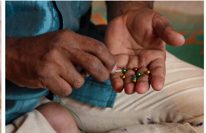
Then the vertically designed hanging is stitched to the horizontally decorative cloth in its corners.