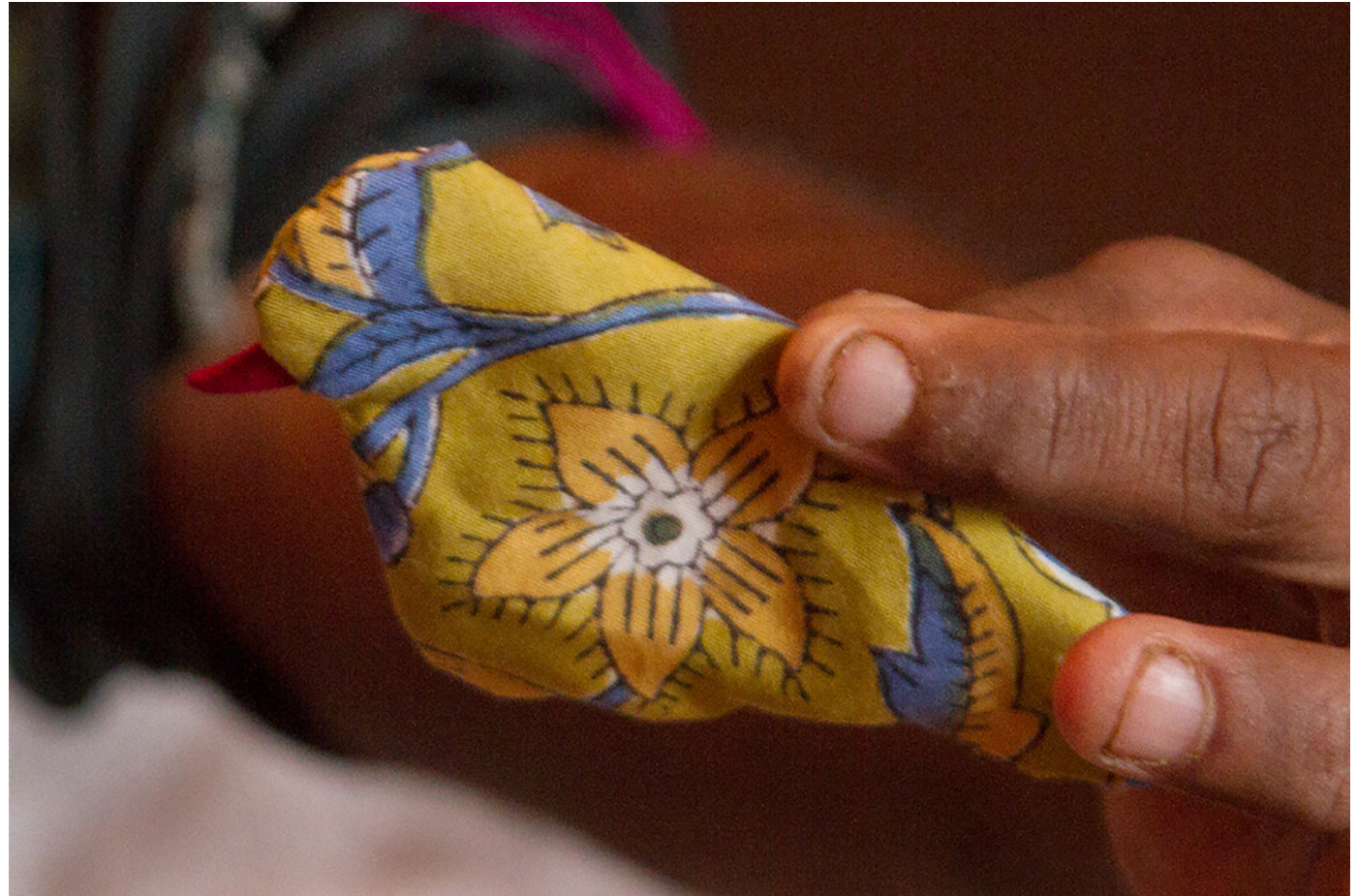
The complete shape of the bird is achieved.