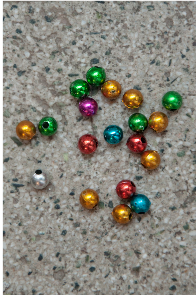
Beads are used for decorative purpose.