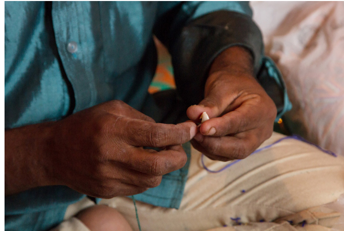
Later the beads are inserted one by one.

http://www.dsource.in/resource/toran-making/making-process