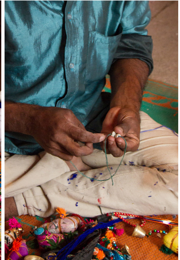
Artisan inserts the cowry shells one by one through the help of needle and thread.