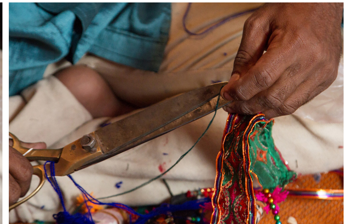
Creatively designed toran of intricate pattern is ready to be hung at the archway of the houses.