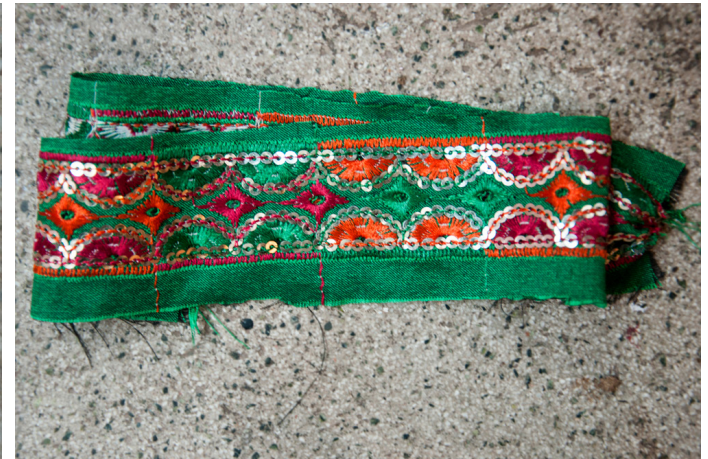
Ready-made attractive cloth piece is used for toran making.