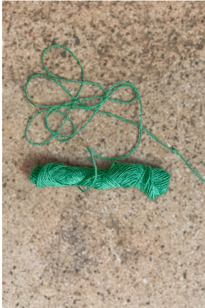
This particular colored thread is used for stitching the toran to match its color.