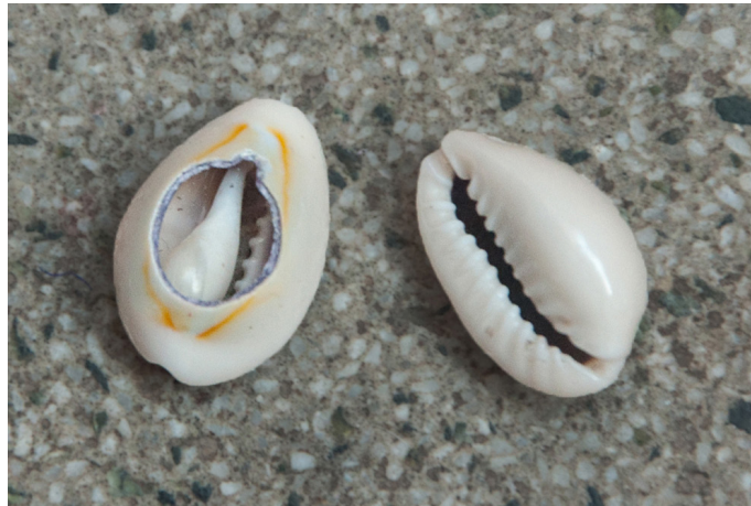
These cowry shells are also used for decorative purpose in the process of toran making.