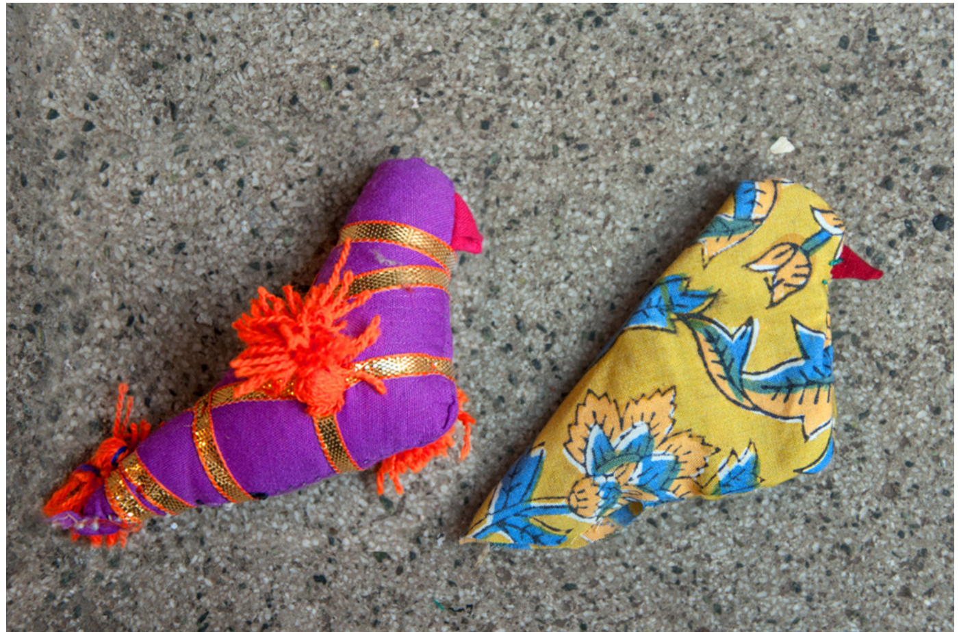
The handmade bloated birds is stitched to use it as a decorative substance in the process of toran making.

Usually the size to be made are referred to the door's length and width for which it has to be made for. Some of the special types of torans are classic woolen toran, cotton toran, crystal and beads toran, satin ribbon toran, tissue toran etc.