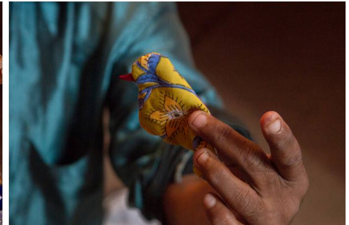
In some toran designs, the fabricated stuffed toys are also included.