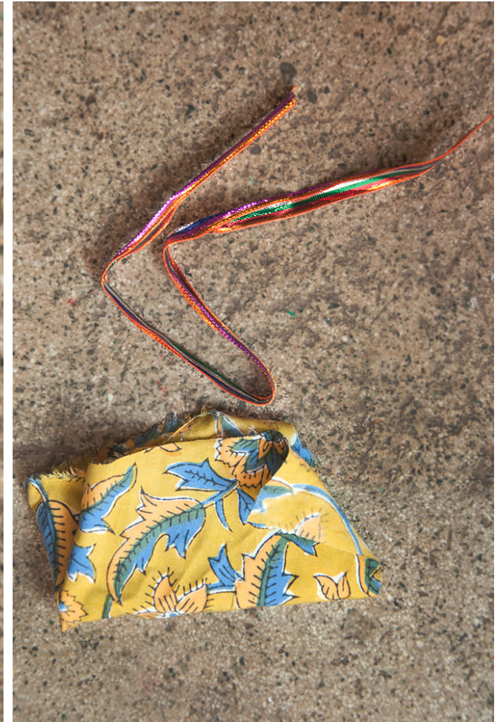
Cloth is used for making the toy and the lace is used for decorating.