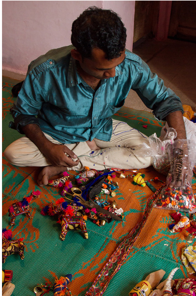
Later the artisan selects the beads and other decorative stuffs according to the design pattern.