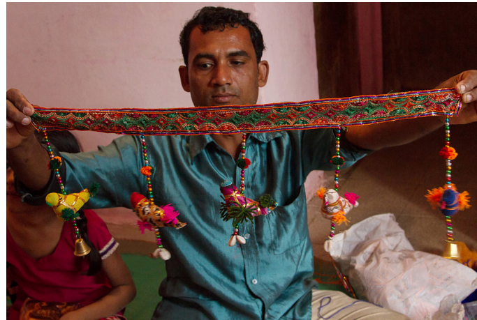
Torans are the decorative cloth hung at the doorway which gives a charming look for the entrance.