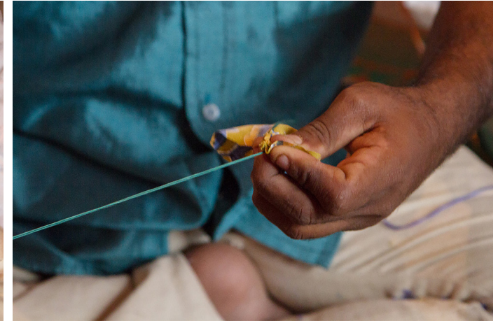
The stitching is been tightly completed.