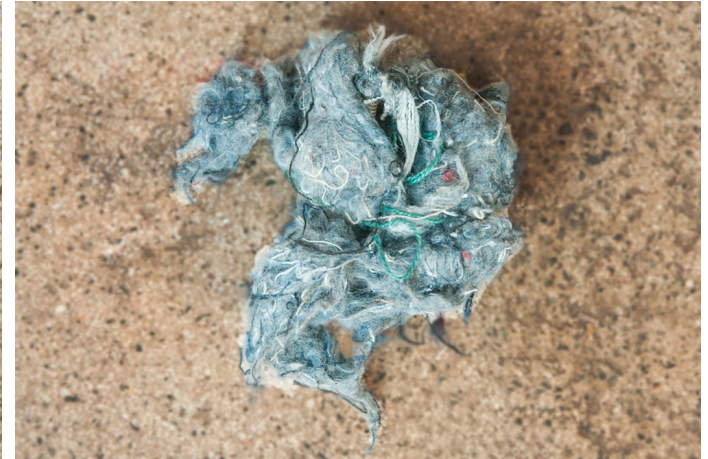
Cotton and threads are stuffed inside the stitched cloth to make the toys.