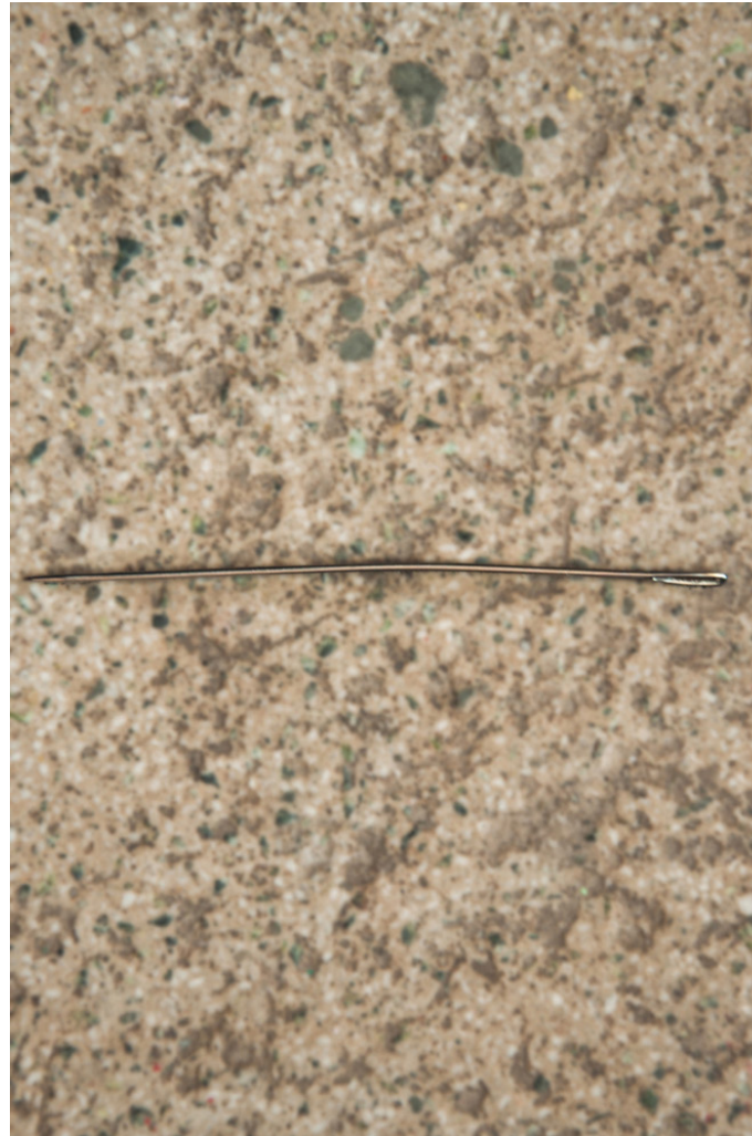
Needle is used in stitching by inserting the thread into it.