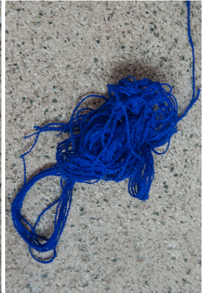
Woolen threads are used in beautifying stuffed dolls which are used to make toran attractive.