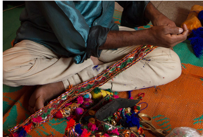
Toran patterns are based on the artist's creativity.

http://www.dsource.in/resource/toran-making/introduction