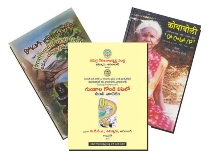
Figure: 7 Titles of the books in Gondi (including the book in Gunjala Gondi lipi-in middle)