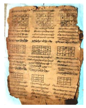
Figure: 3. Horoscope chart in Gunjala Gondi Script (Figure 1,2 and 3) few among the Manuscripts found in Gunjala.

1.4 Making of the Vachakam - a step ahed