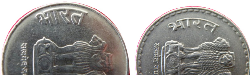
Figure.9.1 Devnagri and Roman Type display