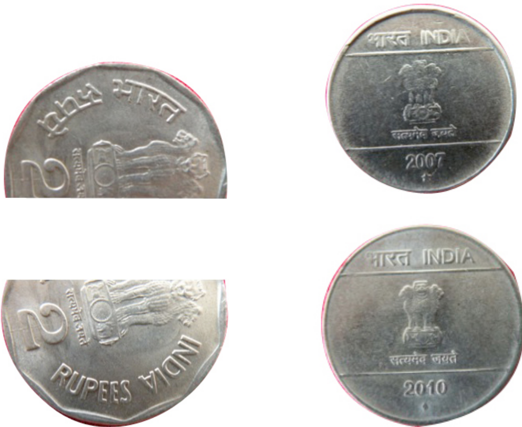
Figure.9.2 Devnagri and Roman Type display