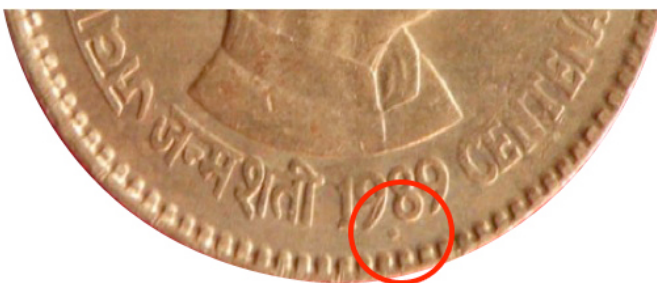
Figure.4 Identification of mints - The Noida mint