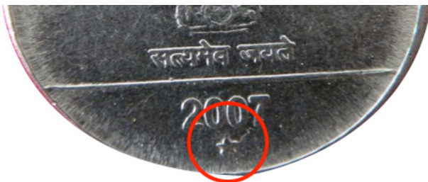
Figure.3 Identification of mints - The Hyderabad mint