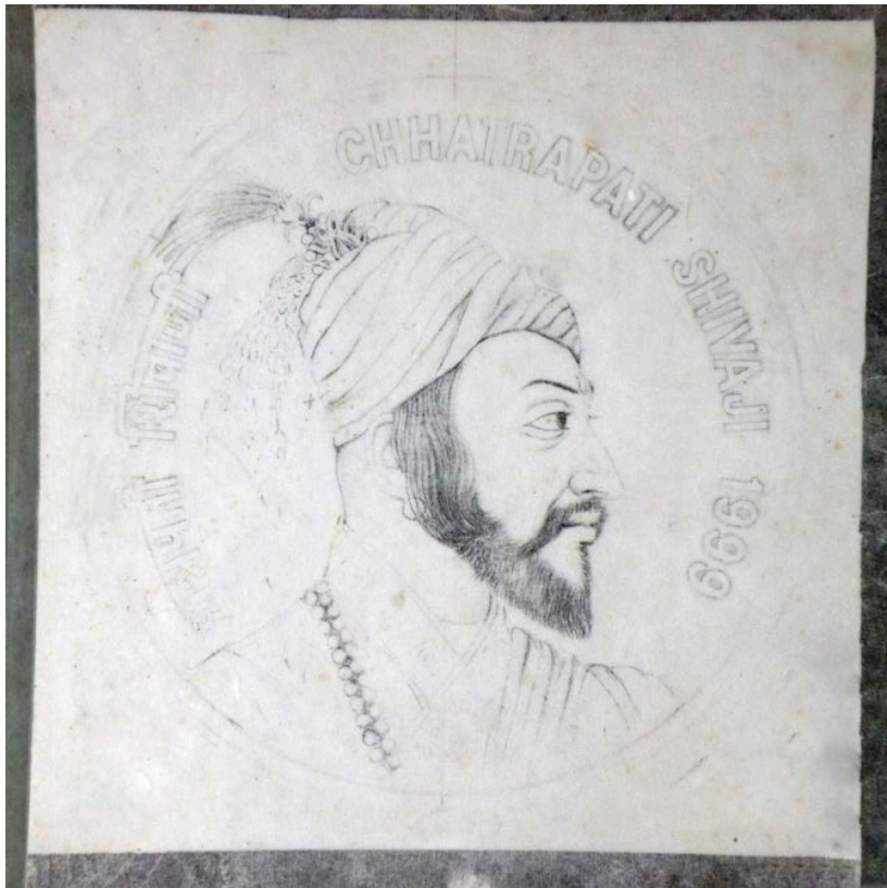
Figure.6.1 The process - The Sketch