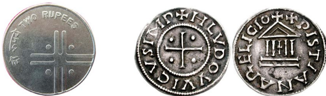
Figure.11 The controversy - Christian cross

The two-rupee coin issued from 2006 by the Reserve Bank, in stark contrast to the earlier coin, is rounded and simpler in design, without the map of India. The coin has already faced strong criticism for being difficult to recognize by the visually impaired . Most controversially, it features an equal-armed cross with the beams divided into two rays and with dots between adjacent ones. According to RBI, this design represents ‘four heads sharing a common body’ under a new ‘Unity in Diversity’ theme. However, Hindu nationalists have challenged the symbol and charged that it looks like a Christian cross : resembling the symbol on the deniers issued by Louis the Pious .