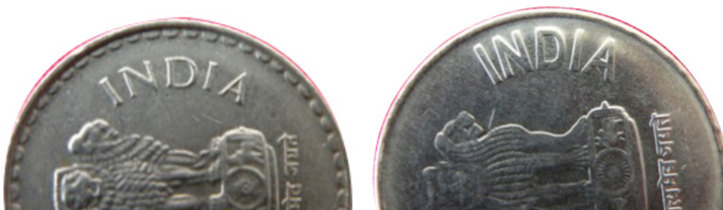
Figure.8.2 Type display - Type on a curve