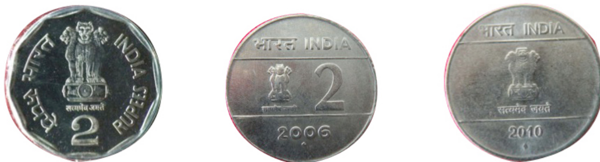
Figure.10.4 The design - Hierarchy of elements