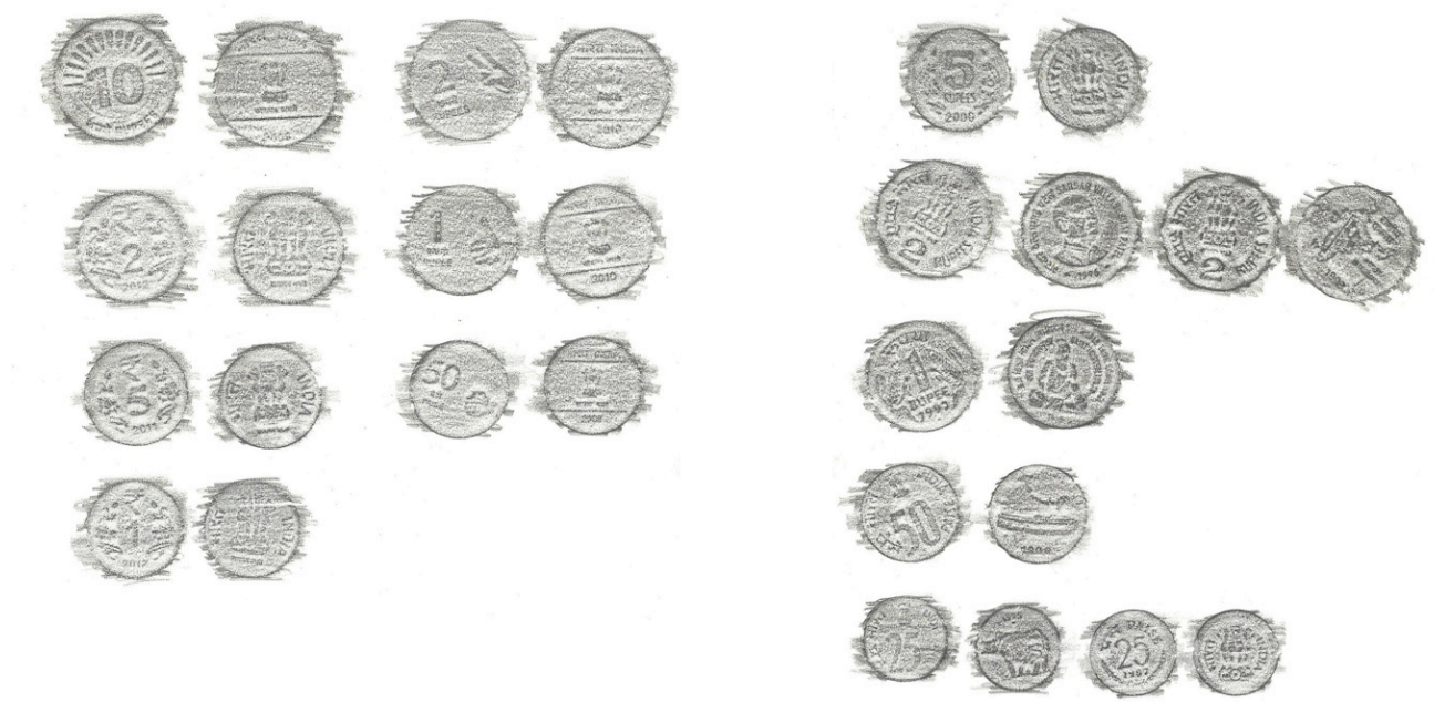
Figure.10.2 The design - Fading of elements