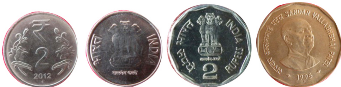
Figure.10.1 The design - Fading of elements