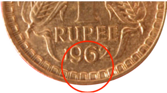
Figure.2 Identification of mints - The Kolkata mint