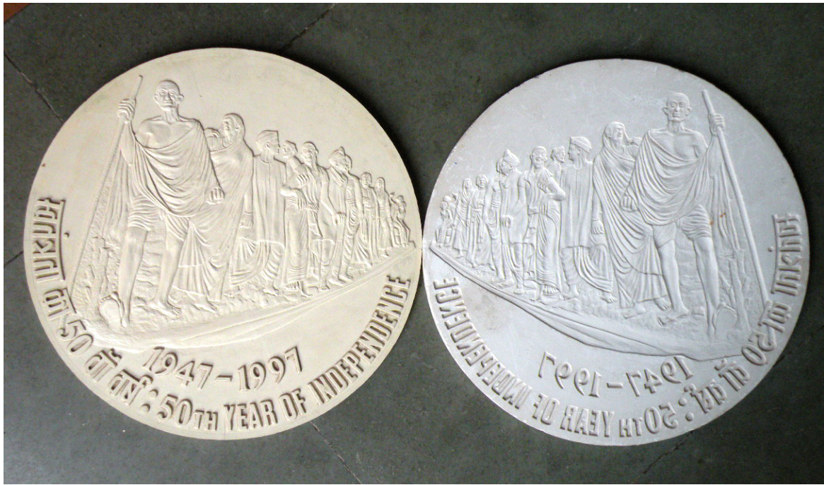
Figure.5.2 The process - The positive and the negative