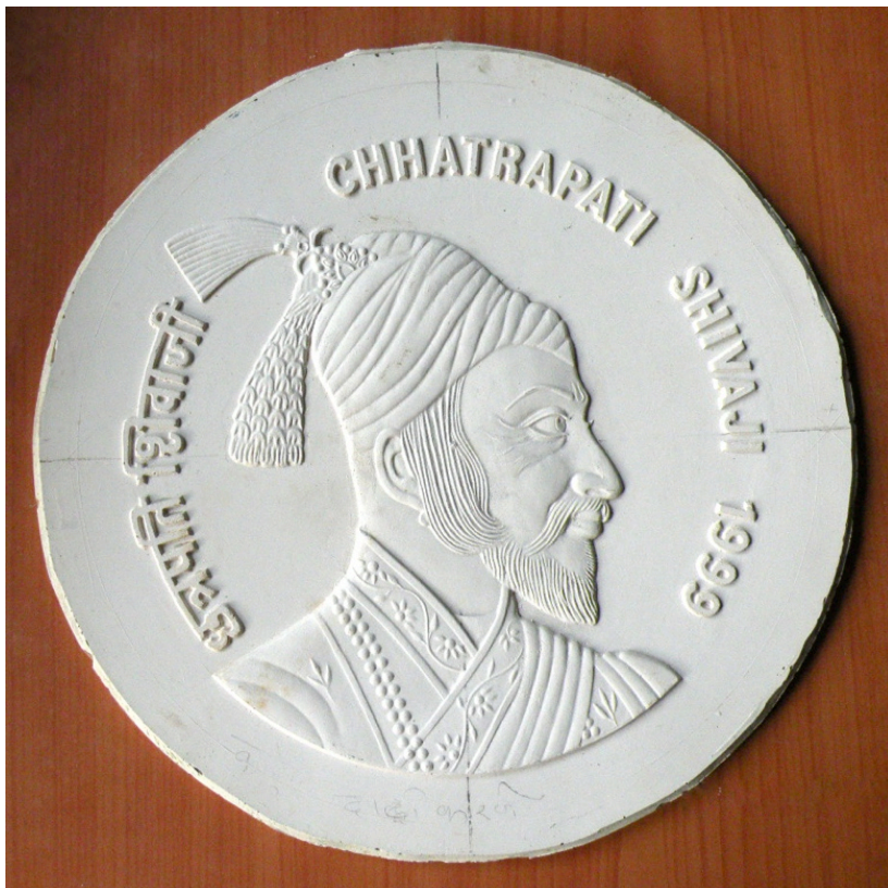
Figure.6.2 The process - The positive