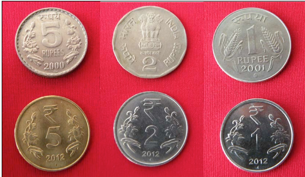
Figure.10.6 The design - The symbol