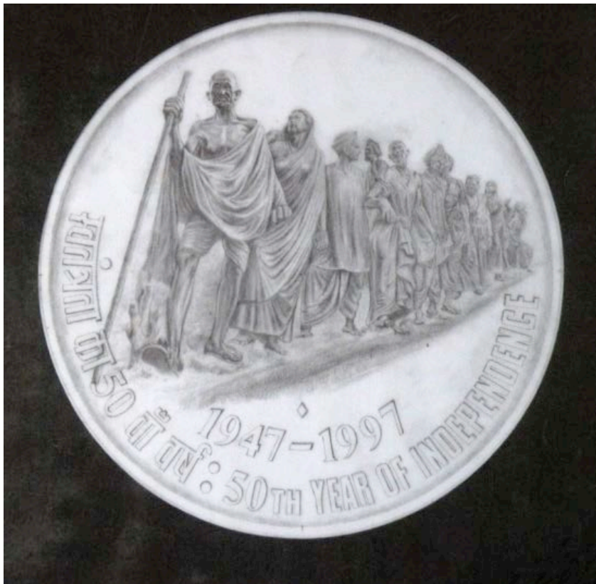
Figure.5.1 The process - The sketch

In my opinion, coins today have lost their value in terms of aesthetics, design, type and utility.