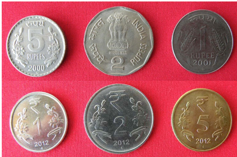
Figure.10.3 The design - Space