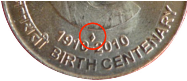
Figure.1 Identification of mints - The Bombay mint