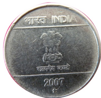
Figure.10.5 The design - The Ashoka Pillar