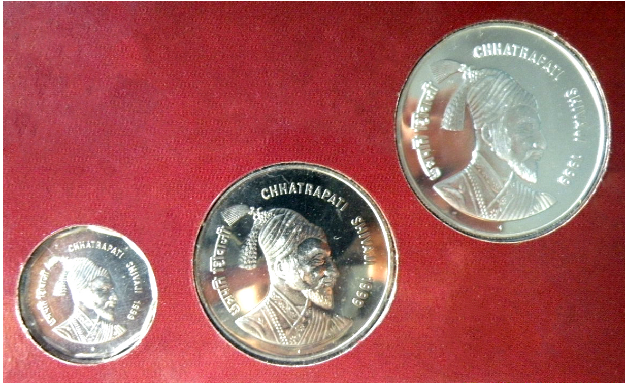
Figure.6.3 The process - The coin