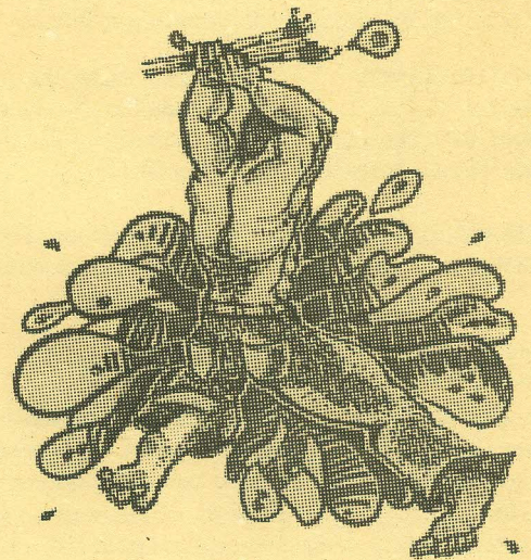
Orientation '98: Taking the plunge