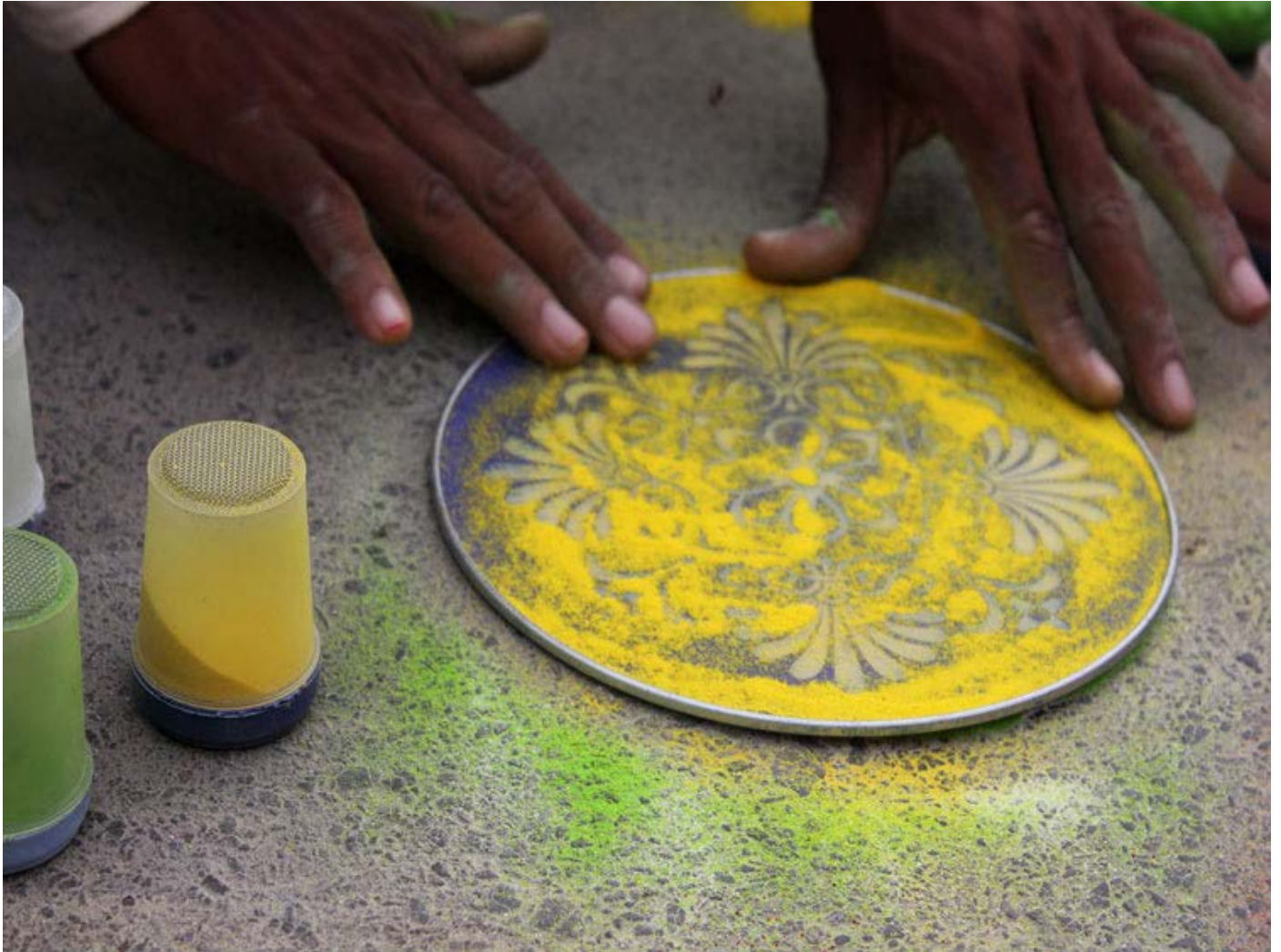
Rangoli Tracing - Spreading the colors – The colors can be later spread for uniformity using hands.