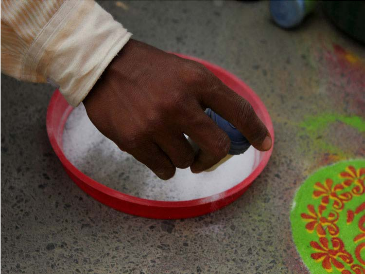
Rangoli Tracing - Sprinkling Colors – Color can be first sprinkled using special containers.