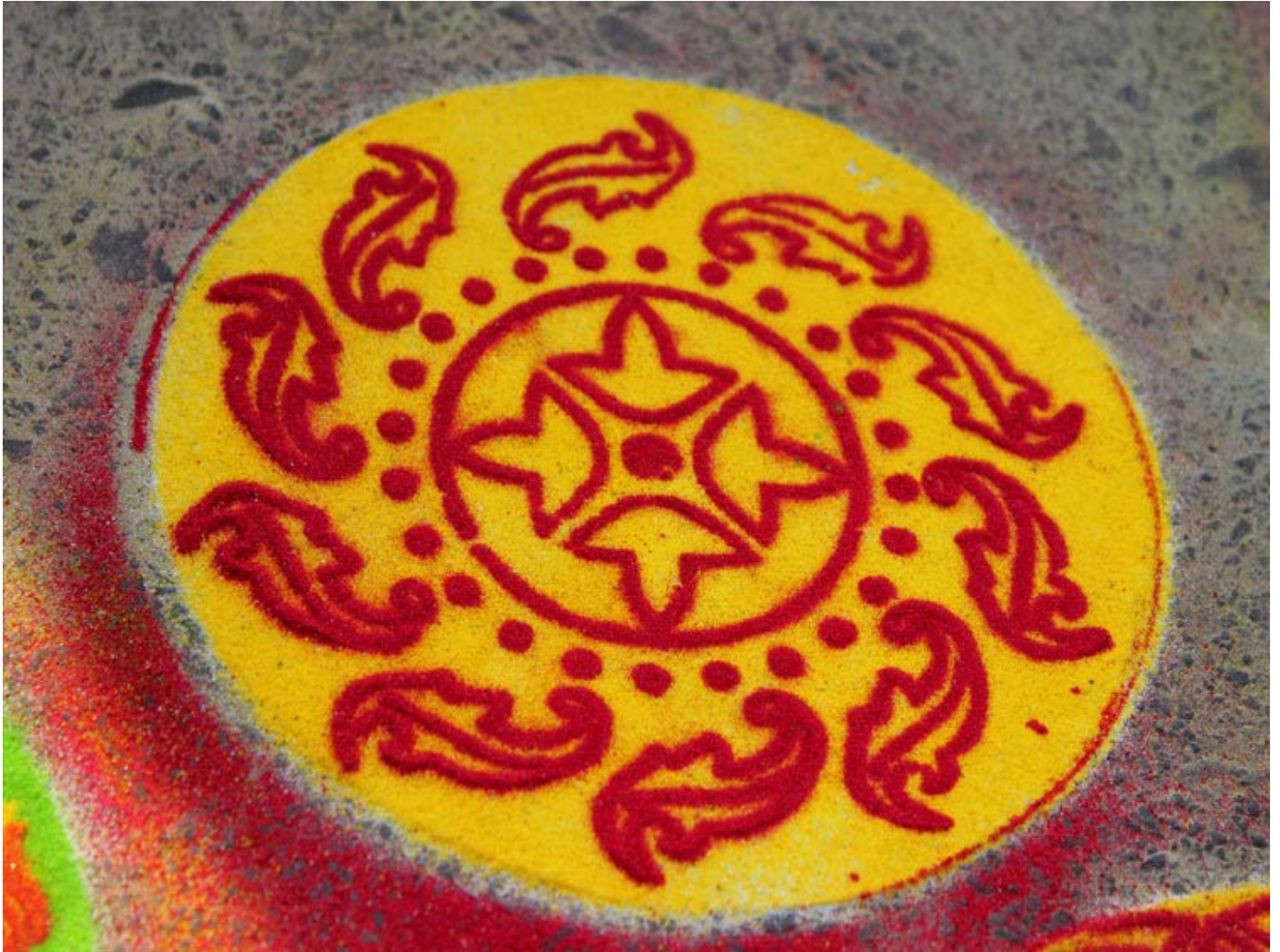
Rangoli Tracing – Pattern – Pattern made with a circular sieve with two colors.