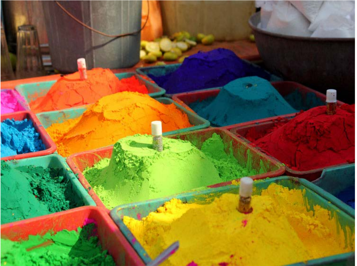
Rangoli Tracing - Colors –The various rangoli colors can be easily obtained from shop.