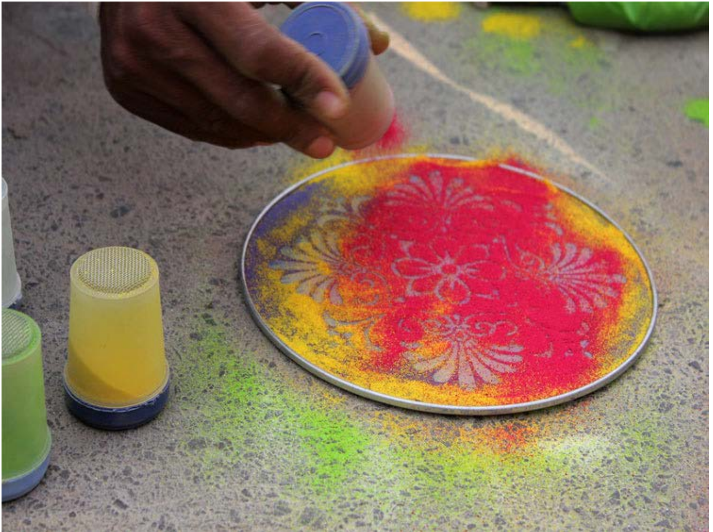
Rangoli Tracing - Superimpose the Traces –Two sieves can be put one above other to get a new pattern.