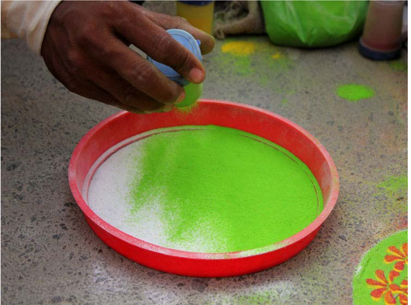
Rangoli Tracing - Sprinkling on a white base – Before sprinkling the actual color a thick base with white rangoli makes it look better.