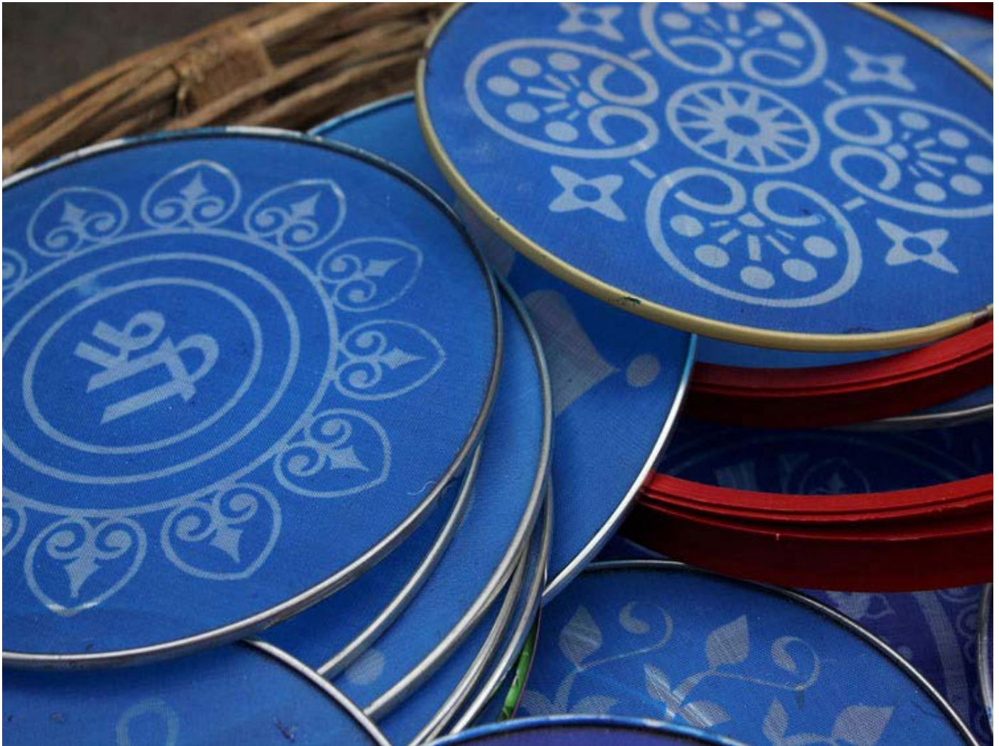
Rangoli Tracing - Circular Traces – Various patterns can be obtained in those circular sieves.