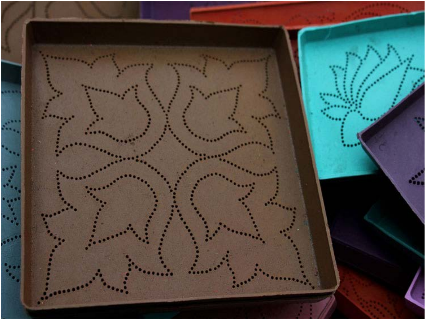
Rangoli Tracing - Square Traces – Sieves are also available in square shapes.