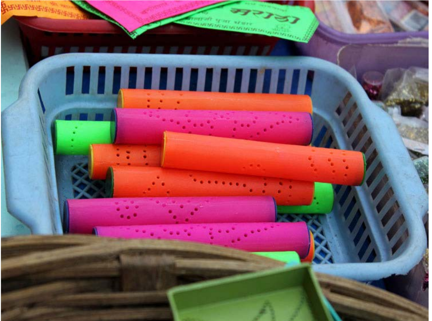
Rangoli Tracing - Rolling Traces – Color can be filled in those sieves and rolled to get certain pattern.