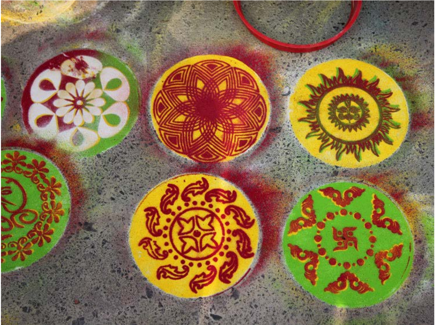
Rangoli Tracing – Pattern – The various set of patterns that can be made using these sieves.