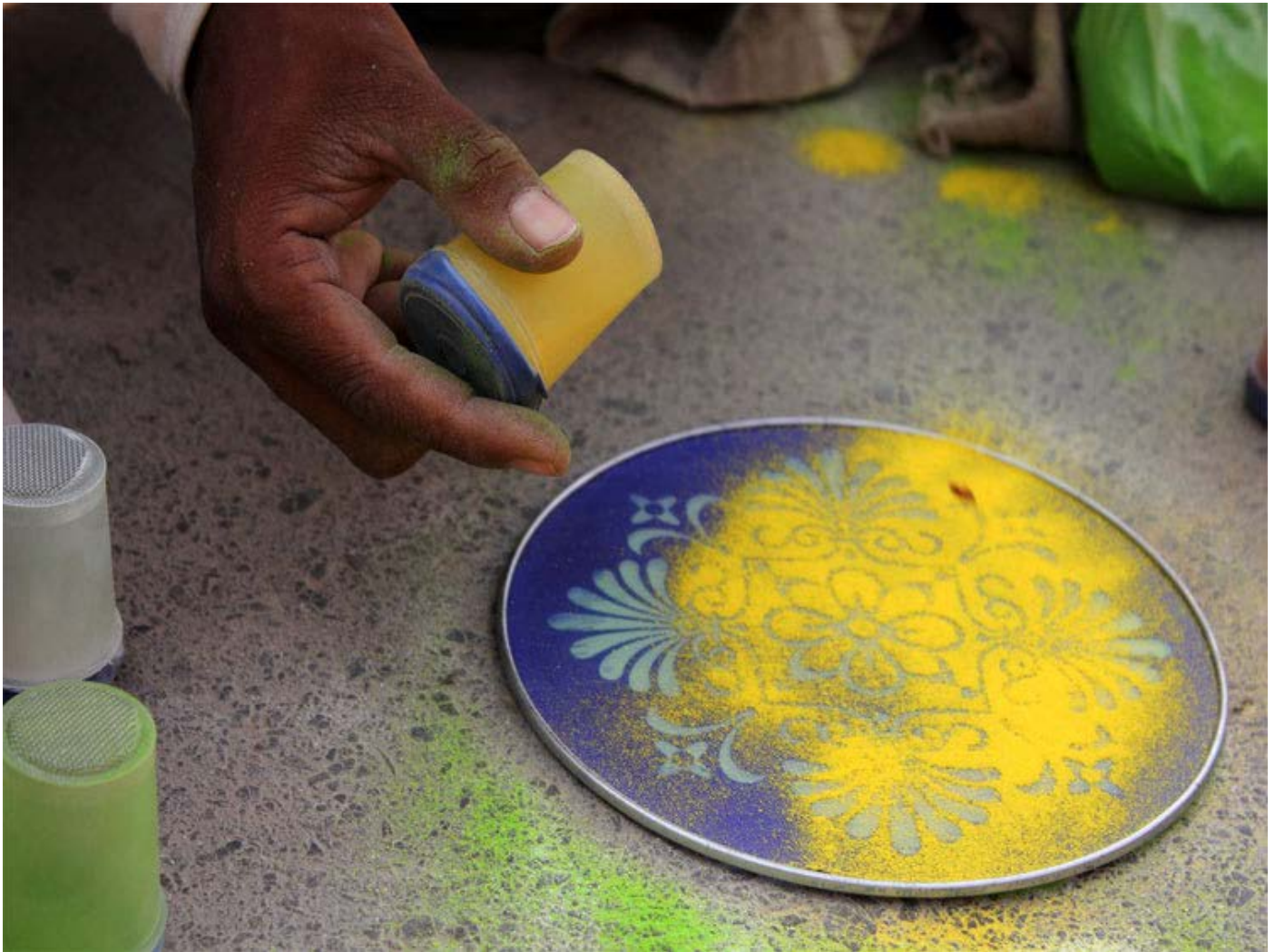
Rangoli Tracing - Holding the sprinkler – The artist sprinkling the color on the sieve.