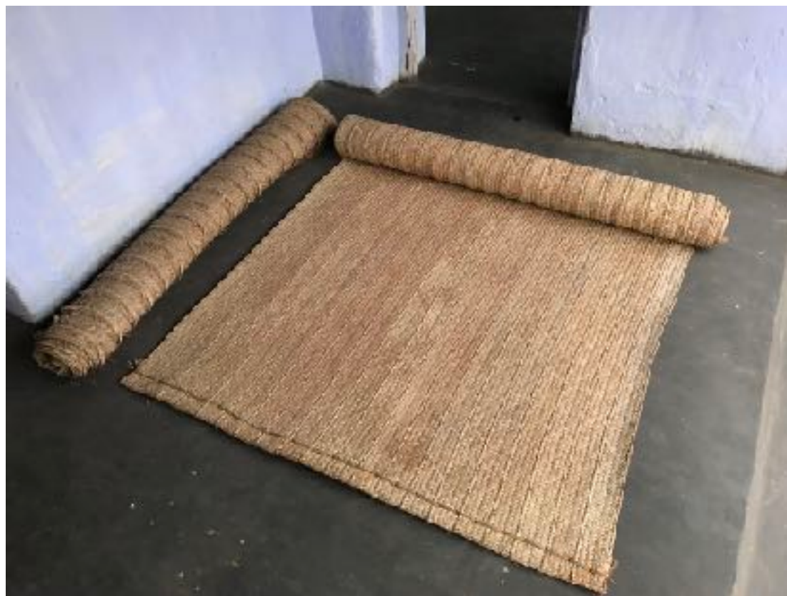
sleep mat made of palm leaves