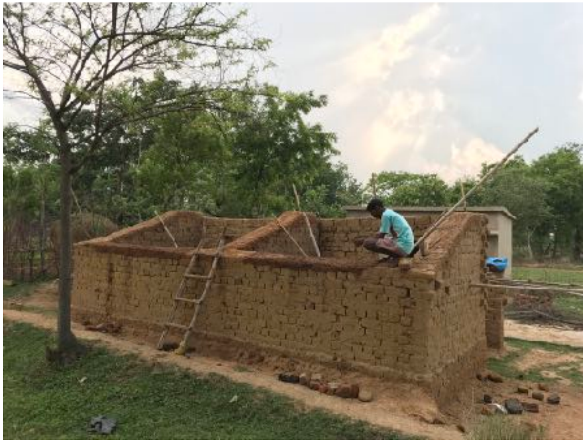
Mud brick house construction