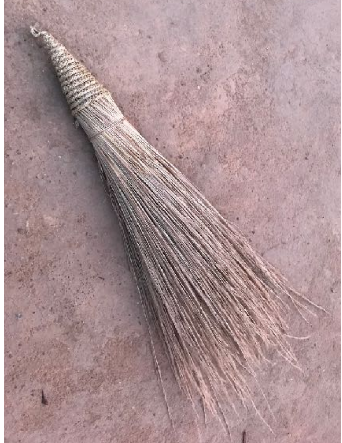
wild grass (saiu) broomstick