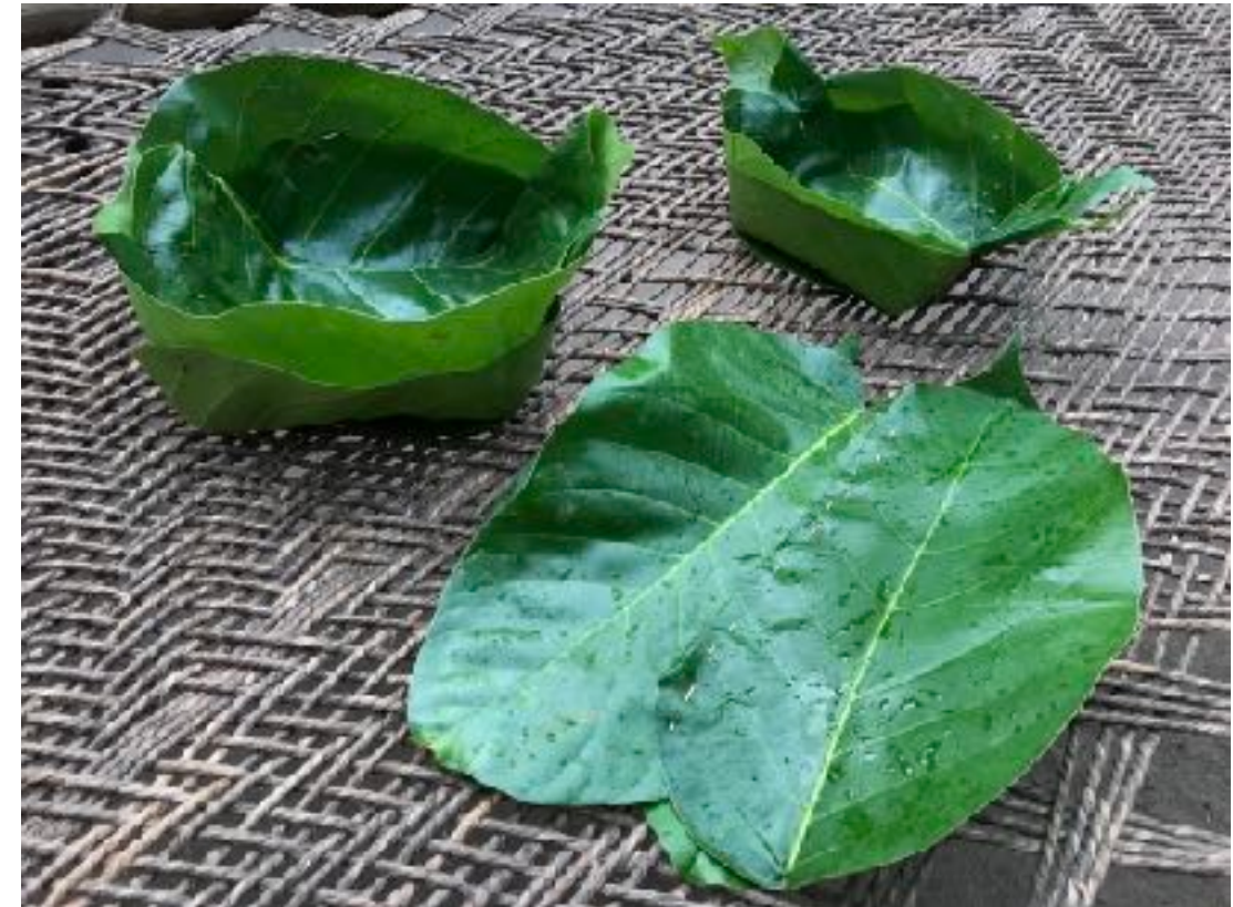
Sal leaves used for making plates and bowls