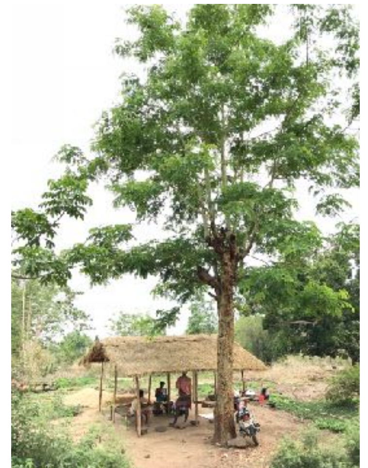
Resthouse/Refreshment house on the side of the road