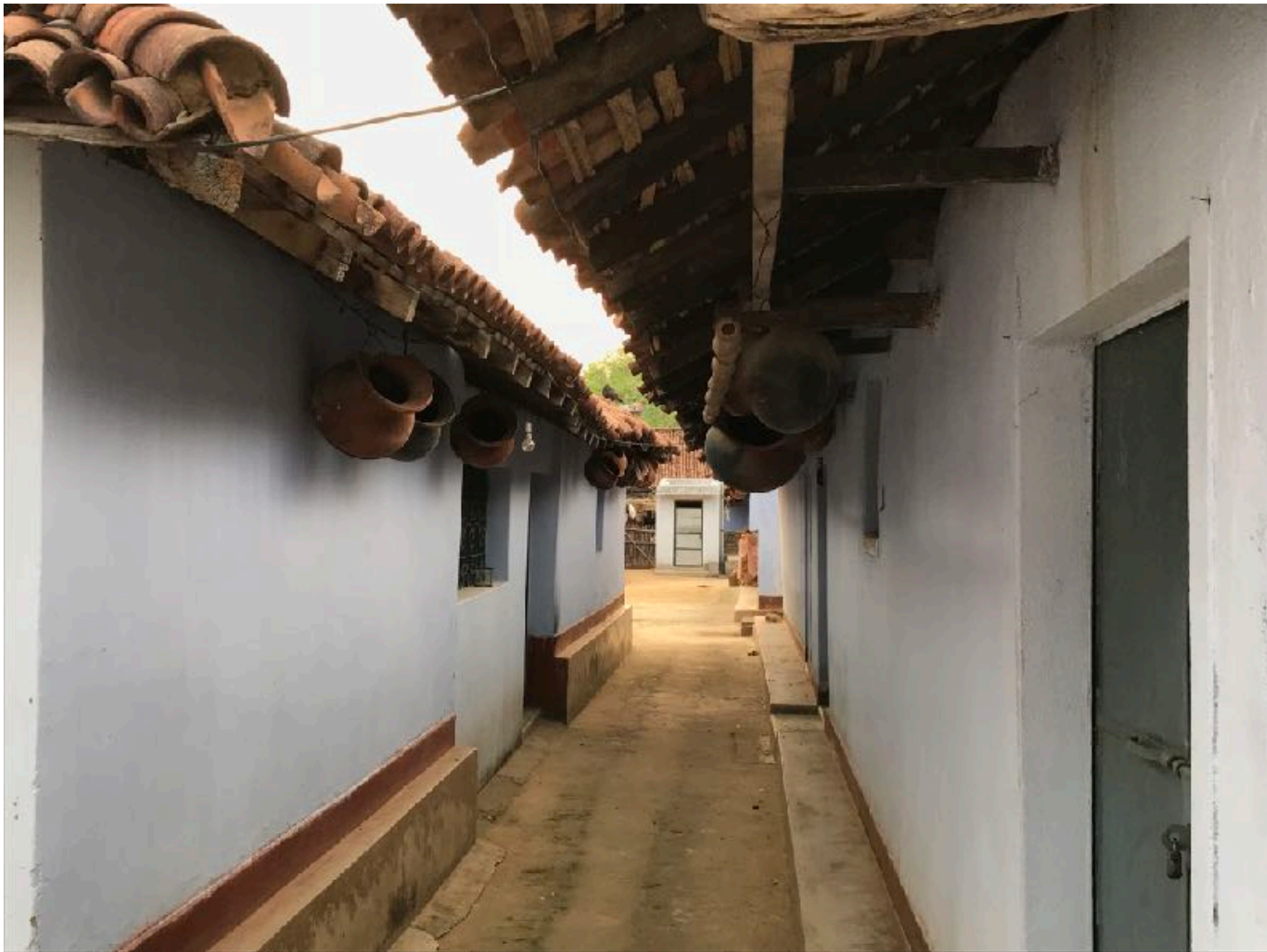
houses incorporate hanging earthen pots for pigeon house