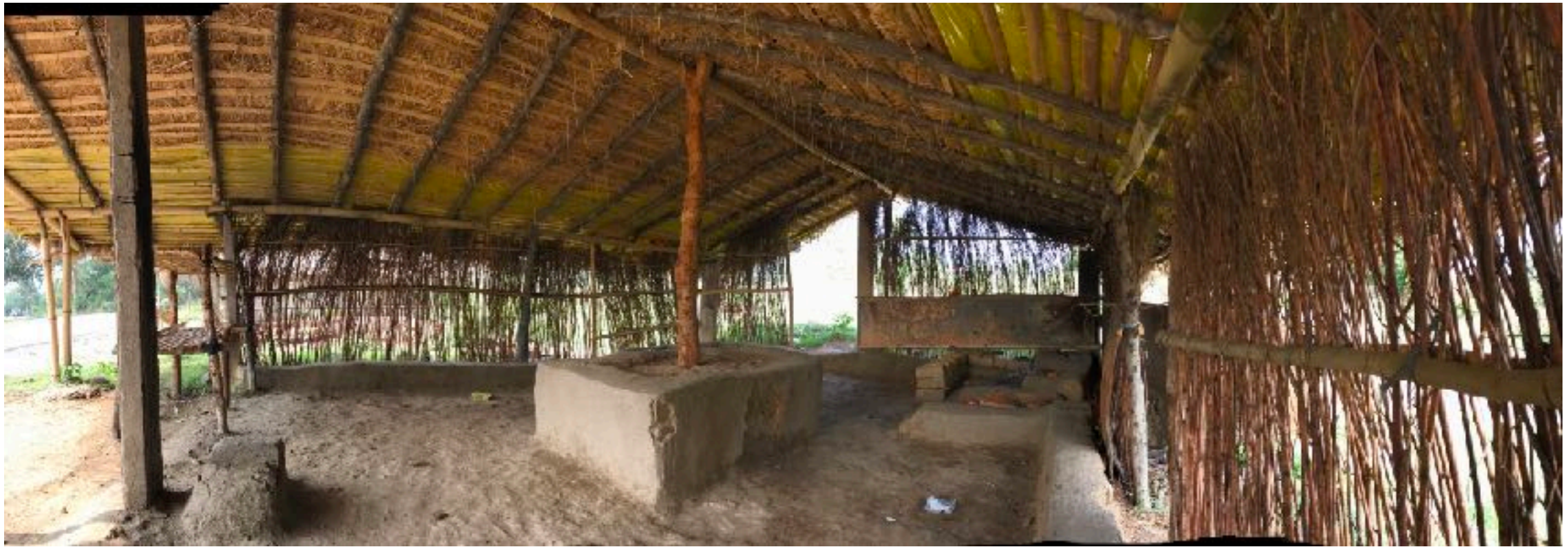
roadside refreshment and pesthouse