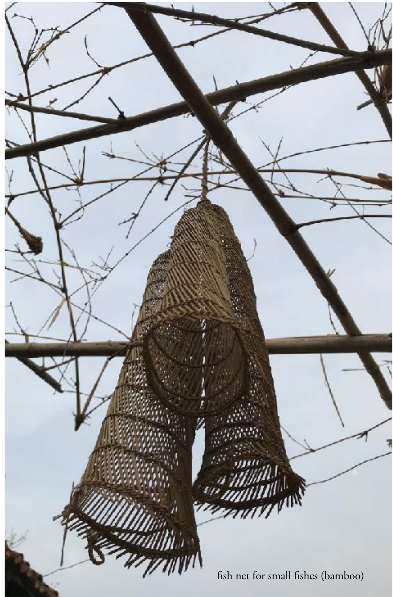
fish net for small fishes (bamboo)