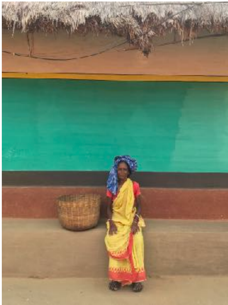
Santhali houses are vibrant and colourful