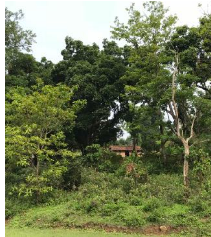
Ho houses are usually surrounded by dense forest with houses hidden behind it