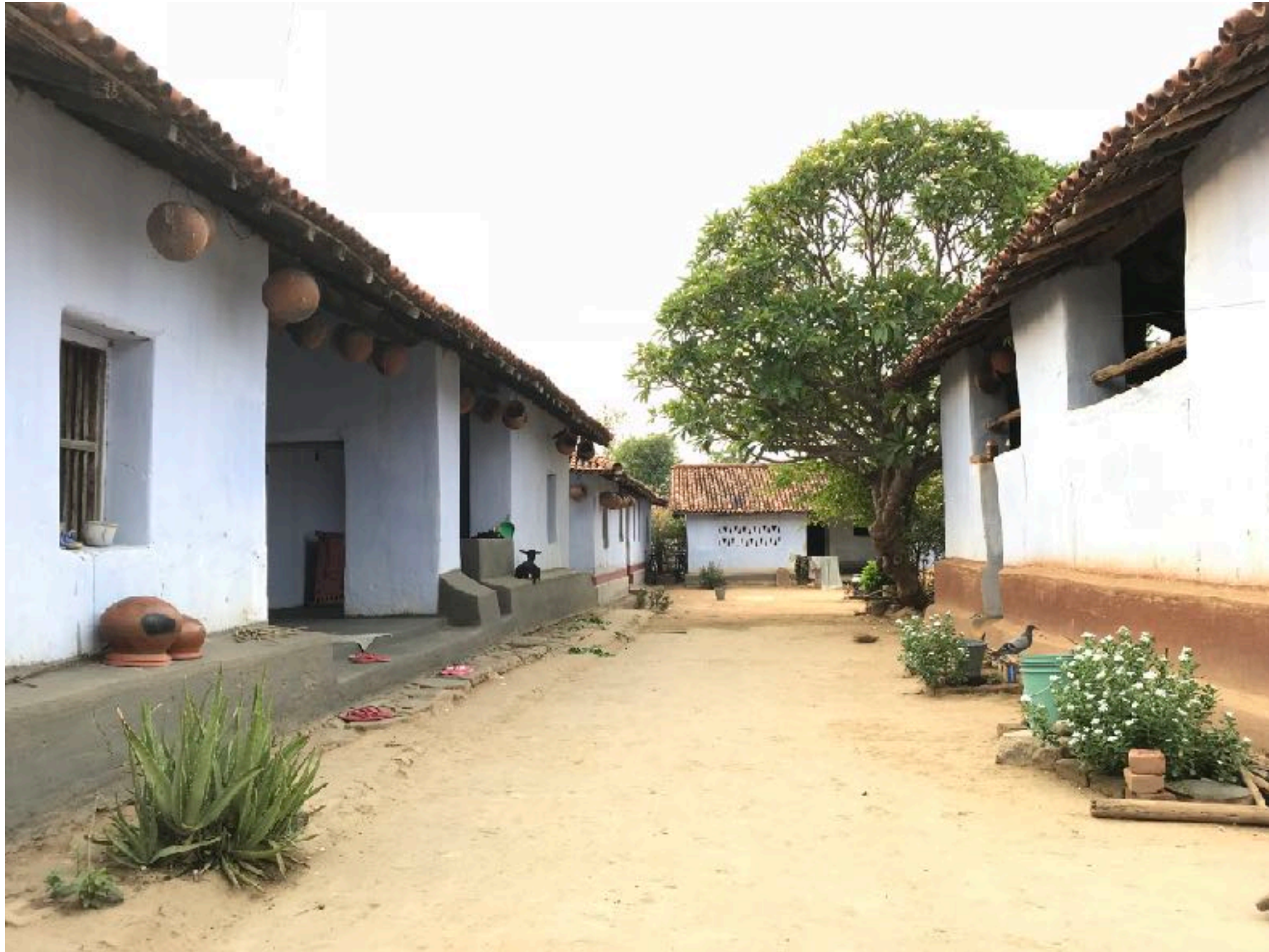
80 year old house. Old houses are bigger than newer houses