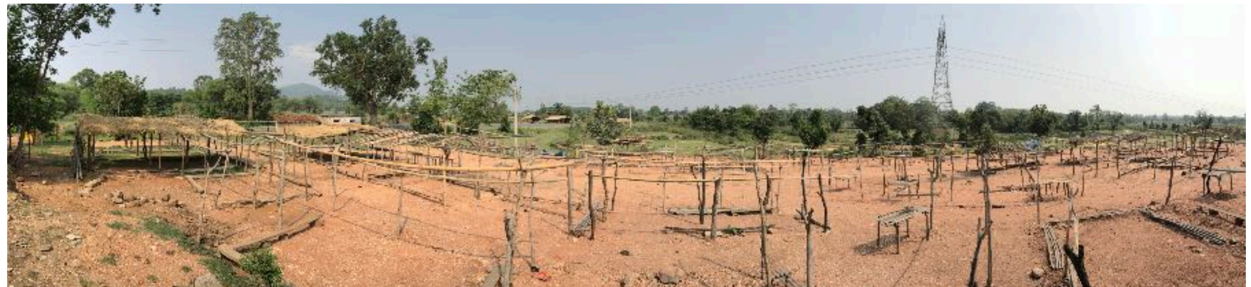
Weekly market (haat)