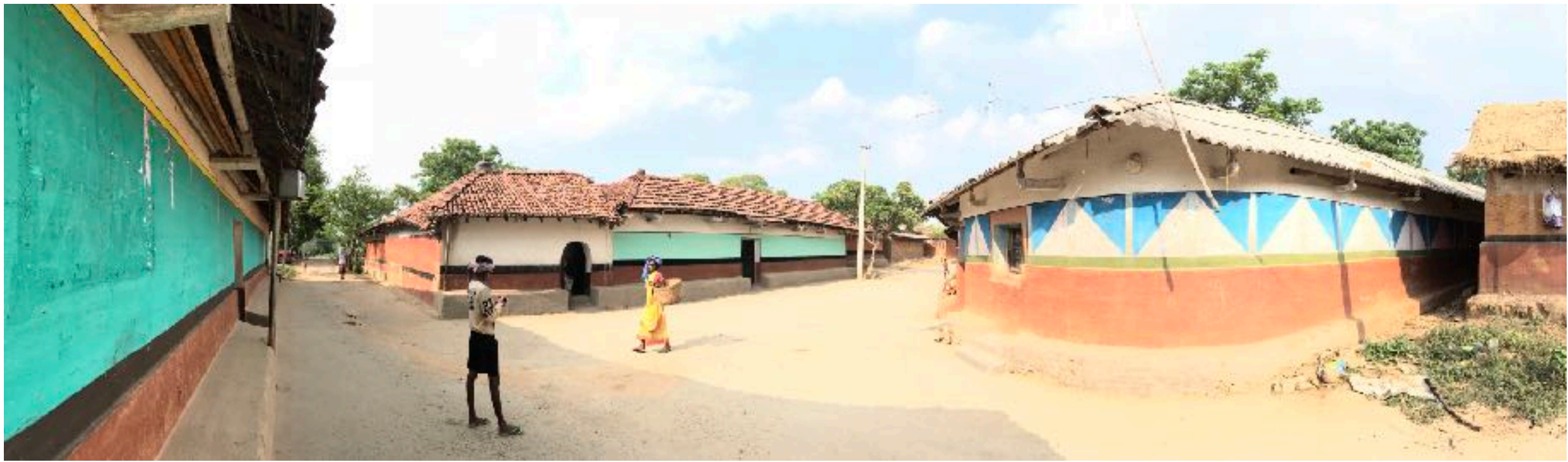
Houses share a common road