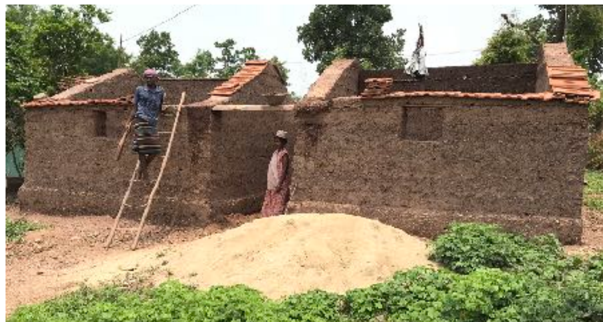
Rammed earth house construction