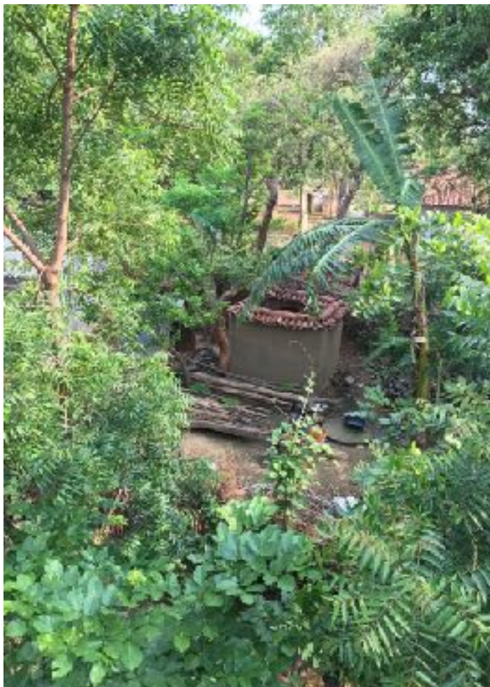
Bathrooms are usually outside the main house and are open on top