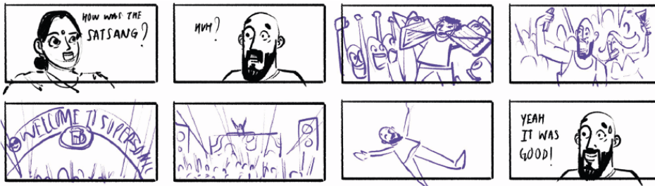
Storyboard of the concept

Hip hop montage is a subset of fast cutting used in film to portray a complex action through a rapid series of simple actions in fast motion, accompanied by sound effects. 'Fast cutting' is a film editing technique which refers to several consecutive shots. It can be used to quickly convey much information, or to imply either energy or chaos. Fast cutting is also frequently used when shooting dialogue between two or more characters, changing the viewer's perspective to either focus on the reaction of another character's dialogue, or to bring to attention the non-verbal actions of the speaking character. The thought of conveying an idea through a series of short clips is an interesting concept to study about. The aim of this project is to explore how consecutive closeup shots make a great hip hop montage sequence and to study why rhythm is a very pivotal part of making a very effective hip hop montage.