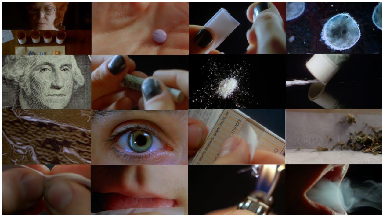
Snapshots of the Hip hop montage sequence from 'Requiem for a dream'

The thought of conveying an Idea through a series of short clips is an interesting concept to study about. I would like to explore how consecutive closeup shots make a great hip hop montage sequence and would also like to study why rhythm is a very pivotal part of making a very effective hip hop montage. Using this technique, I would like to explore the beginning to end journey of any inanimate object that we are very familiar with but are not aware of the story/journey behind its creation.