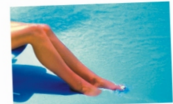
The art of eliminating tan lines