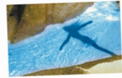
The art of imitating palm trees