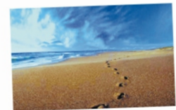
The art of finding yourself