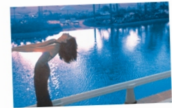
The art of unlearning Mondays