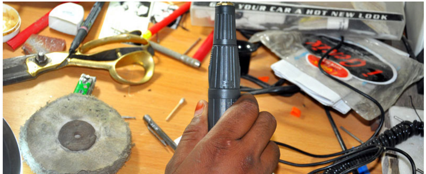
An artist at work and he uses few tools for the purpose.