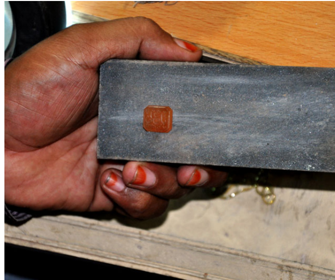
The precious stone is smoothed finally.

https://dsource.in/course/lucknow-calligraphy/making-process