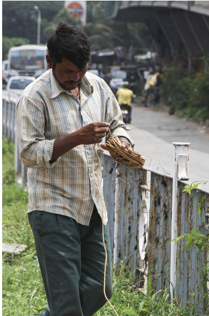
Craftsmen preparing the rope/wicker.