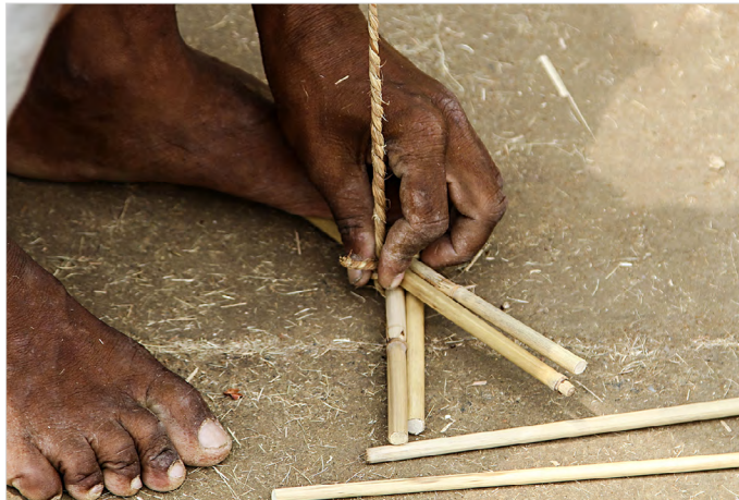
Bamboo sticks are tied together with bamboo twines.