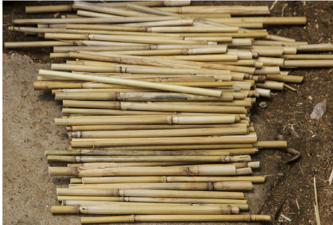
Cut bamboo sticks with equal size.