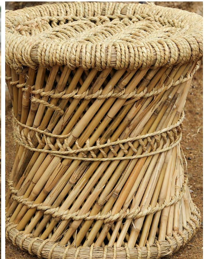
Medium size stool with a twisted design pattern.