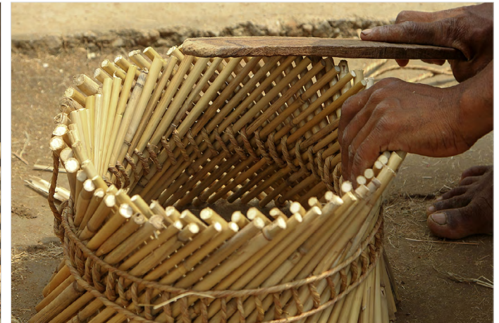
With a flat wooden piece the sticks are beaten to level them.