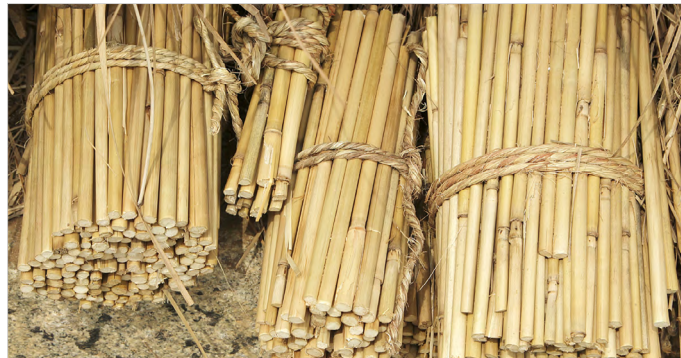
Bamboo is the raw material that is used to make stools and chairs.

It is used for tying the bamboo pieces together to form the stool.