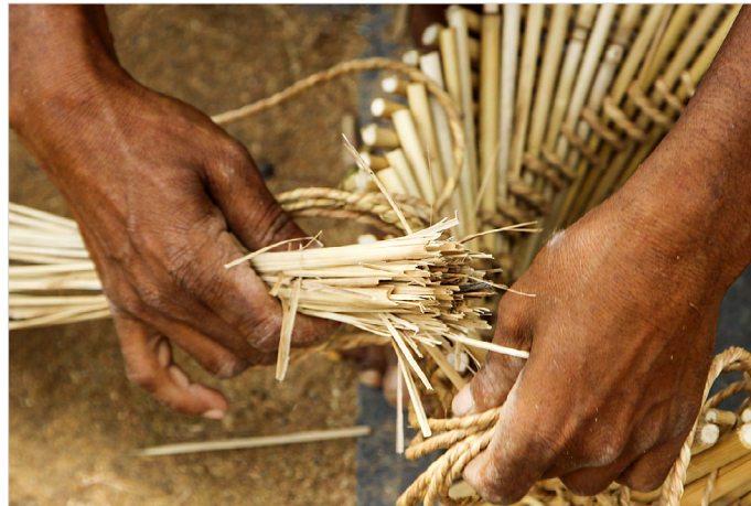
Thush the bamboo waste is inserted in twine loops.