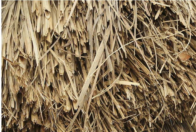
Waste parts of Bamboo.