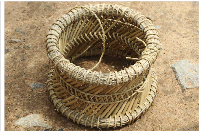
Beam of the stool made out of bamboo and cane.