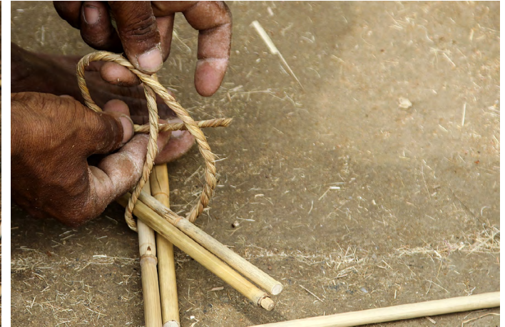
Pairs of bamboo sticks are arranged opposite each other in criss cross manner.