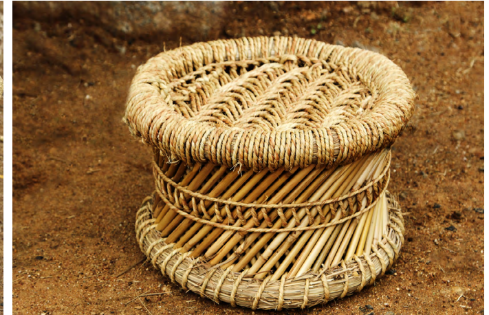
Small sized bamboo stool.