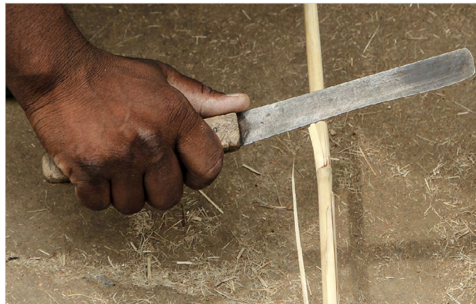
Thin strips of bamboo are cut using a knife.

The basic shape is then flattened by using the flat wooden piece (thokni) on the either sides to set the tied bamboo in place. Then the rope is tied to the upper side of the shape and various knots are formed, in which Waste bamboo strips are placed through the knots and each rope is pulled by the small wooden hook (Singri) and tightened so that it holds the waste bamboo strips in it forming the rim of the stool. The rope is inventively tied from one end of the rim to the opposite part of the rim. And with the help of the small wooden hook a pattern is been created to form the upper side of the stool. Likewise the whole bamboo stool is completed and ready for customers.