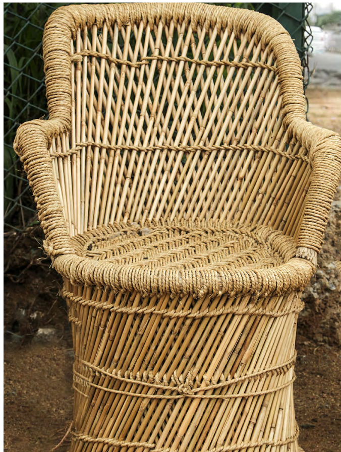
Chair made out of bamboo and twines.

A centre table knitted with bamboo and cane to enhance the pair of chairs adding charm to the entire set.