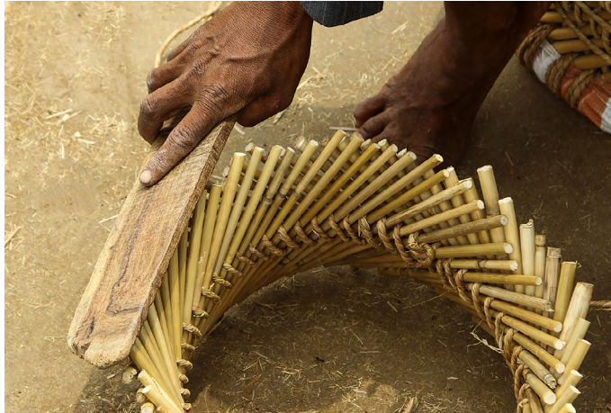
Flat Wooden piece known as Thokni is used to beat the bamboo.