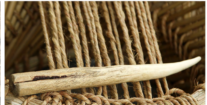
Small wooden hook called a singri is used to tighten the twine ropes.