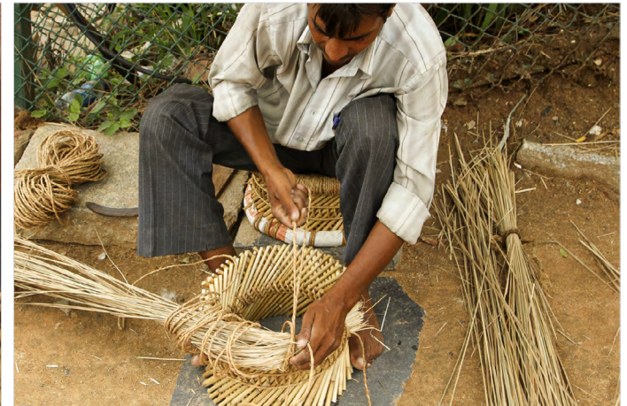
Thush is used to prepare the base of the bamboo strap.