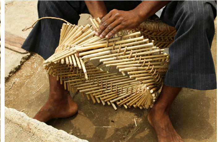
Prepared strap is then rolled into a circular form.