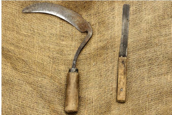
Knife used to cut bamboo stick.