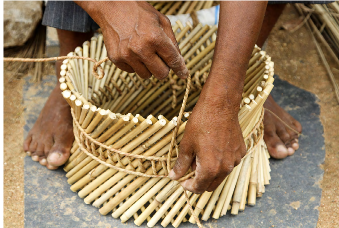
Bamboo twine is inserted in between the strap.