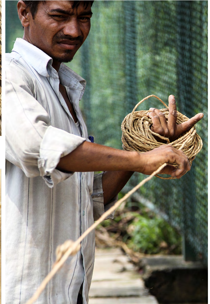
The wasted strips are taken and twisted into bamboo twines.