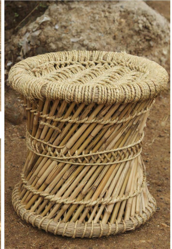
Medium size stool made of bamboo and cane.