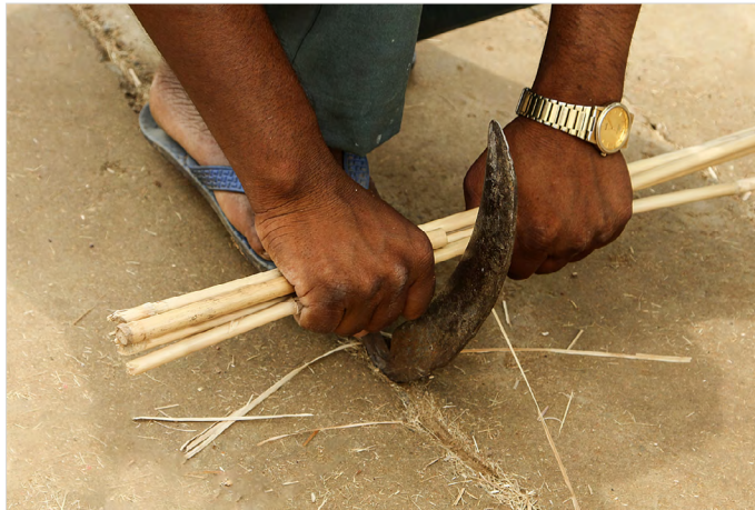
Bamboo sticks are measured and cut in uniform length.