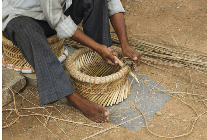
Craftsmen weaving the base of the stool.