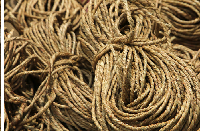
Twines made out of bamboo waste.