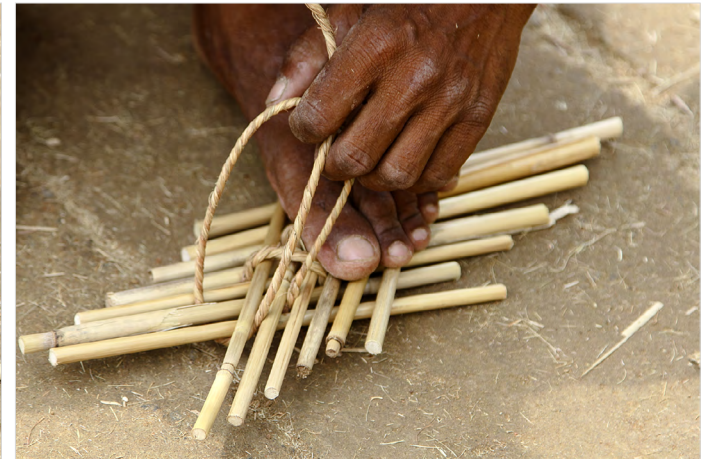
Bamboo sticks are added one by one to create a strap of bamboo.