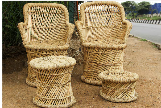
Pair of chair and two different size of stools made of bamboo.