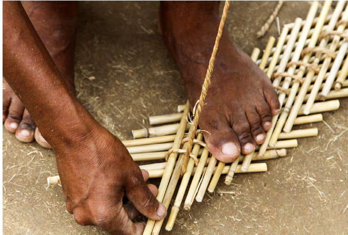
Bamboo straps are weaved till the required length.