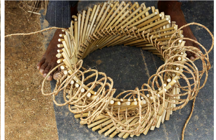
Loops of twine are made around the bamboo strap.