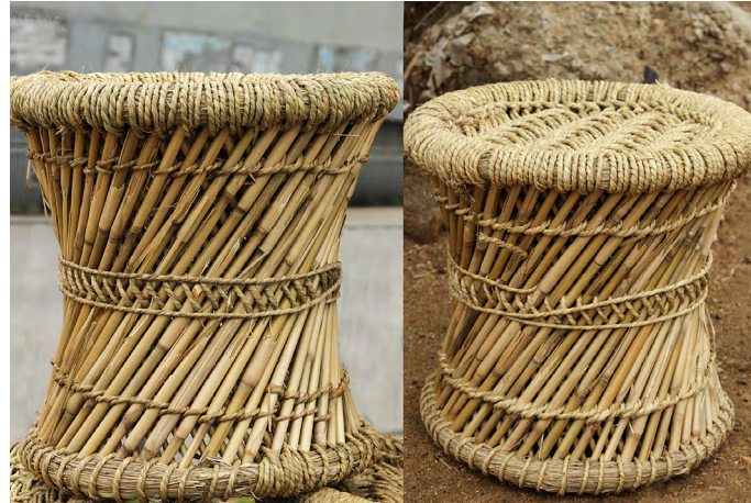
Twisted pattern of the stool makes it more appealing.

https://www.dsource.in/resource/bamboo-stool-bengaluru/products