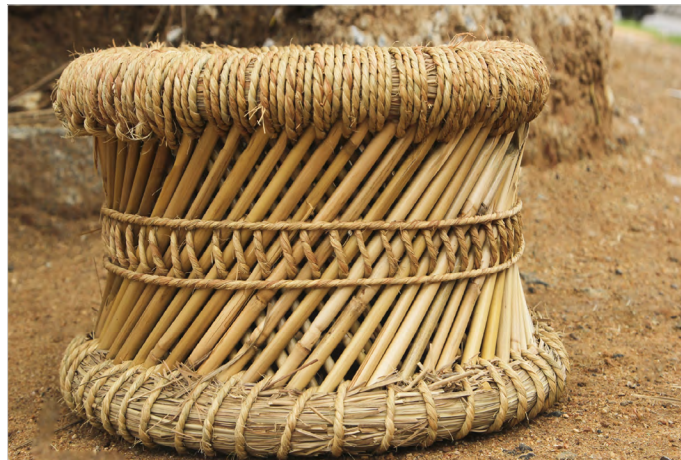
Small size stool made of bamboo and cane.

Craftsmen from Rajasthan (migrants) found their way to Bengaluru after being to Tamil Nadu, Maharashtra. Initially the craftsmen used to bring the finished products to trade, but that cost them a lot of expenses so they learnt how to make these bamboo crafts, which saved expenses. The variety of bamboo used for making the bamboo crafts doesn't grows on the slope, So they have to bring all the raw materials from Rajasthan itself. Almost about 300 households in the village near by district involves in making the bamboo crafts. It is observed that there is no particular caste or community in Rajasthan who are exclusively connected with the traditional craft. It is generally carried on by all, particularly the peasants irrespective of caste, community or creed.