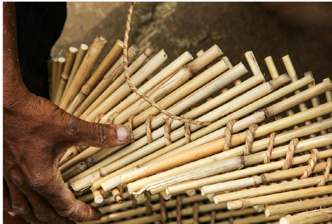
The ends are tied and knotted with bamboo twine.