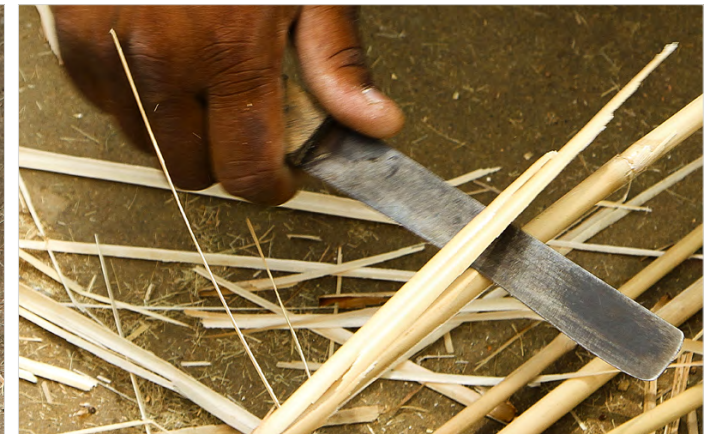
Strips should be thin enough to twist and turn.