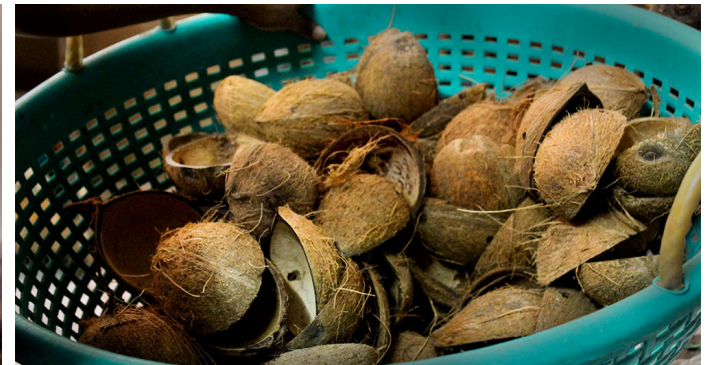
Shells are cut in half to make the bird feeder.