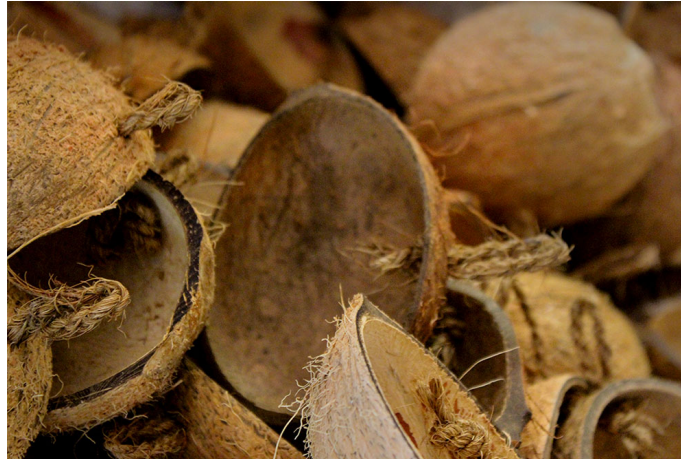
Ready to use bird feeder container.

Bird feeders are available in various sizes and shapes. The cost of these bird feeders depends on the size and shape of the coconut shell bird feeder. The smallest bird feeder costs INR.70.