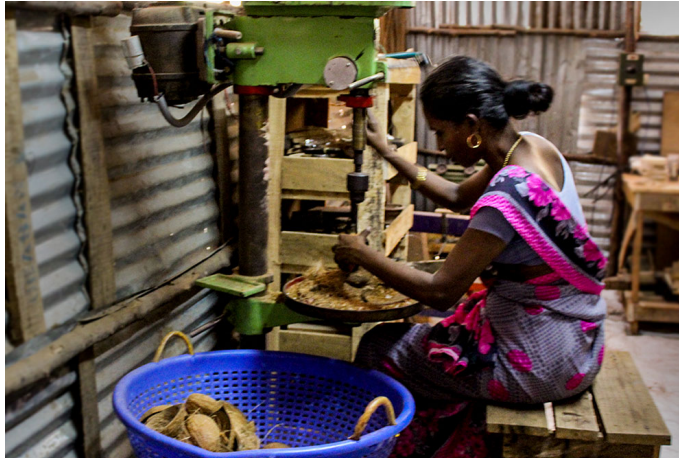
Artisan uses jigsaw machine for making hole in the coconut shell.