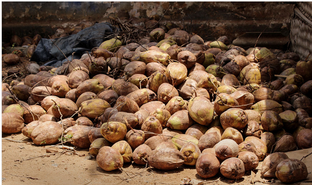
Coconut agglomerate has been taken to make the coconut shell bird feeder.