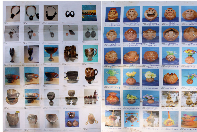
The product by Buddha handicrafts.