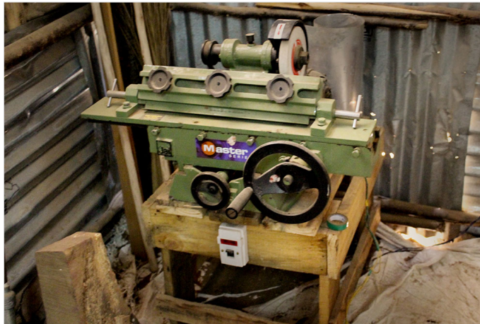
The machine is used for pumicing shell.