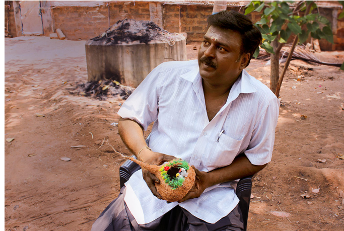
Admiring the beauty of bird nest.

https://dsource.in/resource/coconut-shell-bird-feeder-kanyakumari/introduction