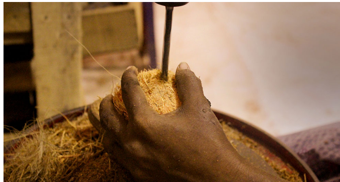
The artisan is puncturing the coconut shell.

The inner part of the shell is further filled with grain mixture. Grains or sesame seeds are mixed with rice starch. This acts as a binding agent that gets fully fixed in the shell. It is allowed to dry completely. The drying of the mixture filled within the shell depends on the climatic condition. Usually, it takes nearly 24 hours to dry. Once the grain mixture is dried completely, it can be hung on trees or on the birds' selected area to feed.