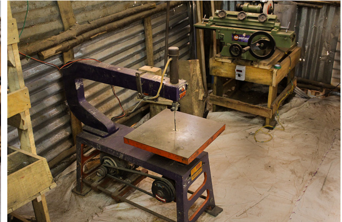
The machine is used to cut the shells into the required shape.