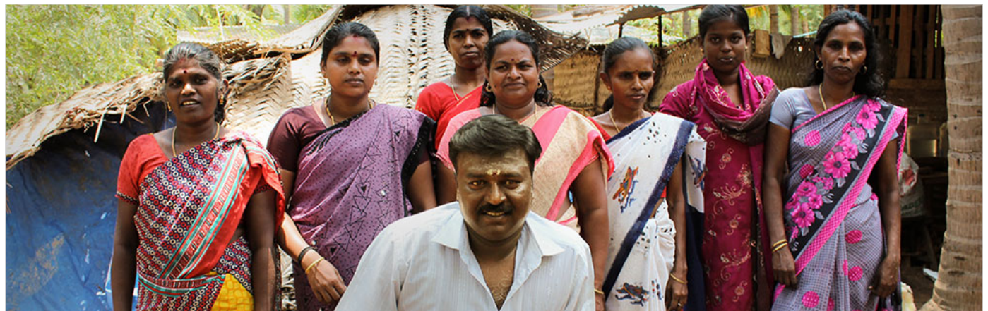
Skilled artisans of Buddha handicrafts.

Coconut shells are eco-friendly and readily available. Artists reuse these shells by processing them. Shells are used as a container for bird seeds. They are scrapped, polished, and the ready-to-use seed bars put into them. A rope loop is attached to the shell to hang it outdoors. A natural bird feeder attracts birds to eat seeds. Buddha Handicrafts provides employment opportunities to women artist utilizing their leisure time.