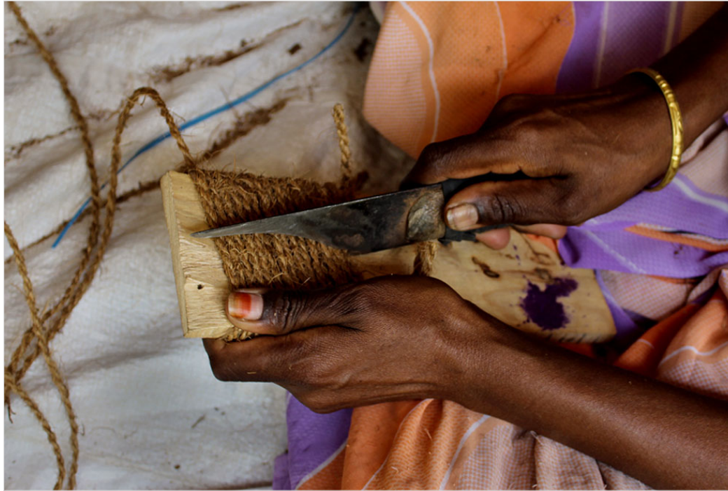
The sharp knife is used for cutting the ropes.