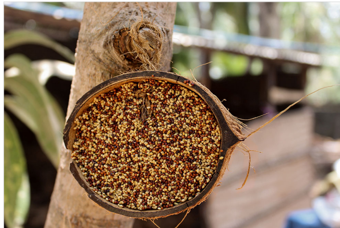
A coconut shell bird feeder is hanging on a tree.