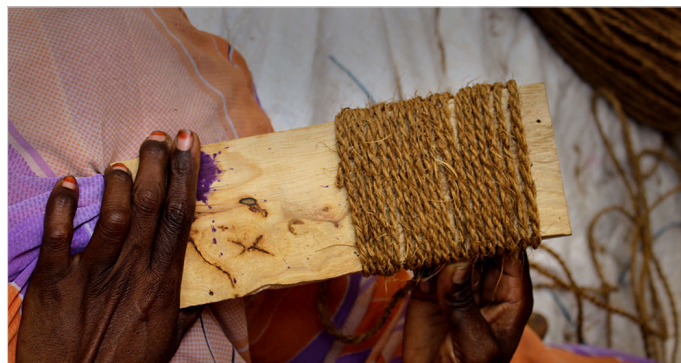
A twine thread is rolled around a wooden plank.