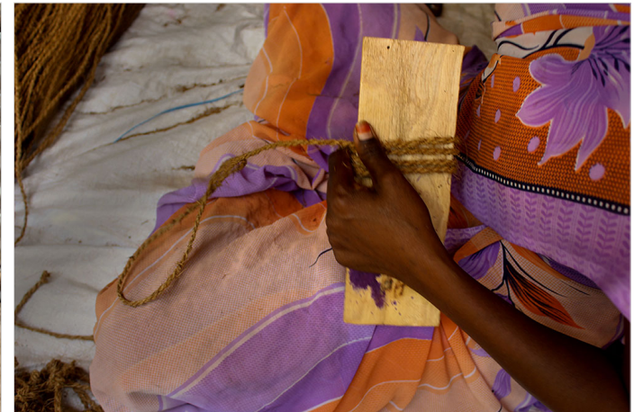
Wooden plank is used to cut the twine rope.