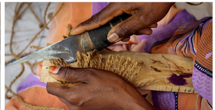
The rolled thread is cut using a sharp knife.