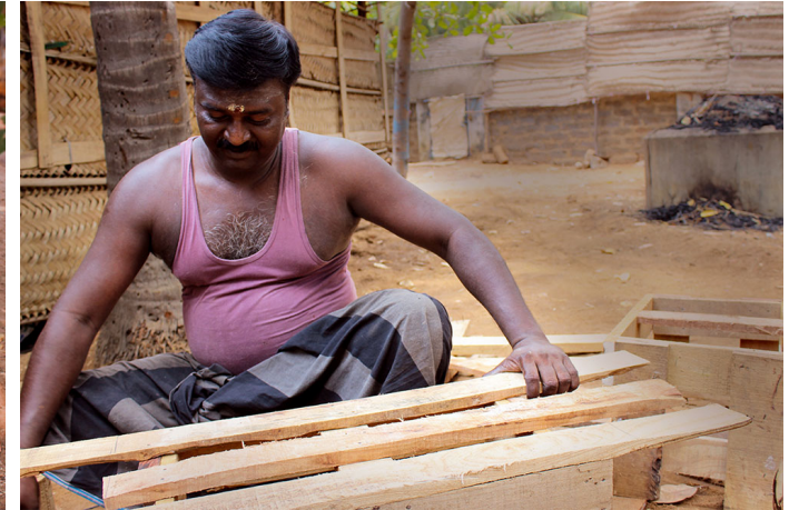
Artisan is making the wooden boxes to parcel the coconut shell bird feeder.