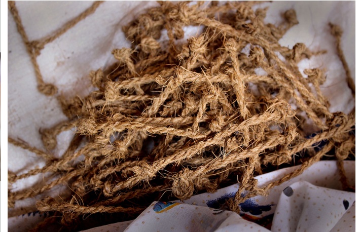
Knotted fiber threads are used to put suspension.