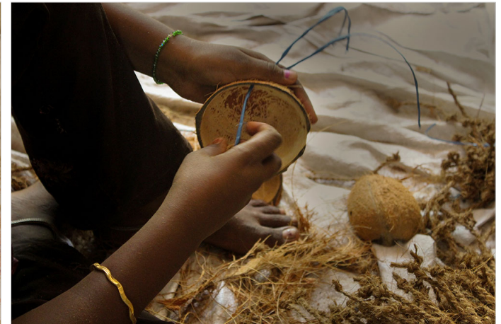
Blue colour plastic thread inserted into the shell hole.