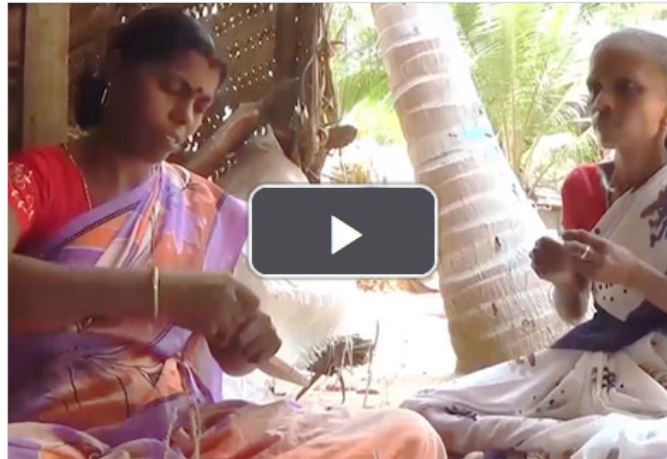
Coconut Shell Bird Feeder - Kanyakumari