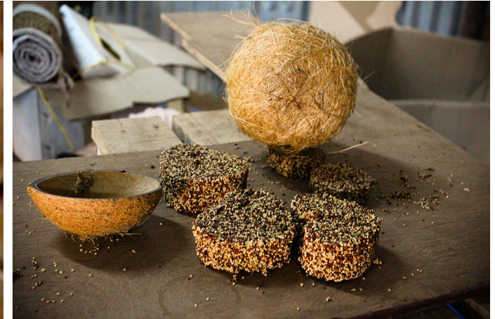
A seed mixture is ready to fill in the shell.