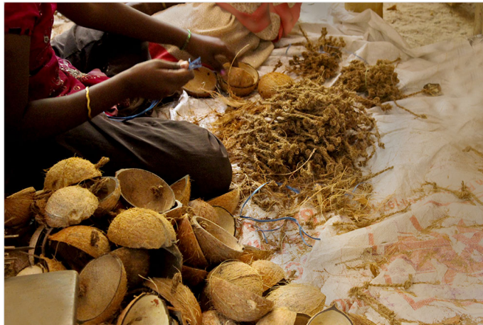
Artisan is taking the shell and blue colour thread.