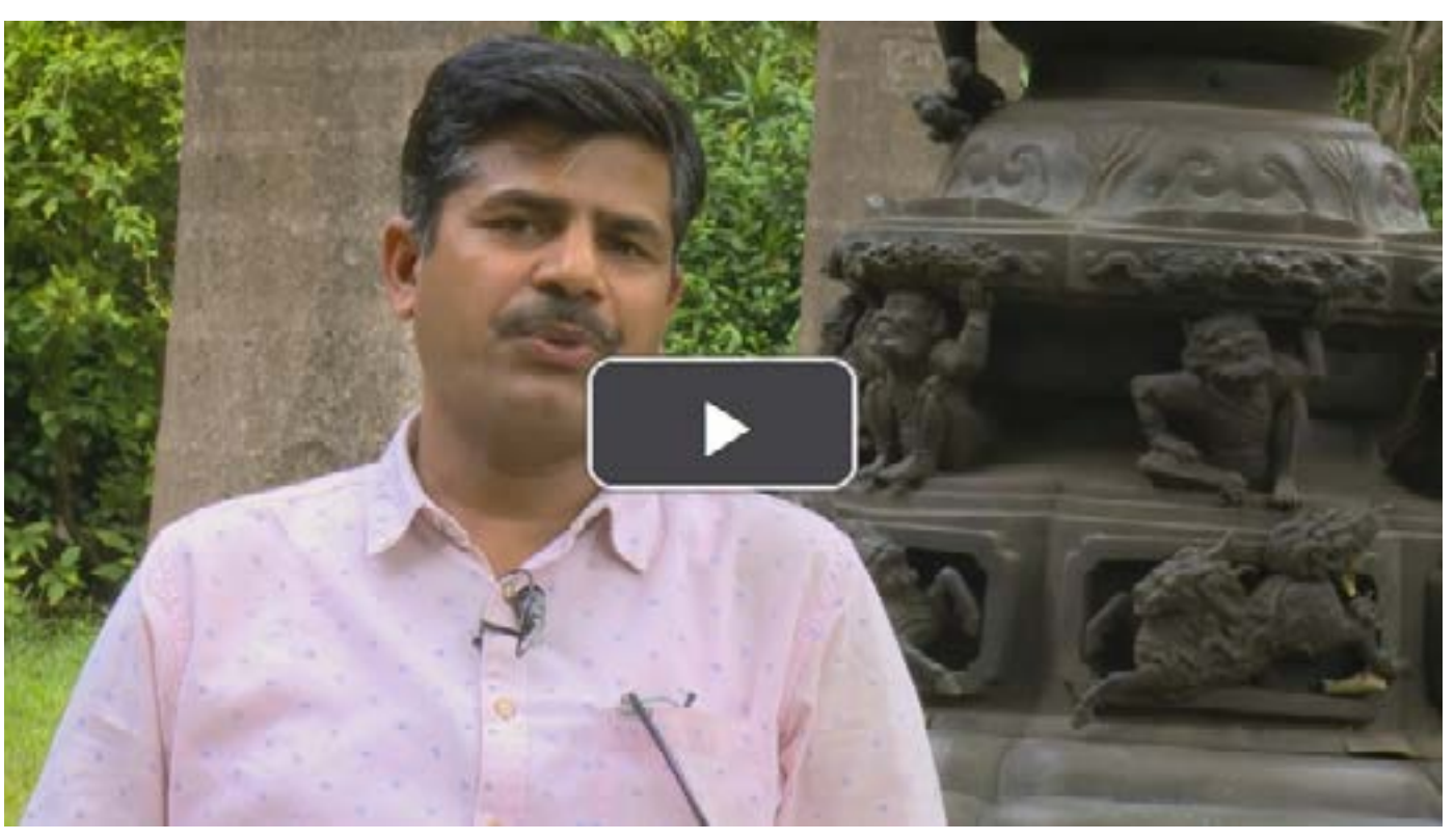
Gemstone Making Process