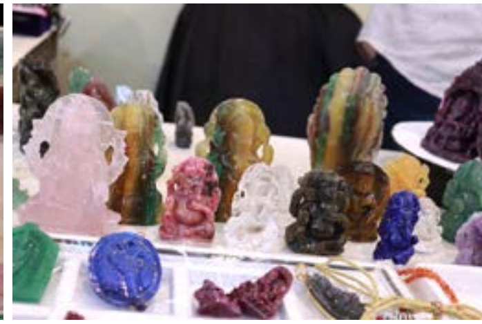
Variety of Idols at stall.