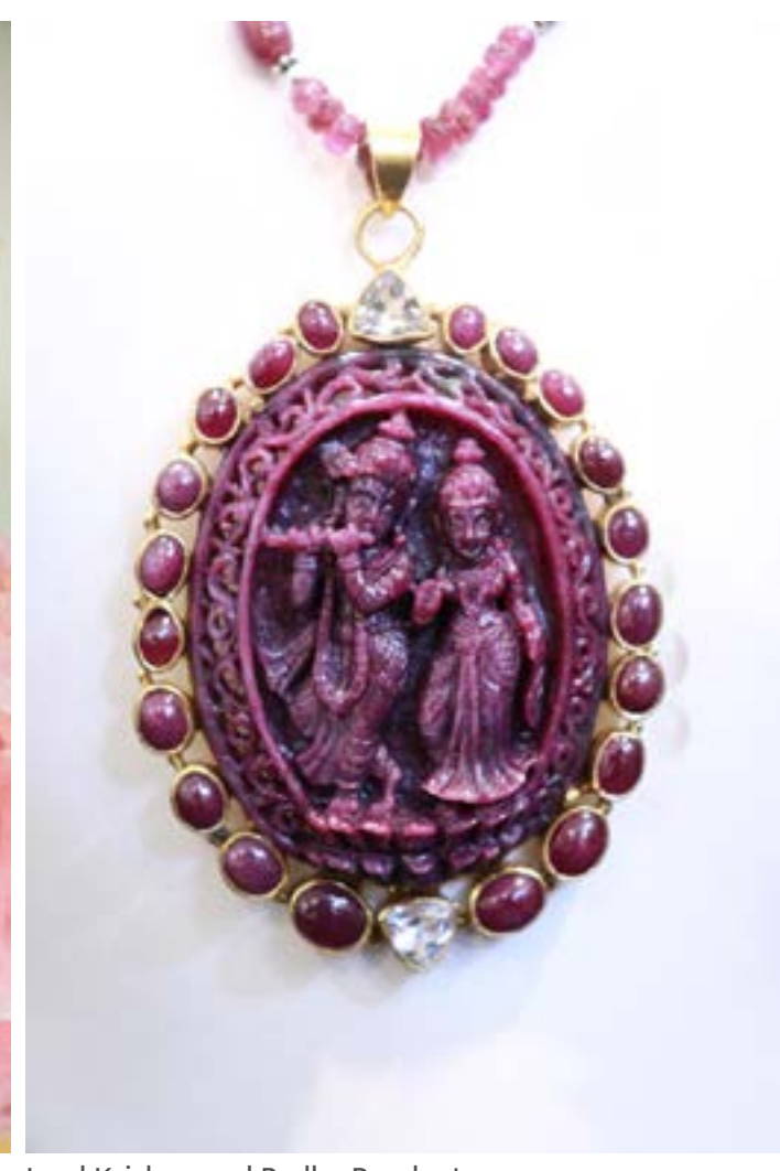
Lord Krishna and Radha Pendant.