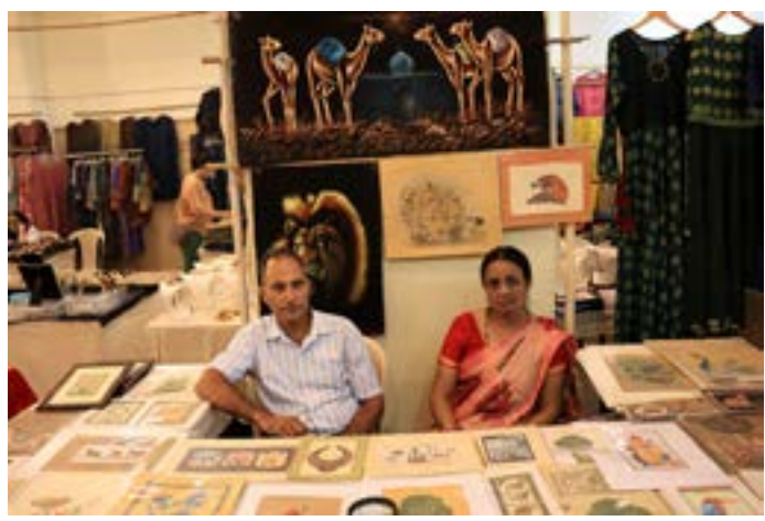
Miniature Painting Stall.