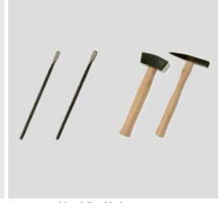
Tooth chisel, Flat chisel and Point chisel.