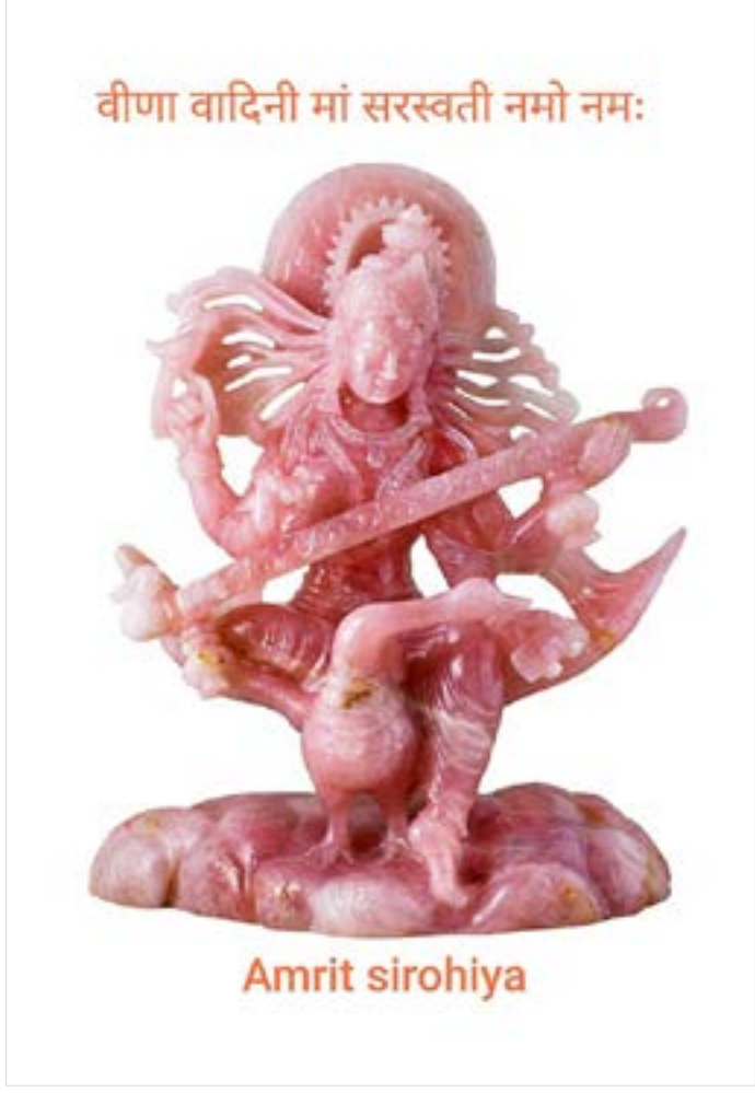
Goddess Saraswati of Rose Quotes Stone.