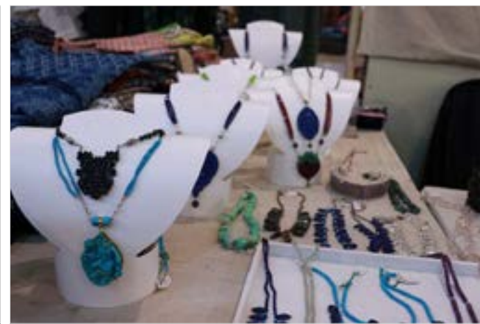
Necklaces displayed for sale.