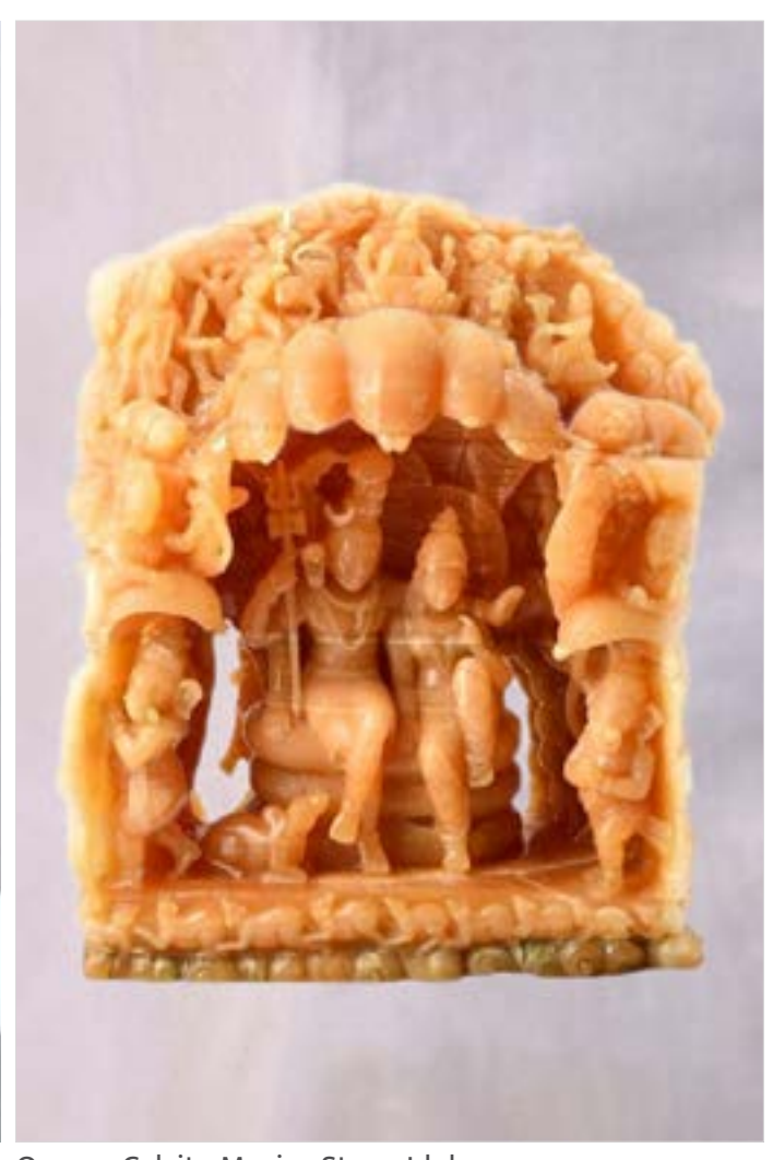
Orange Calcite Mexico Stone Idol.