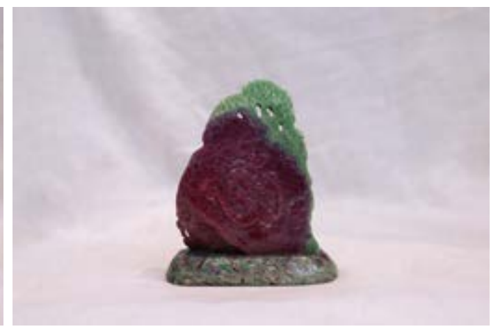
Back View of Radha and Krishna Idol.