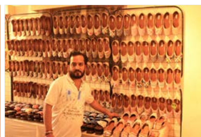
Leather Footwear Stall.