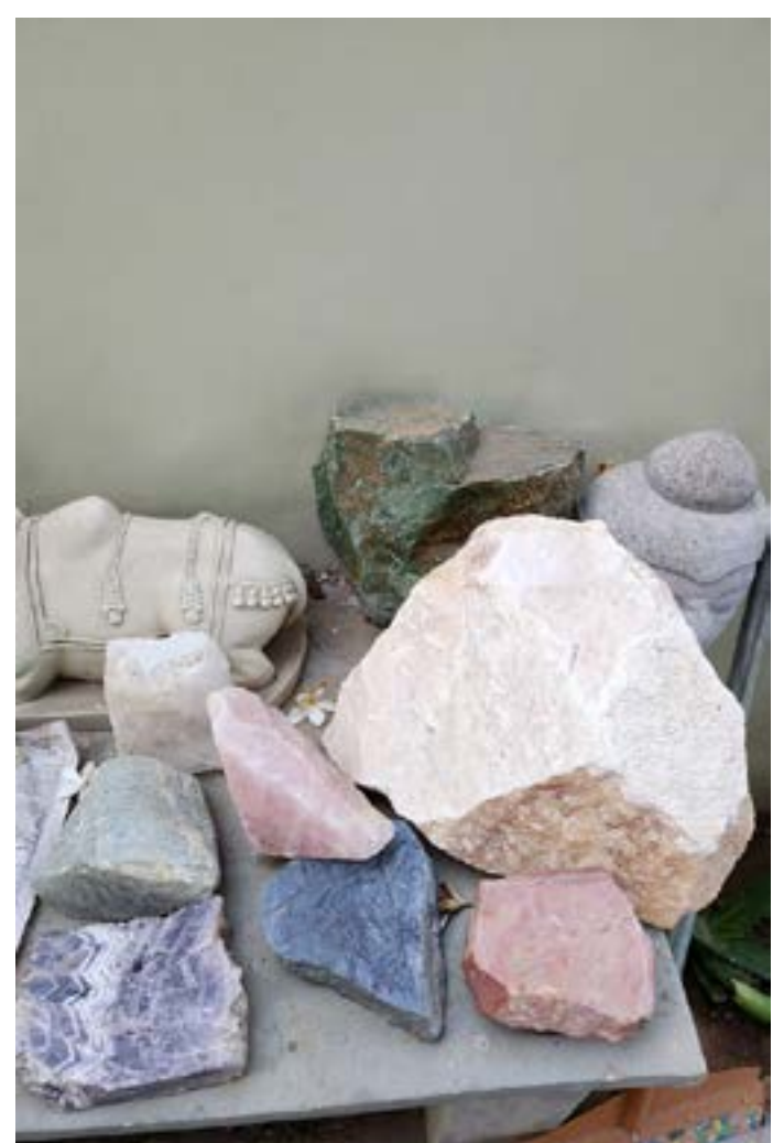
Different Coloured Raw Stones.