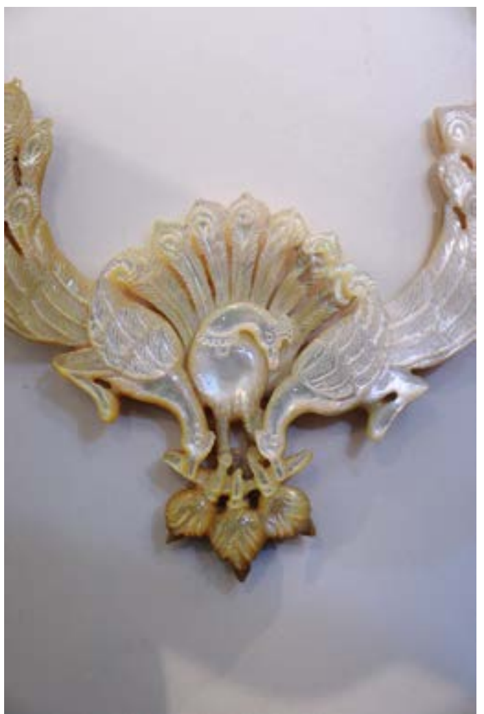
Intricately Carved Peacock Pendant.