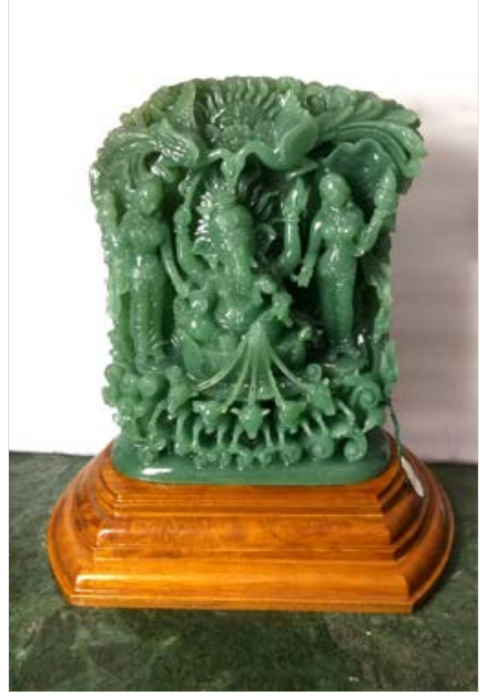
Lord Ganesh with chariot.