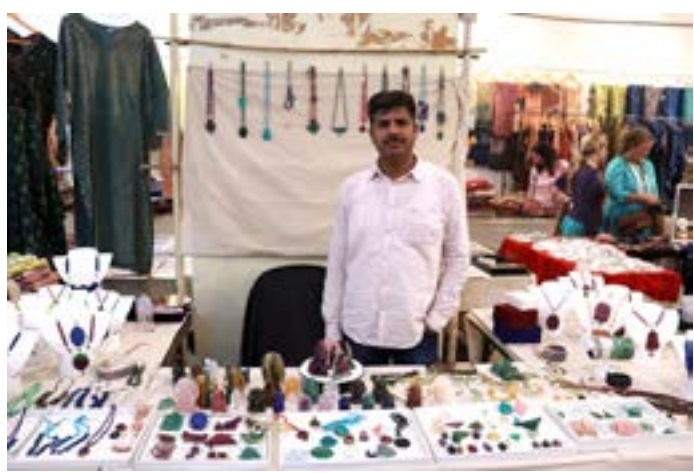
Gemstone Carving Stall.