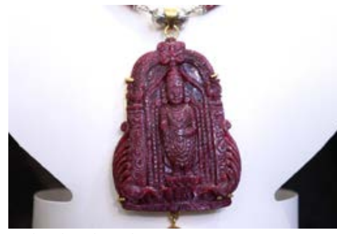
Lord Venkatesh Pendant.