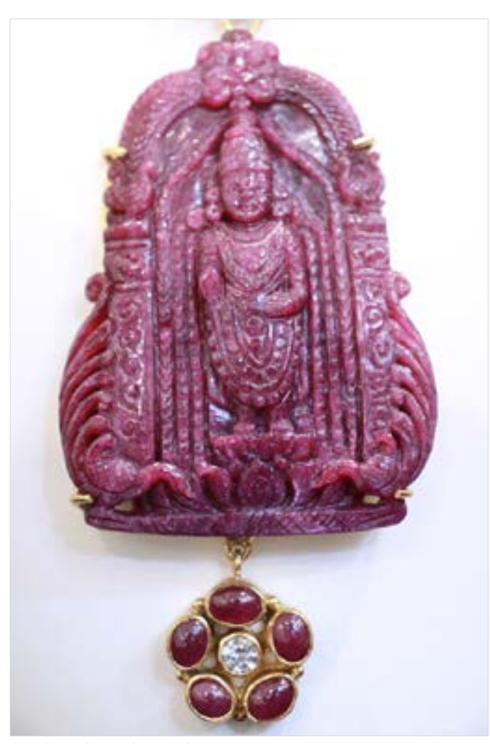
Lord Venkatesh Pendant.