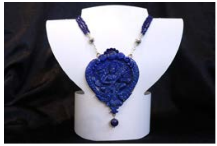
Necklace with Goddess Saraswati Pendant.