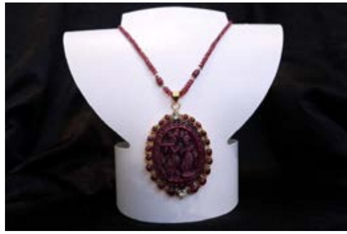
Necklace with Lord Krishna and Radha Pendant.