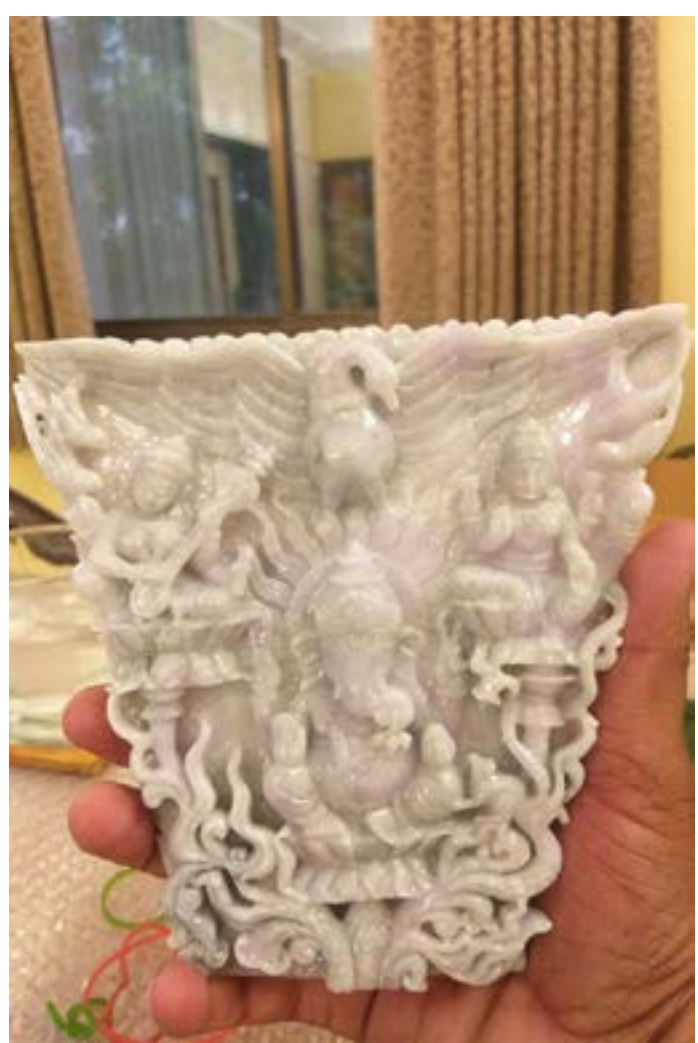
Jead Stone Idol.