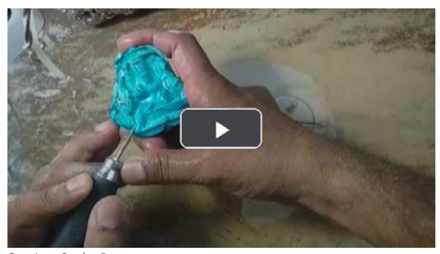
Gemstone Carving Process