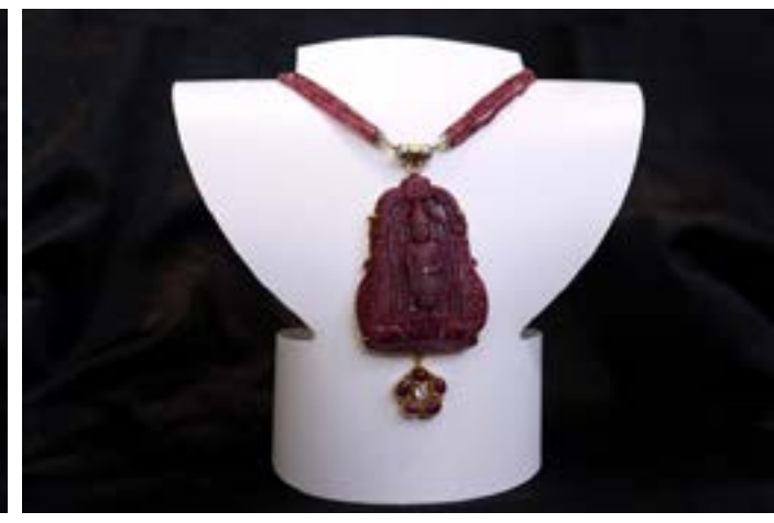
Necklace with Lord Venkatesh Pendant.