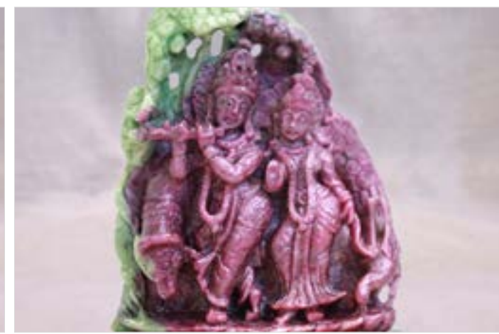
Radha and Krishna Idol.