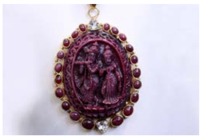
Lord Krishna and Radha Pendant.