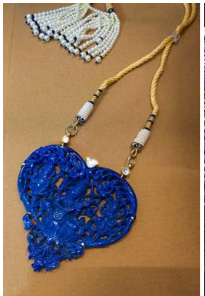
Pendant of Lapis Lazuli.