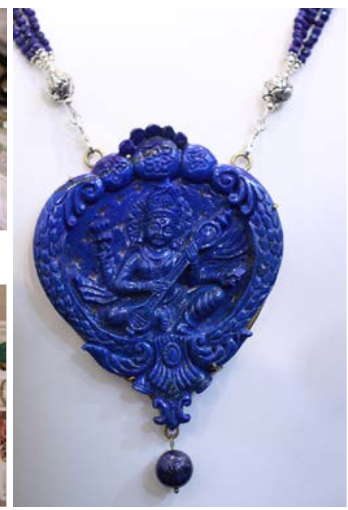
Goddess Saraswati Pendant.