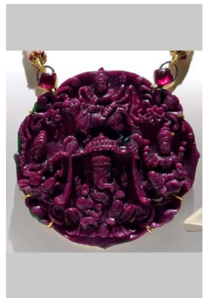
Ganesh Pendant of African Ruby.