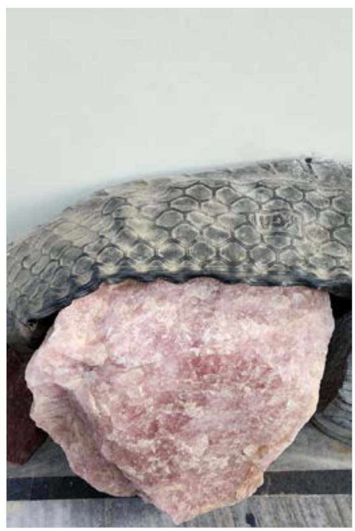
Rose quotes raw stone.