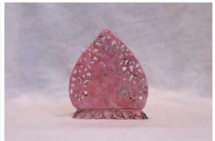
Back View of Lord Buddha Idol.