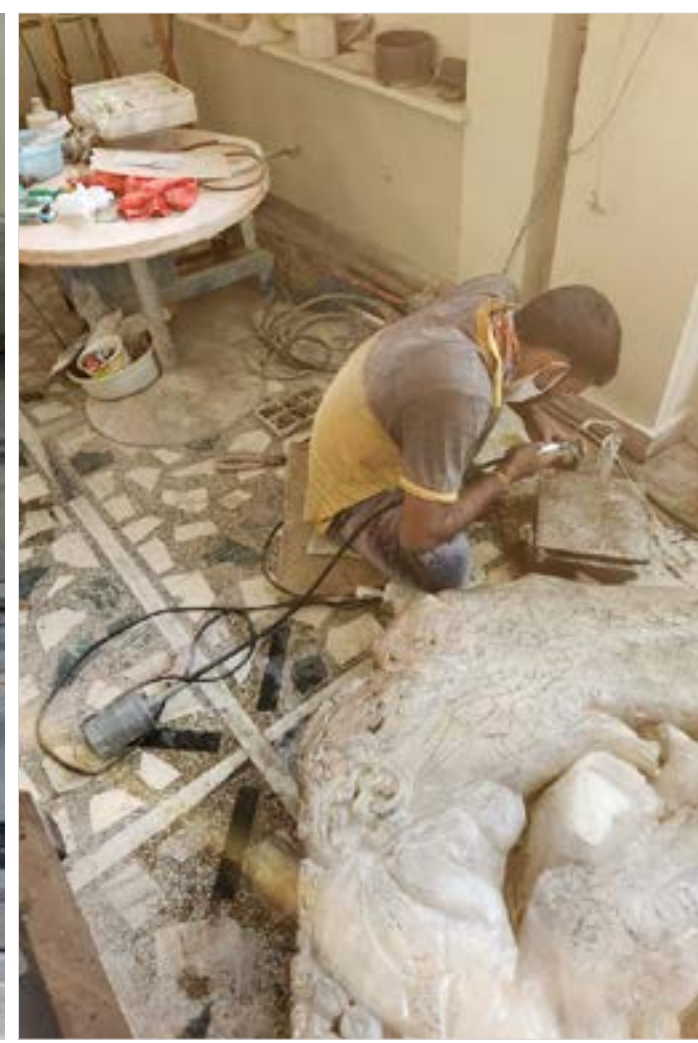
Artist cutting the stone.