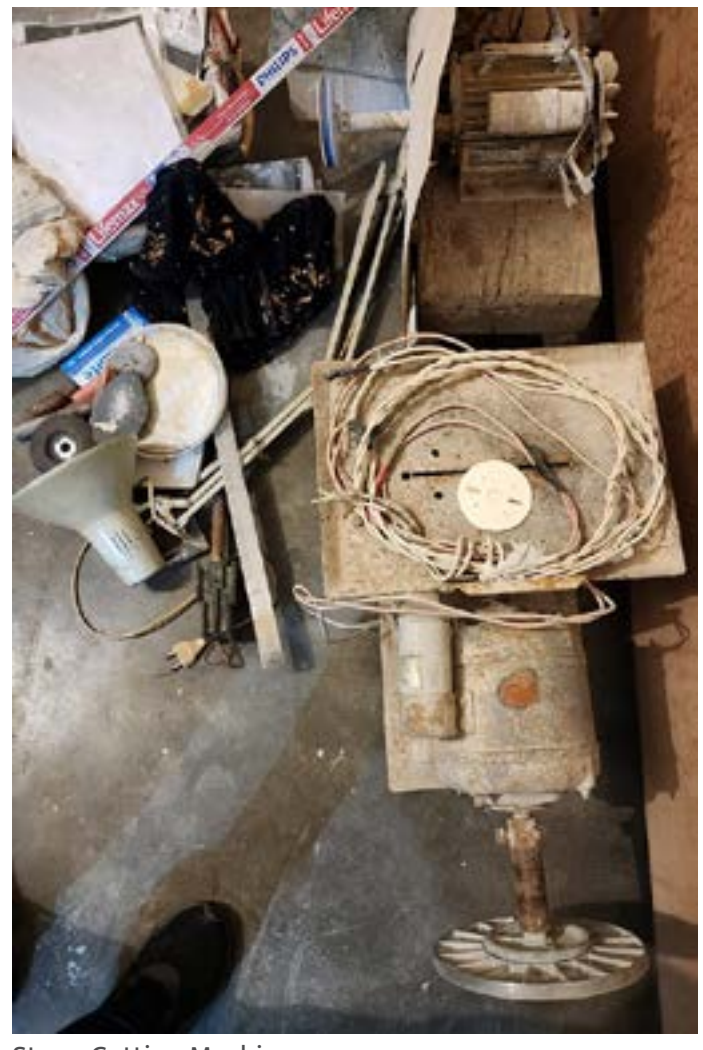
Stone Cutting Machine.