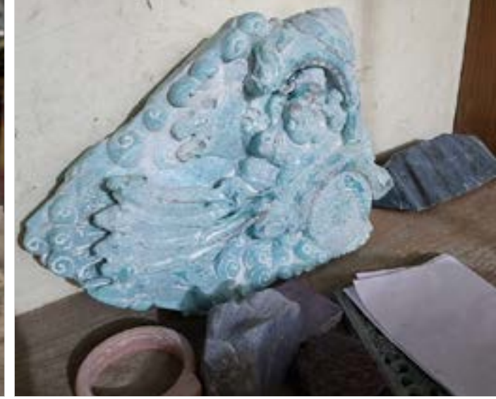
Idol making in process.