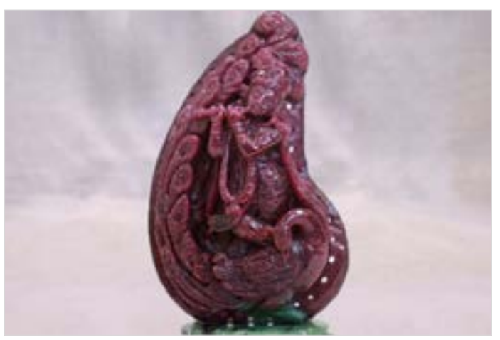
Krishna Playing Flute.