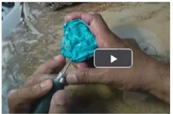
Gemstone Carving Process