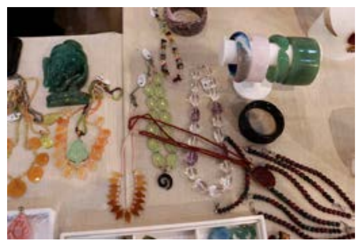
Necklaces displayed for sale.