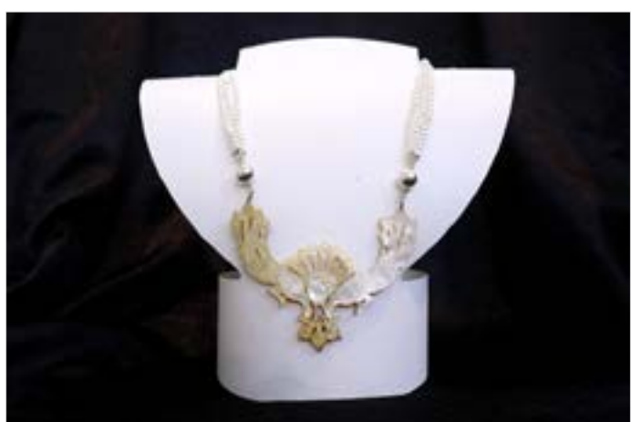
Necklace with Peacock Pendant.