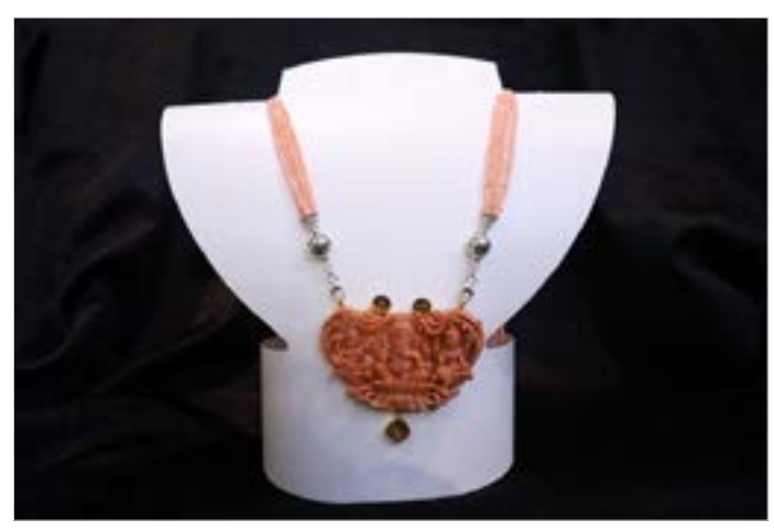
Necklace with Lord Ganesh Pendant.