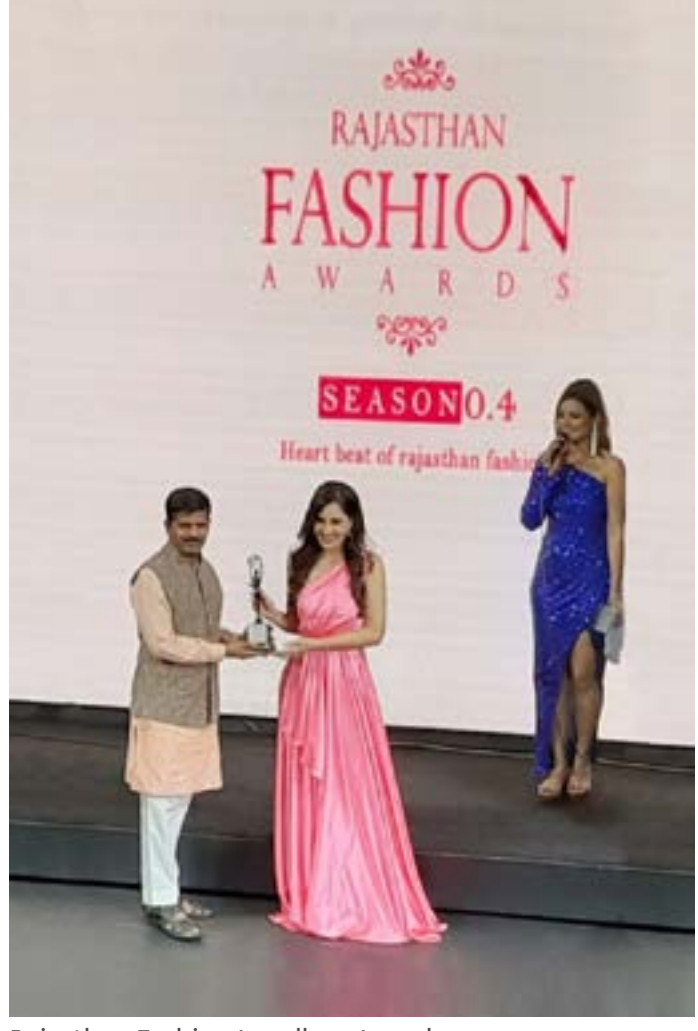
Rajasthan Fashion Jewellery Award.