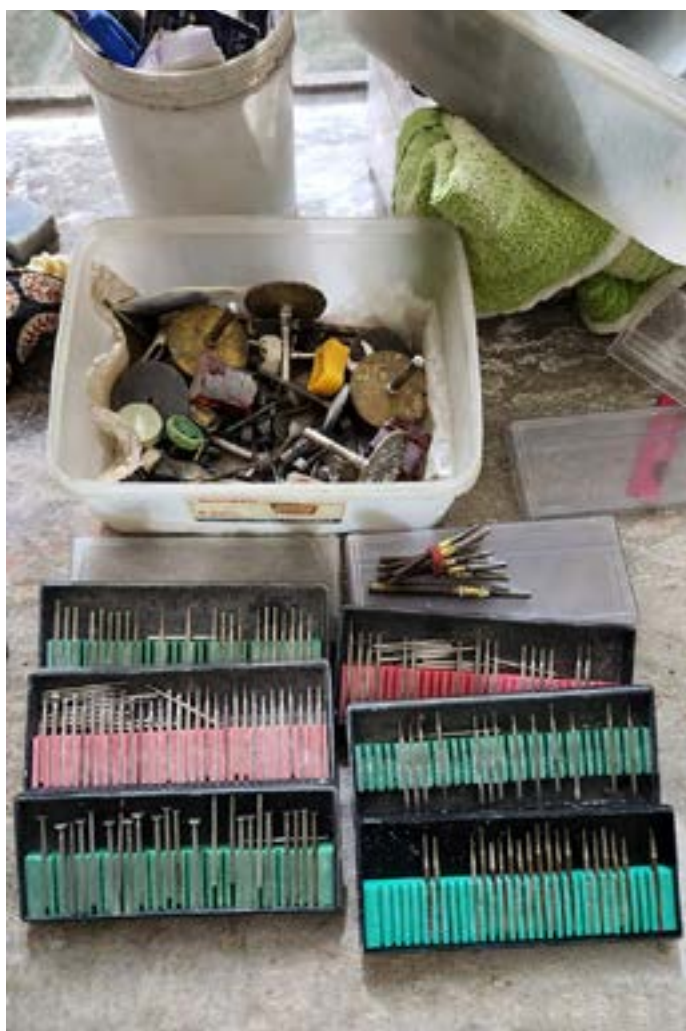
Dimond tools used for stone carving.