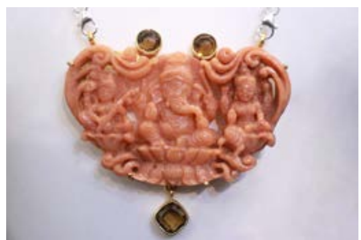
Lord Ganesh Pendant.