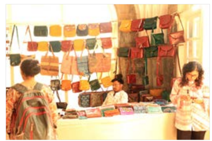
Leather Purse Stall.