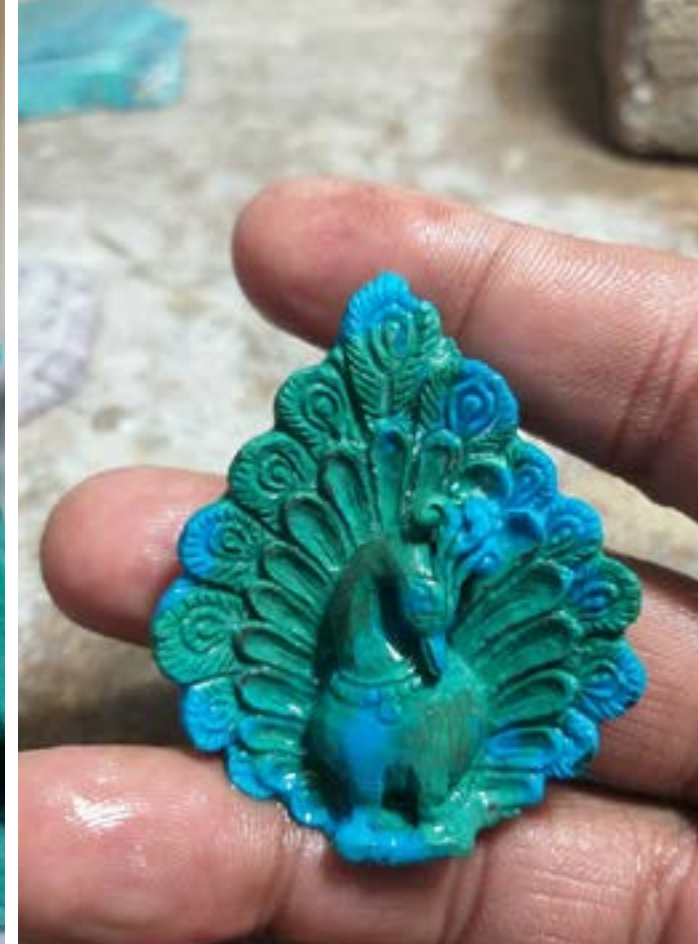
Crysocola Stone Peacock.