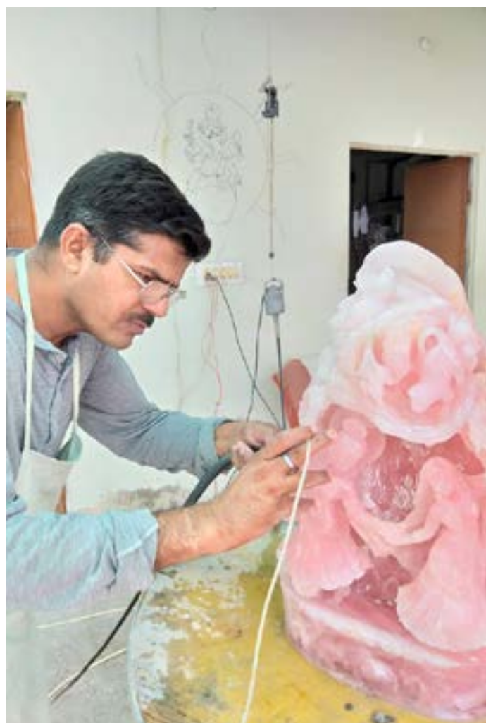
Artist working on Radha Krishna idol.