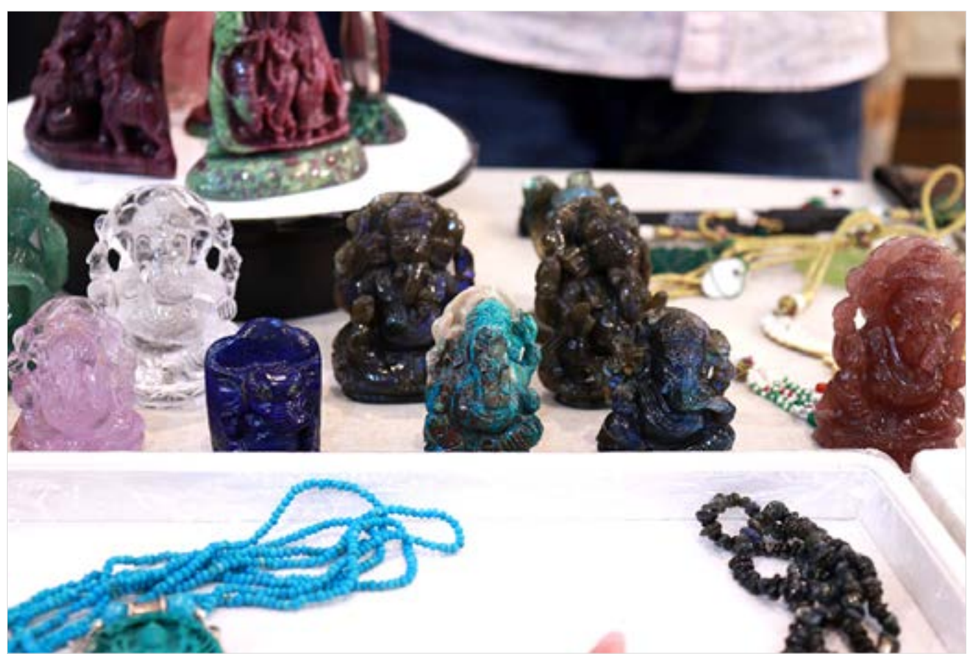
Variety of Idols at stall.