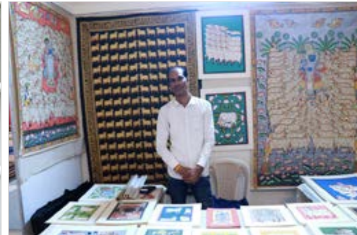
Pichhwai Painting Stall.