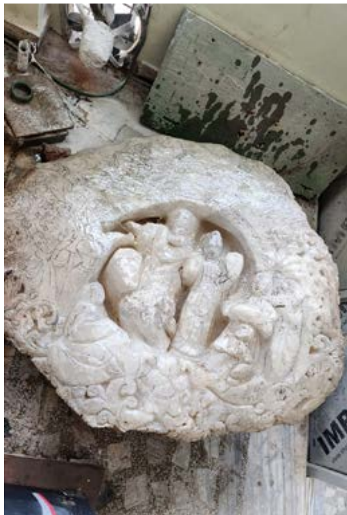
Sketch is drawn on the stone before carving.