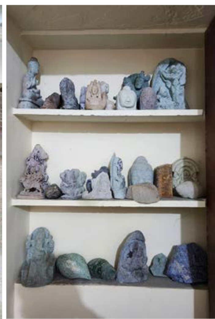
Idols under process.