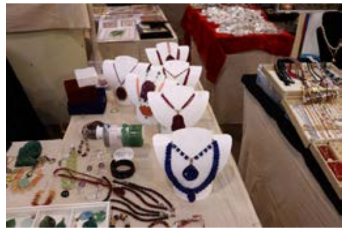
Necklaces displayed for sale.