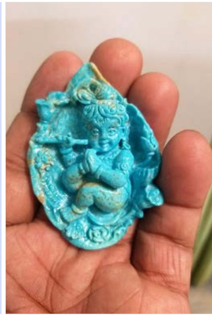
Turquoise Stone Little Krishna.