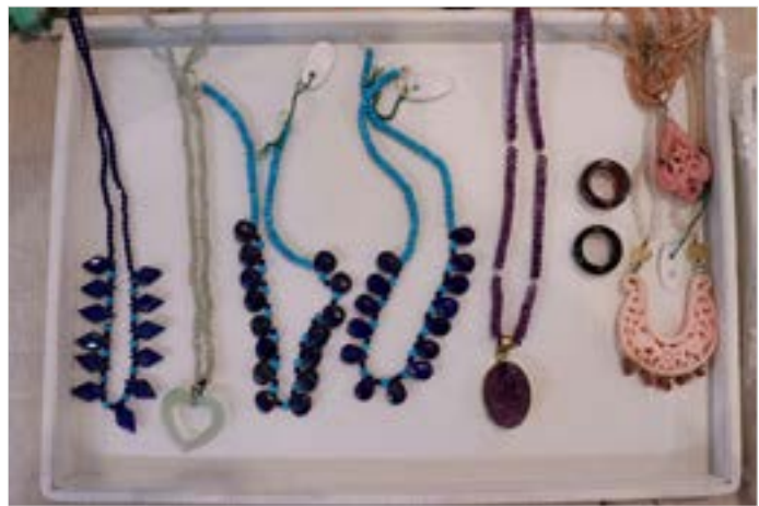
Necklaces displayed for sale.