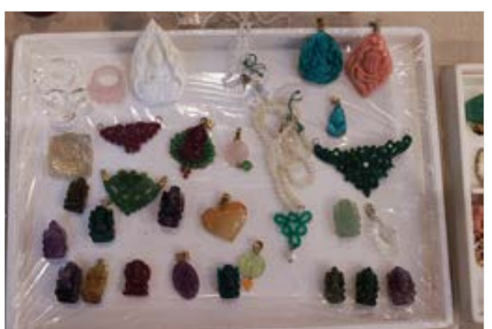
Customised pendants kept for sale.