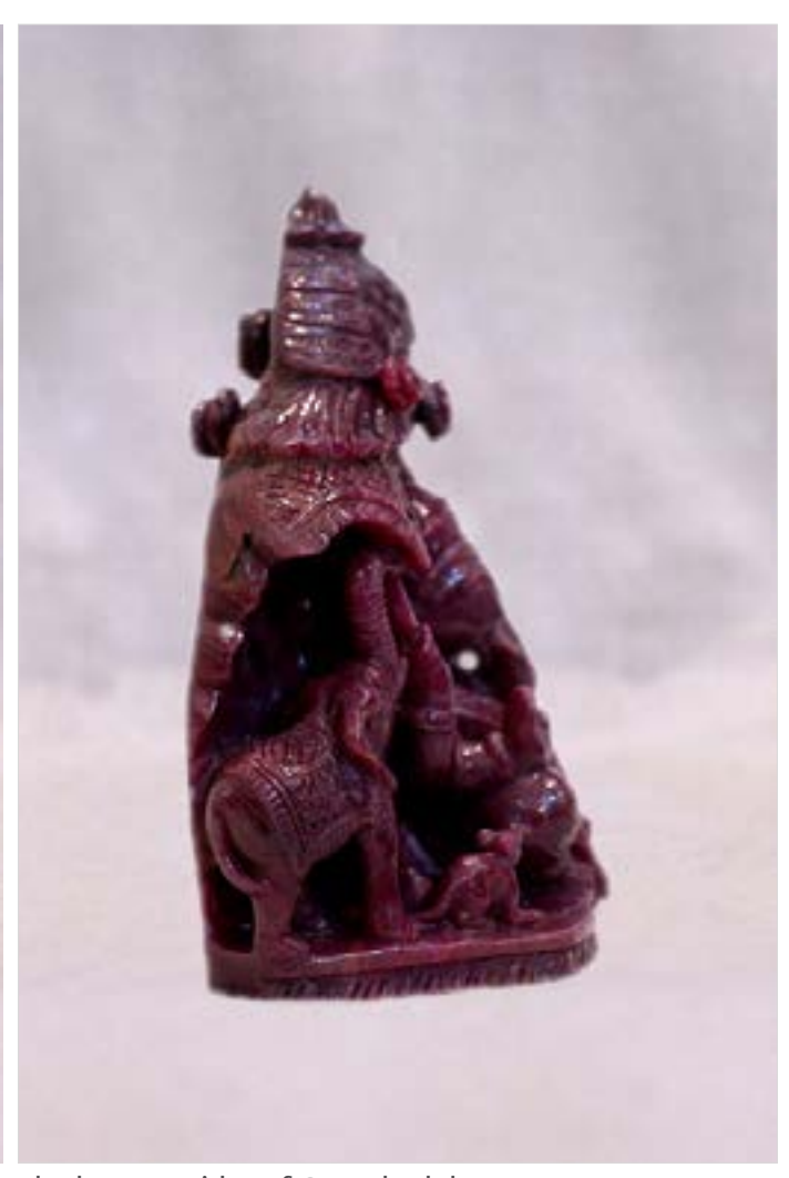
Elephant on sides of Ganesh Idol.