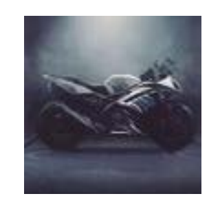
Design Evolution of Yamaha YZF R - 15