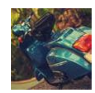
Design Evolution of Bajaj Chetak