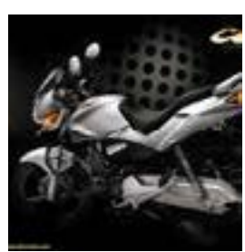
Design Evolution of Hero Honda CBZ