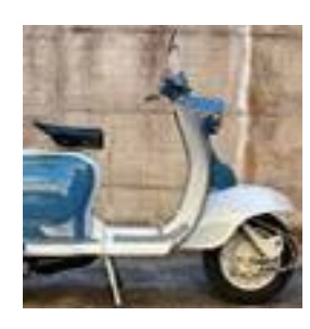
Design Evolution of API Lambretta