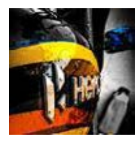
Design Evolution of Hero Honda Splendor