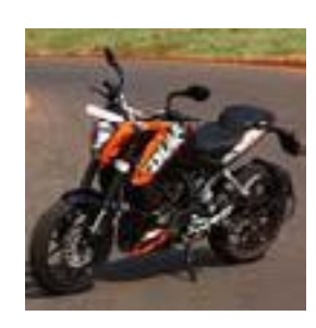
Design Evolution of KTM Duke in India