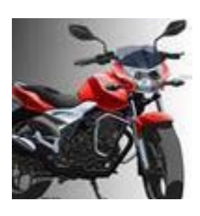
Design Evolution of Bajaj Discover