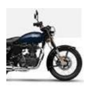
Design Evolution of Royal Enfield Bullet