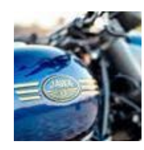
Design Evolution of Jawa Motorcycles in India