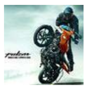
Design Evolution of Bajaj Pulsar