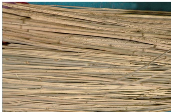
The bamboo sticks are dried to make them tough.