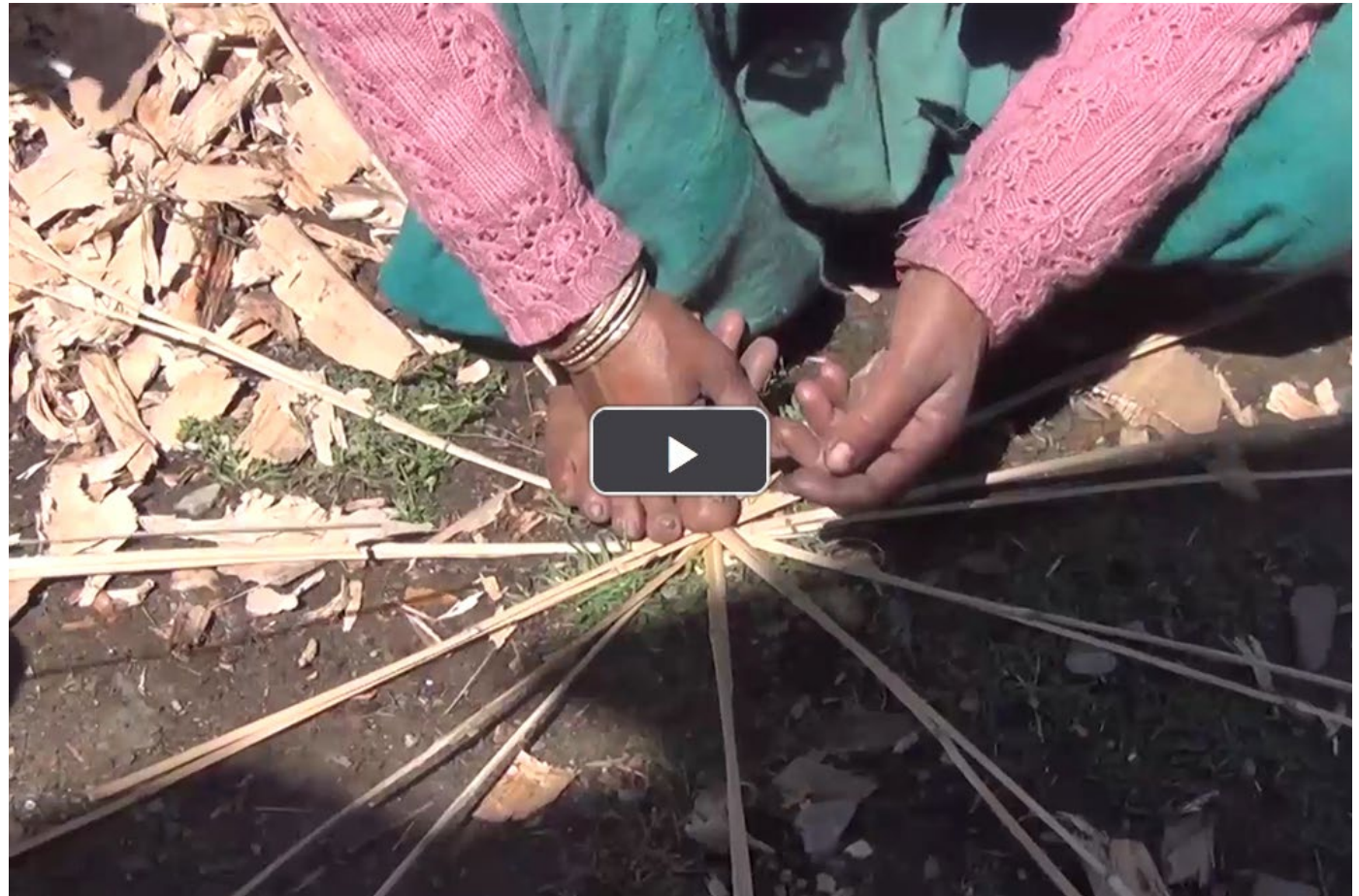
Kilta Making - Himachal Pradesh