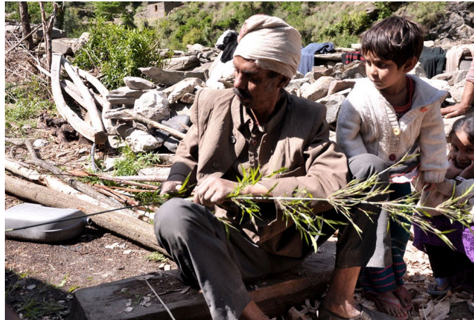
Nargal is a local species of bamboo.