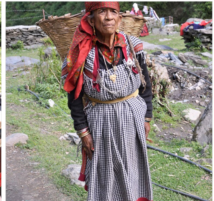
An old lady carrying Kilta basket.