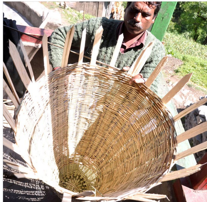
A cone-shaped basket made of a local species of bamboo called Nargal.