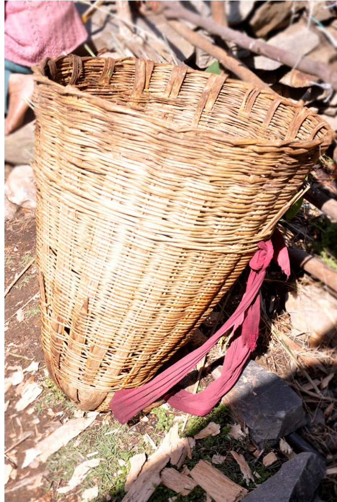
A finished bamboo basket is used for many purposes.

Kilta baskets are a part of the daily lives of the people of Himachal Pradesh. These are used since ancient times. These baskets are being approximately three feet in height and can be made in a day or two. The price of the Kilta ranges between INR100 to INR250.