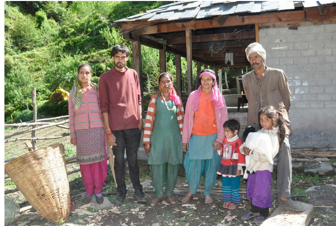
Kilta making artisan and his family.

https://www.dsource.in/resource/making-kilta-himachal-pradesh/introduction