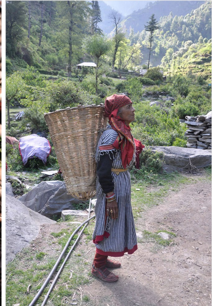
Kilta is usually made in different sizes as per the requirement.