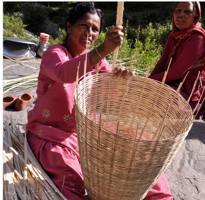
Artisan building the walls of the basket or Kilta which gives strength to the Kilta.