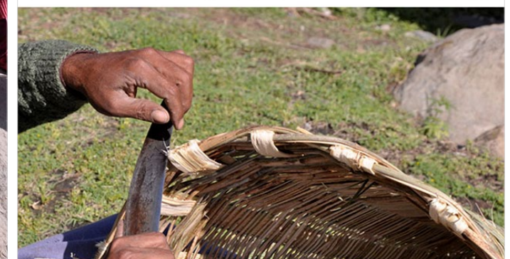
The edges of the sticks are folded and given a finishing look.