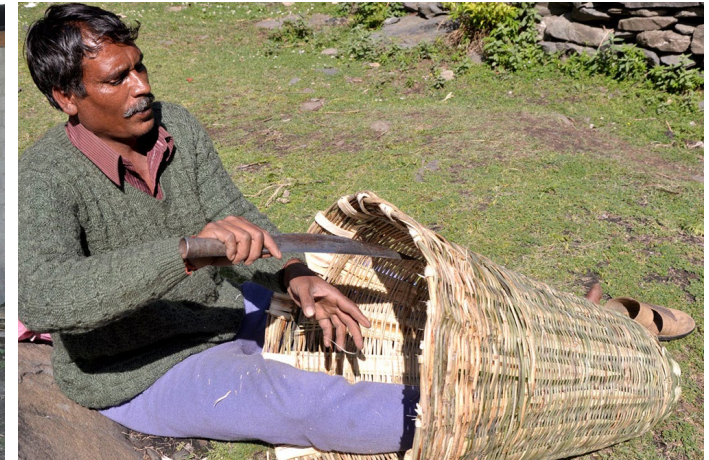
Kilta is generally used to carry farming things.