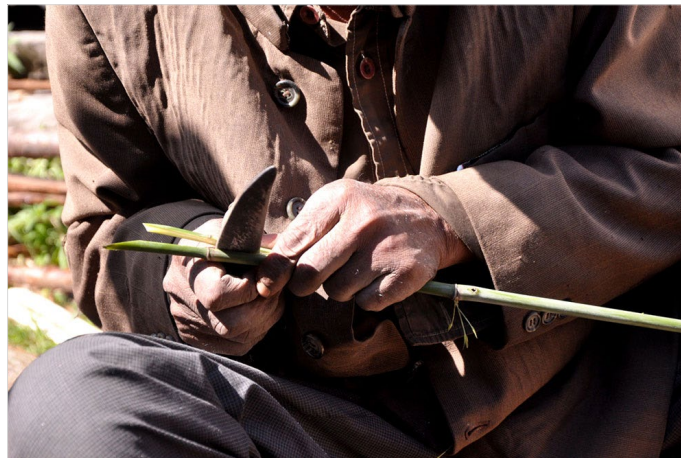
The bamboo strips are cut into strips for Kilta making.