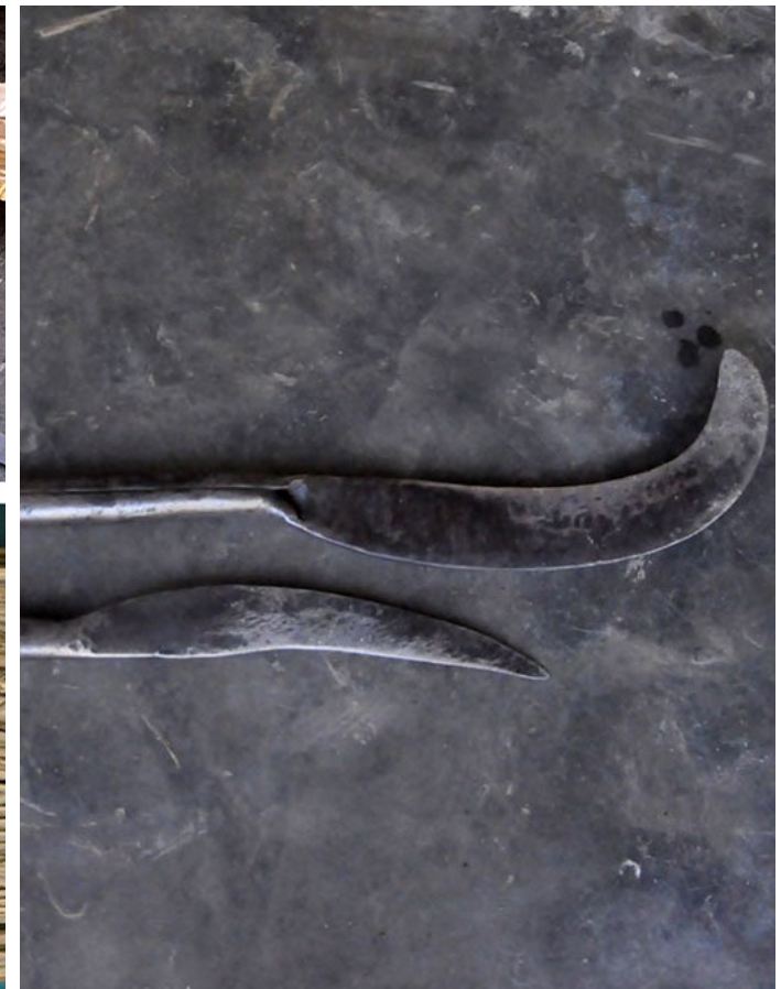
Sickle and Knife are used for cutting and splitting the bamboo.