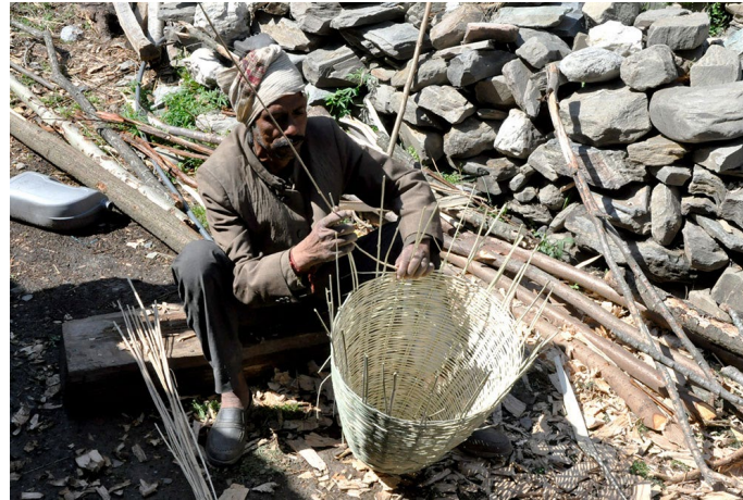
Two varieties of grass are used in the local basketry, the thick Toong, and the thin Nargal.

https://www.dsource.in/resource/making-kilta-himachal-pradesh/making-process