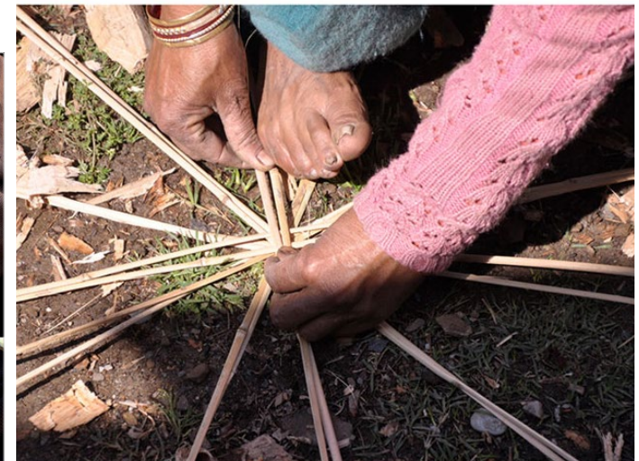
The strips are arranged in a circular fashion in order to start weaving.