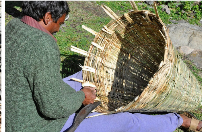
Likewise the sticks are weaved evenly right next to each other making the basket firm.