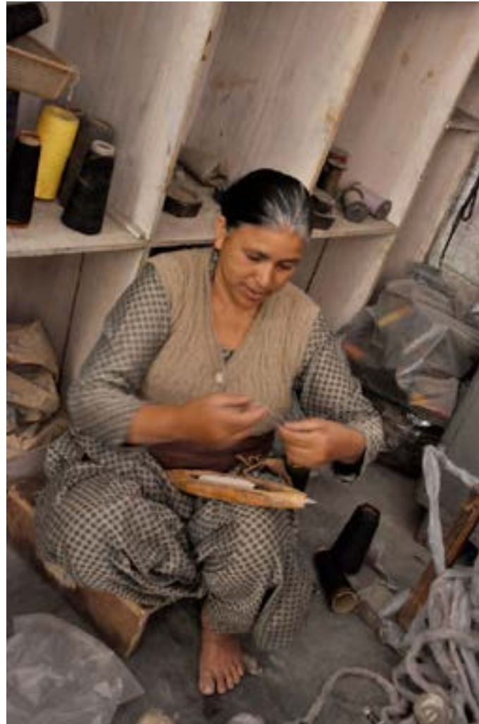
Artisan inserting the spindle to fly-shuttle.