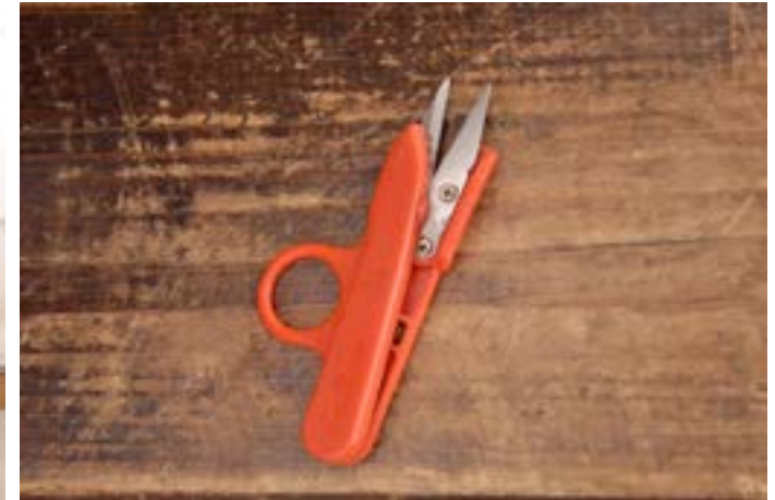
Special kind of scissor is used for cutting the yarn in various process of weaving.