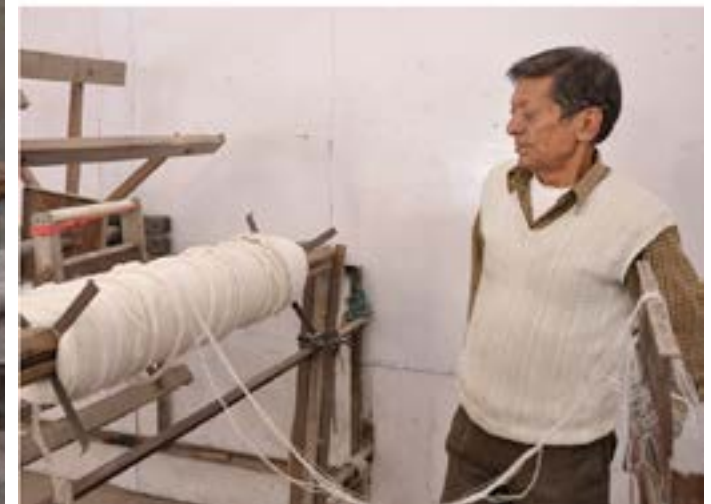
The warped yarn is rolled over the handloom beam for weaving.