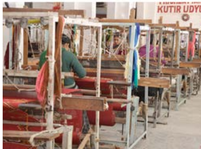
Woman Society of Trishla shawl factory at Kullu.