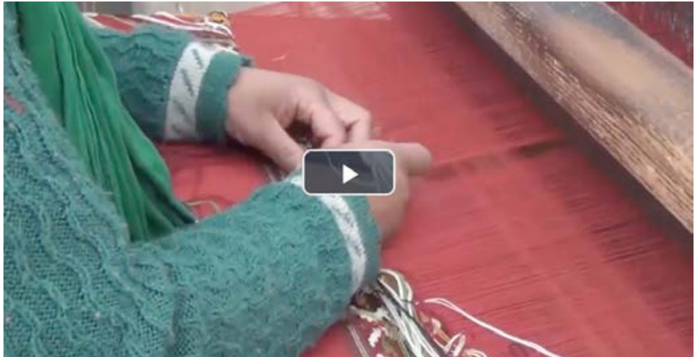
Kullu Shawls - Himachal Pradesh