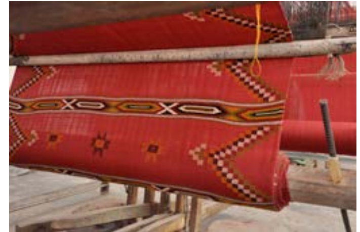
The woven shawl is wound automatically on the beam of the handloom.