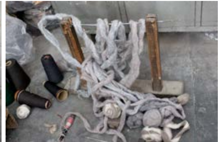
Different colours of threads are used for the weaving process.