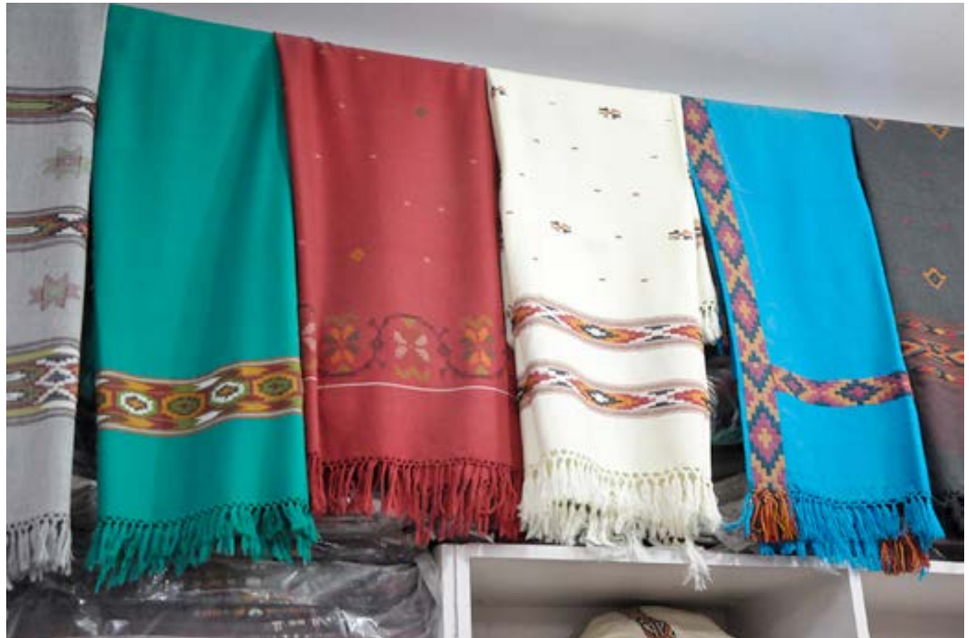
Kullu shawl is known for its intricate designs with bright colors.