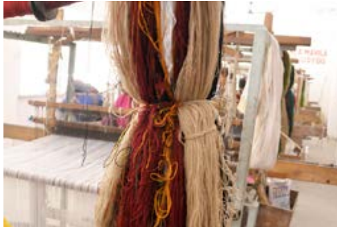
Wool is the primary raw material for making kullu shawl.