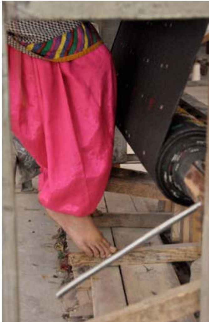
Artisan use pedals to pull the heddle frame up and down.