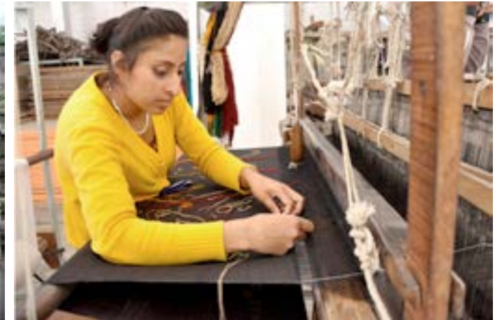
Female artisans involved in the weaving process.