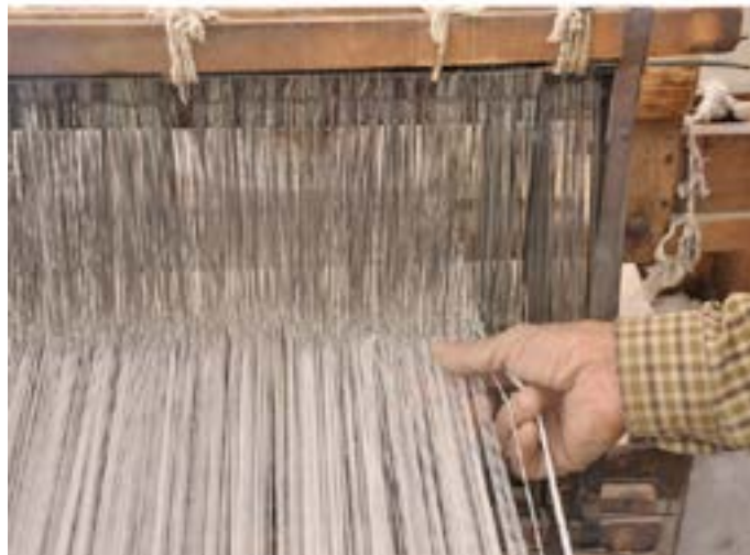
Artisan involved in the weaving process.