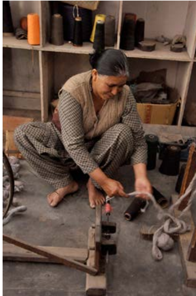
The yarn is extracted from raw wool.