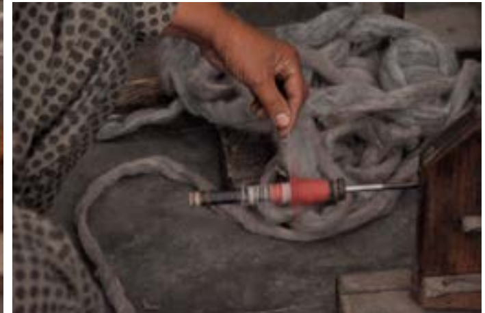
Artisan rolling woolen threads over spindles from yarns.