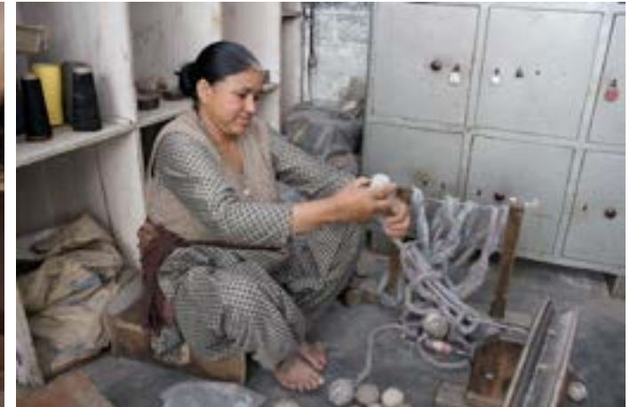
Extracted yarn is wound in to a bundle.