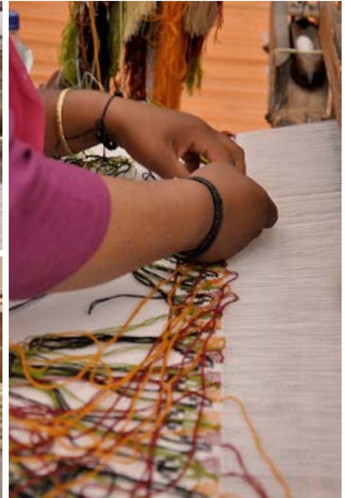
The embroidery design on the shawl is made by hand with different coloured yarn.