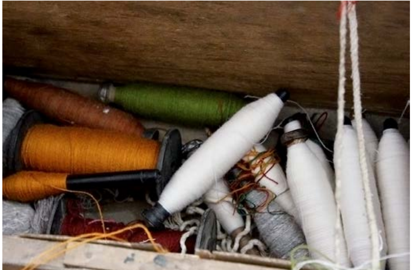
Spindles ready for use.