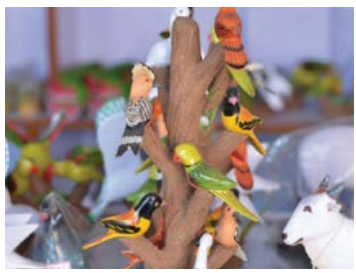
Colorful birds on a tree.