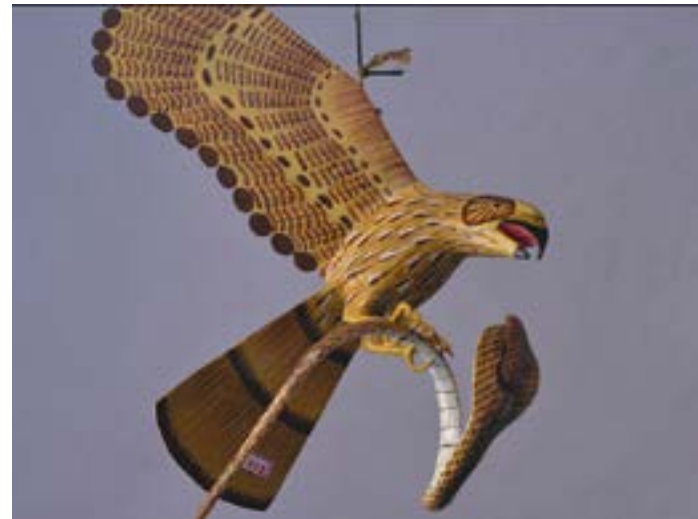
Eagle catching the snake.