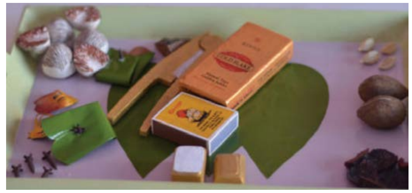
Tray containing mouth freshener items.