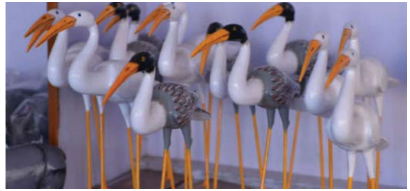
Group of wooden birds.