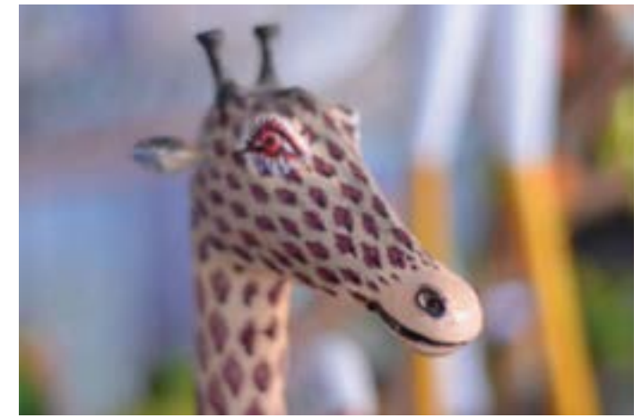
Wooden toy of Giraffe.