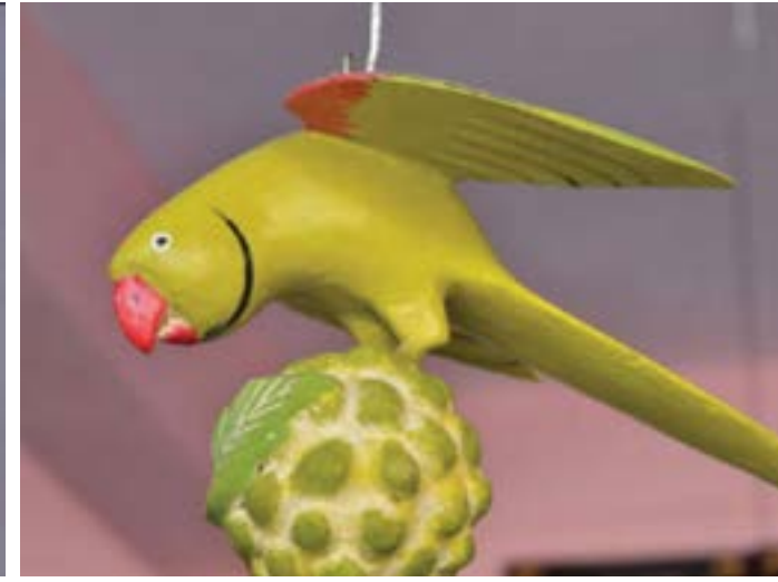
Hanging wooden Parrot.