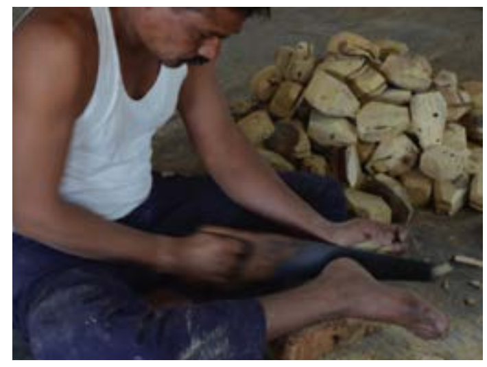
Making skeleton parts.