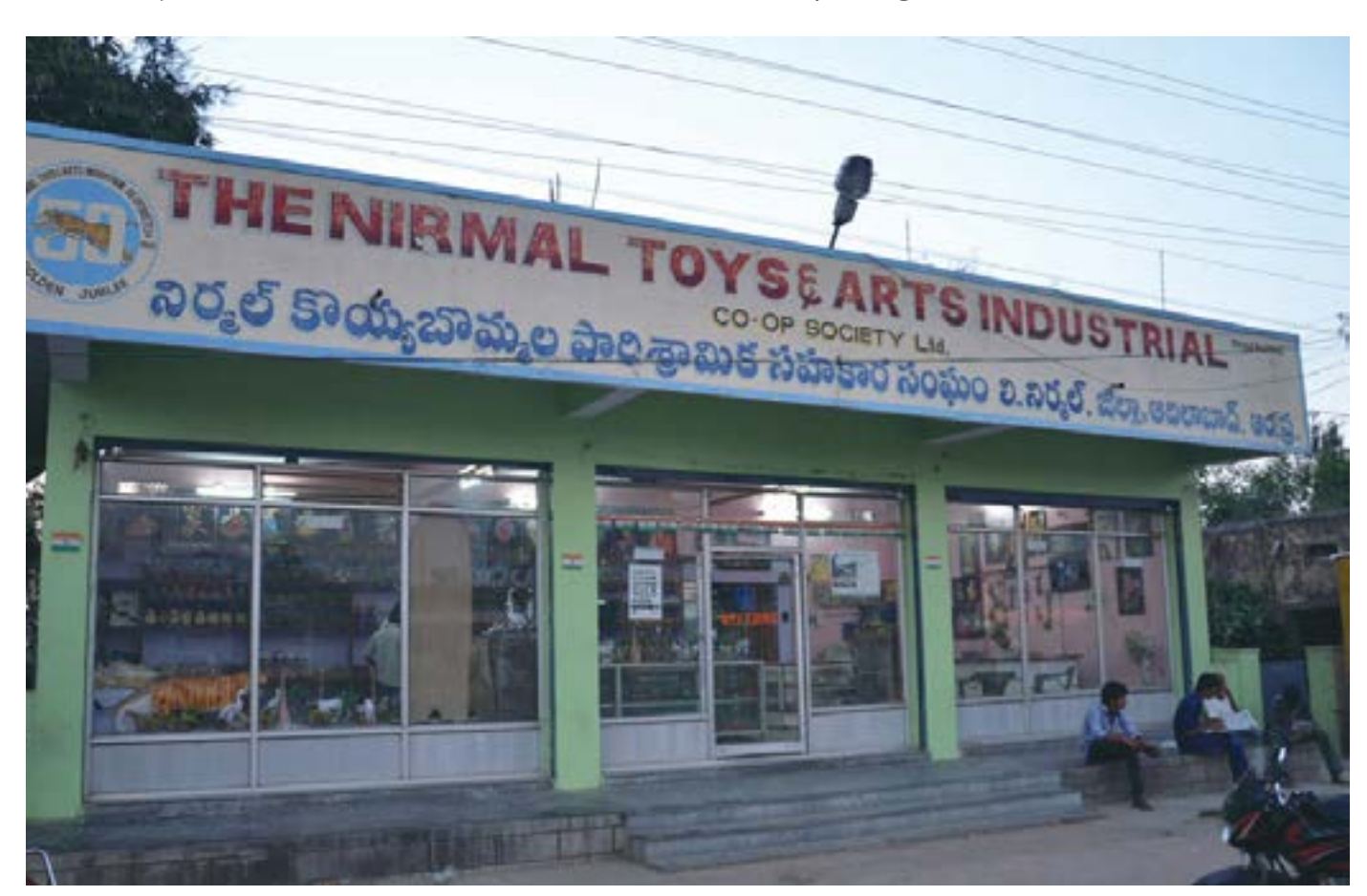
Nirmal Toys & Arts Industrial Co-operative Society Ltd.

The 'Nirmal Industry' has been growing ever since its inception in 1951 in Hyderabad. It has developed Nirmal paintings and handicrafts that command the international market. Nirmal Toys Industrial Cooperative Society is situated on National Highway # 7, which was established in 1955 housing 60 artisans in the main toy-making unit while the Hyderabad branch manufactures furniture and miniature paintings.