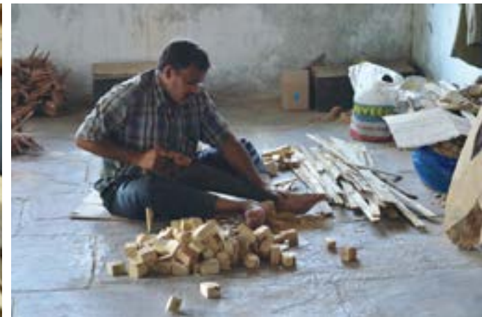
Craftsman at work.