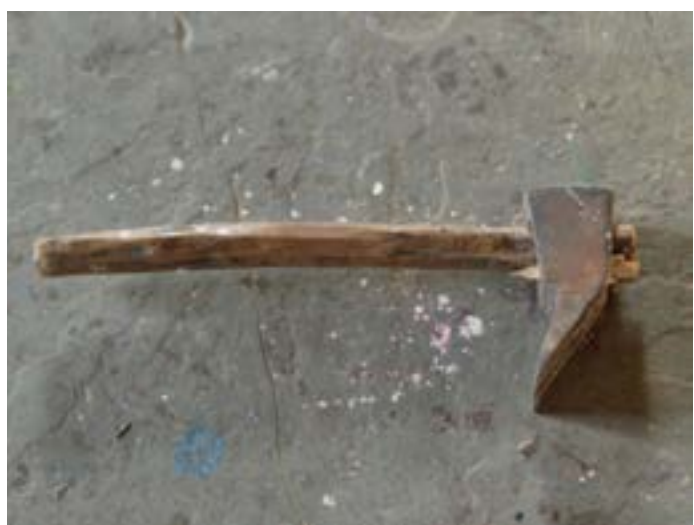
Bharsha (wood scalping).