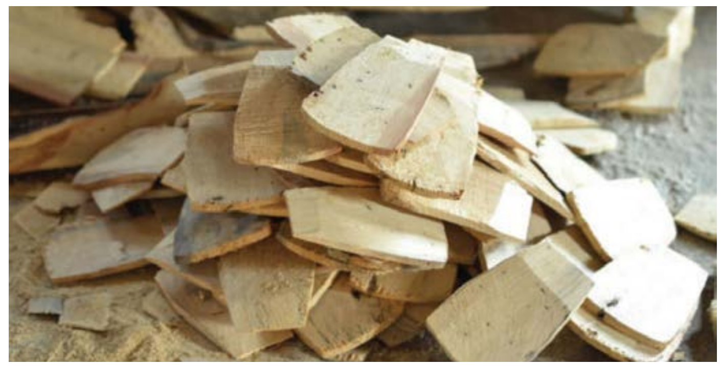
Ponki Chekka wood pieces.