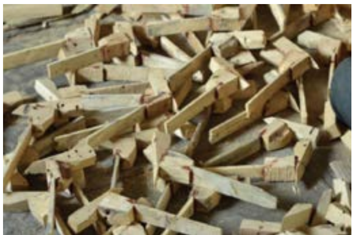
Fixing the skeleton parts.