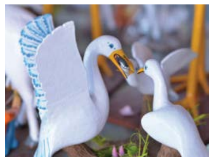
Pigeon feeding its baby.