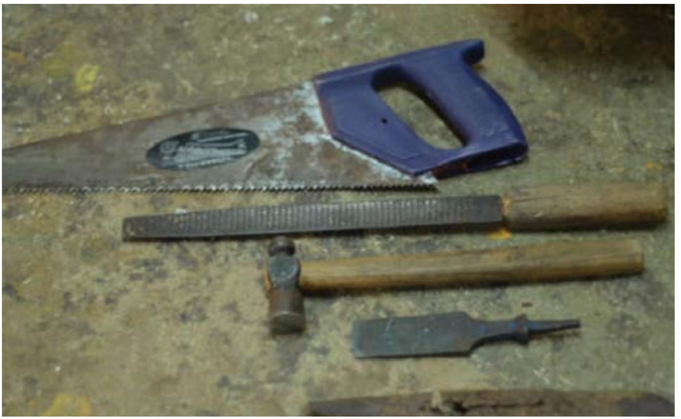
Saw and carving tools.