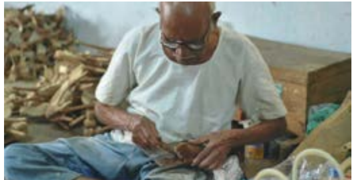
Finishing the toy.