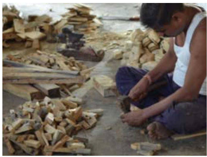
Cutting the wood in various shapes.