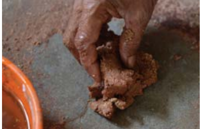
Making Chinta Lappam.