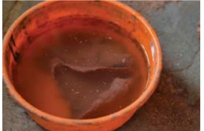
Dry Tamarind Seed Pulp with water.