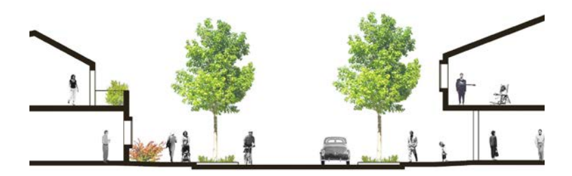
Figure 12: Amphibious Living vision: a section of the road with storm water directly recycled in the street (author's drawing).

The British journalist Anna Minton states that "smaller interventions, on a more human scale, which are based on a wider set of values than the single-minded ideology of increasing property prices, are more likely to bring with them a more diverse and public spirited culture, which is in tune with local people and create more successful places as a result" (Minton, 2009: 198). The architect Nabeel Hamdi, winner of the UN-Habitat Scroll of Honour for his work on Community Action Planning in 1997, states that good planning enhances connections, "it builds on what we've got and with it goes to scale" (Hamdi 2006: xviii), it creates opportunities for change, it facilitates emergence: "the ability to organize and become sophisticated, to move from one kind of order to another higher level of order" (ibid.: xvii). It means allowing the beginning of lots of small autonomous projects, but also their coordination into a vision a "common sense of shared purpose" (Layard, 2005: 234) that is at the foundation of each society. Architecture, the art to build cities, must relate with the geography, history and the people of the place, it must work with an economic plan on improving local entrepreneurship, nourish place economies, and develop knowledge, skills, and creativity. Redrawing the rules that produce the space in our city means redrawing ourselves, this is the constant and continuous process at the base of the city making.