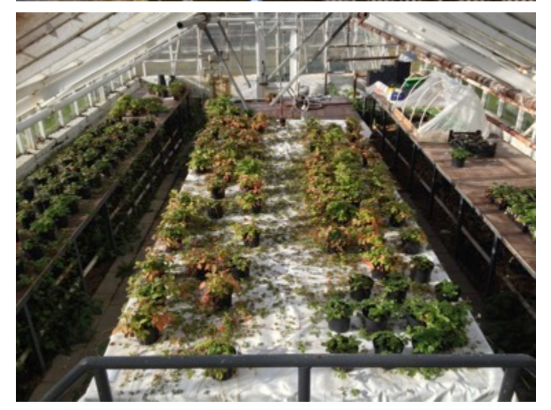
Figure 6. The town of Hveragerði main assetts