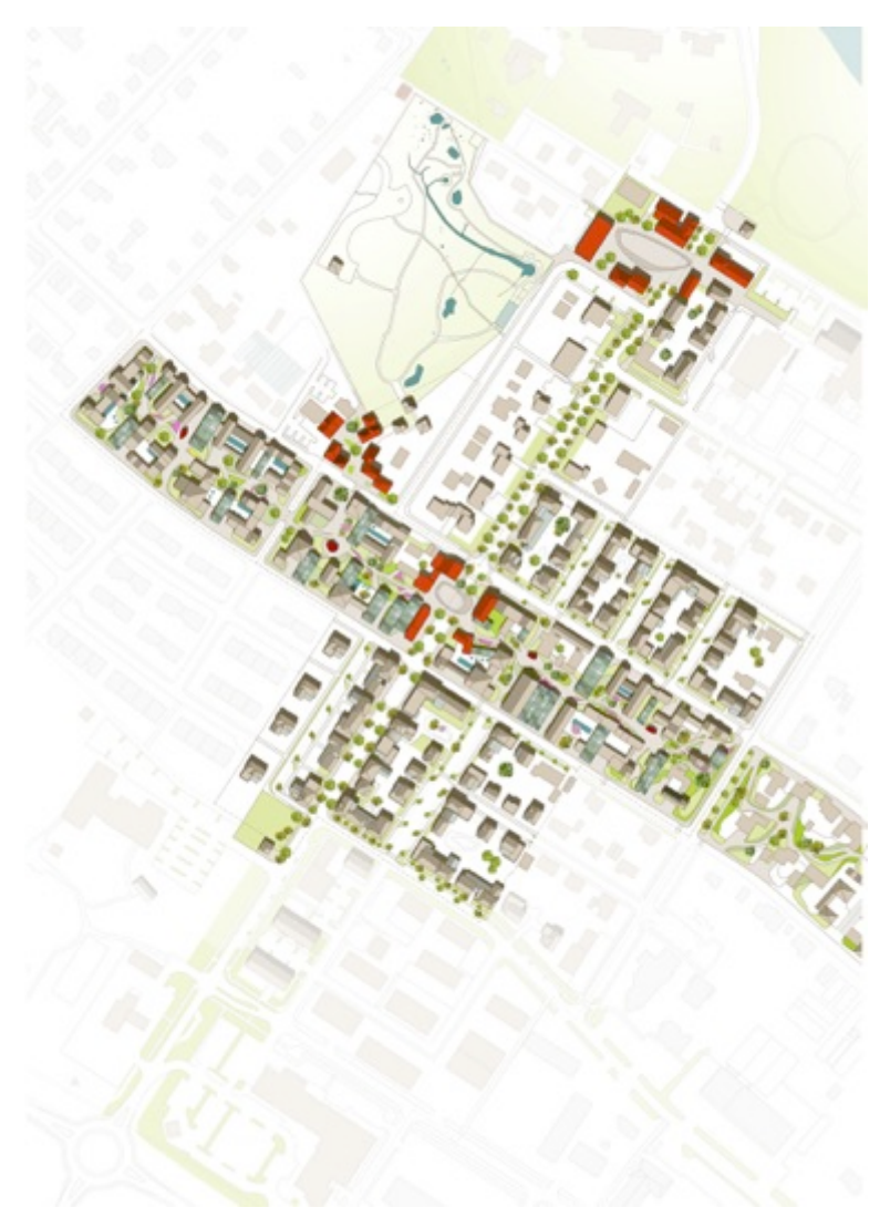
Figure 10. Amphibious Living vision: the centre of Hveragerði (author's drawing).

The core of Hveragerði is imagined to be built up gradually with a series of small-scale independent initiatives started by its own residents or small external investors. Amphibious Living supports the small-scale aspect of the development as fundamental for the success of project.