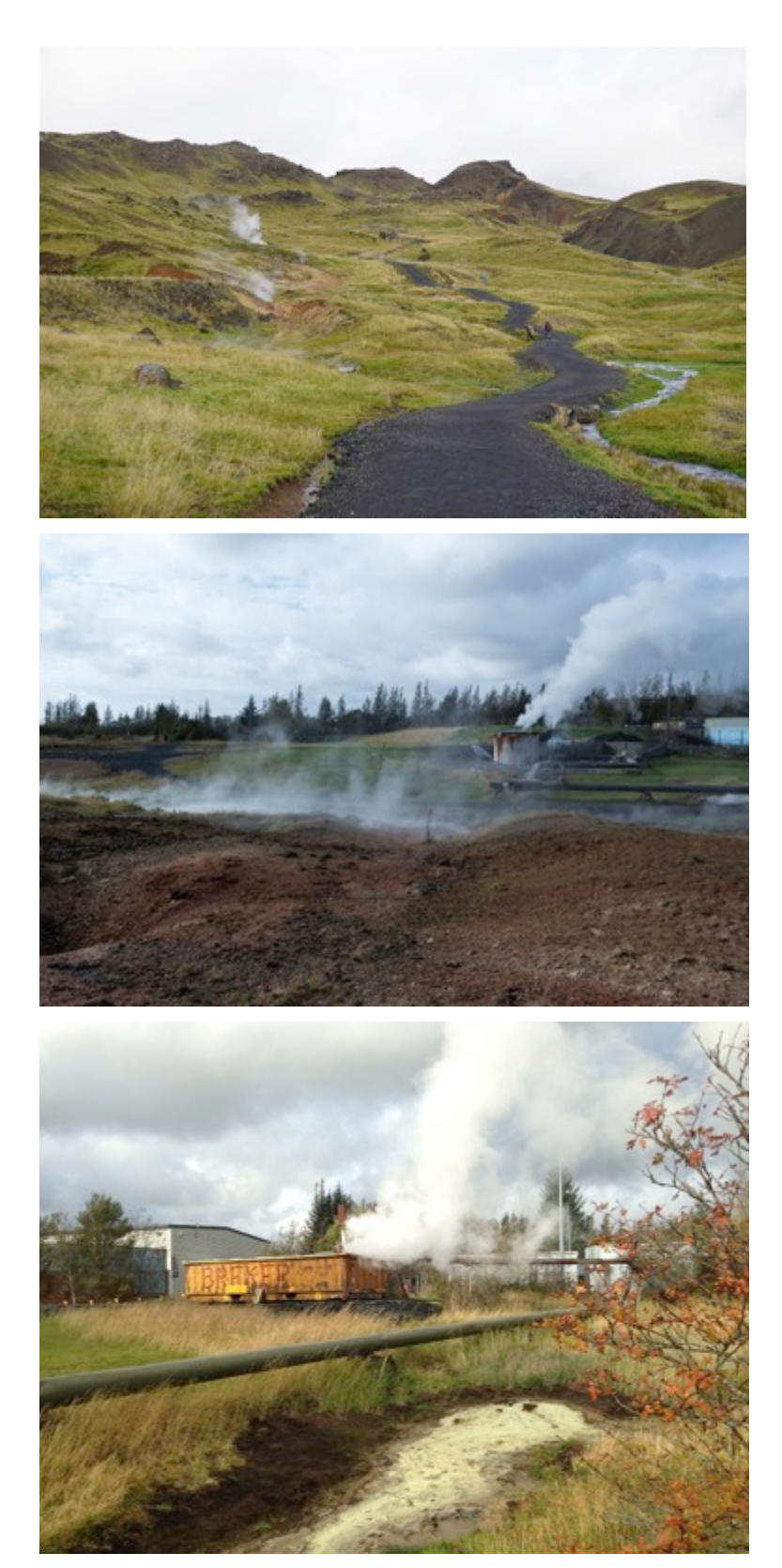
Figure 2. Geothermal water in Hveragerði