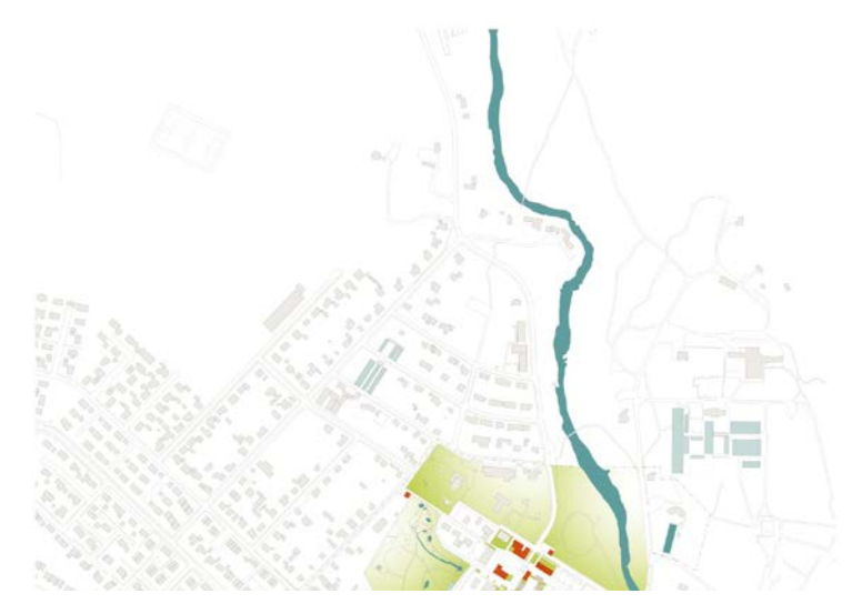
Figure 9. The green strip as an active ground for small and diverse activities (author's drawing).