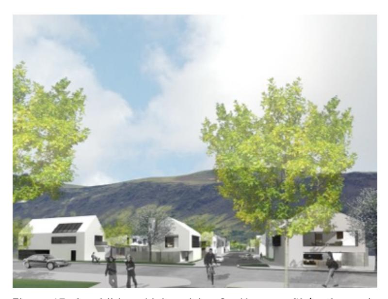
Figure 17: Amphibious Living vision for Hveragerði (author's drawing).

The American anthropologist Janice Perlman says: "We may have come this far through competition and survival of the fittest, but if we are to make the leap to a sustainable world for the centuries ahead, we will need to be intelligent enough to do it through collaboration and inclusion" (Perlman, 2007: 190)