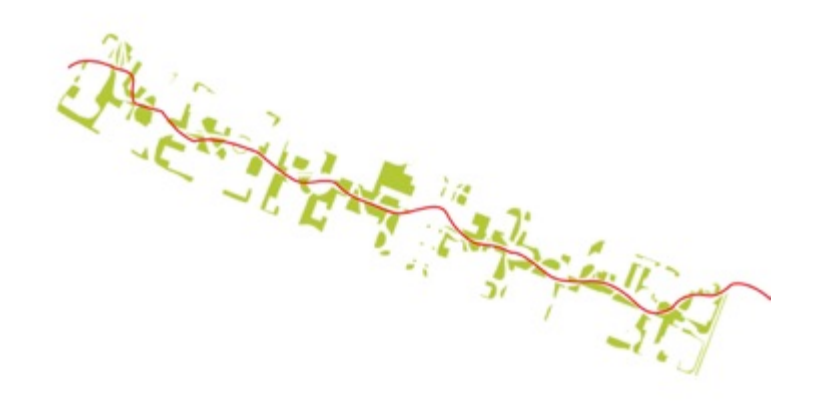
Figure 13: Amphibious Living vision: The Green Strip (author's drawing).