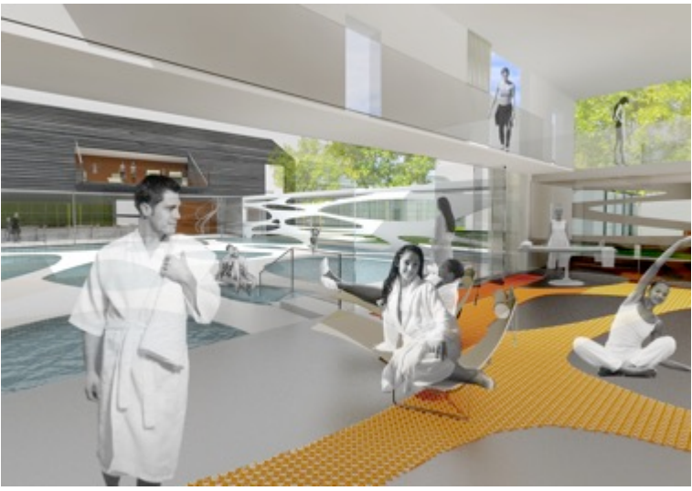
Figure 16: Amphibious Living vision: spas and well-being in Hveragerði (author's drawings).