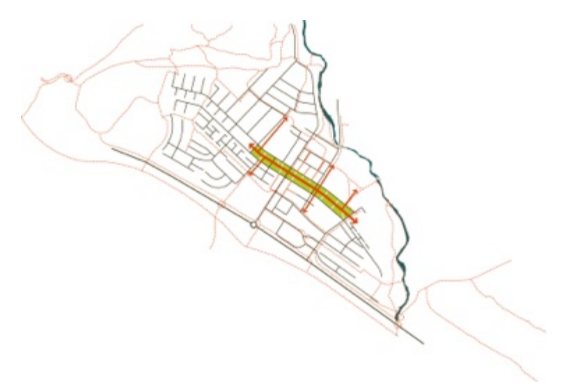
Figure 8. Amphibious Living vision: the green strip reconnects the scattered parts of the town (author's drawing).

In the Amphibious Living scheme the public space is at the center of the design and it is celebrated by the small and diverse activities that develop along it. These activities are located in the old abandoned greenhouses forming a strip of approximately 800 long and 100 meters.