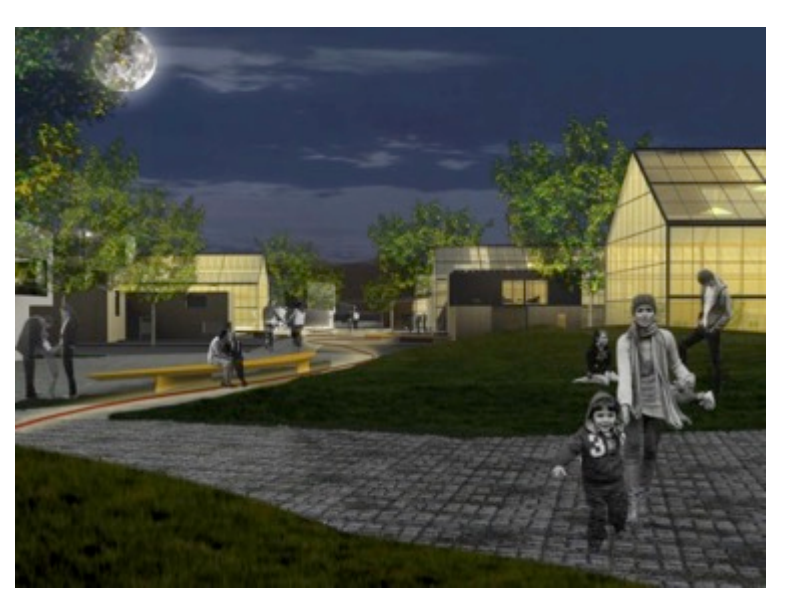
Figure 14: Amphibious Living vision: Hveragerði public space along the Green Strip (author's drawing).