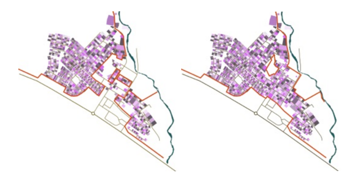
Figure 7. Amphibious Living vision: mapping of activities (what kind of activities?) in purple scale: left as it is today, right as it is envisioned. It is evident that the centre of Hveragerði is emptied by any activities (author's drawings).

In the Amphibious Living scheme the public space is at the center of the design and it is celebrated by the small and diverse activities that develop along it. These activities are located in the old abandoned greenhouses forming a strip of approximately 800 long and 100 meters.