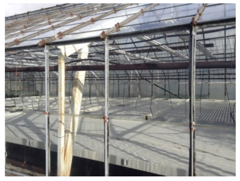
Figure 4. Abandoned greenhouses in the centre of Hveragerði