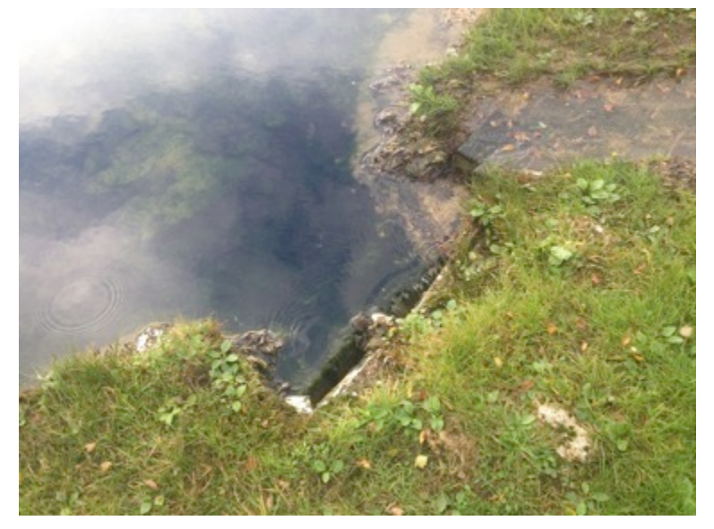
Figure 5. The town of Hveragerði