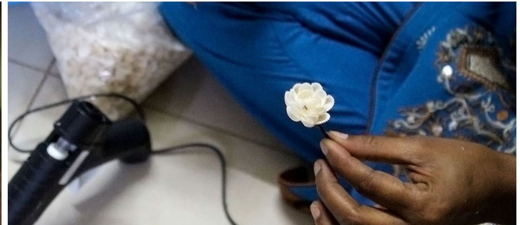
The hairpin is decorated using small shells.