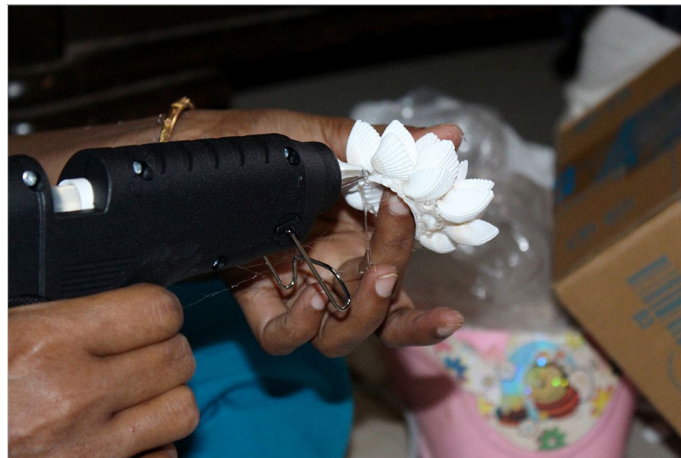
Continue with the next layer of shells circularly.