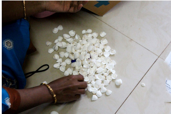
Artisan selecting the seashells to start the process of making a seashell bouquet.