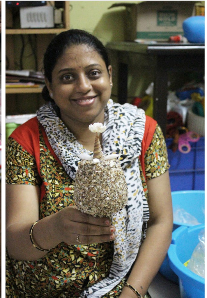
Artisan showing the shell art product.