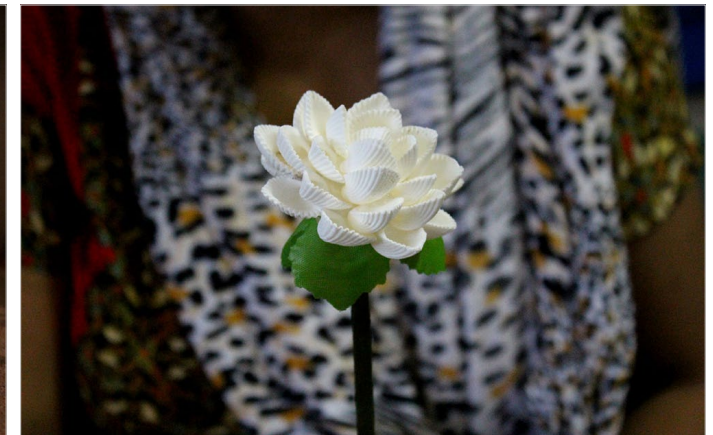
Creatively finished seashell flower.