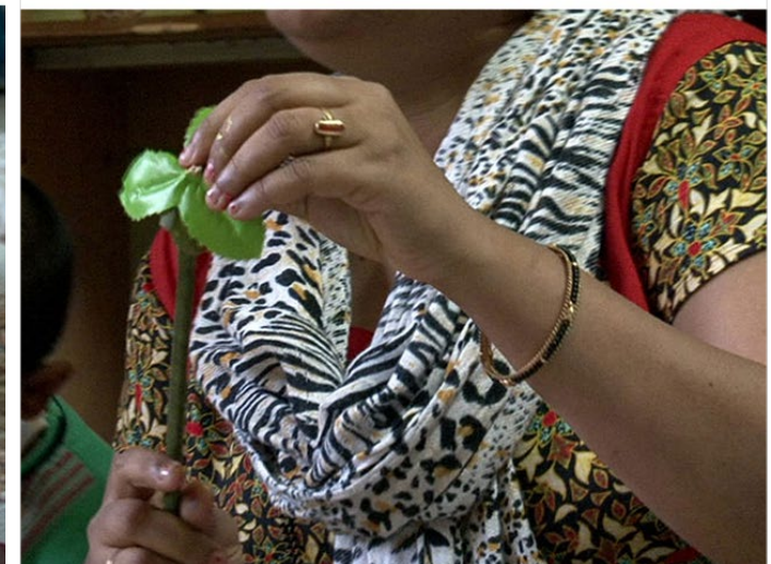
The flowers are coloured using acrylic colours.