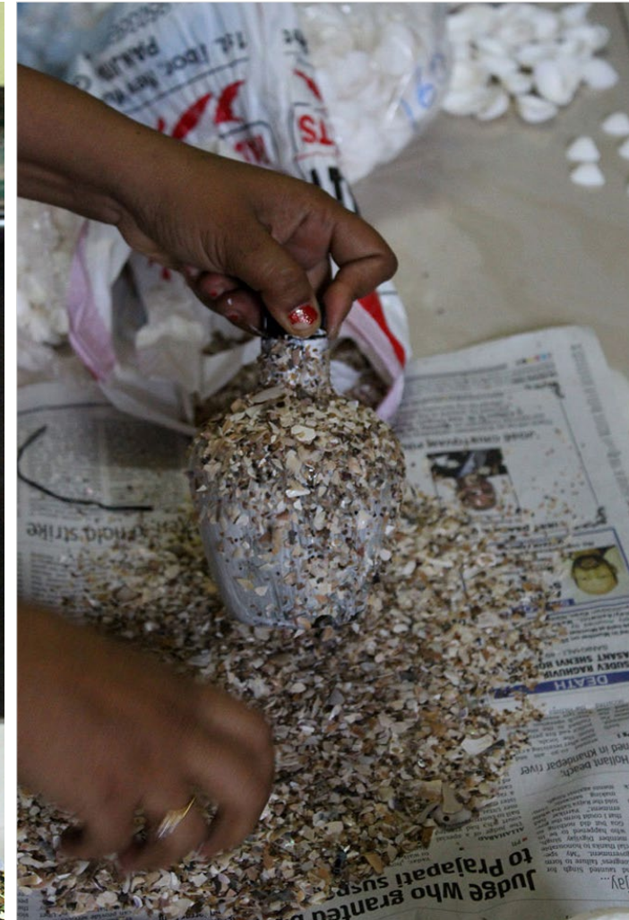
Shell pieces are pasted all over the pot.