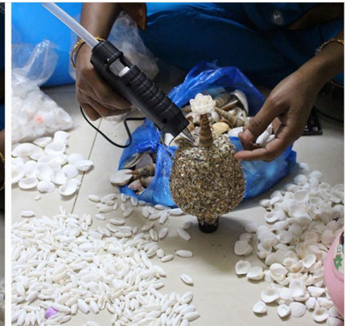
Various types of shells are used to decorate the jar.