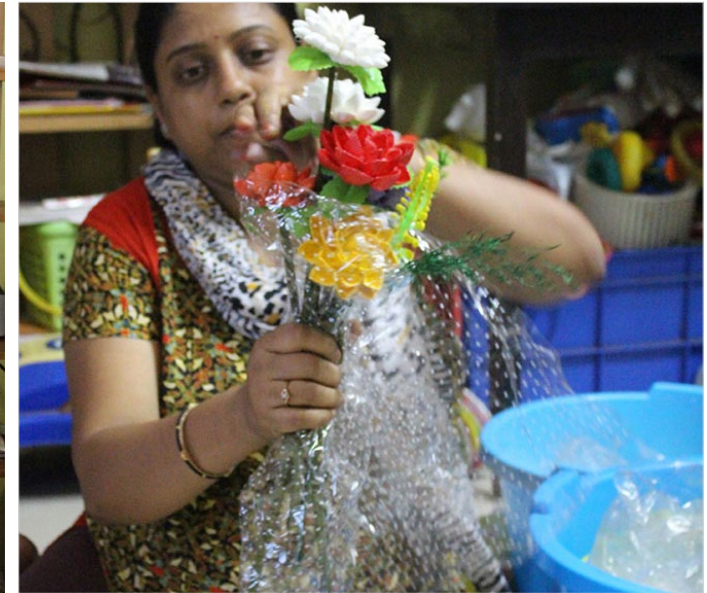
Artisan wrapping the seashell flower bouquet.