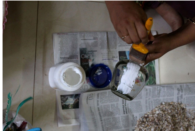
An adhesive is applied all over the transparent glass jar.

https://dsource.in/resource/seashell-art-goa/making-process