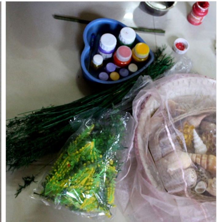
Shells, artifice leaf, acrylic colours are the raw materials for making crafts.