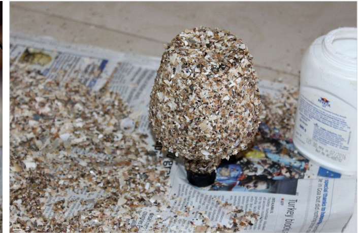
The jar is allowed to dry.