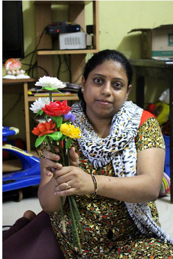
A bunch of colourful seashell flowers.