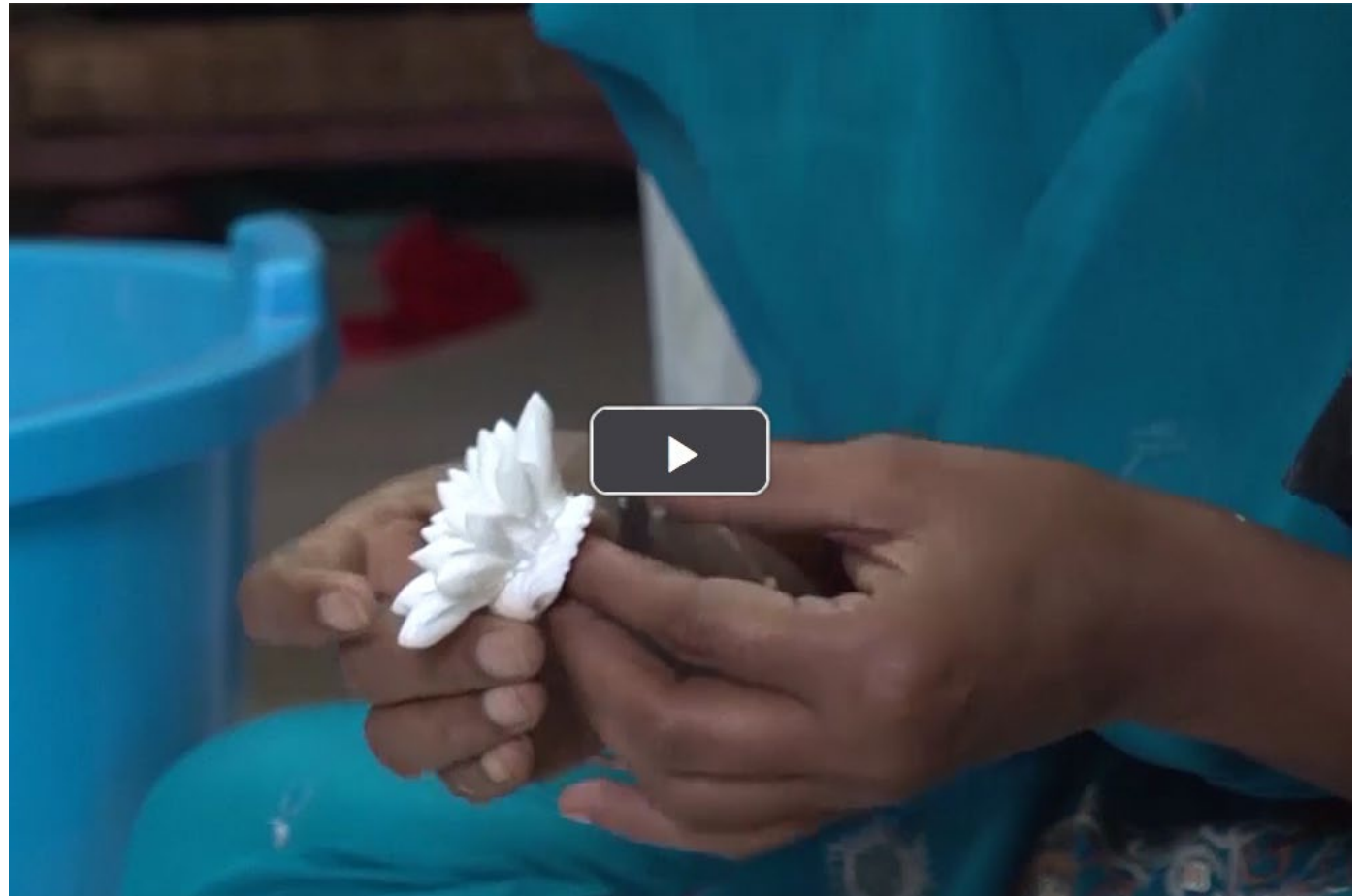
Seashell Art - Goa