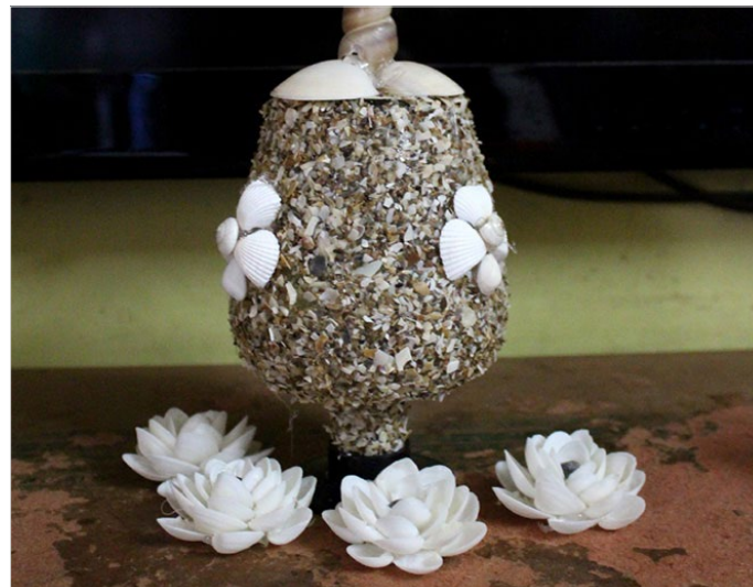
A decorative showpiece made using different shapes and sizes of seashells.