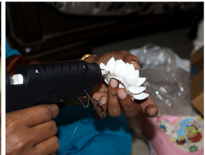
The artisan is applying the glue for getting flower shape.