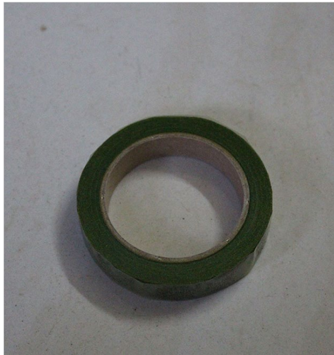
Insulation tape is used for joining purposes.