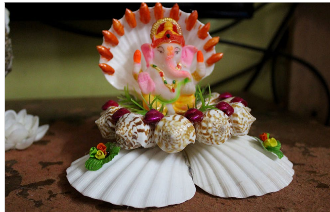
A seashell product of Lord Ganesh.