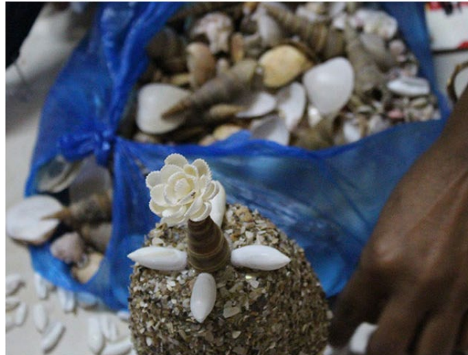
Detailed decoration is done once the seashell sets and dries.