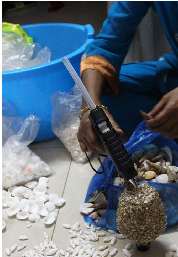
Glue Gun is used to fix the decorative objects.