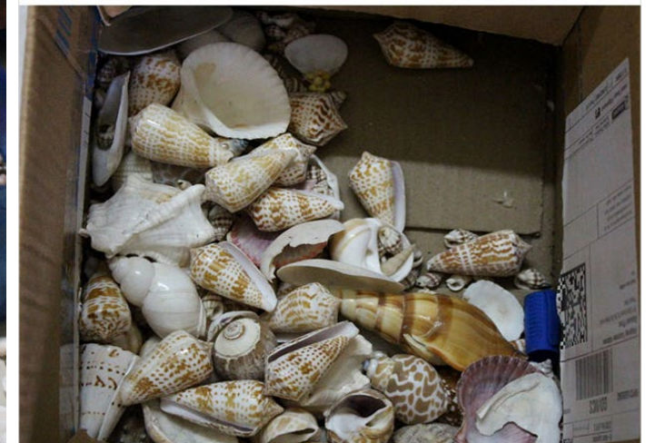
Seashell meal powder is used to decorate the glass bottle.