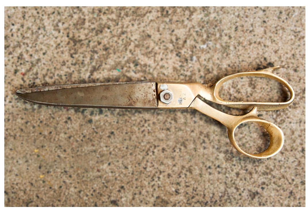
Scissor is used for cutting the cloth, extra threads and lace.