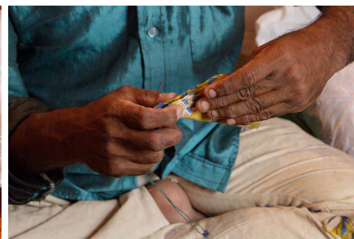
The cloth is been folded in equal length.