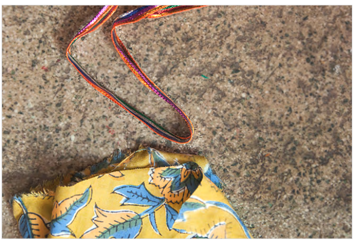
Cloth is used for making the toy and the lace is used for This particular colored thread is used for stitching the decorating.