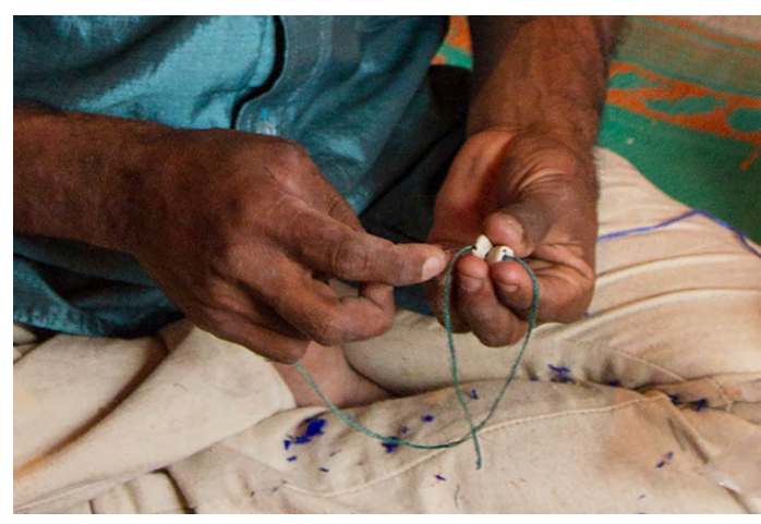
Artisan inserts the cowry shells one by one through the Later the beads are inserted one by one. help of needle and thread.