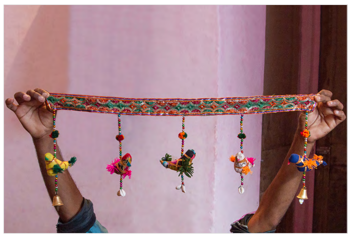
The beautiful door hanging also known as toran, have a special implication as the decorative accessory to attract the goddess of wealth – Lakshmi which is of 3.5 to 4feet in length