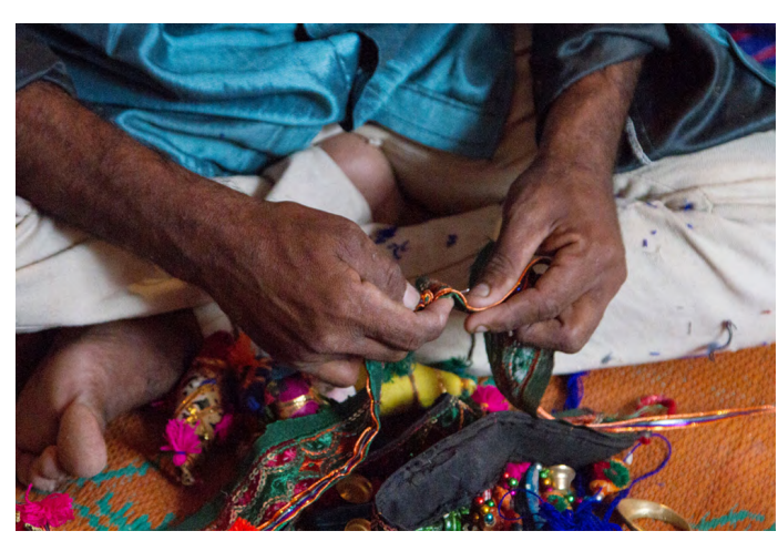
The needle is being pierced inside the embroidered cloth and lace to stitch.