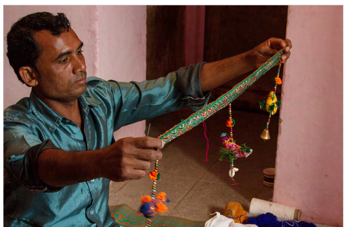
Torans are of different types, most unique types consists embroidery, mirror and beads.