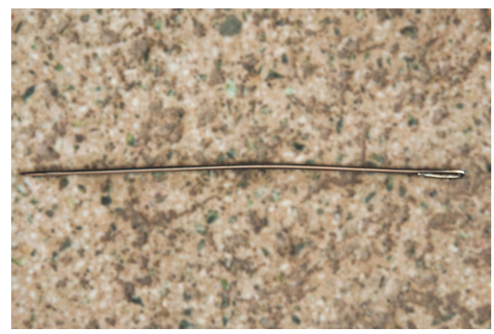
Needle is used in stitching by inserting the thread into