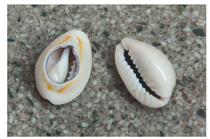
These cowry shells are also used for decorative purpose in the process of toran making.