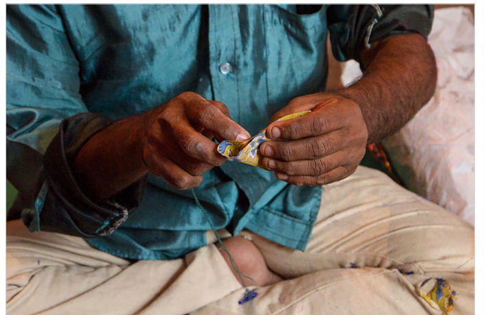
Then the cloth is been stitched.