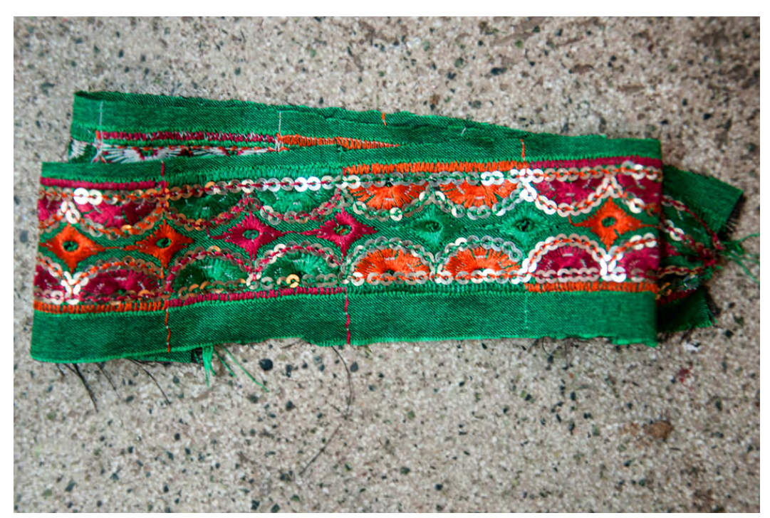
Ready-made attractive cloth piece is used for toran making.