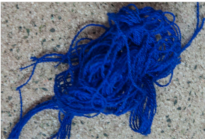
Woolen threads are used in beautifying stuffed dolls which are used to make toran attractive.