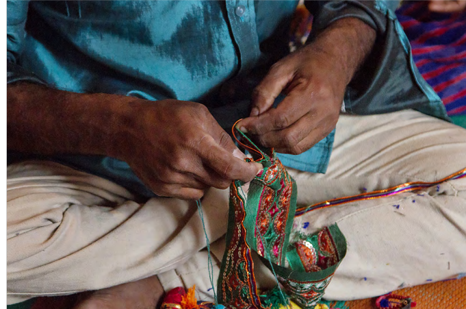
chine for stitching.