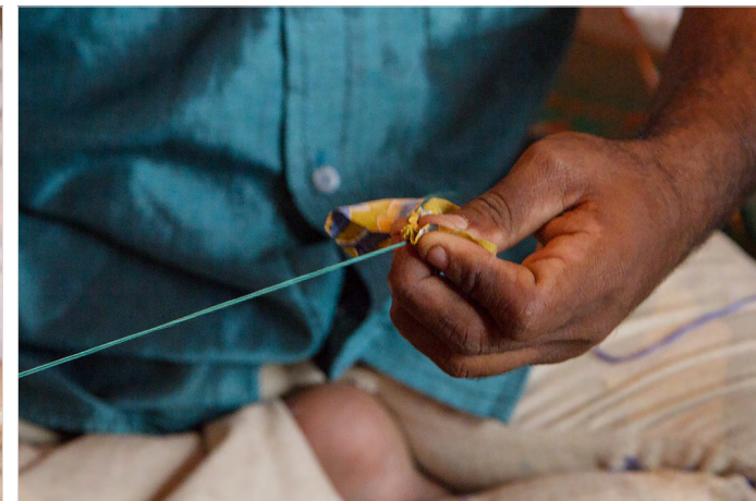
The stitching is been tightly completed.