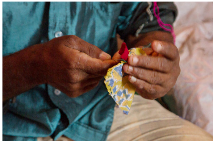
The bright color cloth is been inserted inside the stitched cloth at the place where it is needed.