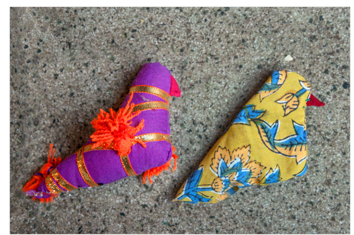
The handmade bloated birds is stitched to use it as a decorative substance in the process of toran making.

Usually the size to be made are referred to the door's length and width for which it has to be made for. Some of the special types of torans are classic woolen toran, cotton toran, crystal and beads toran, satin ribbon toran, tissue toran etc.