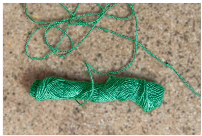
toran to match its color.