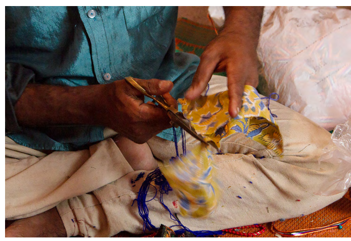
Different cloth is selected and cut according to the measurement needed to bring out the interesting color combinations.