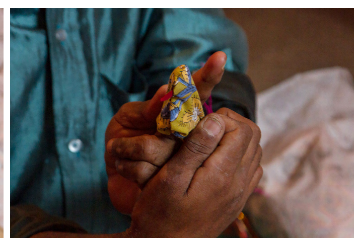
When the cloth is reversed the beautiful bird shaped cloth is been seen.