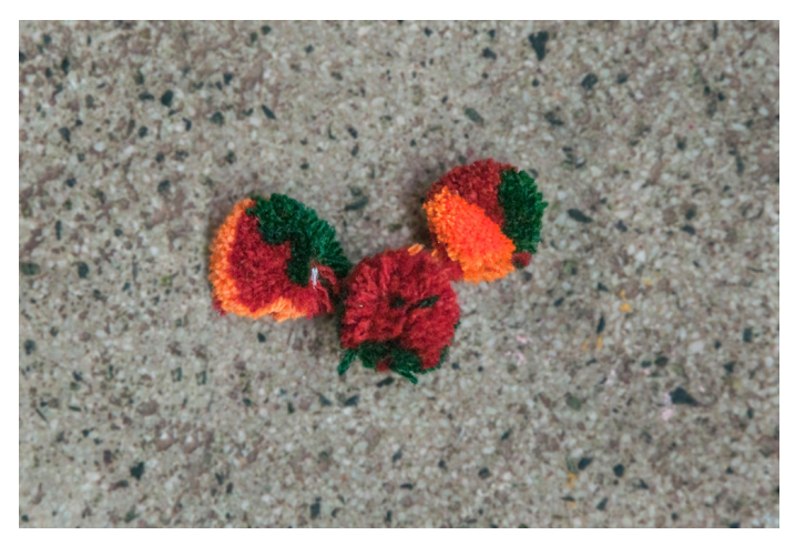
Woolen pom pom baubles are used in toran design as a Beads are used for decorative purpose. decorative substance.