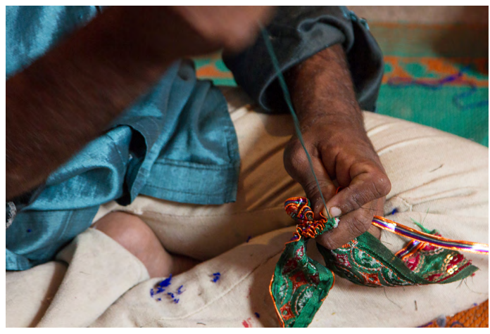
The lace is been stitched tightly at the corners of the embroidered cloth as a border decoration.