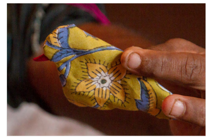
The complete shape of the bird is achieved.