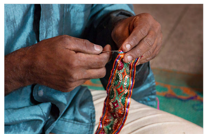
Horizontal elongated decorative design cloth is been stitched at all corners from the lace and knotted firmly at the end.