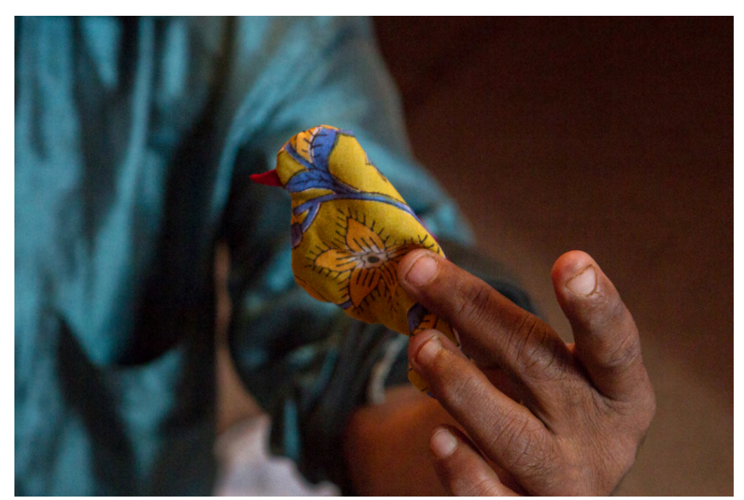
In some toran designs, the fabricated stuffed toys are also included.