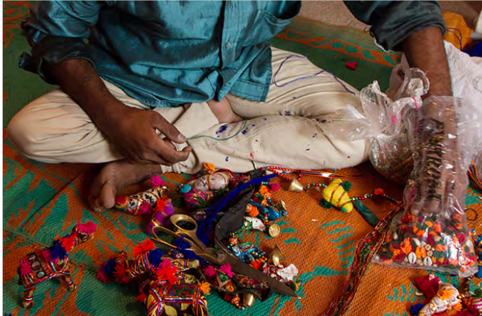
Later the artisan selects the beads and other decorative stuffs according to the design pattern.