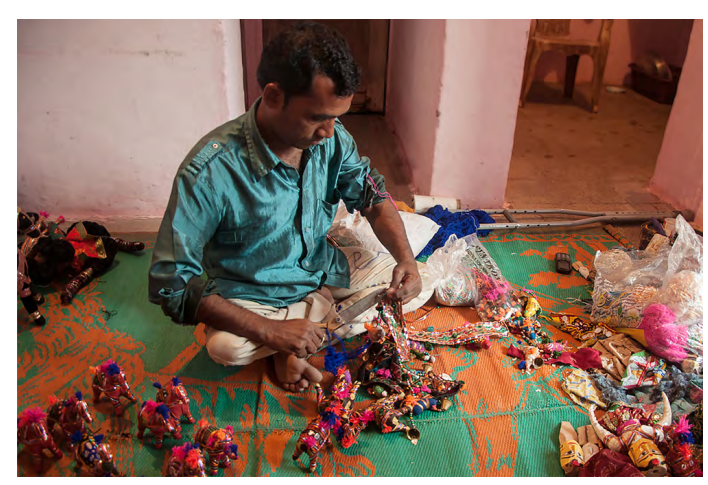
Beautifully crafted torans by the artisan.