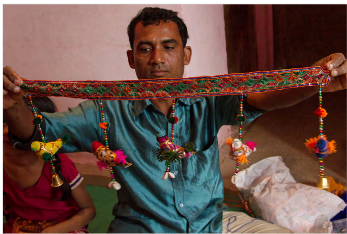
Torans are the decorative cloth hung at the doorway which gives a charming look for the entrance.