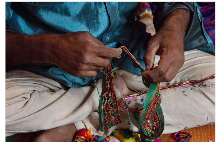
Artisan is stitching the lace to the embroidered cloth to Lace is being stitched in hand itself without using macaptivate the intricate design.

Some of the decorative items are such as parrots, birds, flowers etc. The birds are made with any fabric material taken to be made as bird, is folded to half in a triangle shape and then cut evenly. It is turned inside out, where on the edges the stitches are given throughout and the beak part cut and stitched separately are attached and the whole thing is reversed leaving behind one part open. Through the open part the woolen or stuff material is filled and stitched to give the final finishing. It is further stitched with the woolen yarn to hang it in the required portions. After every items such as shells, beads etc. that are required is stitched, it is stitched with colorful ribbons to give the border effect.