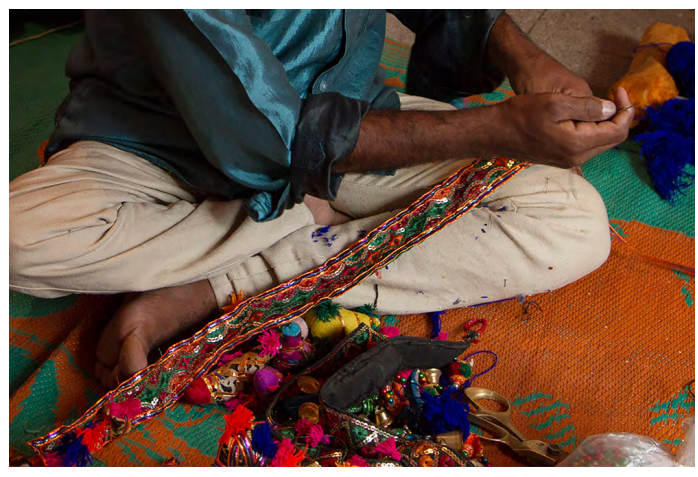
Toran patterns are based on the artist's creativity.