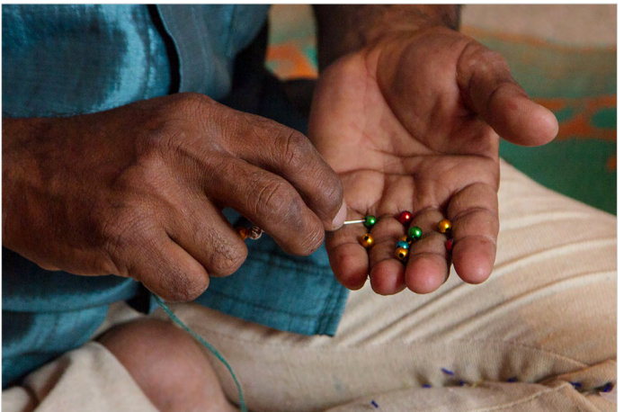
Then the vertically designed hanging is stitched to the horizontally decorative cloth in its corners.