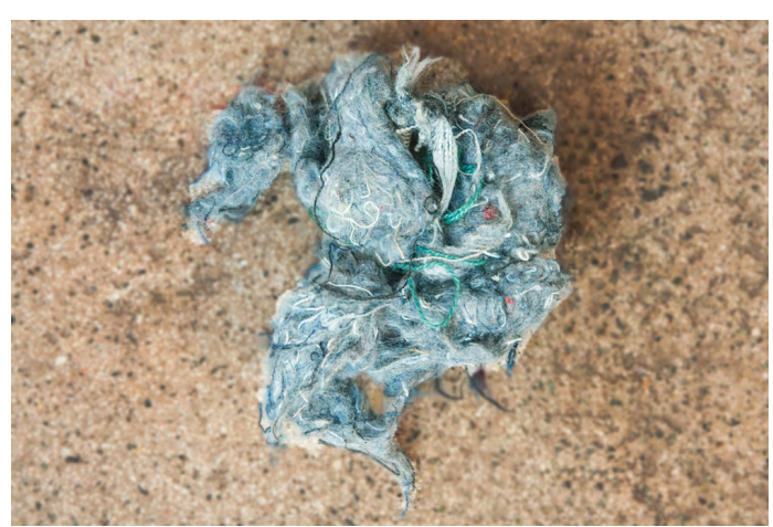
Cotton and threads are stuffed inside the stitched cloth to make the toys.