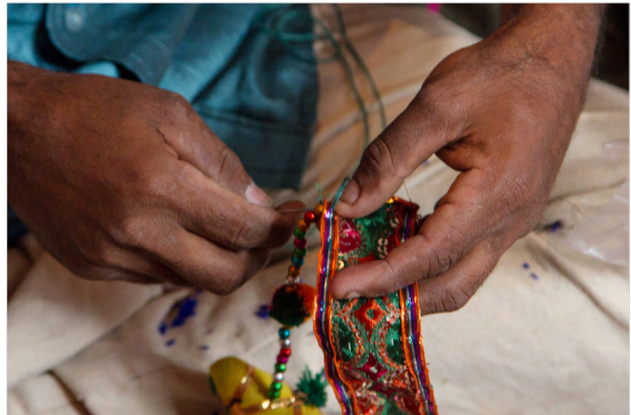
Excess of thread which was used during the time of stitching is been cut by scissor.