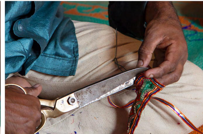
The excess of lace is being cut.