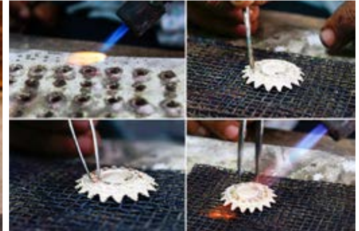
Intricate designs are being made on the silver pendent.