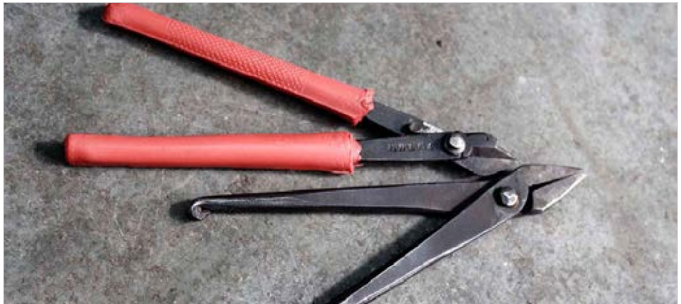
Metal sheet cutter is used to cut the metal sheet into required size and shape.