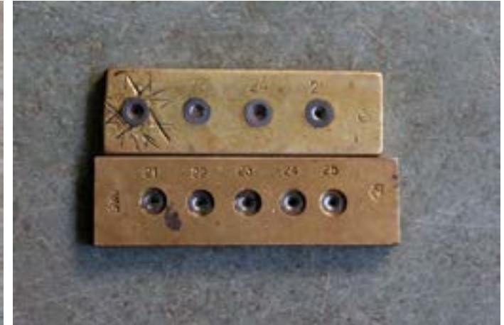
This is used to make a round shaped silver balls in varied sizes.