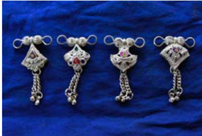
Ethnic silver accessories of Kutchi people which can be used as a pendant.