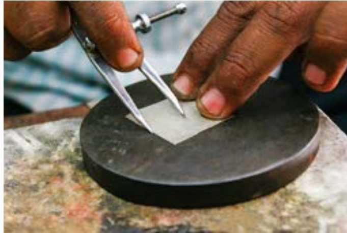
Compass is used to measure the Radius of the silver sheet.