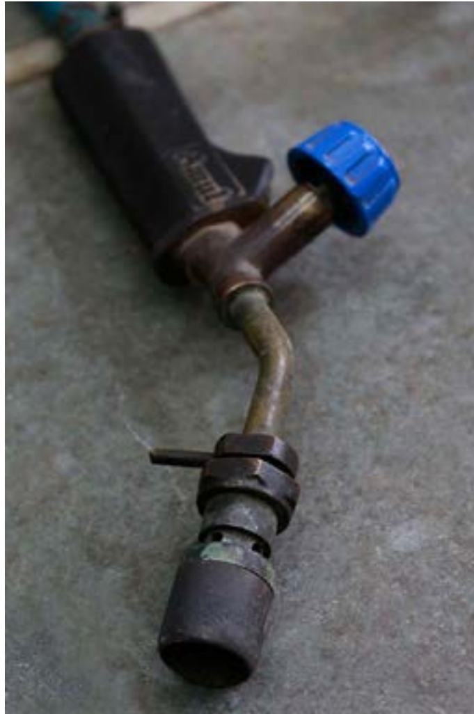
Gas burner used to heat the silver article.