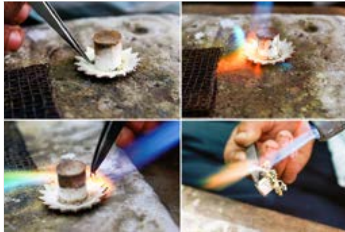
Small bells are attached to the back of pendent and soldered to the silver pendant.