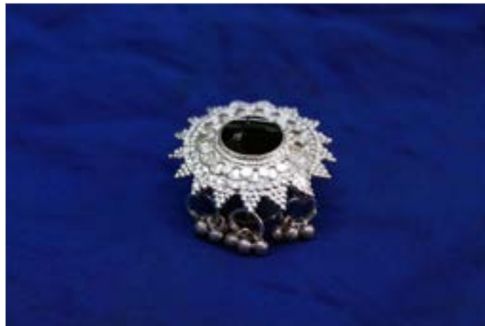
Intricately ornated Kutchi silver pendant.