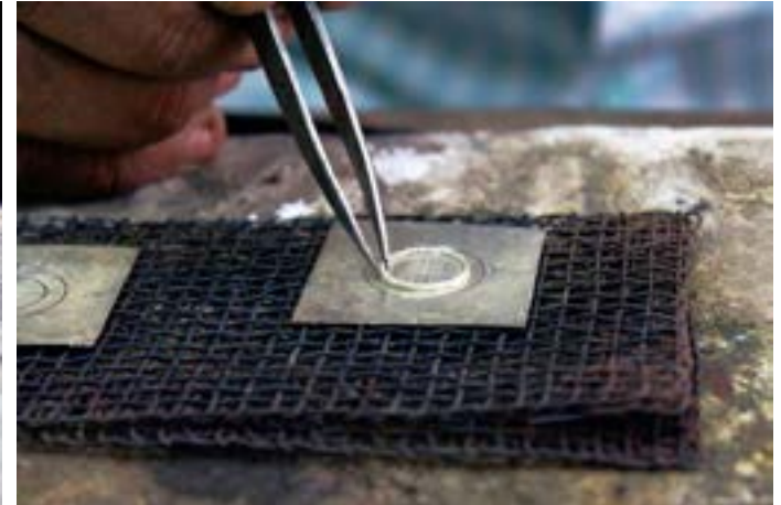
Round shaped silver ring is placed over the silver sheet by dipping the ring in a water-soluble flux paste and water.