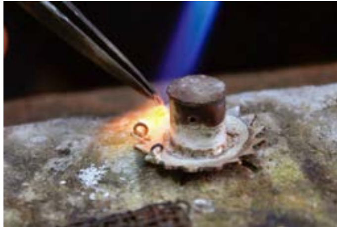
Small bells are added to the back side of the pendant and it is soldered.