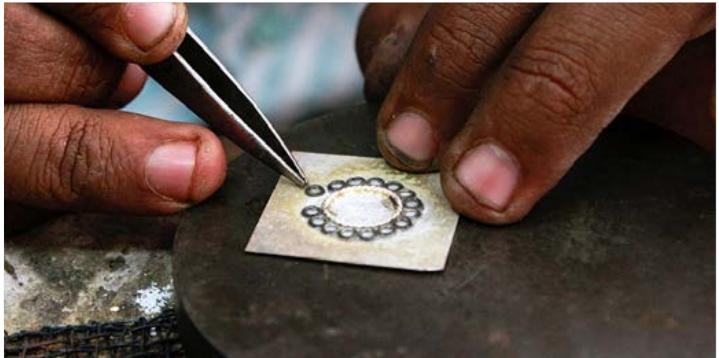
Tiny silver rings are arranged and fused using hand gas burner.