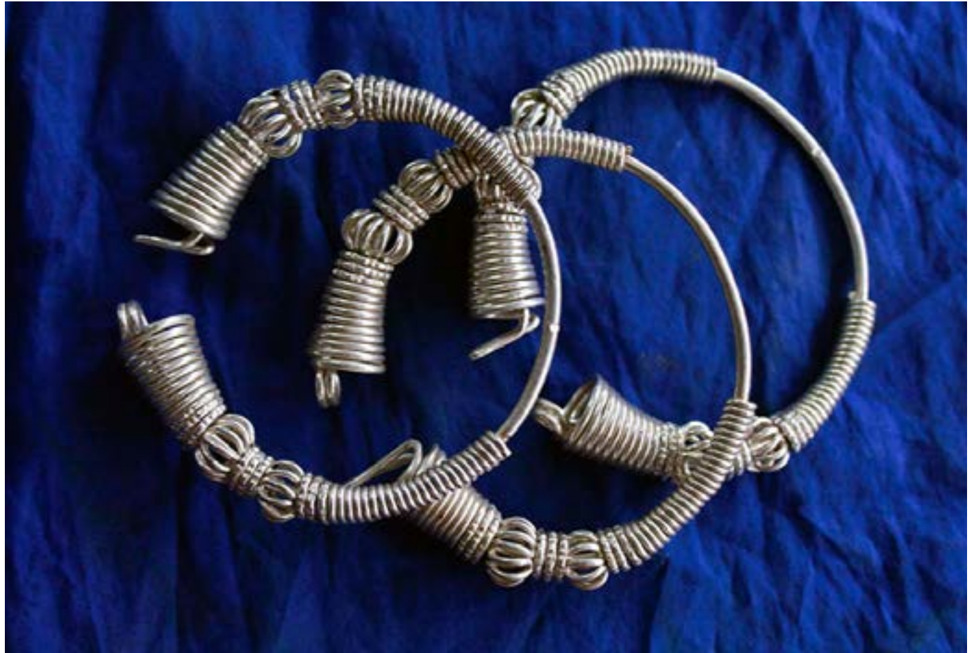
Accessory used by women of Banjara community.