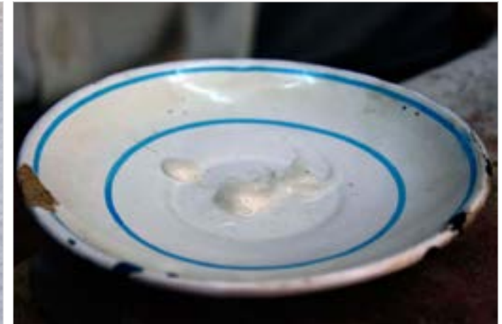
Water-soluble flux paste is used to solder the metal pieces.