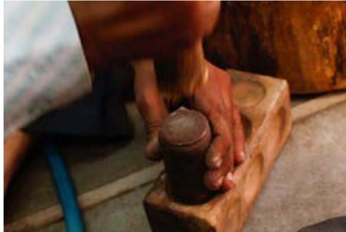
Article is being hammered to get a bulge shape.