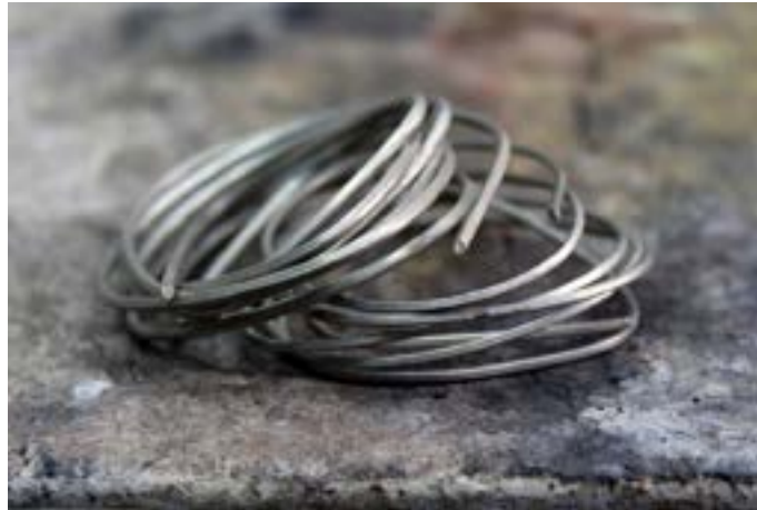
Silver wire for detailing the craft according to required design.