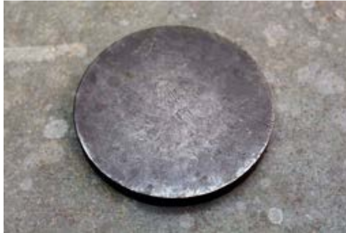
Flat solid iron surface is used while making silver jewelry.