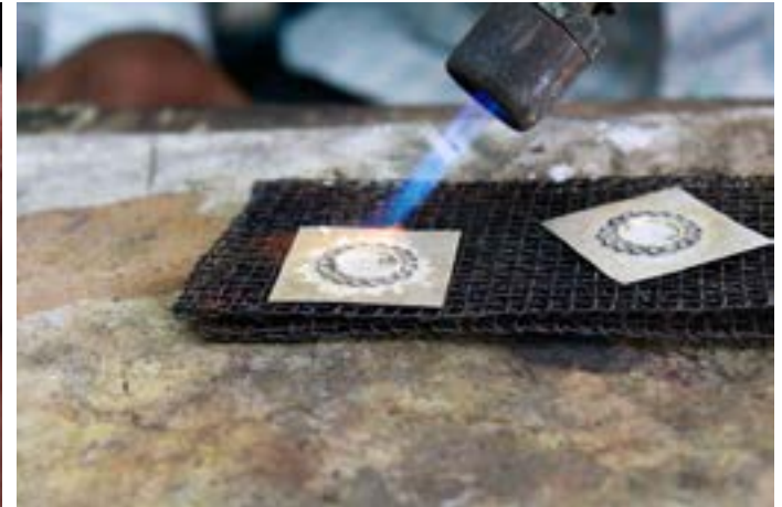
Silver sheet is being heated using gas burner.