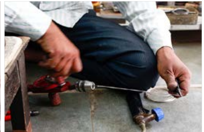
The silver wire is being bent to a round shape.