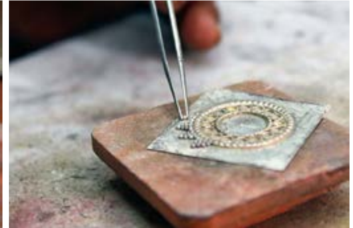
Tiny silver balls are immersed in solution and then arranged carefully in a circular form by glancing the real design.