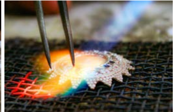
Silver article is being heated using gas burner.