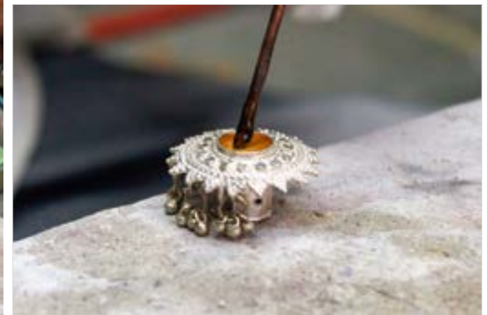
Centre area of the ring is being filled with bright yellow paint.