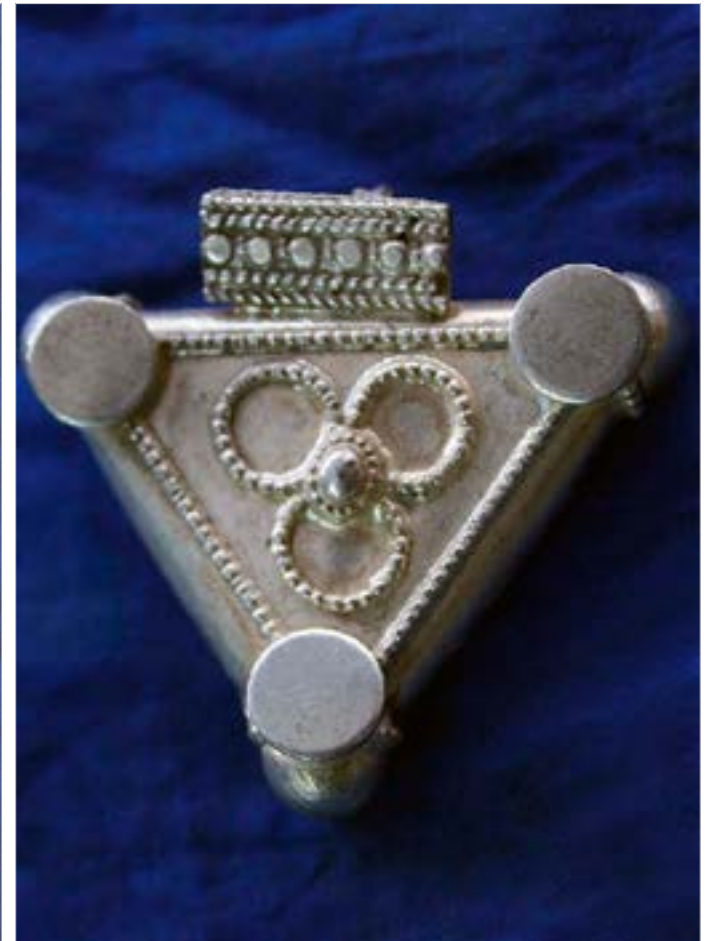
Traditional Kutchi silver pendant is an accessory for Kutchi people.