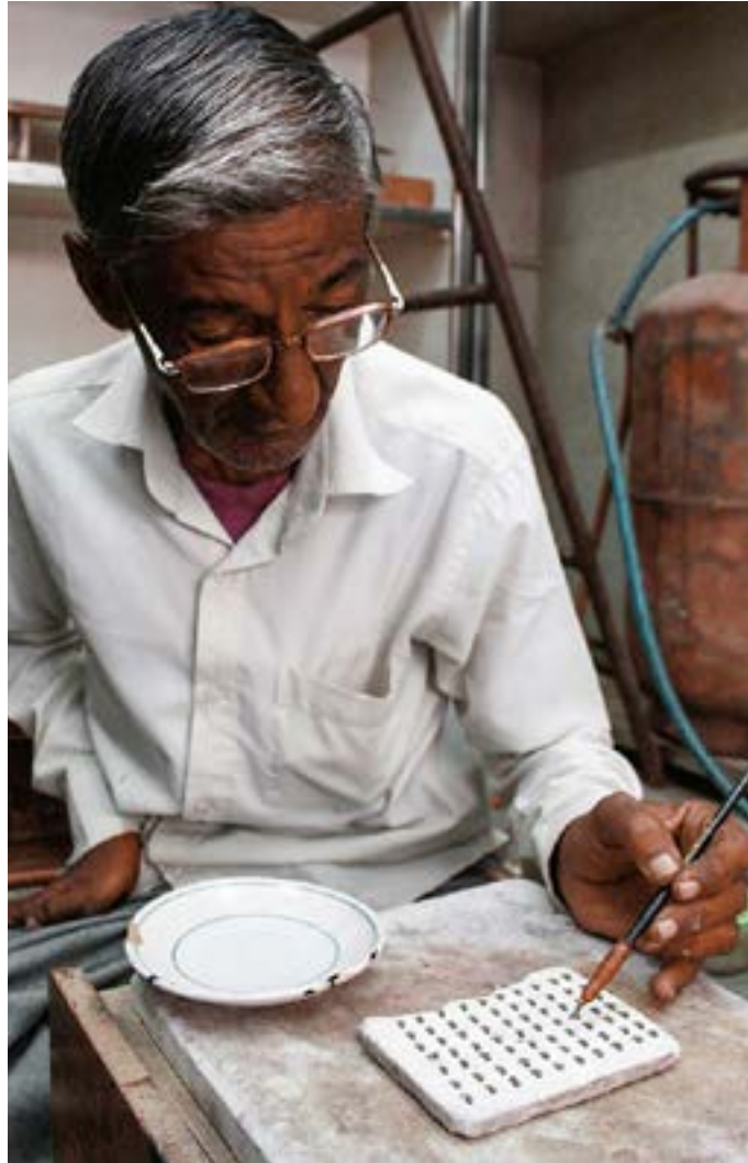
Artisan is involved in making tiny bells which will later be soldered to the pendant.