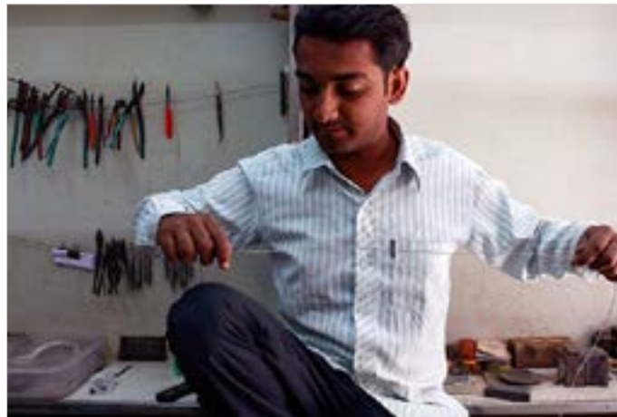
The silver wire is being cut and bent into required length.