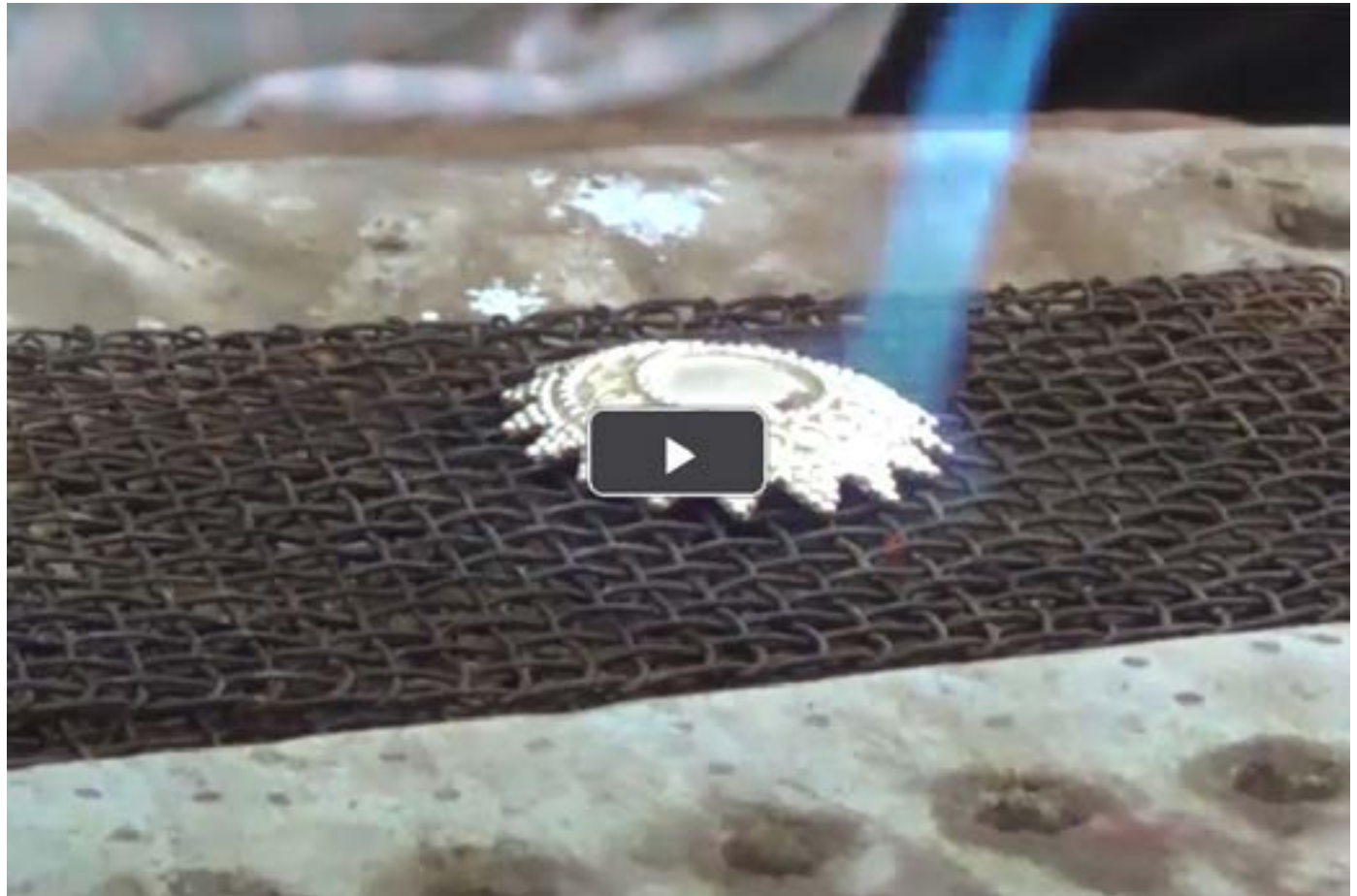
Traditional Silver Jewelry - Kutch, Gujarat