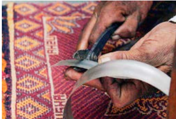
Silver sheet is cut into the required size and shape using a metal sheet cutter.