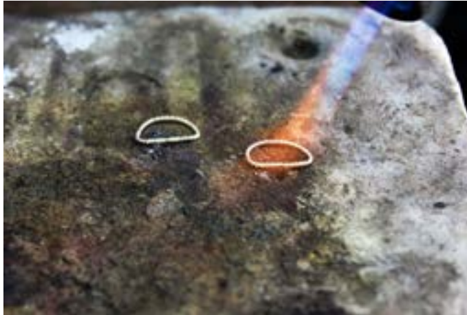
Silver ring is heated using hand gas burner.