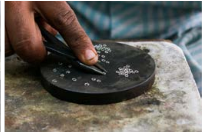
Tiny rings are used to make intricate designs over the pendent.