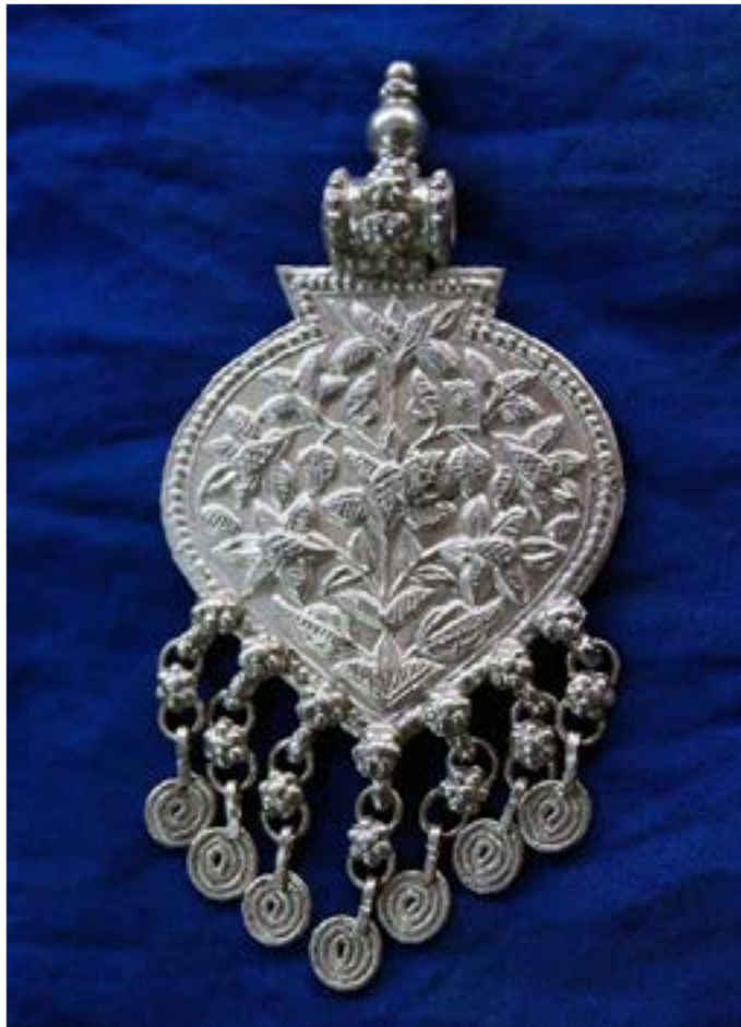
Tribal earring beautifully crafted are usually used by people of Gujarat as accessory.