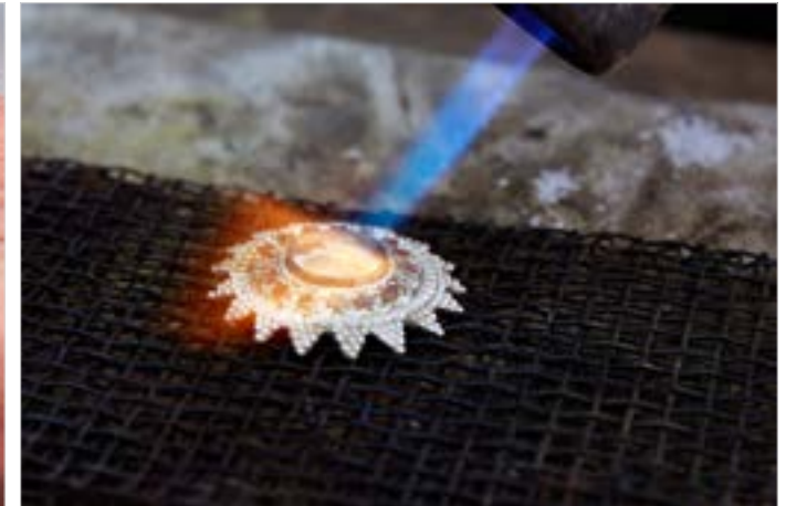
Flat round shaped silver wire is added at the center and fused with the article.