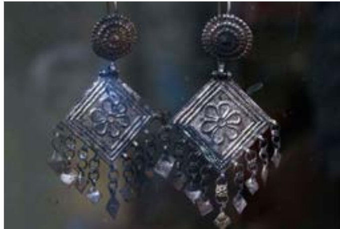
Kutchi silver earrings are generally used by kutchi women.