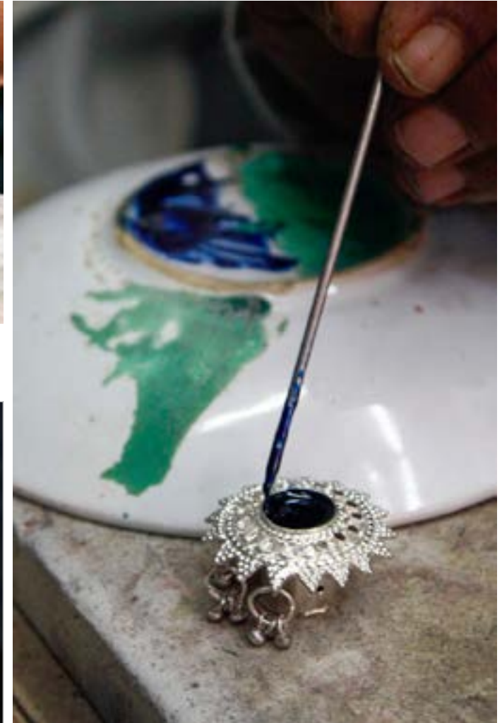
Centre area of the Kutchi silver pendant is highlighted with blue paint.