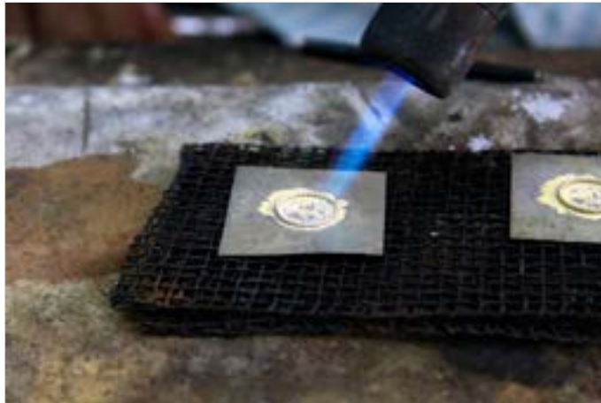
Silver ring is heated using burner so that the ring gets welded with the sheet.