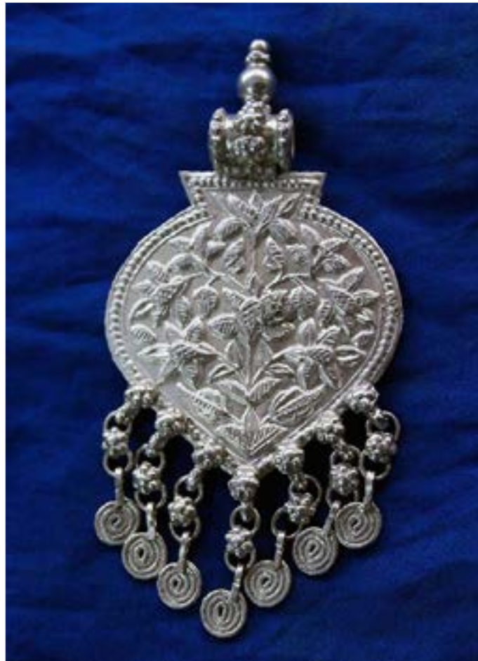
Tribal earring beautifully crafted are usually used by people of Gujarat as accessory.