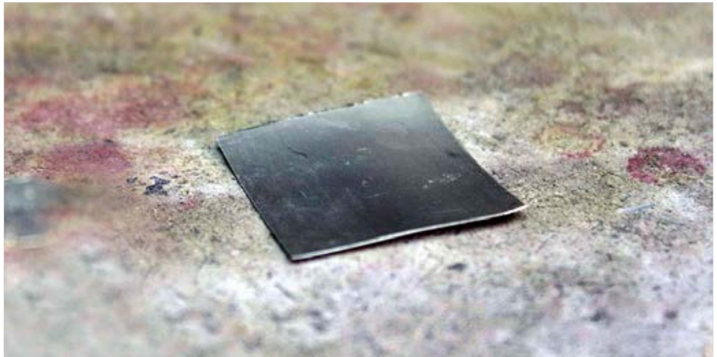
Silver sheet is the basic material used for traditional silver jewelry making.