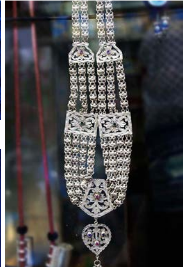
Traditional 3 layered silver neck piece used by women of Banjara community.