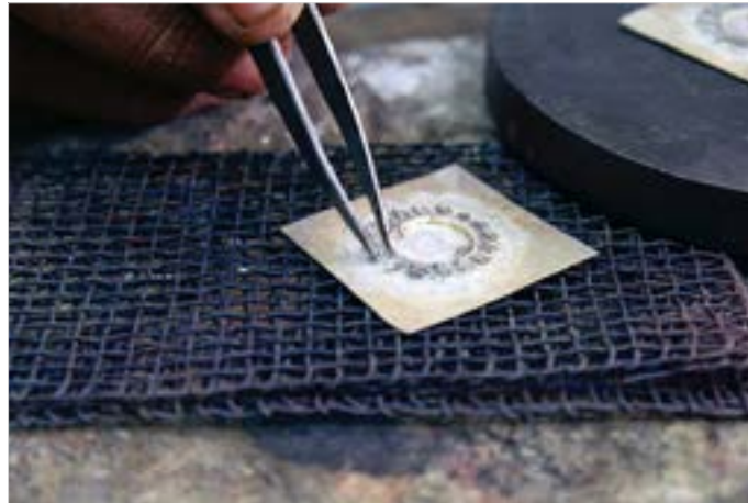
These tiny silver balls are immersed in solution and then arranged carefully in a circular form by glancing the real design.