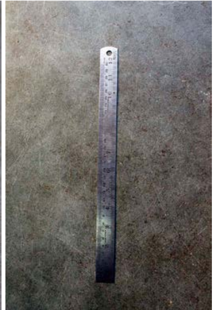
Scale is used for measuring the silver sheet.