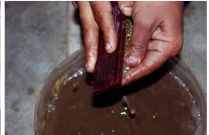
Silver pendent is being washed using Brush.