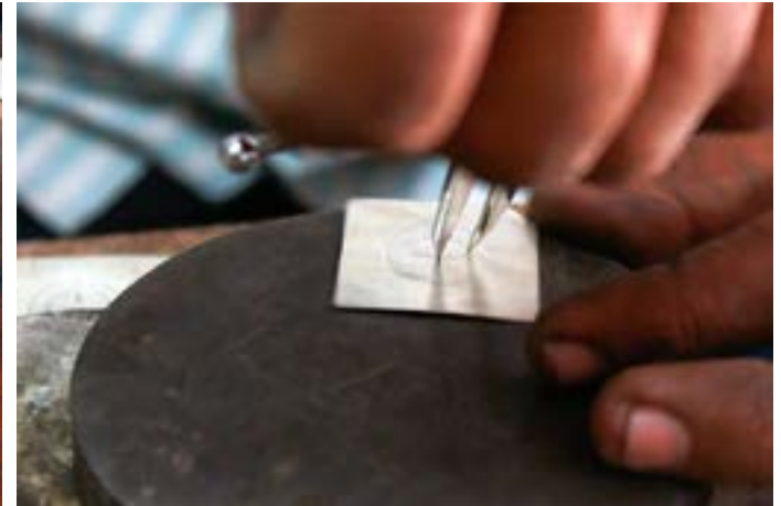
Silver pendant is being washed using Brush.