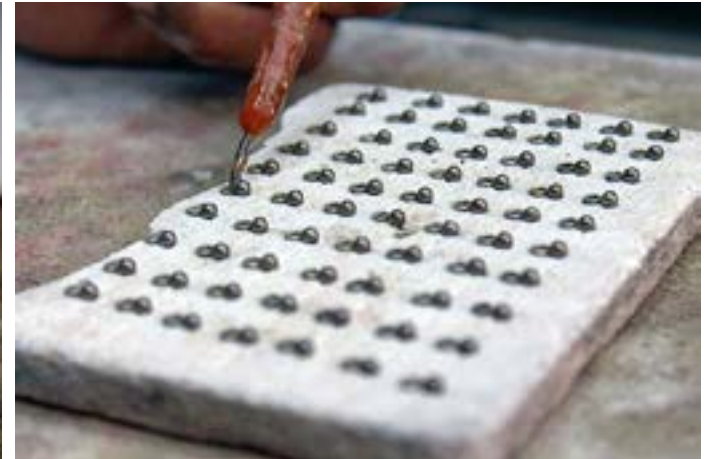
Small bells are being made.