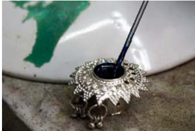
Centre area of the pendent is then filled with the blue color.