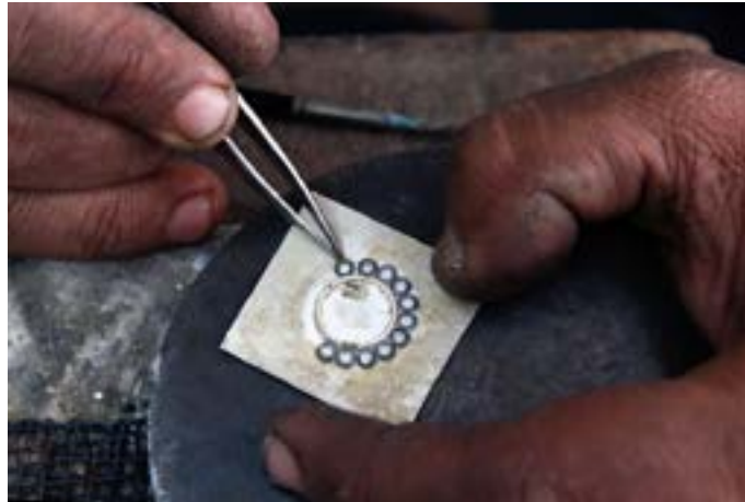
Small round shaped thin metal wires are arranged by following the actual design.