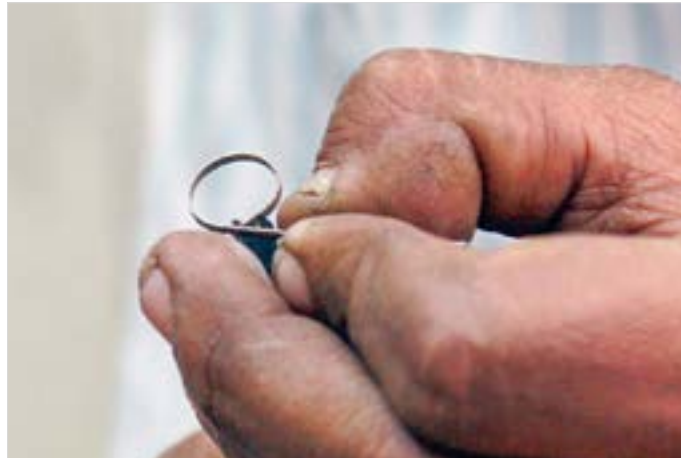
Round shaped silver wire is being made to add to the centre of the pendent.