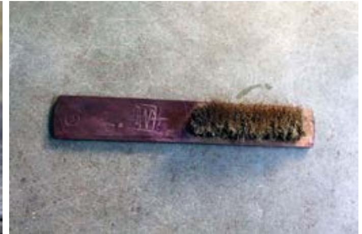
Brush is used to clean the silver article.