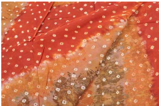
Figure 3. Most popular Bandhani dotted pattern of Rajasthan