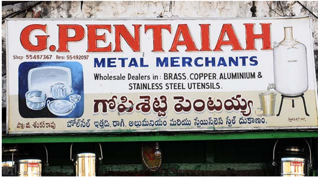
Figure 14. G.Pentaiiah Metal Merchant