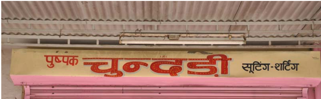
Figure.1 Pushpak Chhondhari Suiting-Shirting