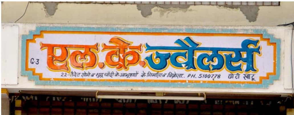
Figure 10. L.k. Jewelrs