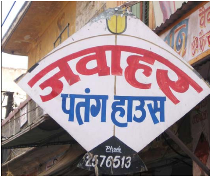
Figure 9. Jawahar Patang House