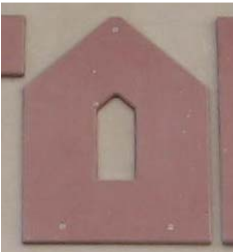
Figure 7. Absolute depiction of Kangooraa in letterform 'O'