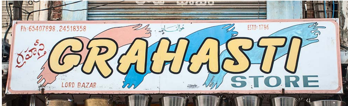
Figure 12. Grahasti Store