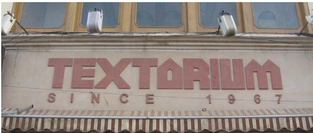
Figure 4. Textorium Since 1967