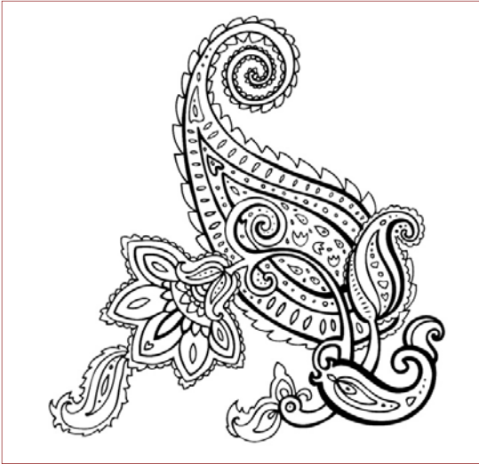
Figure 11. Paisley Motif