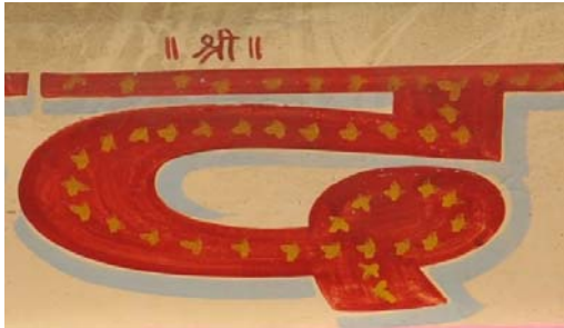
Figure 2. Dotted pattern of typical Bandhani of Rajasthan

India, traditional alizarin and alizarin-indigo cotton bandhani (tie-dye) garments are produced and distributed to rural populations. The producers of these garments belong to the Khatri community, traditional Hindu dyers and weavers of cotton and silk, while the garments are purchased and worn by Sindhi Muslims and the Hindu Khumbhar women.