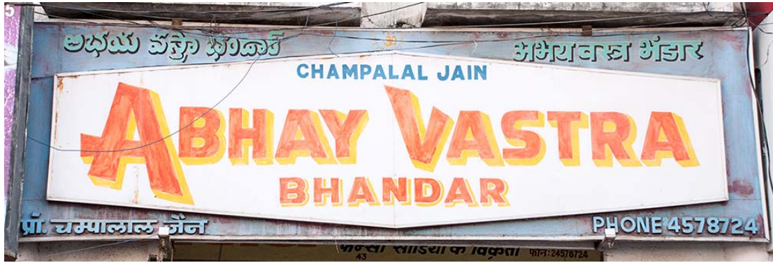
Figure 13. Abhay Vastra Bhandar