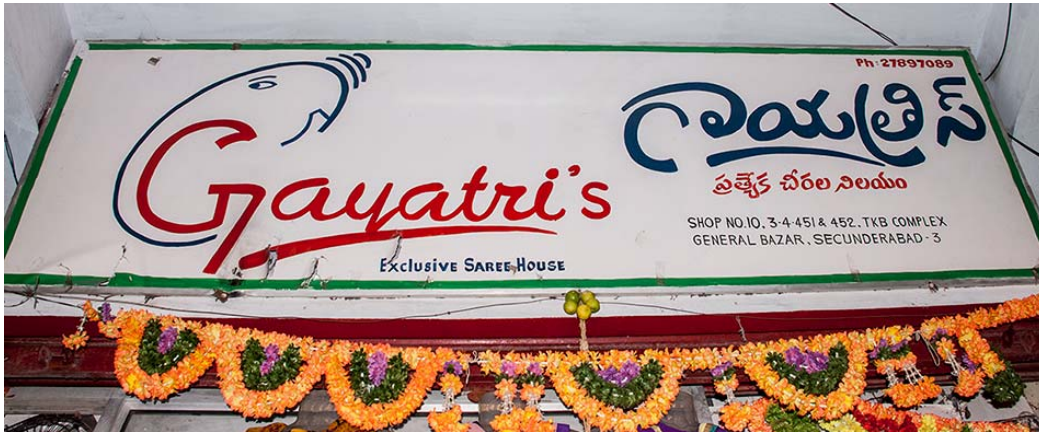
Figure 15. Gayatri's Exclusive Saree House