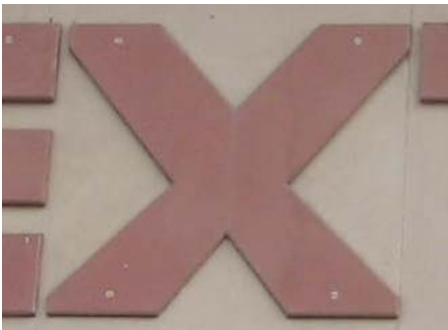
Figure 5. Scaling on the strokes of 'X'

The sharp cut edges of letterform portray the visual relationship with the marble stone slabs available and widely used across Jaipur. The even-gaps between the letterforms; and consideration of the mathematical centers for the letterforms - 'E' and 'X' represents the artist's naive approach. However, the consistency is maintained with the 'cut' treatment given to the letterforms. Unfortunately, it doesn't symbolize the 'goods' - textile material, available at the shop. The scaling of the inclined strokes of 'X' might be accidental. It is evident, as this sort of treatment is not done to other letterforms.