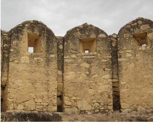
Figure 6. Kangooraas of Old Jaipur Fort walls