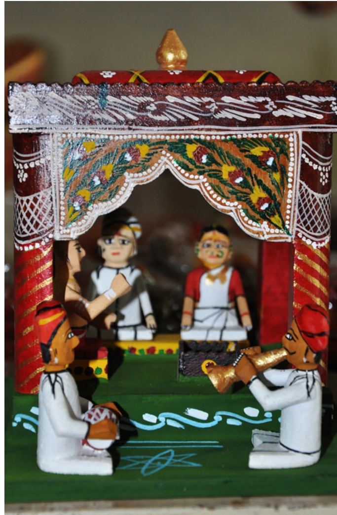
Charcoal is used as fuel to produce heat.