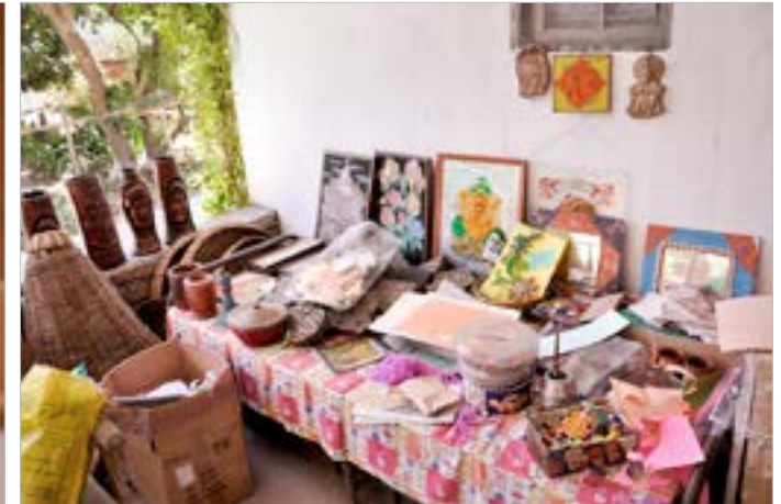
Artisan's working place at Sobha Singh Art Gallery.