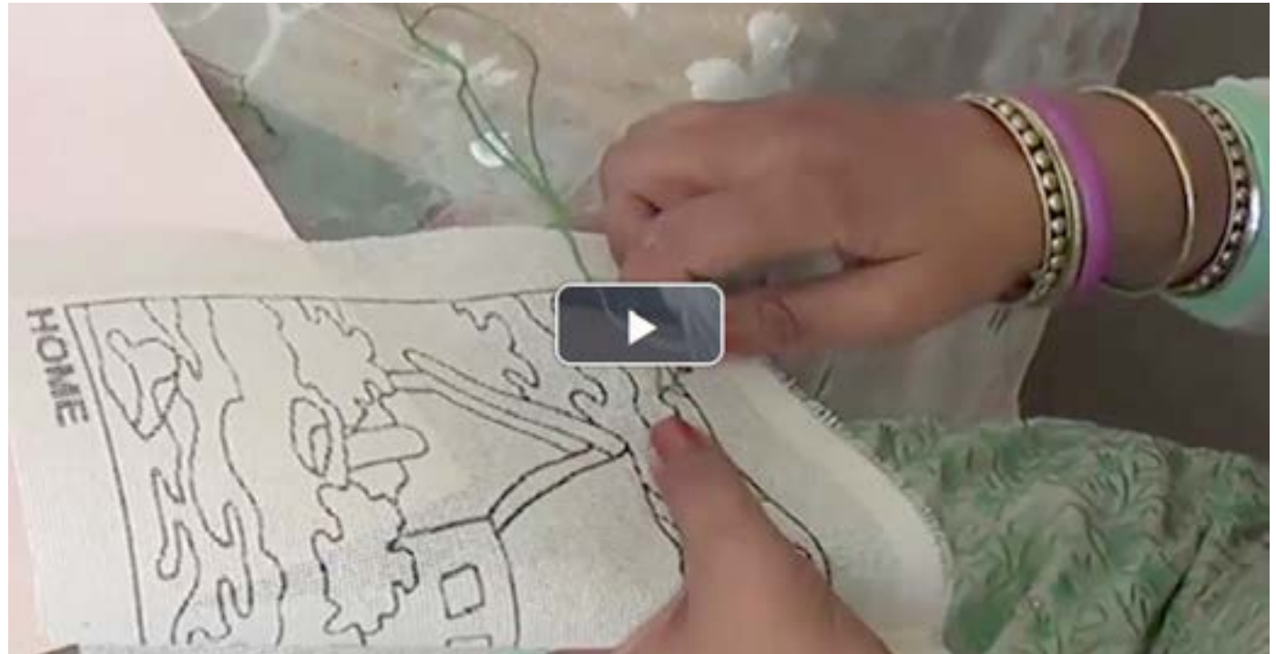
Woolen Thread Art - Andretta, Himachal Pradesh