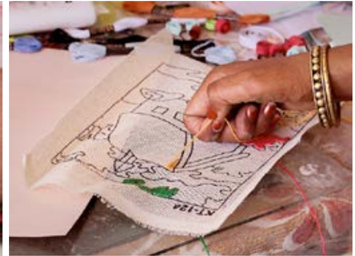
Artisan sewing the Sketched home roof with a yellow colour woolen thread.