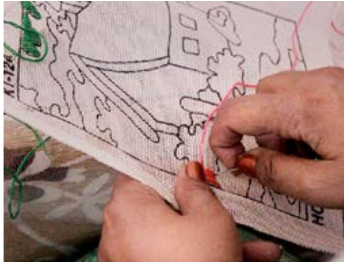
Artisan is using pink colour thread to sew on the sketched cloth.