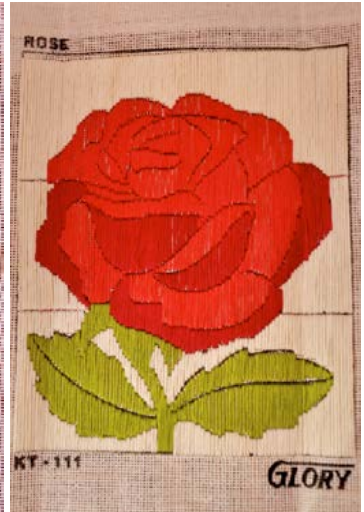
Rose woolen thread art.