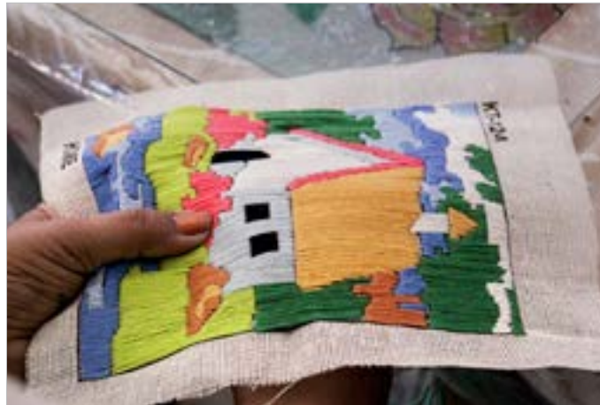
The artisan showing the woolen thread work.