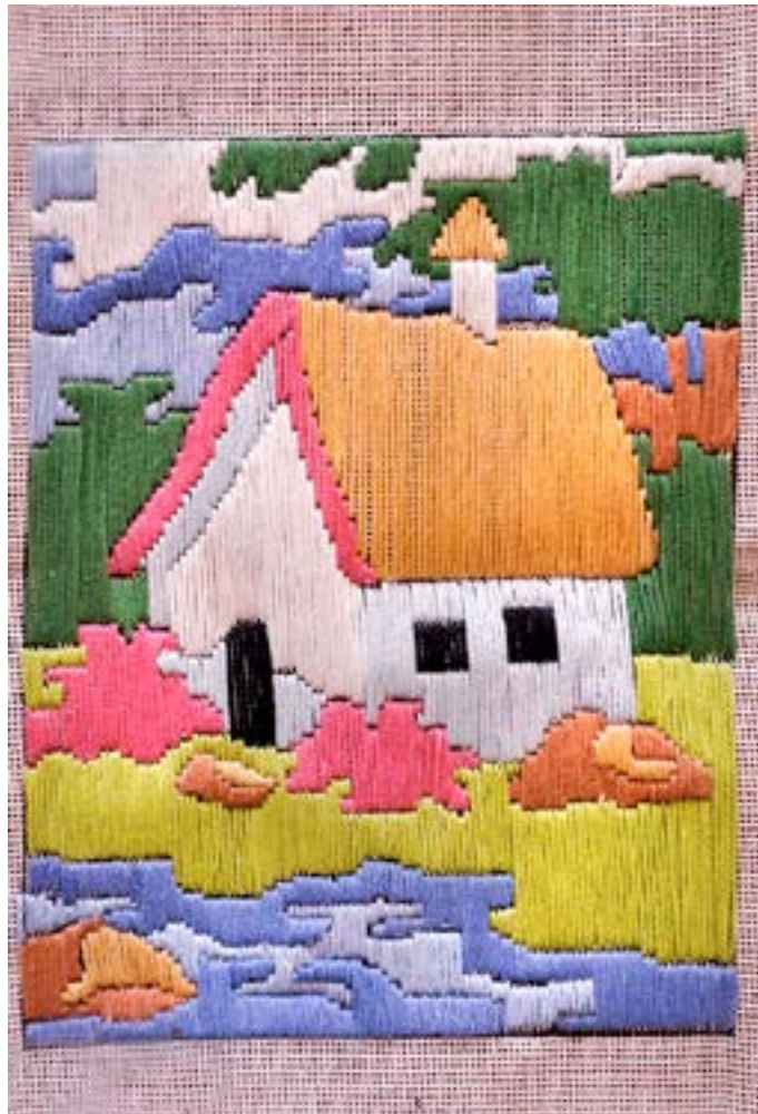
Home and nature woolen thread art.

Andretta woolen thread art is a refreshing form compared to other thread embroideries. This art form is comparatively less time-consuming and inexpensive to manage. It illustrates varied themes of landscapes, birds, animals, flowers, portraits, scenery, etc., in wall hangings, cloth embroideries, card making, and other decorative items. The products are usually available in 1x1 feet and are usually kept colourful for their decorative nature. Many admire this thread art for its durability and ability to enhance the beauty of the space where it is put up.